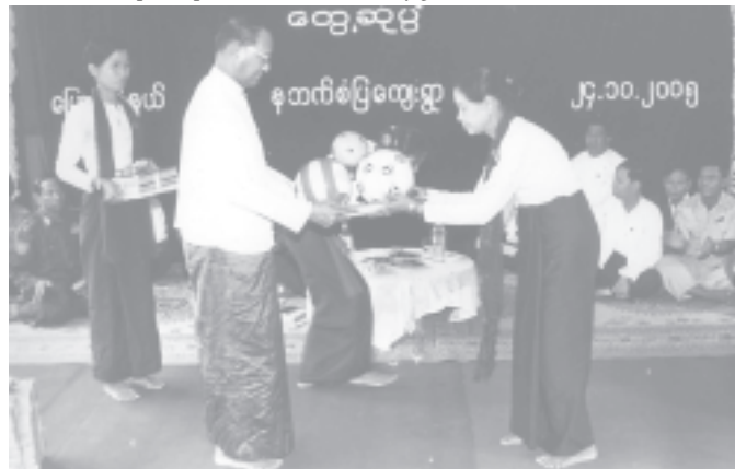
USDA CEC member Minister Brig-Gen Thura Aye Myint presents sports equipment to the headmistress of Nabet BEHS.— MNA