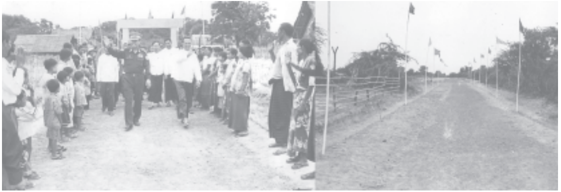
Commander Maj-Gen Tha Aye and Minister for Sports Brig-Gen Thura Aye Myint stroll on a village-to-village road in Myaung Township.

Two village elders gave an account of the