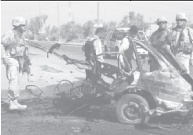
US soldiers and Iraqi policemen investigate at the scene of a car bomb explosion on 24 Oct, 2005, in Baghdad. A car bomb exploded as a US military convoy was passing in eastern Baghdad.

The search team is equipped with satellite phone and the government will send a helicopter to bring bodies down as soon as they hear from the search team, Neupane added. — MNA/Xinhua