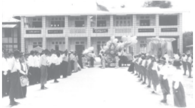
Sabei Phyu new school building of Basic Education Post-Primary School in Madaya Township, Mandalay Division.

Priority is being given to the education promotion programmes and special tasks across the nation. Please study the following education indicators to know more about the actual developments of the basic education sector: