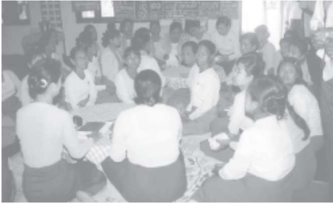
Personnel of Yangon Division WAO and MCWA give educative talks to members of township WAO and MCWA.