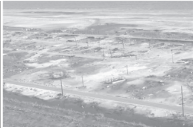
Nothing is left of Holly Beach, La, on Wednesday, 26 Oct, 2005, after the resort town was hit by Hurricane Rita. Members of the Louisiana Recovery Authority flew over Holly Beach as they visited communities hit by Hurricane Rita.