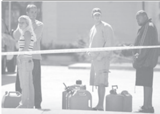
People wait in line to purchase gas after Hurricane Wilma hit in West Palm Beach, Florida on 26 October, 2005. —INTERNET

1208 (1008 GMT) with 80 passengers on board after receiving a bomb threat. —MNA/Reuters