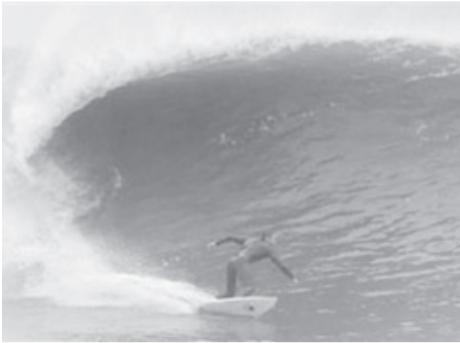
A surfer carves a bottom turn on a wave at a city beach in New York on Tuesday, 25 Oct 2005. Large waves pounded the northeast on Tuesday, as the remnants of Hurricane Wilma churned offshore.