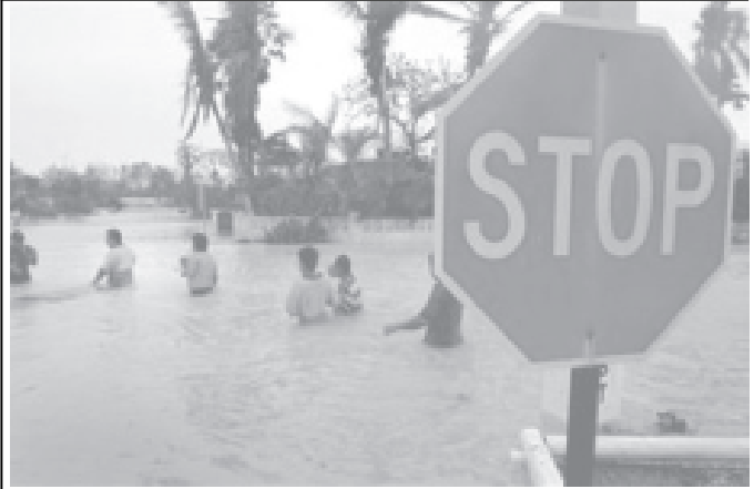
People cross a flooded street in Key West, after Hurricane Wilma hits Florida's southern west coast, on 24 Oct, 2005.—INTERNET