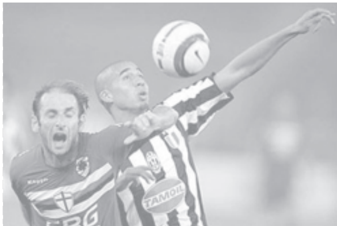
Juventus' forward David Trezeguet (R) fights for the ball with Sampdoria's defender Marcello Castellini during their serie A football match Juventus-Sampdoria at Delle Alpi stadium in Turin. Juve won 2-0.