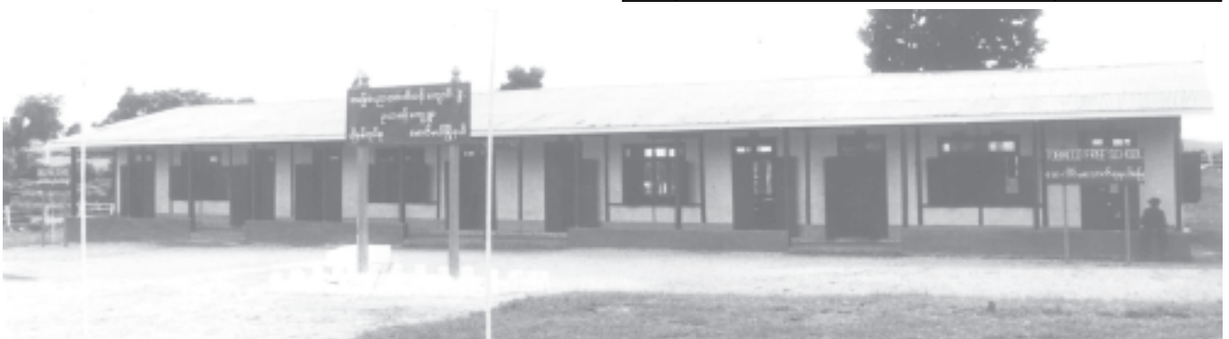
Basic Education High School (Branch) of Uyasan Village in Maukmai Township, Shan State (South).