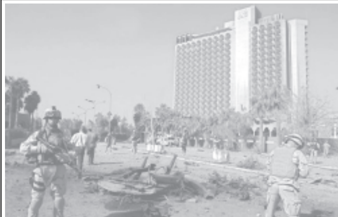
US soldiers secure the area in front of Palestine Hotel in Baghdad, on 25 Oct, 2005, a day after three suicide car bombs went off at the compound. At least 17 people were killed when triple car bomb blasts slammed heavily-protected hotels used by foreigners in the centre of the Iraqi capital. — INTERNET

Earlier, one of the peddlers had been arrested by Hong Kong police for peddling 600 grammes of white heroin and had returned to Nepal after spending five years in jail. — MNA/Xinhua