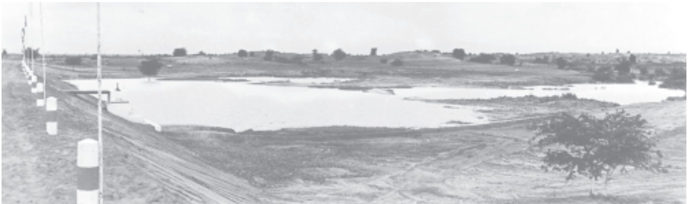
Kyauknaga Dam in Myaung Township, Sagaing Division.