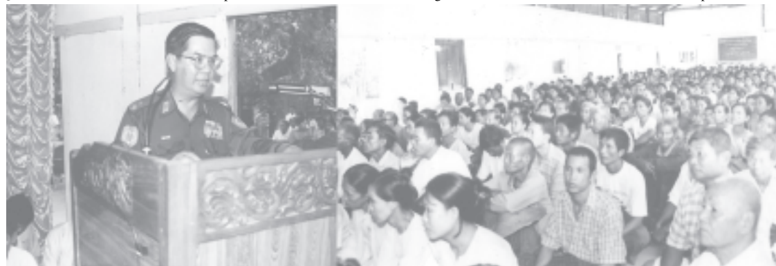
Commander Maj-Gen Tha Aye speaking at a meeting with local people at BEHS in Nabet Model Village of Myaung Township.— MNA

Effectively carrying out the five rural development tasks, Nabet Model Village is enjoying fruitful results of development in various sectors.— MNA