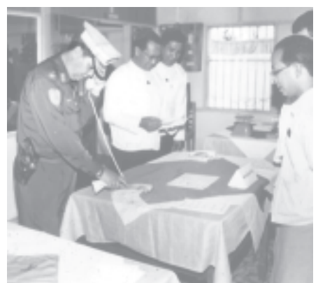
Commander Maj-Gen Tha Aye and Minister Brig-Gen Thura Aye Myint inspect rural auto exchange in the village, Budalin Township.

Heads of departments of Division WAO and mem-