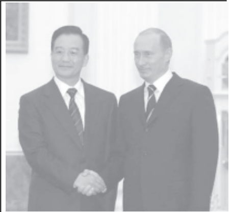
Chinese Premier Wen Jiabao (L) meets with Russian President Vladimir Putin in Moscow, capital of Russia, on 26 Oct, 2005. —INTERNET

Aprepitant has minimal side effects, he added, and is longer lasting than other currently used anti-vomiting drugs. —MNA/Reuters