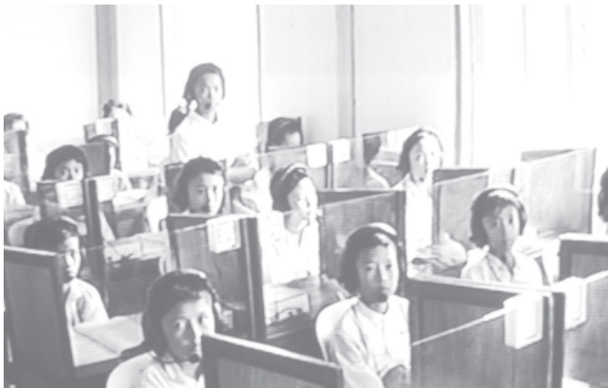
Students learning their lessons in the multi-media classroom in Kaya Village, Zathabyin Station in Hpa-an Township, Kayin State.