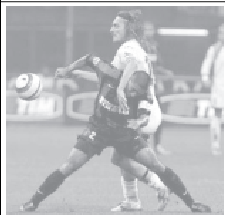
Inter Milan's Ivan Ramiro Cordoba (L) challenges Francesco Totti of AS Roma during their Serie A soccer match at the San Siro Stadium in Milan, on 26 October, 2005. AS Roma won the match 3-2.

Former Cameroon international Joseph-Desire Job was ineffective for the Saudi side, missing two good chances and eventually being replaced by Hamzah Idris in the 67th minute.