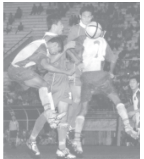
Myanmar and Indian footballers fighting for the ball in Grand Royal '05 Challenge Cup on 27-10-2005.