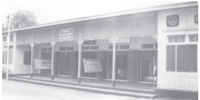
Manaung library being seen in Nabat Model village in Myaung Township.