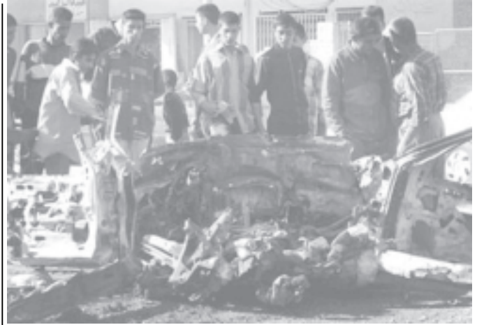
Local residents inspect the wreckage of a suicide bomber's car after an attack against an Iraqi police patrol in the northern Baghdad district of Al-Sha'ab on 24 Oct, 2005. —INTERNET

ing with HIV/AIDS in the Asia and Pacific Region. Some were infected at birth, others were through injecting drug or unsafe sex. In Thailand, 50-60 per cent of new infections each year are children and young people below 24. In Vietnam, 63 per cent of AIDS patients are under 30.—MNA/Xinhua