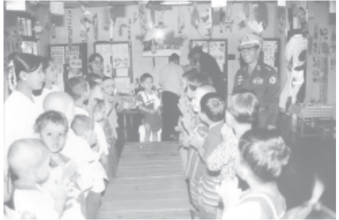
Yangon Command Commander Lt-Gen Myint Swe views skill demonstration of preprimary school children in Cocokyun Township.

Speaking on the occasion, the commander said that though Cocokyun Township is a most distant township from Yangon City, remarkable progress has been made in the township due to concerted efforts of the government and