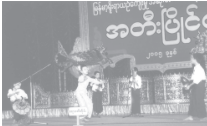
Muang Zin Myo Htet and party participate in basic education level (aged 10-15) boys' ozi contest.