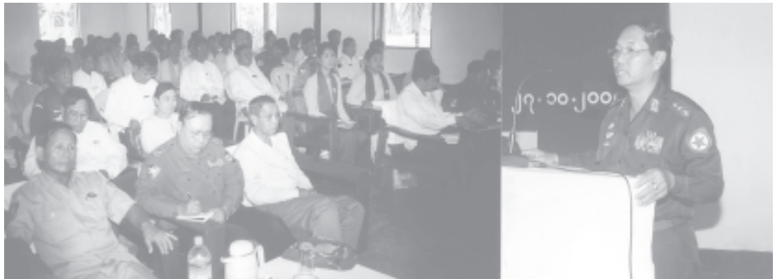
Yangon Command Commander Lt-Gen Myint Swe makes a speech at a meeting with departmental staff, social organizations and local people in Cocokyun Township.