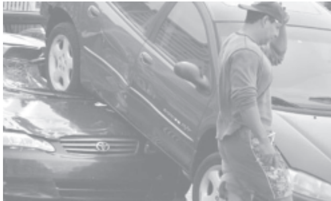
A man walks past cars piled upon each other by Hurricane Wilma in Sunny Isles, Florida on 24 October, 2005. Hurricane Wilma crashed ashore in southwest Florida and roared across the peninsula, pounding Miami, Fort Lauderdale and West Palm Beach on Monday after slamming Mexico's Yucatan Peninsula and killing 17 people in the Caribbean.

Kerry, the Democratic presidential nominee in 2004, is the highest-profile figure in either party to back a timetable for withdrawal in Iraq.