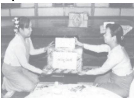
Sagaing Division MCWA Supervisory committee Chairperson donates K 50,000 and a set of tailoring machine for the village