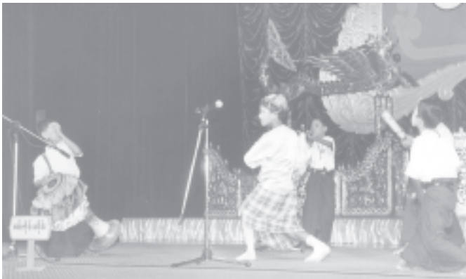
Sagaing Division troupe participates in the basic education level (aged 5-10) ozi contest.

At Padonma Theatre, four troupes participated in the basic education level (aged 5-10), and six in the basic education level (aged 10-15) boys' orchestra contest. Leader of the panel of judges U Sein Sten and party supervised the boys' orchestra contests. — MNA