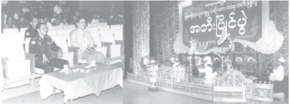
Commander Lt-Gen Myint Swe enjoys the basic education level (aged 10-15) boys' orchestra contest.—MNA

Present on the occasion were Member of the Panel of Patrons Chairman of the Leading Committee Chairman of Yangon Division Peace and Development Council Commander Lt-Gen Myint Swe, Member of the Panel of Patrons Minister for Culture Maj-Gen Kyi Aung, Vice-Chairman of the Leading Committee Deputy Minister for Culture Brig-Gen Soe Win Maung, Chairman of Work Committee Commander of No 3 Military Region Col Tint Hsan, members of Work Committee for Organizing the Competitions and Sub-committees, maestros,