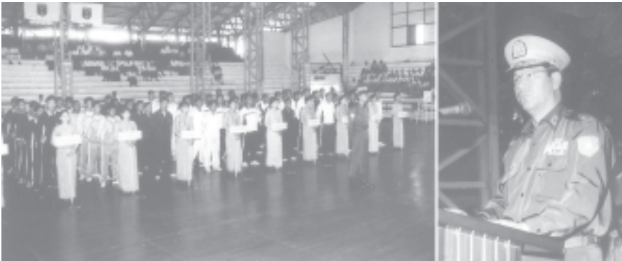
Minister Maj-Gen Hla Tun speaking at Ministry of Finance & Revenue Inter-Department Sepak Takraw Tourney.

YANGON, 26 Oct—The Ministry of Finance and Revenue launched its second Inter-Department Sepak Takraw Tournament at Aung San Gymnasium here this morning.