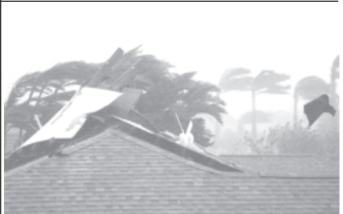
A roof is torn away by high winds during Hurricane Wilma in Boca Raton, Florida, on 24 Oct, 2005.