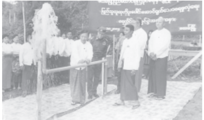
CEC member Brig-Gen Thura Aung Ko launches new water pipeline in Lonpi Village of Falam Township.— MNA

Next, the CEC member attended the opening ceremony of Haukpi hydro electric power plant.