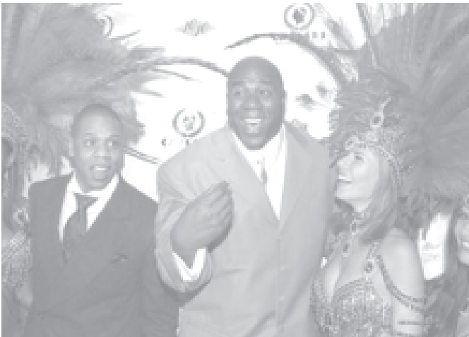
Entertainer Jay-Z, left, and Magic Johnson pose for a photo before entering the launch party for the 40/40 Club in Atlantic City, NJ on 25 Oct, 2005.