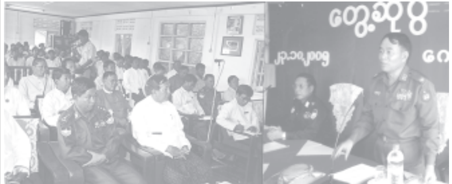
Minister Brig-Gen Maung Maung Thein explains implementation of development tasks at Kyaukka Village in Palaw Township.