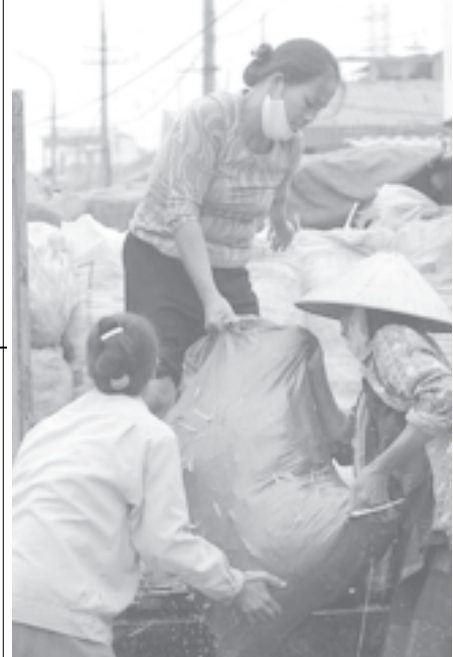
Vietnamese women load duck feathers onto a truck at a whole-sale poultry market in Hanoi, Vietnam, on 24 Oct, 2005.