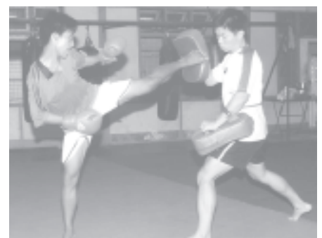
A Sanshou athlete under going training for XXIII SEA Games.