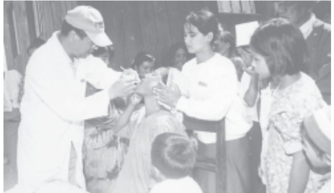
A specialist gives treatment to a patient in Haukpi Village of Tiddim Township.

Before laying new water pipeline, there are 23 springs in Falam but there is not enough water in the summer. The cost of the new water pipeline is K 920,000. Next, the CEC member arrived at Lonpi Sasana Pariyatti Sarthintaik and paid hom-