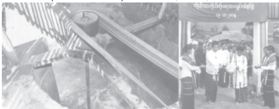
Tiddim Township USDA Secretary U Kham Swin Mon and townselder U Tel Khant Pong formally open self-reliant hydel power plant in Haukpi Village of Tiddim Township.