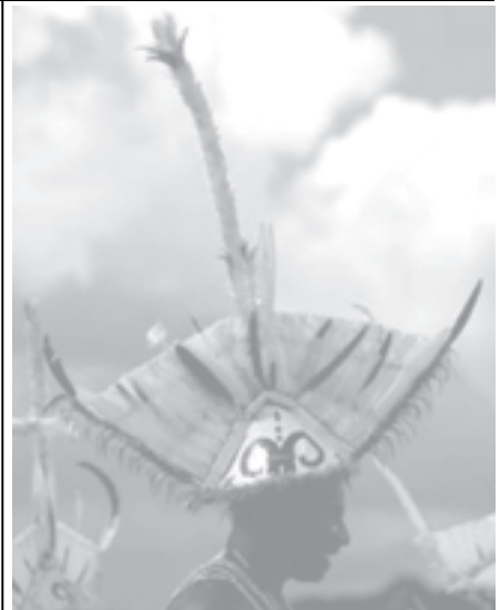
A Papua New Guinean dancer from the Morobe Province wears a head dress called a 'Kangar', made from bird's feathers, as a storm cloud gathers behind during a performance in the opening ceremony of South Pacific Forum in Port Moresby on 25 October, 2005. Leaders from 16 South Pacific nations will this week hold a summit in city, where murders and rapes have tripled this year, focusing on regional and local security. Pacific Forum members range from Australia to the tiny island state of Niue and cover over 30 million sq km (11.6 million sq miles) of ocean, with more than 1,000 languages.

Among the mysteries about Venus the mission hopes to solve is why a planet so similar to Earth in size, mass and composition has evolved so differently over the course of the last 4,600 million years.