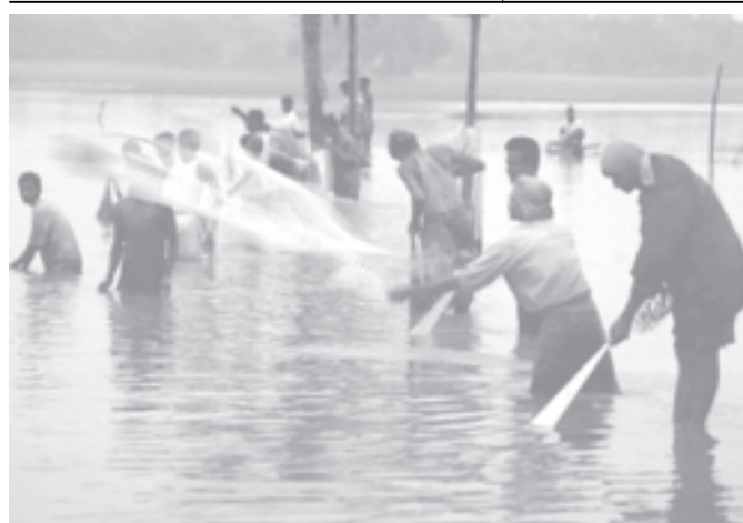
Villagers fish in floodwaters at Nachinda village, about 150 kilometres (94 miles) northwest of Kolkata, India, on 24 Oct, 2005.