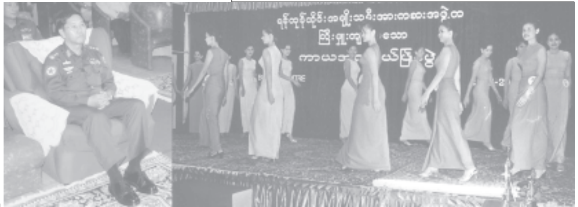
Commander Lt-Gen Myint Swe enjoys Inter-School beauty contest (novice division) and Yangon Division beauty contest.

The patron accepted K 2.1 million from wellwishers including (See page 11)