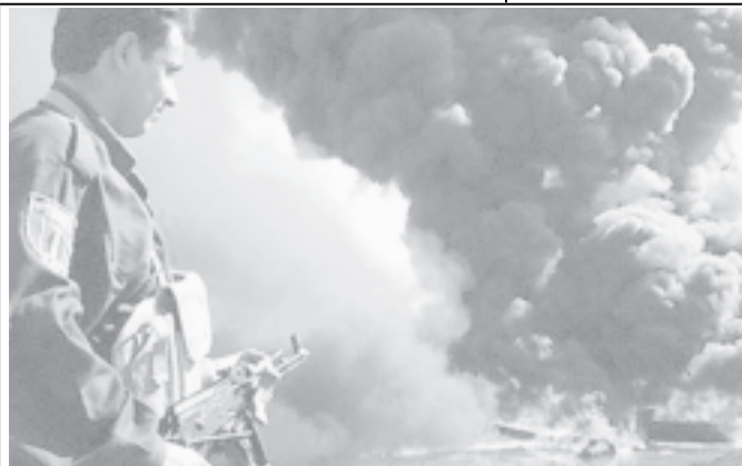
A member of the Iraqi Northern Oil Protection Force secures the site of burning oil pipelines in Tari al-Baghl area, 60 kms west of the city of Kirkuk, in northern Iraq, on 24 Oct, 2005.