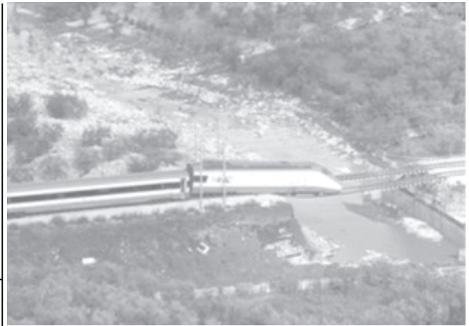
A Trenitalia Italian railway Eurostar is seen balancing on tracks after it derailed due to bad weather on 23 Oct, 2005, on the Bari-Taranto line between Acquaviva delle Fonti and Sannicandro, near Bari, southern Italy, leaving 30 people injured.

The Marines were assigned to the Regimental Combat Team 8, 2nd Marine Division, II Marine Expeditionary Force (Forward). According to the US military, the total US military death toll has raised to 1,999 since the beginning of the US-led Iraq War in March 2003.