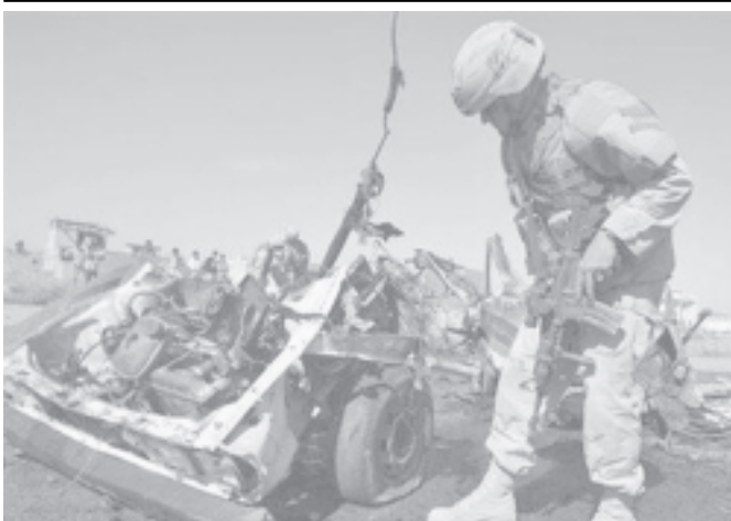
A US soldier inspects the wreckage of a car bomb after an attack against a US patrol in the eastern Baghdad district of Al-Baladeat on 24 Oct, 2005.