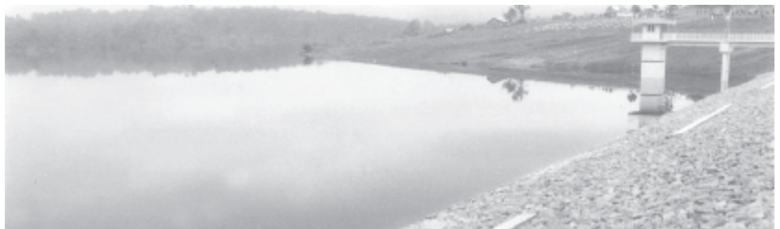
Wanpon Dam in Namsang, Loilem District, Shan State (South).

land increased from 23.8 million acres in 1988 to 43.1 million acres in 2005. Local farmers will be able to increase agricultural land up to 1,750 acres using the Wanpon Dam's irrigation water. The dam will supply not only irrigation water but also drinking water to the region. The dam will result in the region's agro-industry boom and the improvement of living standards of the residents, he