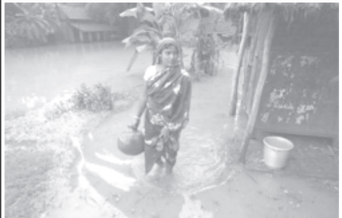
A woman walks through floodwaters to fetch drinking water at Nachinda Village, about 150 kilometres (94 miles) northwest of Kolkata, India, on 24 Oct, 2005.