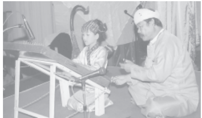
A contestant representing Shan State takes part in the basic education level (aged 5-10) Donmin contest.