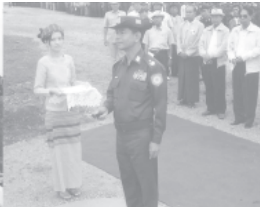
Commander Maj-Gen Ye Myint unveils the stone inscriptions of Wanpon Dam.

Emergence of the State Constitution is the duty of all citizens of Myanmar Naing-Ngan.