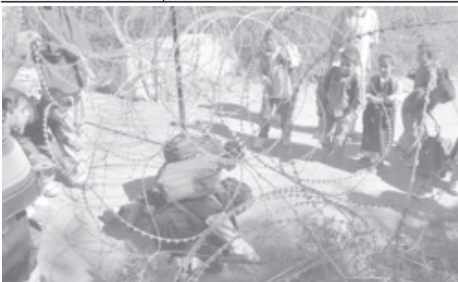
Iraqi children crawl under barbed wire left behind by US troops used as checkpoint on the outskirts of Ramadi, Iraq, on 24 Oct, 2005. —INTERNET

The country, which attracted FDI of more than 2.6 billion dollars in the first 9 months of this year, is likely to entice 5 billion dollars in the whole year, much bigger than its initial target of 4.2-4.5 billion dollars, according to the Ministry of Planning and Investment on Monday. —MNA/Xinhua