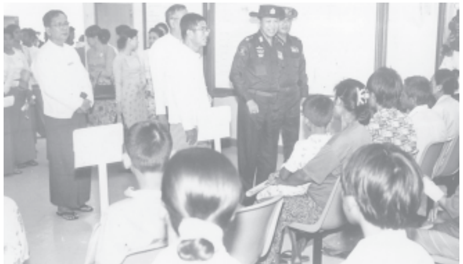
Lt-Gen Khin Maung Than comforts patients undergoing treatment in Myanmar Nonyu Farmers' Hospital in Hsamalauk Village in Nyaungdon Township.

Headmaster U Kyaw Tun and Chairman of SBT U Soe Tint opened the ceremony. Lt-Gen Khin Maung Than unveiled the signboard of the multimedia classrooms of the school and inspected the