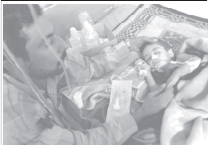
A man comforts a wounded Iraqi infant in a Samarra hospital, Iraq, following a mortar attack on 19 Oct, 2005.—INTERNET

One of them grabbed the purse held by the elderly woman who was waiting to be served, then handed it back after her pleading and rushed out to a waiting motorcycle. — MNA/Reuters