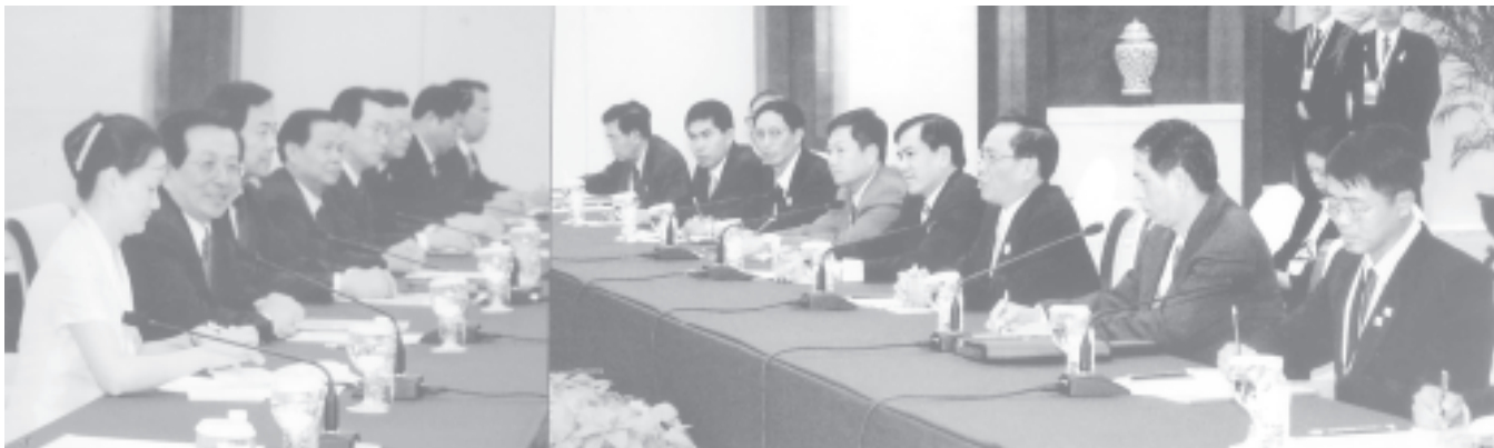
Prime Minister General Soe Win discusses mutual interests between Myanmar and China with Vice President of PRC Mr Zeng Qinghong in Nanning, PRC.

YANGON, 20 Oct — Prime Minister General Soe Win of the Union of Myanmar called on Vice-President Mr Zeng Qinghong of the People's Republic of China at the Conference Hall of Nanning International Conference Centre in Nanning, Guangxi Zhuang Autonomous Region, China, at 3 pm on 18 October.