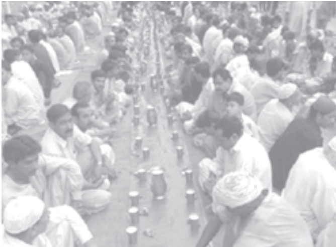
Thousands of people queue each night at charity kitchens on 20 Oct, 2005 in Pakistan for a bowl of rice after this month's earthquake.