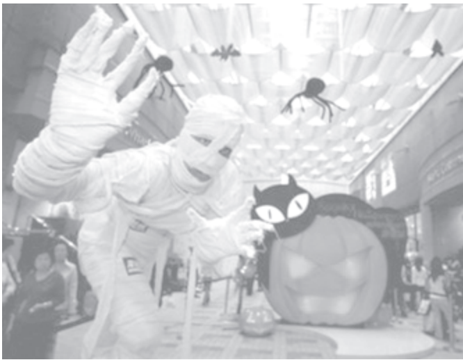
A man dressed as a mummy poses near a pumpkin display as part of the Halloween decorations outside a Hong Kong shopping mall on 19 Oct, 2005.