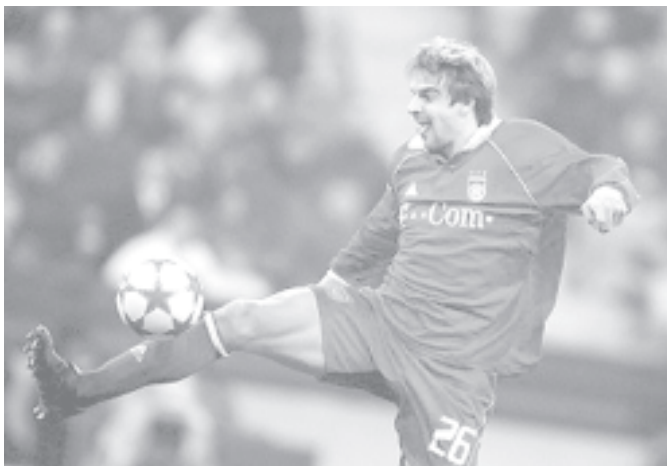
Bayern Munich midfielder Sebastian Deisler controls the ball during their Champions League match against Juventus. Bayern Munich were brimming with confidence after defeating Juventus 2-1 in the Champions League Group A match and believe they can repeat their 2001 triumph.