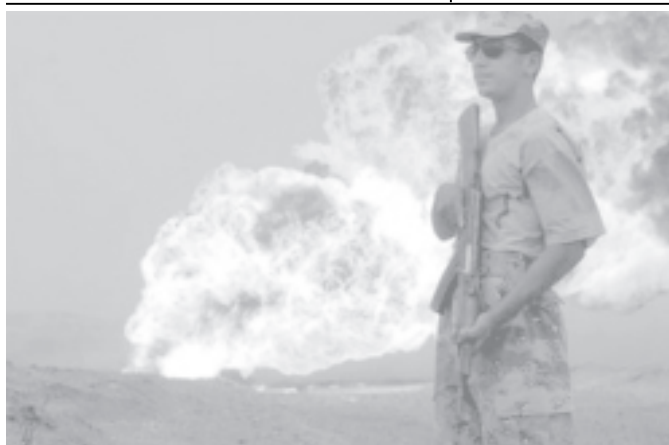
An Iraqi soldier guards a burning oil pipeline near Samarra, Iraq, after it was attacked by gunmen on 19 Oct, 2005.