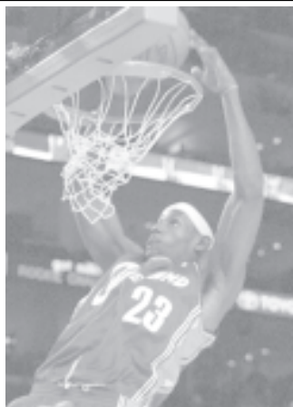
LeBron James, shown in a file picture, scored nine of his 26 points in the last 2 1/2 minutes to lead Cleveland to an 88-84 National Basketball Association preseason win over Memphis and said he's still not 100 percent.