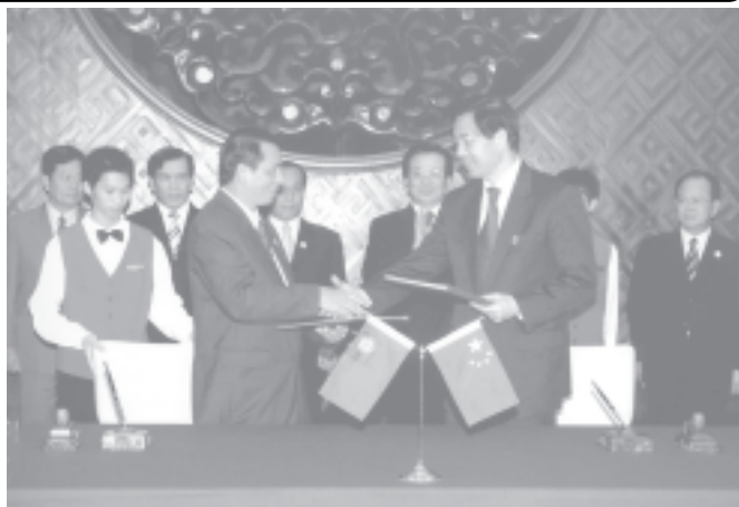
Minister for National Planning and Economic Development U Soe Tha and Chinese Minister for Commerce Mr Bo Xilai exchange notes of the agreement.