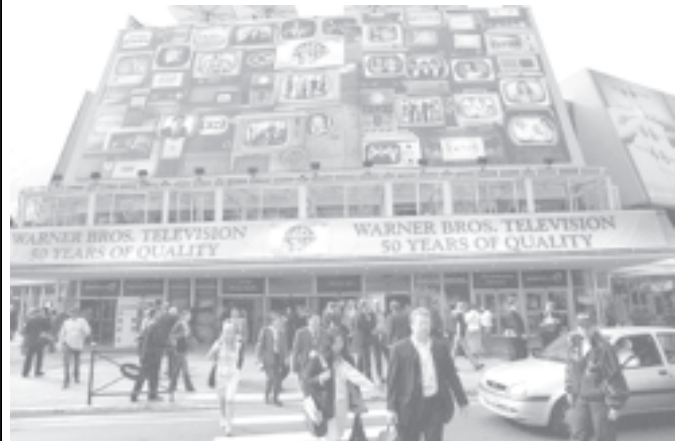
People leave the Palais des Festivals in Cannes, southern France. TV on mobile phones may be tiny today in terms of screen size and programme choice but it looks certain to grow rapidly in the coming years.— INTERNET

"We cannot allow criminals to endanger the lives of people, punish the country and make it notorious for what it should not be," he said.— MNA/Reuters