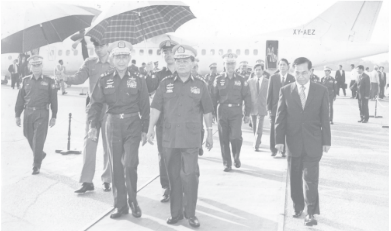
Senior General Than Shwe welcomes back Prime Minister General Soe Win who participated in the 2nd China-ASEAN Expo and the 2nd China-ASEAN Business & Investment Summit.

Vice-Senior General Maung Aye, Member of the State Peace and Development Council General Thura Shwe Mann of the Ministry of Defence, Secretary-1 of the State Peace and Development Council Adjutant-General Lt-Gen Thein Sein, Members of the State Peace and Development Council, the Commander-in-Chief (Navy), (See page 8)