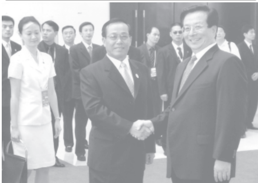
Prime Minister General Soe Win shakes hands with Chinese Vice-President Mr Zeng Qinghong in Nanning.

Myanmar is implementing the political, economic and social objectives and is in the process of realizing the seven-point Road Map for achieving the political goal.