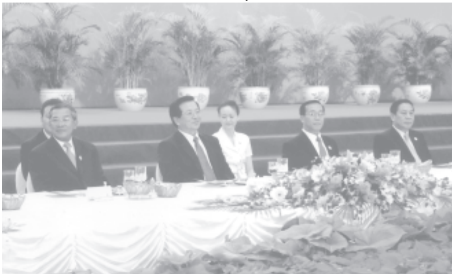
Prime Minister General Soe Win attends a banquet to mark 2nd China-ASEAN Expo, and China-ASEAN Business and Investment Summit.