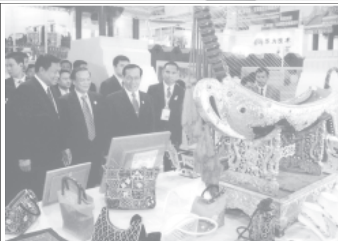
Prime Minister General Soe Win views Myanmar booths on display at 2nd China-ASEAN Expo.