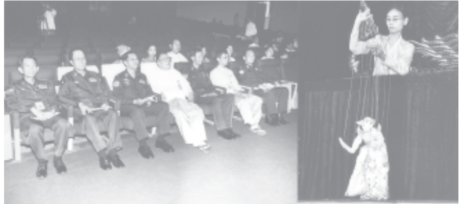
Commander Lt-Gen Myint Swe and party view Performance of a contestant in professional level marionette contest.

Altogether 14 contestants from States and Divisions took part in the professional level men's religious song contest, and 16 persons in the basic education level