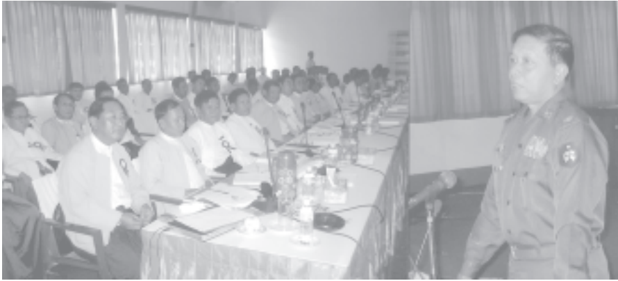
Minister Brig-Gen Ohn Myint addresses the coordination meeting of Ministry of Mines.—MINES

YANGON, 20 Oct — Minister for Mines Brig-Gen Ohn Myint delivered an address at the meeting to review accomplishment of the Ministry of Mines and to coordinate measures for exceeding the target at Thiri Yadana Hall of the ministry this morning.