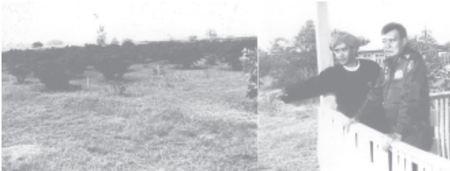
Lt-Gen Kyaw Win views plantation of perennial crops in Padamya Naga Agricultural Camp in Hsihseng Township.