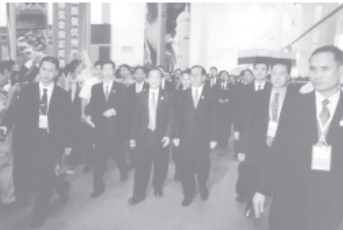
Prime Minister General Soe Win views booths of 2nd China-ASEAN Expo.