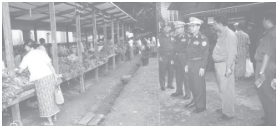
Lt-Gen Myint Swe inspects the sales at tax-free markets in Dagon Township. — MNA

Moreover, private shops are also kept open at the markets, and foodstuff and kitchen utensils are also available there. — MNA