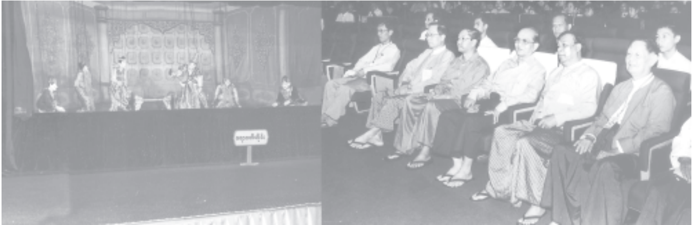
Secretary-1 Lt-Gen Theirn Sein and party enjoy competition of Ayeya Hline marionette troupe in the Minkutha marionette drama contest.

YANGON, 20 Oct — Marionette Contest of the 13th Myanmar Traditional Cultural Performing Arts Competitions was launched this evening at National Theatre in Dagon Township and Patron of the Leading Committee for holding the 13th Performing Arts Competitions Secretary-1 of the State Peace and Development Council Lt-Gen Theirn Sein enjoyed the contest.