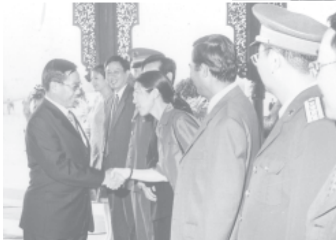
Prime Minister General Soe Win being welcomed back at Yangon International Airport by Charge d'Affaires ai of Chinese Embassy Mr Yu Boren and embassy staff.