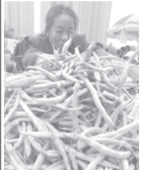
A Chinese vegetable vendor prepares her produce at an open market in Beijing on 20 October, 2005.