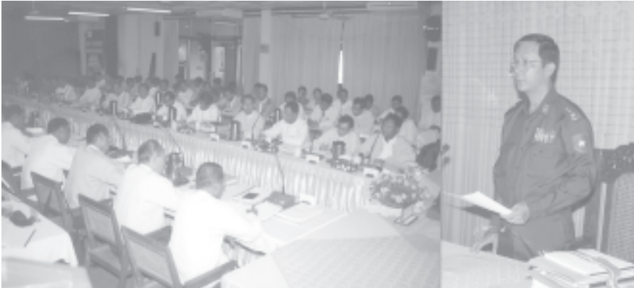
Minister Col Zaw Min addresses coordination meeting of Ministry of Cooperatives.