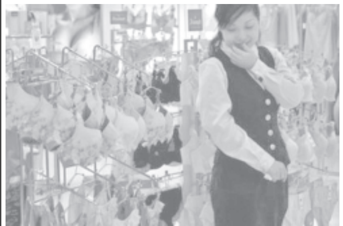
A Chinese seller waits for customers in a lingerie shop in Shanghai on 20 October, 2005.