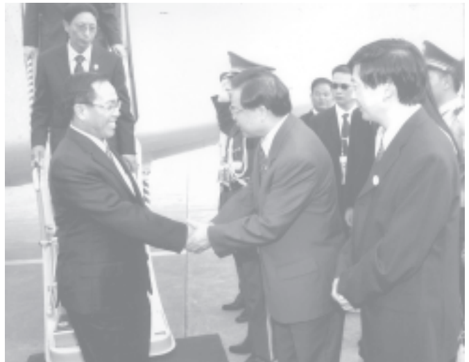
Prime Minister General Soe Win being greeted by Vice-Chairman of People's Congress of Guangxi Zhuang Autonomous Region.