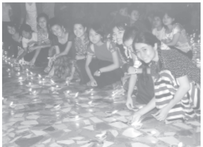
Pilgrims light candles on the platform of the Botahtaung Kyaikdeup Pagoda.