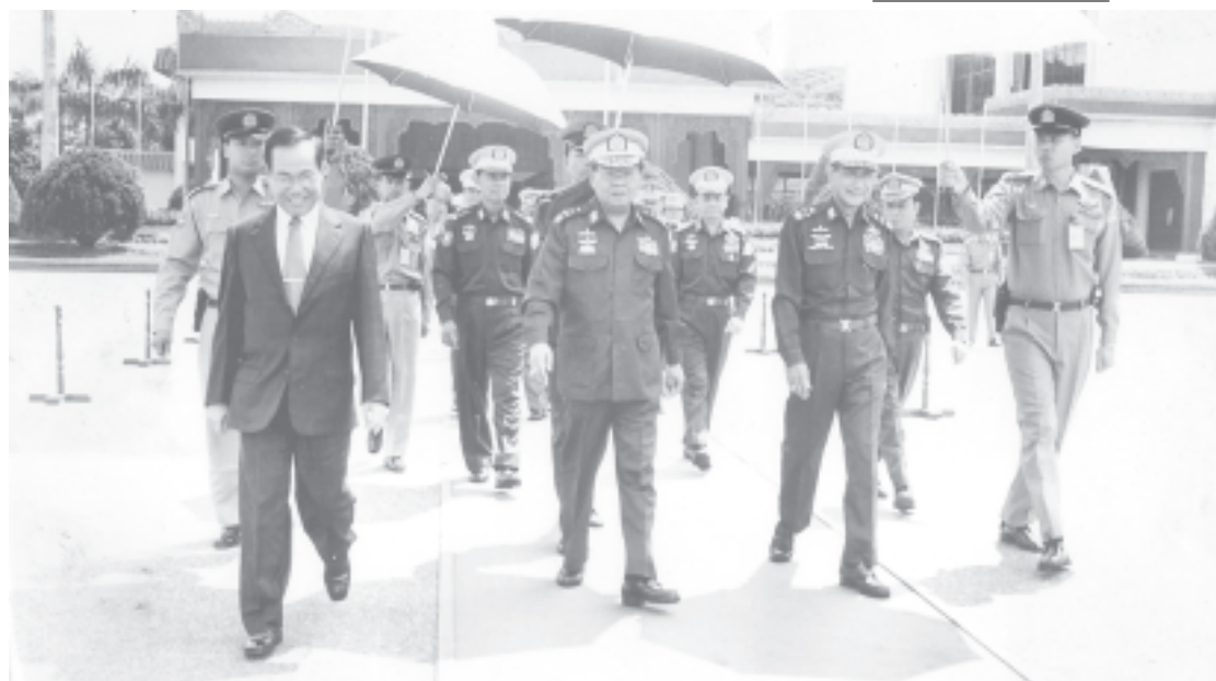
Senior General Than Shwe sees off Prime Minister General Soe Win who leaves for People's Republic of China to participate in the 2nd China-ASEAN Expo and the 2nd China-ASEAN Business and Investment Summit.