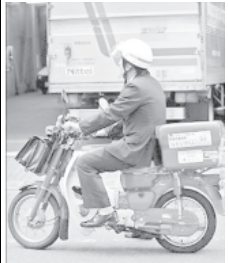
A postman returns to a post office in Tokyo on 14 Oct, 2005.