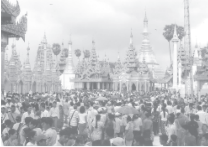
The Shwedagon Pagoda teeming with pilgrims on Fullmoon Day of Thadingyut. — NLM

Abhidhamma Day was observed at the Thiri Mingalar Kaba Aye Pagoda that was crowded with visitors doing meritorious deeds. The pagoda was illuminated