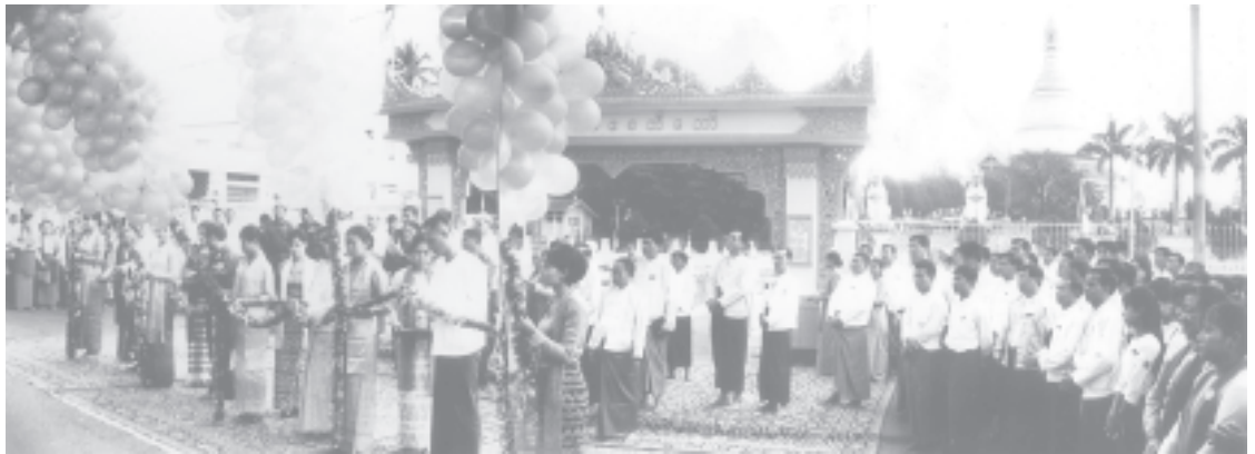
Commander Maj-Gen Myint Swe formally opens the concrete bridge across the turtle lake and the archway.