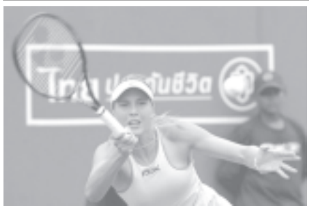
Nicole Vaidisova of the Czech Republic strikes a forehand to Nadia Petrova of Russia during their WTA Thailand Open final match in Bangkok, Thailand, on Sunday, 16 Oct, 2005. Vaidisova won the match and captured the title with score 6-1, 6-7(5), 7-5.

City got their deserved second in the 56th minute after a Kiki Musampa shot was parried by Carroll but only into the path of Cole who drove it into an empty net.—MNA/Reuters