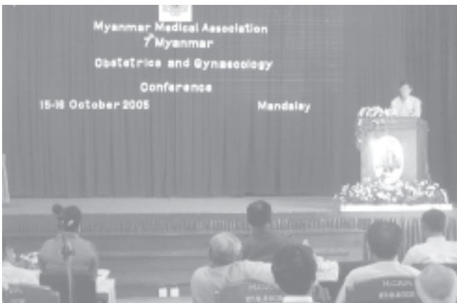
Health Minister Dr Kyaw Myint addresses the opening of the 7th Myanmar Obstetrics and Gynaecology Conference. —HEALTH

On 15 October, the minister went to Medical Research Department (Mandalay) in Pyin-OoLwin and also inspected cultivation of