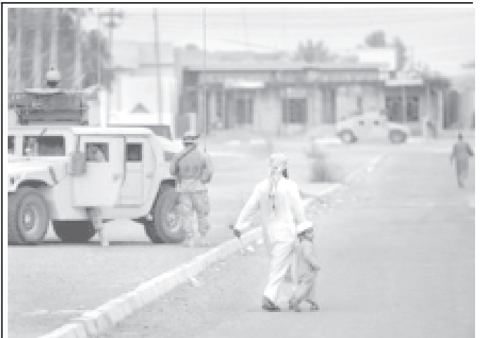
A young Iraqi boy looks back as he walks past US Marines in Humvees on a street in Fallujah, Iraq, on 15 Oct, 2005.

The deaths took to at least 1,970 the number of Americans to die in the Iraq war.