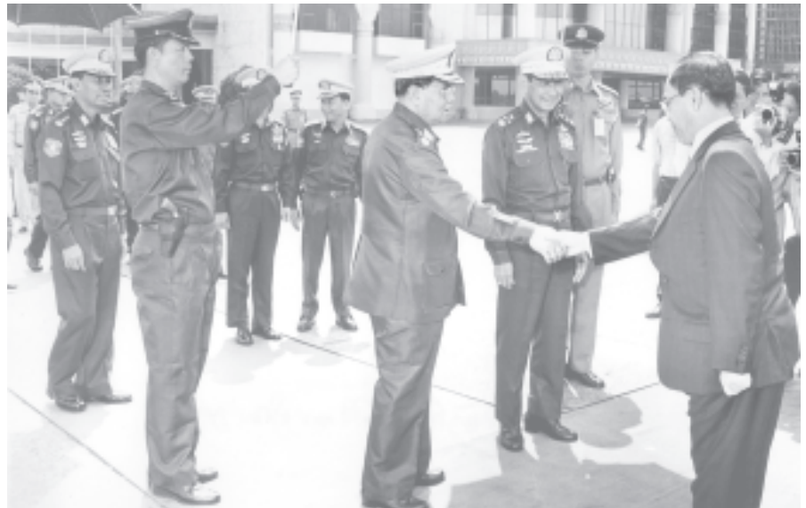
Senior General Than Shwe shakes hands with Prime Minister General Soe Win at airport.

Council Commander-in-Chief of Defence Services Senior General Than Shwe, Vice-Chairman of the State Peace and Development Council Deputy Commander-in-Chief of Defence Services Commander-in-Chief (Army) Vice-Senior General Maung Aye, Member of the State Peace and Development Council General Thura Shwe Mann of the Ministry of Defence, Secretary-1 of the State Peace and Development Council Lt-Gen Thein Sein, members of the State Peace and Development Council, the Commander-in-Chief (Navy), the Commander-in-Chief