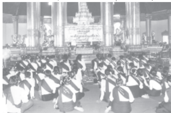
The 8th Abhidhamma Day is observed at the Tooth Relic Pagoda on Damapala Hill. — MNA

are reciting religious verses from 6 am to 6 pm daily from 16 to 18 October. Similarly, at