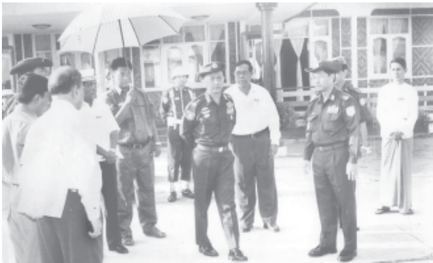
Secretary-1 Lt-Gen Thein Sein inspects Panhlaing River crossing Bridge linking Hlinethaya and Dalla.