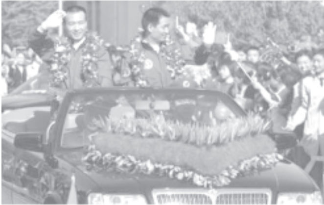
Chinese astronauts Fei Junlong (L) and Nie Haisheng wave to the cheering crowd at the Beijing Spacecraft Centre in Beijing, on 17 October, 2005.