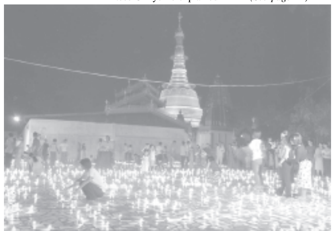
The Botahtaung Kyaikdeup Pagoda illuminated on Fullmoon Day of Thadingyut.