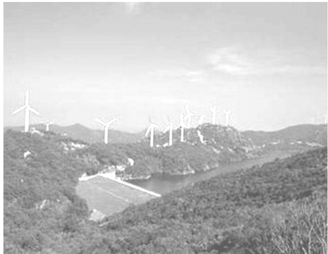
A view of the Dan Nan Wind Farm in Nan'ao, Guangdong Province, China, on 17 October, 2005.