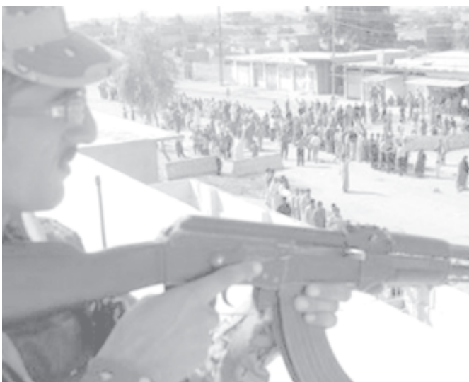
A soldier stands guard on a rooftop in Mosul, Iraq, on 15 Oct, 2005.

The devastating 7.6 magnitude earthquake that shook the northern part of Pakistan last Saturday has claimed more than 25,000 lives in the country. It has also destroyed more than 80 per cent of the structures and buildings there, and strong aftershocks are still threatening buildings already damaged by the initial earthquake. Now five days on, relief workers are still battling to give assistance to needy people in thousands of isolated communities. "We are most concerned for the people stuck in small villages. It's a race against the clock," Egeland said.—MNA/Xinhua