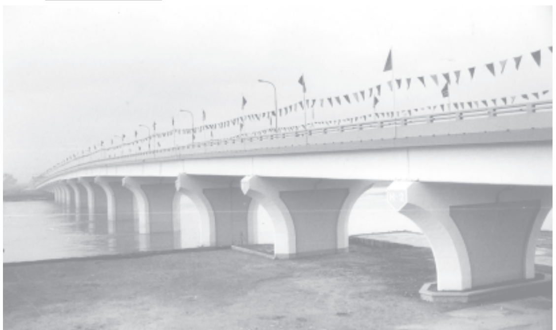
Panhlaing River crossing Bridge linking Hlinethaya and Dalla.