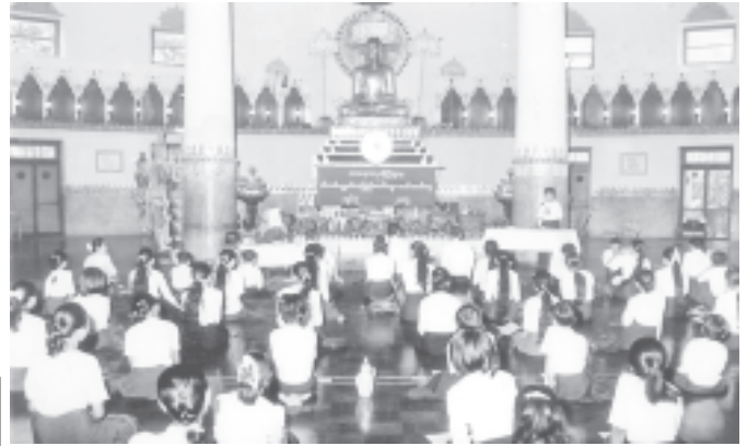
Abhidhamma Day observances at Kaba Aye.

The congregation offered water, flowers and lights to the Buddha Image. The congregation then supplicated on religious matters, discussed the Abhidhamma, recited religious verses and share merits.