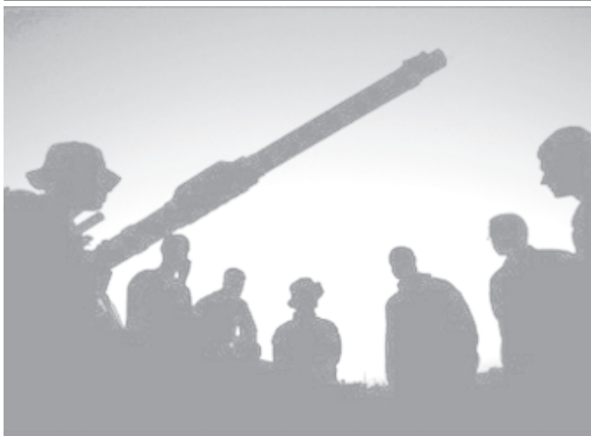
US soldiers gather around their tank in Baghdad recently.