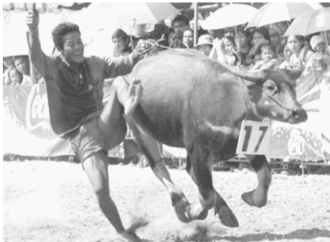
A Thai jockey loses his balance while racing in the annual traditional water buffalo race in Chonburi Province, 70 kilometres (44 miles) south of Bangkok, Thailand, on Monday, 17 Oct, 2005.

Attending the expo will be such companies as Airtel, America Online, Imate, LG Electronics, Motorola, Nokia, Reliance Infocom, Sagem, Sony Ericsson and Tata Indicom.