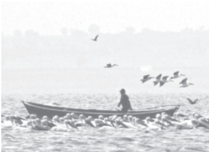
A fisherman sails his boat past a flock of pelicans in Manyas Lake a few miles from the quarantined town of Kiziksa in Turkey's northwest province of Balikesir on 16 October, 2005.