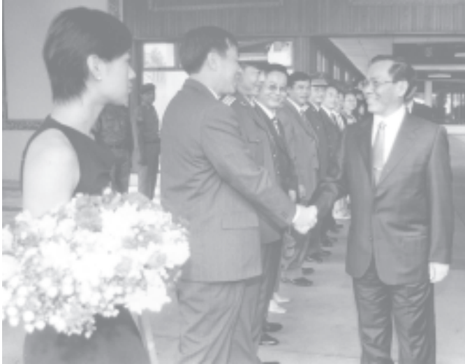
Officials of the Embassy of the People's Republic of China see off Prime Minister General Soe Win at the airport before he departs for PRC on 17-10-05. (News on page 1)