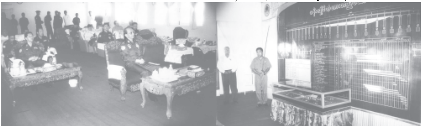
Secretary-1 Lt-Gen Thein Sein hears reports on construction of Panhlaing River crossing bridge at the briefing hall of the construction project.

Twantay bridge is located on Hlinethaya-Dalla-Twantay motorway, which will contribute not only to regional development but also to socio-economic life of the locals.