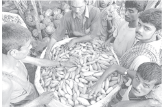
Indian men buy vegetables in a market in Kolkata. The world has enough resources to feed its growing population if political leaders can get past 'short-term interests', the head of the UN's food agency said at ceremonies marking World Food Day.