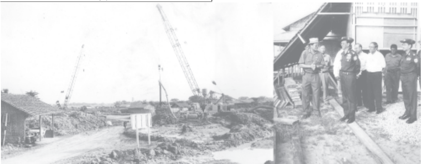
Secretary-1 Lt-Gen Thein Sein inspects Twantay Bridge construction project.