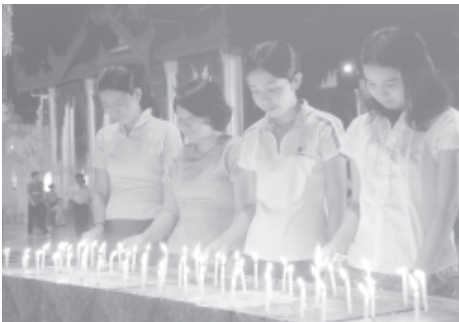
Pilgrims offer lights to the Shwedagon Pagoda.

Lawkachantha Abhayalabha Muni Buddha Image The 'soon' offering ceremony was held at Lawkachantha Abhayalabha Muni Buddha Image on Mindhamma Hill in Insein Township. In the evening the Buddha Image was crowded with devotees who offered flowers, lights, water and (See page 11)