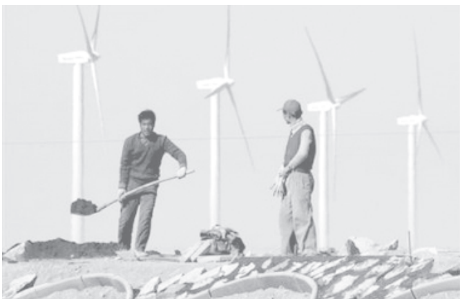
Workers build a highway near a wind farm in the Gobi desert, in China's northwest Gansu Province on 12 Oct., 2005.