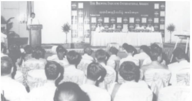
Press conference on winning two gold medals in the Brewing Industry International Awards (BIIA) in progress. — MNA