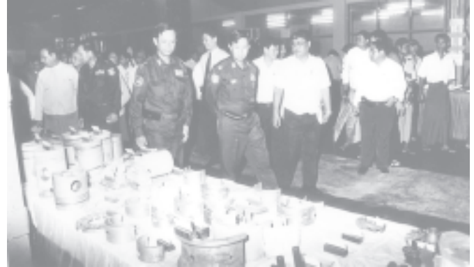
Ministers, deputy ministers and guests view display of machine spare parts.

First, Minister Col Zaw Min said that the exhibition was opened with two objectives—(1) to enable the factories and industries under the departments of the ministries to run with full capacity and (2) to research industrial development and to un-