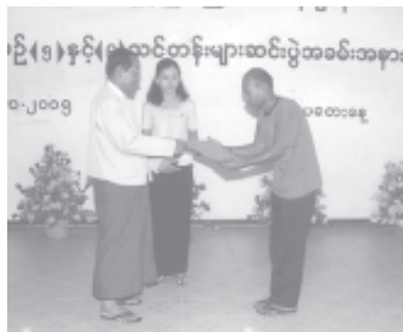
CEC member of Myanmar Forest Products and Timber Merchants Association presents a completion certificate to a trainee.

Officials presented prizes to the outstanding trainees and completion certificates to the trainees.