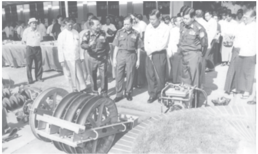
Ministers and deputy ministers observe samples of spare parts and machine parts at the exhibition conducted by the Ministry of Electric Power.