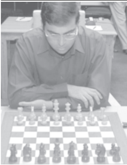
Vishwanathan Anand of India studies the board before the game against Alexander Morozevich of Russia during the thirteenth round of the World Chess Championship in Argentina's San Luis Province on 13 Oct, 2005.