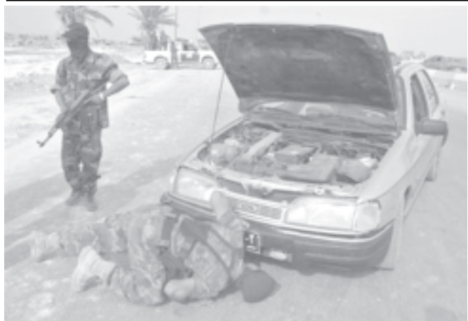
An Iraqi Interior Ministry special forces soldier checks a vehicle in Baghdad, Iraq, on Thursday, 13 Oct, 2005. US and Iraqi forces stepped up security across Iraq on Thursday in an effort to reduce guerilla attacks.

He said that the quake caused no casualties or damage, but create panic among residents because of fear of possible tsunamis. —MNA/Xinhua