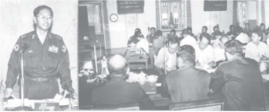
Maj-Gen Myint Swe speaks at the meeting of Yangon Division Supervisory Committee for Ensuring Smooth and Secure Transport.

YANGON, 14 Oct — The work coordination meeting of Yangon Division Supervisory Committee for Ensuring Smooth and Secure Transport was held at Yangon Command Headquarters this evening, attended by Yangon Division Peace and Development Council Chairman Yangon Command Commander Maj-Gen Myint Swe.