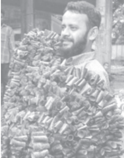
A Bangladeshi flower vendor buys garlands made from tree leaves, to use with flowers during the month of Ramadan, at a market in Dhaka on 13 October, 2005.