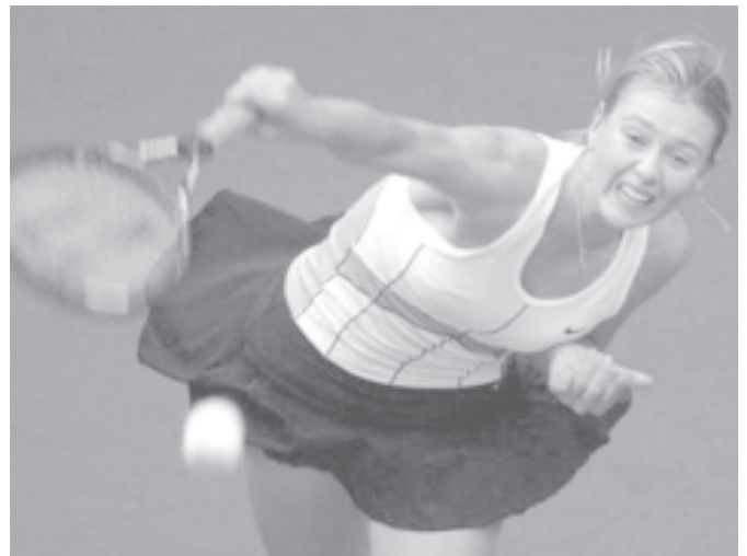
Maria Sharapova of Russia returns to Anna-Lena Groenefeld of Germany during their Kremlin Cup match in Moscow, on 12 October, 2005.