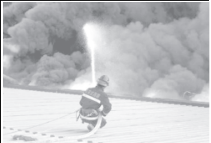
A Chinese fireman tries to put out a fire at a packing material company in Luquan, north China's Hebei Province, on 14 October, 2005. The cause of the fire is still under investigation, local sources said. —INTERNET