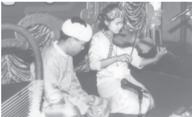
Girls' violin contest (aged 15-20) at basic education level in progress.