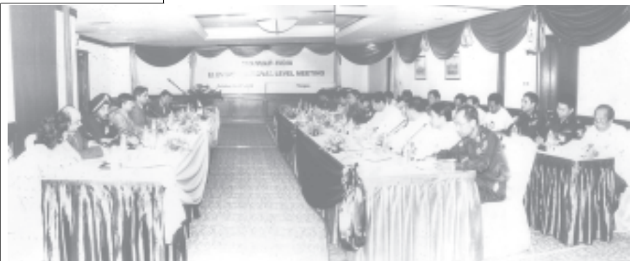
The 11th State-level Myanmar-India Civil Authorities Meeting in progress at Traders Hotel.