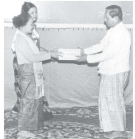
Minister for Religious Affairs accepts cash donations of wellwishers for Vipassana Pagoda in Mumbai.—MNA

Today's donations from 54 wellwishers amounted to K 9,658,809, US$ 22,200, one quartz necklace, one pearl necklace and one ruby hand chain. — MNA