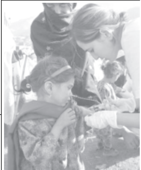
A Kashmiri girl receives an inoculation against diphtheria from a Turkish Red Cross member in earthquake-devastated Muzaffarabad, capital of Pakistan-controlled Kashmir on 14 Oct, 2005.