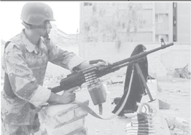
An Iraqi soldier secures a street in Baghdad on 14 Oct, 2005.

The two-seat Jet Ranger helicopter, carrying the commander of the Pha Muang task force, his close aide and two pilots, left Phitsanulok Province at about 3:00 p.m. and was seen for the last time on the radar screen at 5:50 pm.— MNA/Xinhua