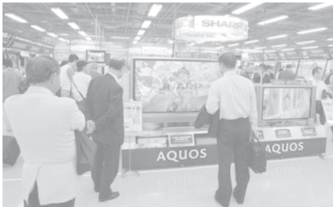
Potential buyers crowd on a floor of wide flat-screen televisions at a gleaming new nine-story electronics store at famed Akihabara electronics and electric shopping district in Tokyo on 13 Oct, 2005.