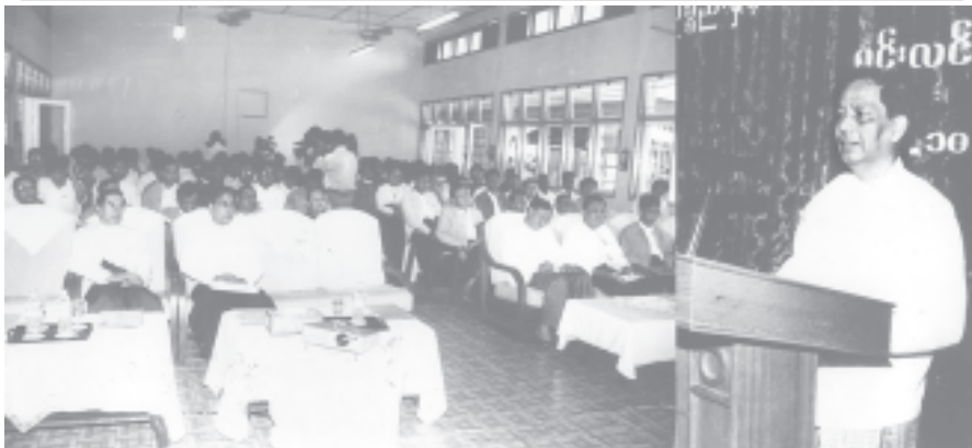
Minister Dr Chan Nyein addresses the ceremony to exhibit samples of spare parts and machine parts to be manufactured domestically by Ministry of Education and Ministry of Livestock and Fisheries.

YANGON, 14 Oct — For ensuring development of the industrial sector, the Head of State had given guidance to manufacture and use home-made machine parts and machinery that were imported in the past, and to strive to export them. In accord with the guidance of the Head of State, the ceremony to explain production of spare parts and machine parts of the Ministry of Education and the Ministry of Livestock and Fisheries was held at Science Equipment Factory and the hall of Universities' Press of Higher Education Department (Lower Myanmar) at the