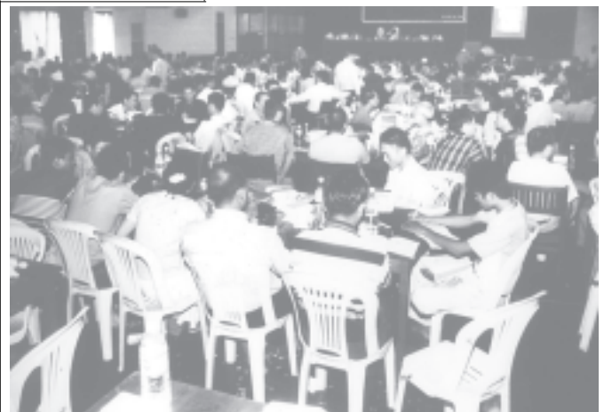
Gems merchants buy jade lots through competitive bidding. — MNA

Altogether 2,053 gem merchants — 1,236 merchants from 13 countries and 817 of local companies — are attending the gems emporium. — MNA