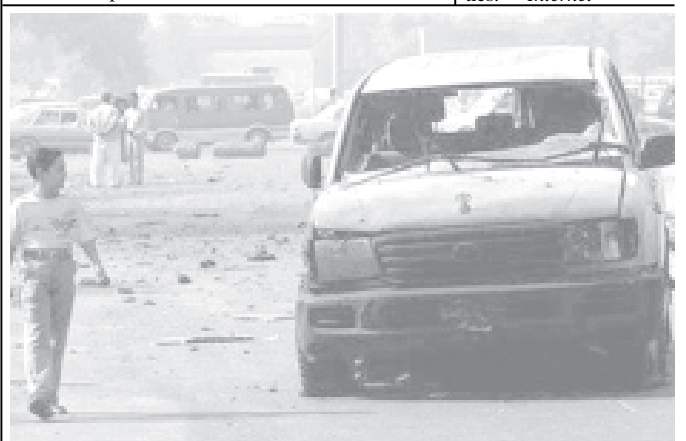
An Iraqi boy looks at a damaged Iraqi Ministry car after it was hit by car bomb attack in El Yarmouk area of western Baghdad recently.