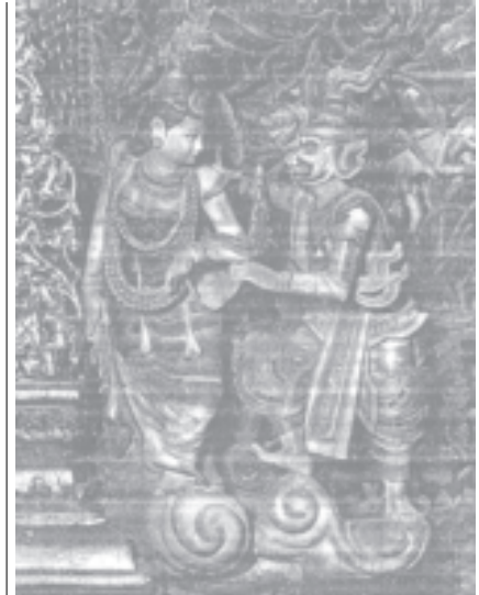
Wood carving in an old temple depicting love scene between Punnaka and Irandati.

To get Vidhura's heart he must be put to death. Therefore Punnaka let Vidhura hold the tail of the flying horse he was riding and galloped through forests and mountains. But Vidhura's moral precepts and virtues protected him from all dangers. When Punnaka was about to hurl him down into a ravine, Vidhura asked Punnaka why he so wanted to kill him. Punnaka explained to him everything. Vidhura told Punnaka to listen to the sadhunara dhamma he would preach before killing him. Sadhunara dhamma has four principles—(1) observance of good traditions and precedents of old generations (2) Continuing dana [giving or charity] (3) Abstaining from womanisation and avoidance of involvement in evil consequences and (4) Avoidance of wronging [sin against] one's true friends. After hearing the Sadhunara dhamma from Vidhura, Punnaka realised his wrongdoings and became repentant. He prom-