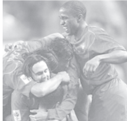
Mobbed: Portuguese Pauleta (C) lies on the ground as his teammates pile on top of him to celebrate his goal against Latvia during their 2006 World Cup qualifier in Porto.

Portugal has now won their ticket to Germany 2006, after Saturday's victory over Liechtenstein and Wednesday's win over Latvia.