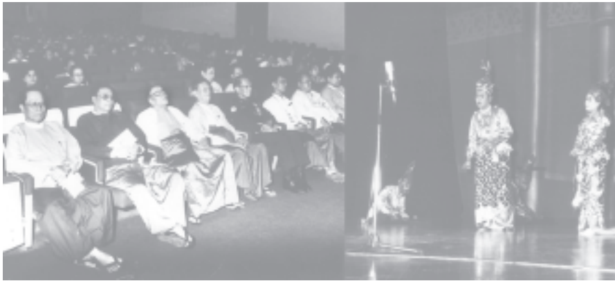
Minister Maj-Gen Kyi Aung, watches Vidhura drama contest at the National Theatre.