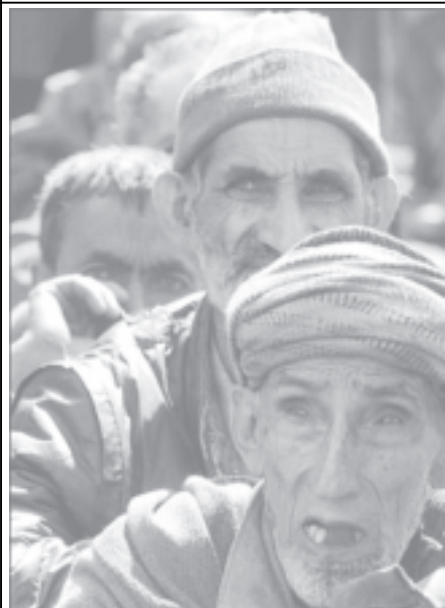
Indian Kashmiri earthquake survivors wait for relief material. With tens of thousands of their homes destroyed by last weekend's earthquake, survivors in mountainous Indian Kashmir need to be quickly moved to camps for the winter, officials warn.