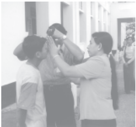
Ophthalmologists providing health care services to an eye patient in Kawkaireik.— HEALTH

At Kawkaireik District Hospital, they provided treatment to 504 local patients and performed surgical operations on 80 patients free of charge.