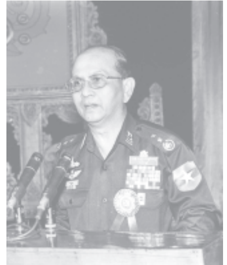
Secretary-1 Lt-Gen Thein Sein addresses opening ceremony of 13th Myanmar Traditional Cultural Performing Arts Competitions.

Emergence of the State Constitution is the duty of all citizens of Myanmar Naing-Ngan.