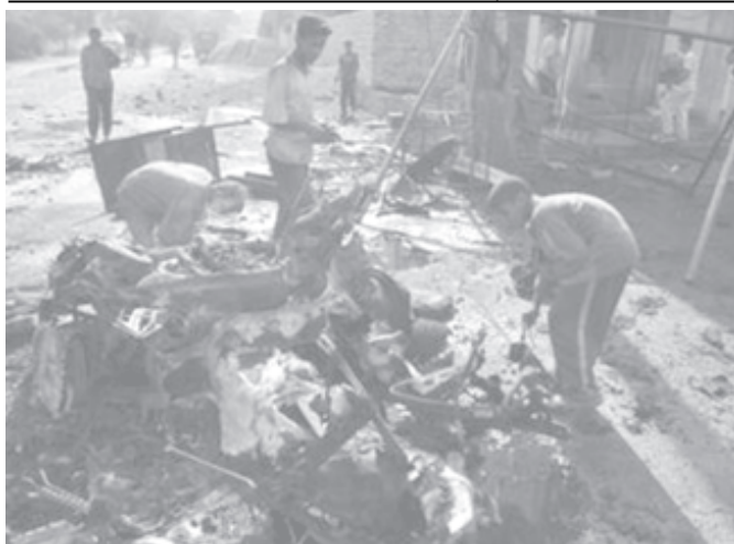
Iraqis collect parts from a vehicle used in a car bomb attack against an Iraqi Ministry for Governorate Affairs convoy in El Yarmouk area, western Baghdad area, on 12 October, 2005.

Other members include Vice-Chairmen Senator Chea Cheth and lawmaker Princess Norodom Vacheara, as well as Minister of Council of Ministers Sok An representing the government and Say Chhum of the Cambodian People's Party, You Hockry of FUNCINPEC Party and Sam Rainsy, president of the Sam Rainsy Party. —MNA/Xinhua