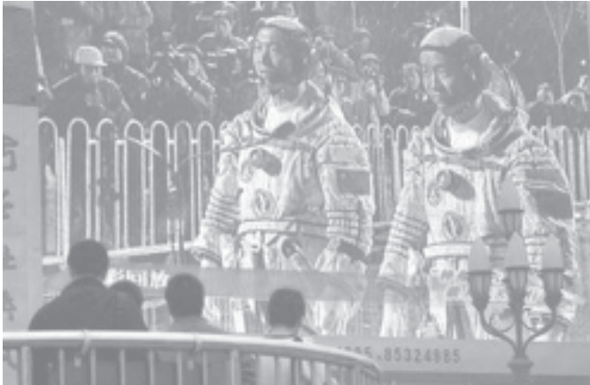
Chinese watch a giant TV screen, showing Chinese astronauts Fei Junlong (L) and Nie Haisheng walking to the launch tower of the Jiuquan Satellite Launch Centre in northwest China's Gansu Province, at Beijing's railway station on 12 October, 2005.