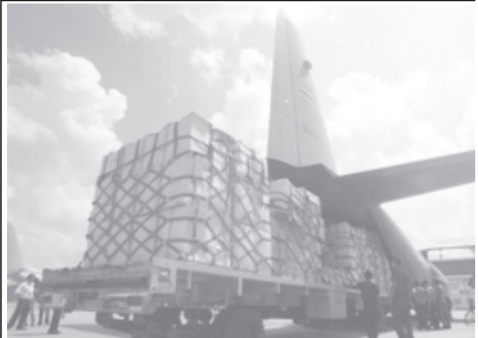
Thai Air Force airmen load medicines for Pakistan earthquake aid onto a C-130 airplane at an air force base in Bangkok on Thursday, 13 Oct, 2005.