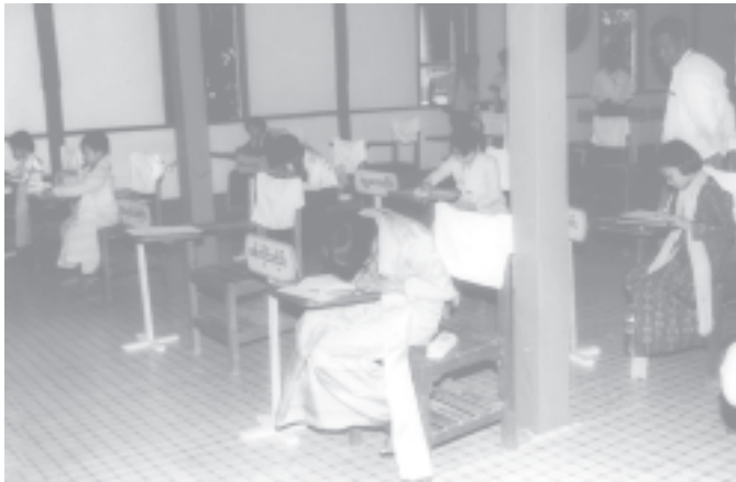
Contestants participate in basic education level (5-10 age group) song composing contest.— MNA

At Padonma Theatre, 10 competitors participated in the higher education level (men's) and