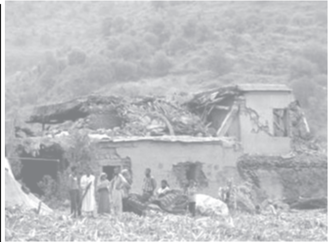
An earthquake survivor family stand in front of their destroyed house in Poonch, 250 km (156 miles) northwest of the northern Indian city of Jammu, on 11 October, 2005.