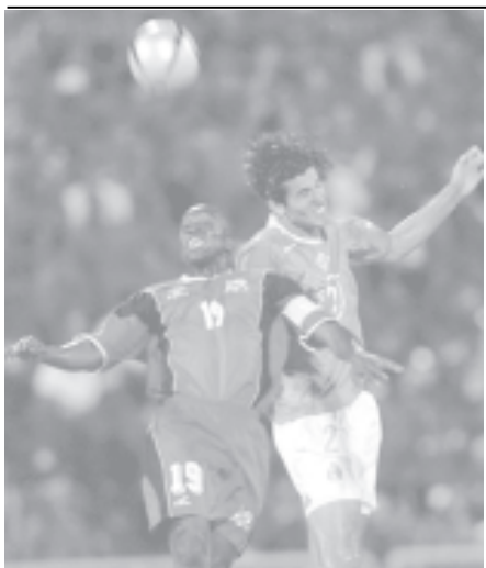
Mexico's Francisco Rodriguez (R) goes head to head with Dwight Yorke of Trinidad and Tobago. Stern John scored twice to lift Trinidad and Tobago to a 2-1 victory over regional powerhouse Mexico, keeping the 'Soca Warriors' fighting for a 2006 World Cup berth.