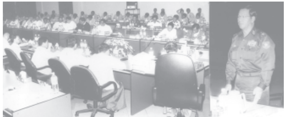
Minister for Finance and Revenue Maj-Gen Hla Tun addresses coordination meeting of Ministry of Finance and Revenue.—F&R

YANGON, 13 Oct — The second day of the third work coordination meeting of the Ministry of Finance and Revenue continued at the ministry this morning, attended by Minister for Finance and Revenue Maj-Gen Hla Tun.