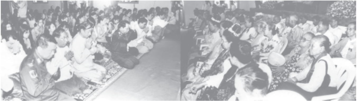
The ceremony to pay respects to doyen artistes in progress.

Myanmar Movie Day observed, respects paid to senior persons in Myanmar movie field