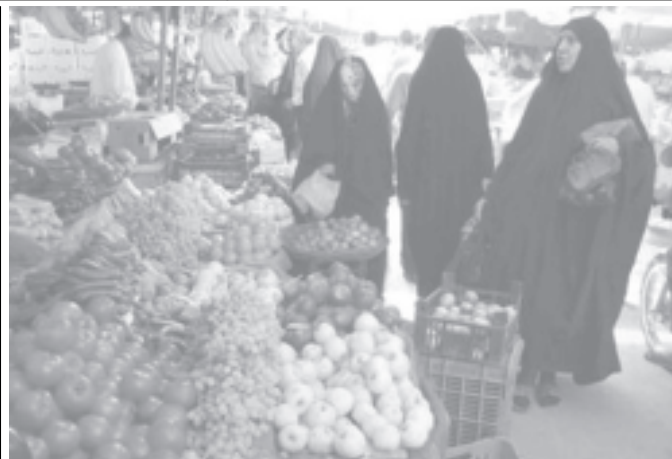
Shiite women walk through a market for last minute shopping before the upcoming constitutional referendum in the Iraqi city of Kerbala, 110 km (70 miles) south of Baghdad, on 12 October, 2005.—INTERNET

Singapore's inflation is expected to increase to 0.5-1.5 per cent next year from 0.0-0.5 per cent this year, the MAS said.—MNA/Xinhua