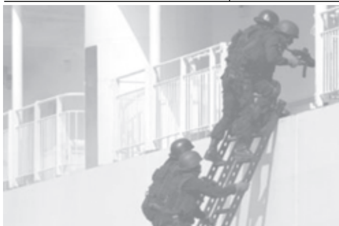
A South Korean Special Weapons and Tactics (SWAT) team moves onto a ship during an anti-terrorism drill at a port in Pusan, about 420 km (262 miles) southeast of Seoul, on 13 October, 2005.