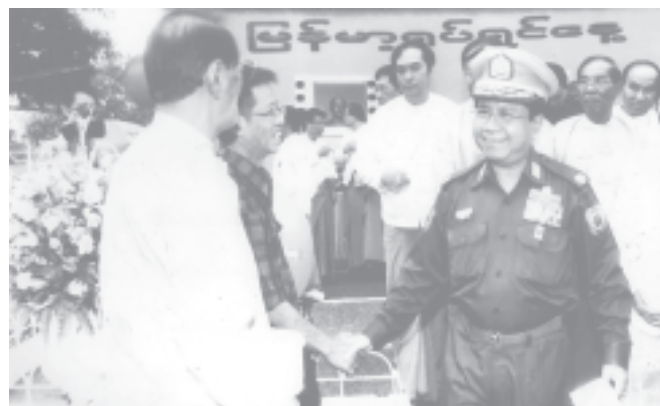
Minister for Information Brig-Gen Kyaw Hsan shakes hands with an artiste.

on Wingabar Road in Bahan Township this morning.