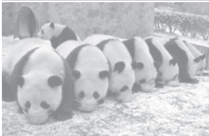
Giant pandas drink milk at China's Giant Panda Protection and Research Centre in Wolong National Natural Reserve, in southwest China's Sichuan province, in this 21 February, 2005 file photo. China's Taiwan Affairs Office on 13 October, 2005 presented pictures and resumes of 11 pandas in the running to be sent as a gift to Taiwan.