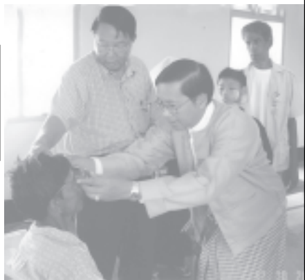
Ophthalmologists give treatment to eye patients in Kawkaireik.

While in Kawkaireik, authorities of Kayin State and Kawkaireik District Peace and Development Councils, personnel of Kayin State and District Health Departments, members of the Union Solidarity and Development Association, members of Women's Affairs Organizations, Maternal and Child Welfare Association and Red Cross Brigade participated in the health care services of the ophthalmologists team.