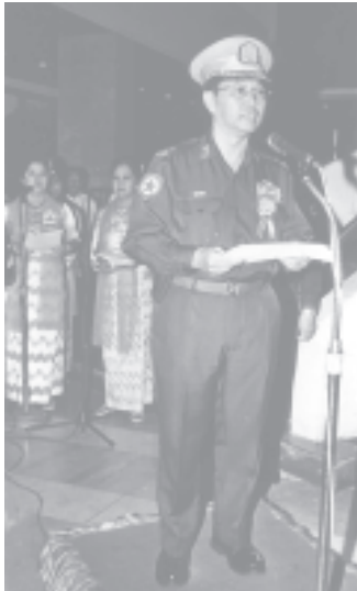
Com- mander Maj-Gen Myint Swe clarifies the arrange- ments for performing arts compe- titions.