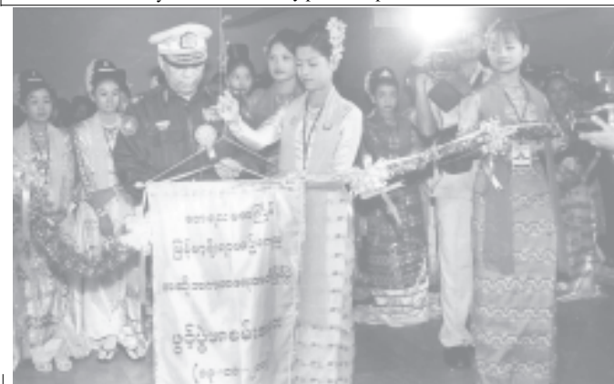
Culture Minister Maj-Gen Kyi Aung formally opens performing arts competitions.

A total of 2,482 contestants are contending for the prizes. All necessary arrangements have been made for enabling the contestants, who love and preserve the cultural heritage of the nation, to take part in the competitions in peace in accordance with the lofty