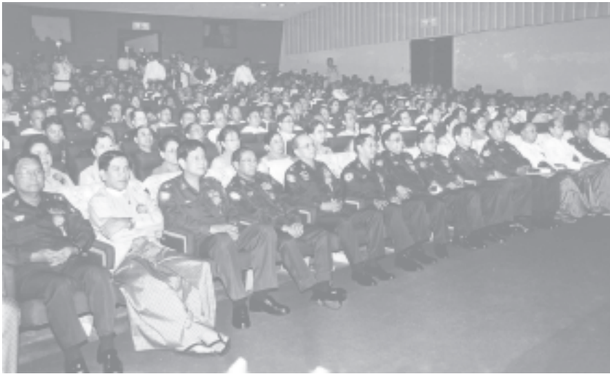
Secretary-1 Lt-Gen Thein Sein among the audience enjoying entertainment of artistes at the opening ceremony of 13th Myanmar Traditional Cultural Performing Arts Competitions.

YANGON, 13 Oct—The opening ceremony of the 13th Myanmar Traditional Cultural Performing Arts Competitions was held at the National Theatre on Myoma Kyaung Street in Dagon Township here this morning.