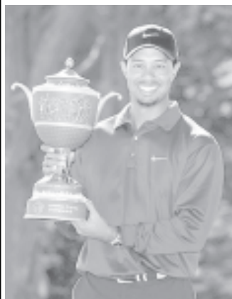
Tiger Woods holds the Gene Sarazen Trophy after winning the WGC American Express Championship at Harding Park Golf Course in San Francisco, California.