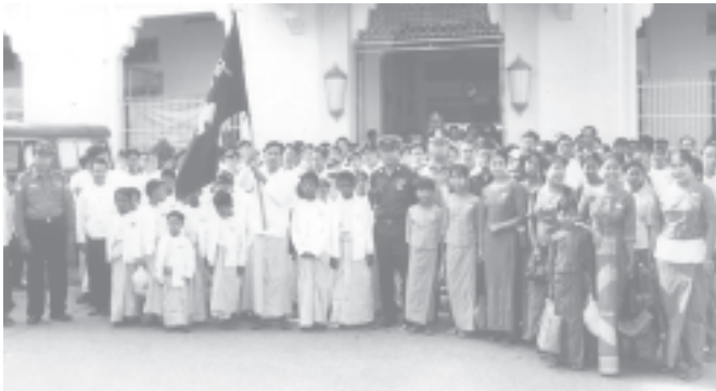
Participants of Sagaing Division seen on their arrival at Yangon Railway Station to take part in the 13th Myanmar Traditional Cultural Performing Arts Competitions.