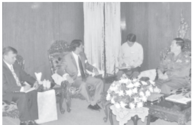
PBANRDA Minister Col Thein Nyunt meets Bangladeshi Ambassador Mr Mohammed Khairuzzaman.

YANGON, 10 Oct — Minister for Progress of Border Areas and National Races and Development Affairs Col Thein Nyunt today received Mr Mohammed Khairuzzaman, Ambassador of the People's Re-