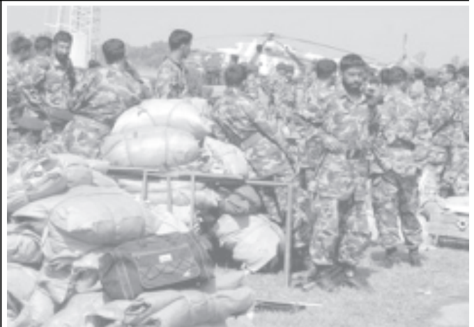
Pakistan's Army troops wait for boarding to leave for earthquake-affected area of Pakistani controlled Kashmir, at Chaklala air base in Rawalpindi, Pakistan, on 9 Oct, 2005.

we are discussing possible participation in guarding or training missions," he said. Inducted into NATO last year with support from Washington, Bulgaria is a staunch supporter of US-led operations in Iraq and has lost 13 soldiers and six civilians in the ongoing violence there. Some two thirds of Bulgaria's 7.8 million people disagree with the war.