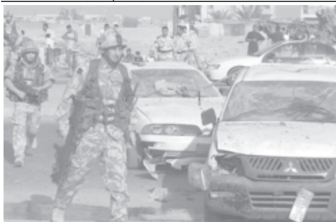
British troops move in at the scene of a suicide car bomb attack in Basra, Iraq, on 9 Oct, 2005.

The ultimate price of a slowdown in Iraq's reconstruction could be steep. US strategy here is based on the premise that jobs and prosperity will sap the strength of the insurgency and are as important as military successes in defeating terrorists. —Internet