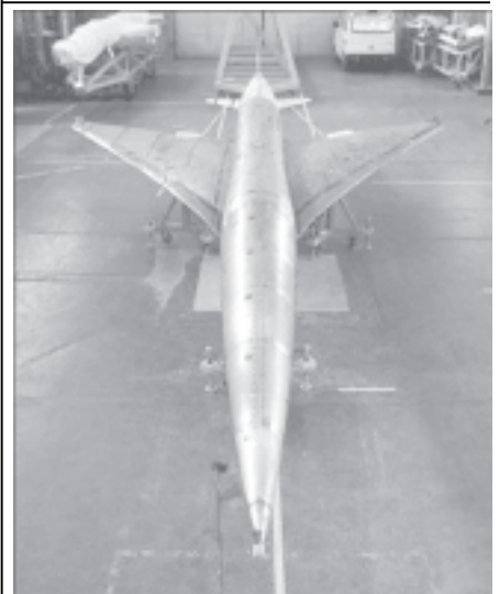
A scale model of the Japanese designed supersonic airliner. Japan successfully tested a revolutionary design for a supersonic airliner to replace the Concorde, three years after the first attempt ended in a fiery crash in the Australian desert.

Over 12,000 people with a majority of whom, according to officials, militants and some 80 US soldiers have been killed since the beginning of this year.