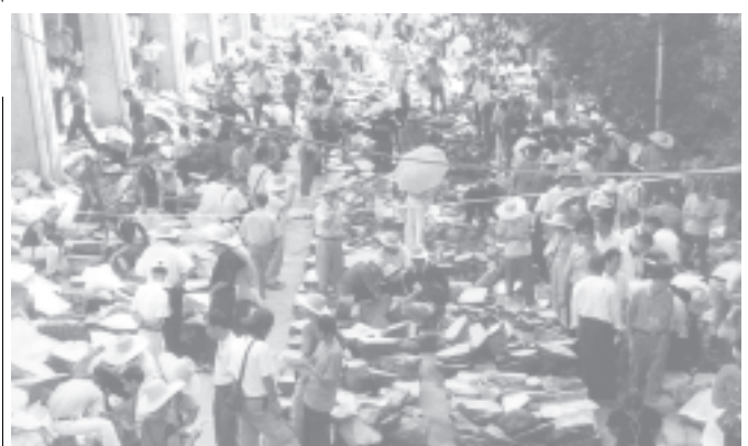
Local and foreign merchants observe pieces of jade at Mid-Year Myanmar Gems Emporium.