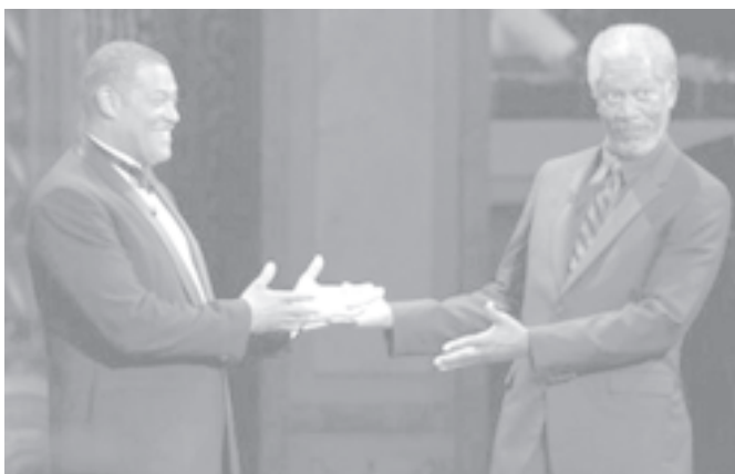
Actors Laurence Fishburne, left, and Morgan Freeman greet each other before paying tribute to actor Ossie Davis at the 2005 Film Life Black Movie Awards in Los Angeles on 9 Oct, 2005. Davis passed away earlier this year at the age of 87.