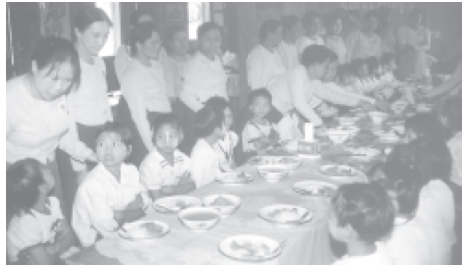
Shan State Women's Affairs Organization members feed nutritious food to students of Wamphi primary school in Honaung village, Namsang township, Loilem District.

At Thiri Mingala Monastery, members of Shan State WAO and