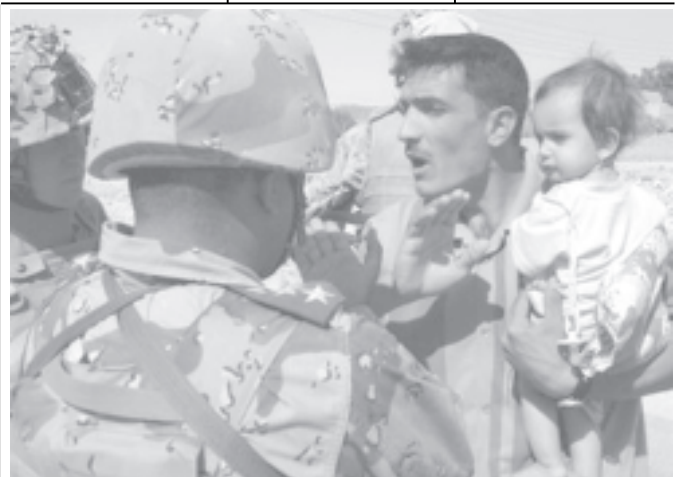
An Iraqi father trying to take his ill child to a hospital in a nearby city talks to US Marines and an Iraqi Army commander on 8 October, 2005, in Haditha, Iraq.