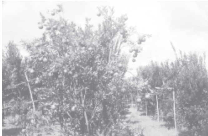
Thriving orange plantations in Kholam Model village, in Honaung village-tract, Namsang township, Loilem District.

It is proved that the development of Kholam Model village is due to the genuine goodwill of the State, and the strength of rural people and social organizations.—MNA