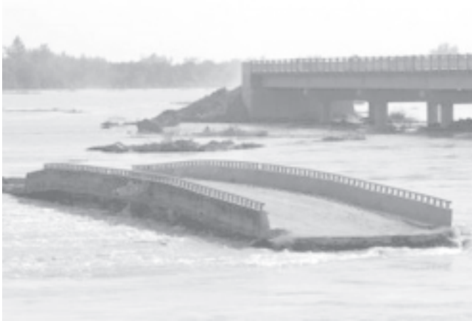
Flood from Hanjiang River, a branch of Yangtze River, submerges a rural area in Wuhan, central China's Hubei Province on 8 October, 2005.