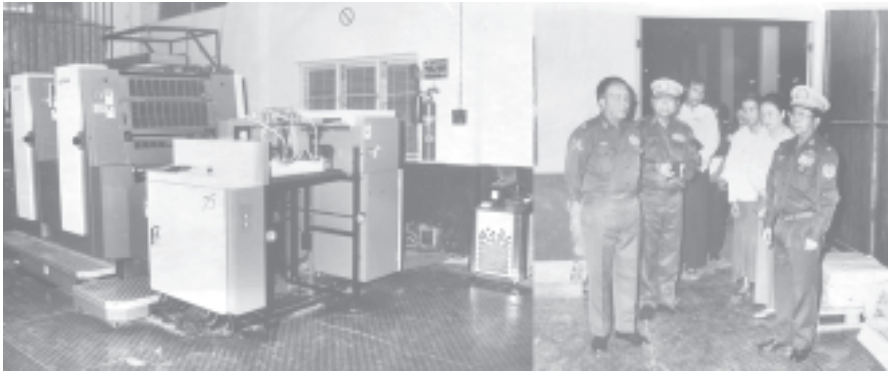
Information Minister Brig-Gen Kyaw Hsan inspects GTC press in Insein Township.