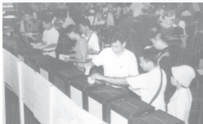
Local and foreign merchants putting proposals into tender boxes to purchase jade lots at Mid-Year Myanmar Gems Emporium.