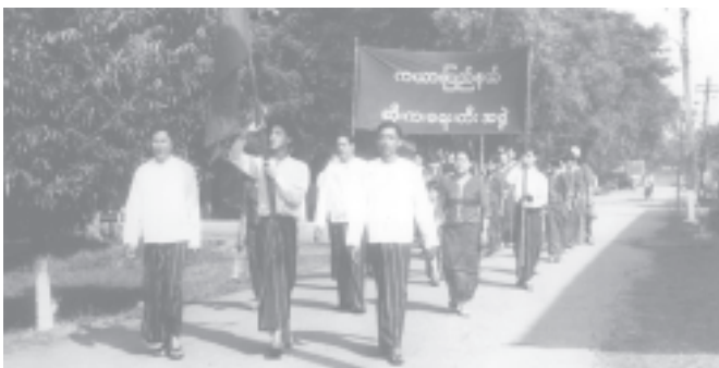
Managers and participants of Kayah State arriving at Bayintnaung Transit Hall to take part in the 13th Myanmar Traditional Cultural Performing Arts Competitions.

YANGON, 10 Oct — The 13th Competitions of Myanmar Cultural Performing Art will be held from 13 to 31, Oc-