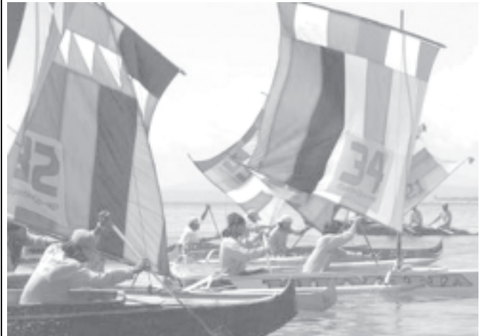
Filipinos paddle as they race for money with their colourful sailboats called vinta, in the port city of Zamboanga, southern Philippines on 9 Oct, 2005. — INTERNET

Some farmers have "adopted" 20 trees each. Usually, the villagers take responsibility for picking tea-leaves and removing weeds. According to township rules on tree protection, tea-leave picking is restricted to a period between April and October, and no human activity is allowed to damage the growing environment for the ancient tea trees, said Chen Qi. — MNA/Xinhua