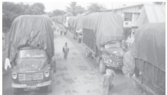
Trucks running in Kholam Model village, in Honaung village-tract, Namsang township, Loilem District.

At present, there are one 25-bed Township Hospital, one Station Hospital, 4 rural health care services, 16 rural health care services (branch) in Namsang Township. One 16-bed Station Hospital and one rural health care service have been opened in Kholam village. The staff are serving the tasks on health of the expectant mothers, children and the older persons in the village. Health care services have improved in the region.