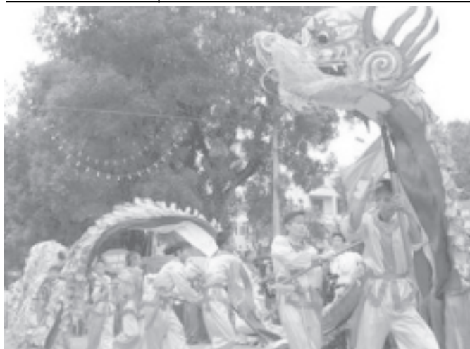
Vietnamese performers take part in a dragon dance competition during a cultural festival in Hanoi, Vietnam, on 9 Oct, 2005. The festival was part of the 995th anniversary of the founding of Hanoi, formerly called Thang Long which means Flying Dragon.