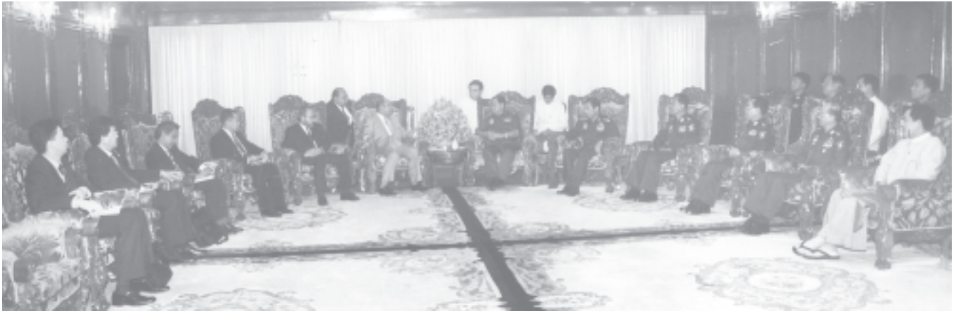
Senior General Than Shwe meets Malaysian Foreign Minister Datuk Seri Syed Hamid Albar bin Syed Jaafar Albar.