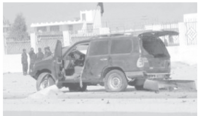
A vehicle belonging to British nationals is seen after a suicide attack in Kandahar, Afghanistan, on 9 Oct, 2005.