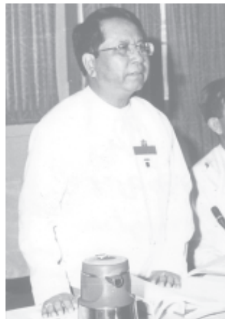
Secretary of National Convention Convening Commission Minister Brig-Gen Kyaw Hsan explains arrangements made by the commission.