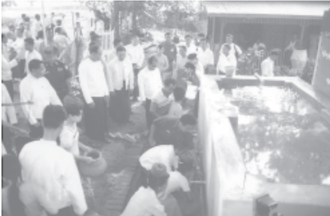
USDA CEC Member Mayor Brig-Gen Aung Thein Lin views villagers fetching water from the 10,000-gallon concrete tank in Tuchaung Village.

At TatUkyauing, they attended the ceremony to set up Phyo Myitta Health Care Association of Htantabin