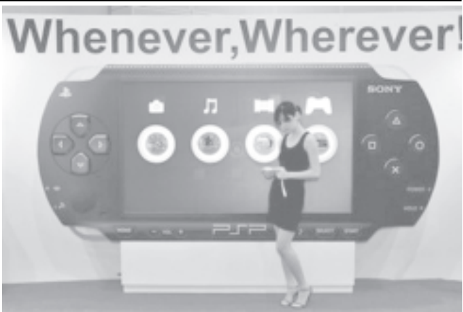
A promoter plays the Sony PlayStation Portable consoles in-front a giant model on display at the Sony Expo at the Kuala Lumpur Convention Center in Kuala Lumpur, Malaysia, on 7 Oct, 2005.

"We must share epidemiological data and samples with one another," the HHS official said. "Without that kind of early cooperation, we will pull back to the next firebreak because we will have to begin to protect ourselves."—MNA/Reuters