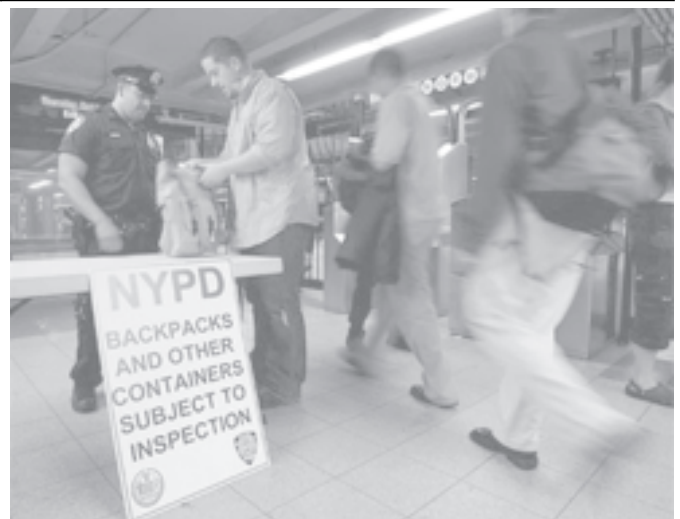
A New York City police officer searches the bag of a subway passenger in New York City on 6 Oct, 2005.