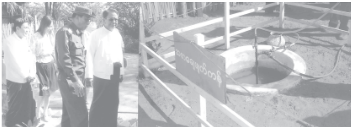
Commander Maj-Gen Khin Zaw and USDA CEC member U Aung Thuang inspect bio-gas power station in Kyaukse Township. — INDUSTRY-1

Universities and hospitals have been upgraded and opened in the