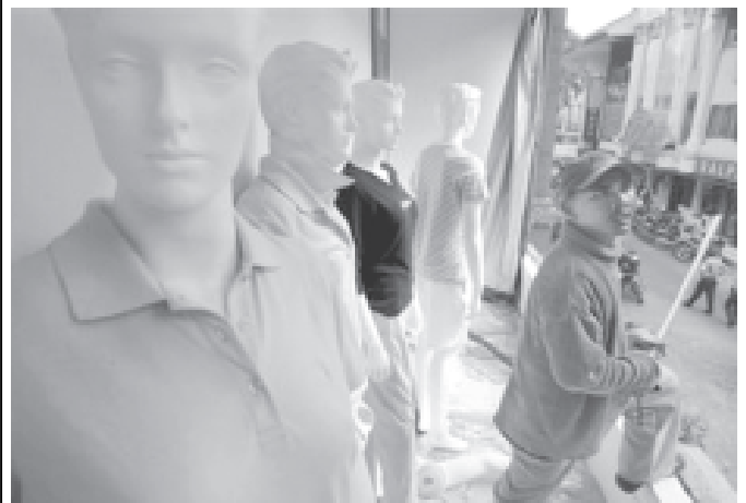
A worker prepares to renovate the display window at a clothing store damaged by one of Saturday's bomb explosions in Kuta, Bali, Indonesia, on 7 Oct, 2005.

The Pentagon has blamed the Abu Ghraib abuses on a few rogue soldiers and produced reports from several of its own investigations that showed no wrong-doing at top levels.