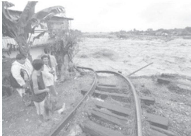
Residents look at the destruction of a train line and of a bridge caused by heavy rains from Hurricane Stan in the town of Tapachula in the southern Mexican state of Chiapas, Mexico, on 6 Oct, 2005.