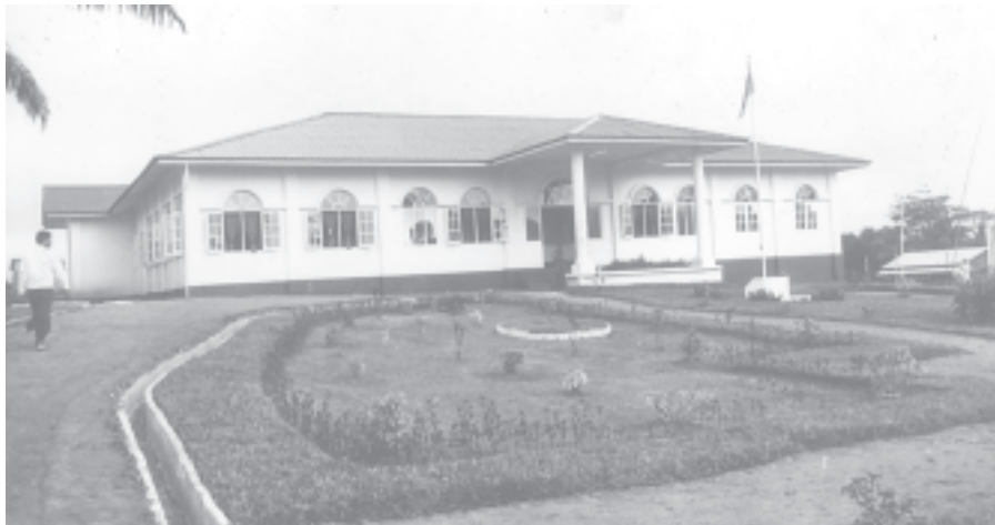
Pyigyi Mandaing Township People's Hospital in Bokpyin Township, Taninthayi Division.