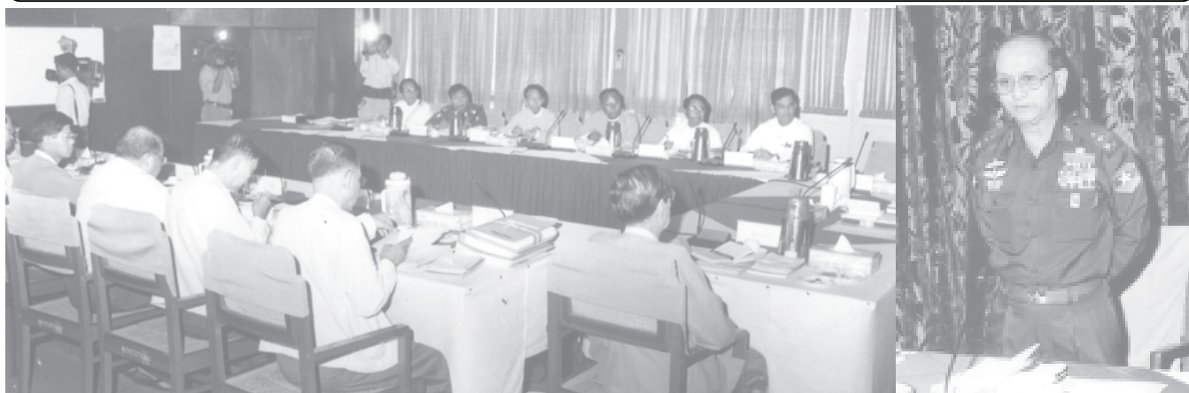
Secretary-1 Lt-Gen Thein Sein speaking at the meeting (6/2005) of the National Convention Convening Commission.

YANGON, 8 Oct — The meeting (6/2005) of the National Convention Convening Commission took