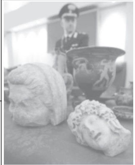
An Italian carabinieri officer watches over a table filled with stolen artefacts recovered in an operation at a police station in Rome on 7 Oct, 2005.