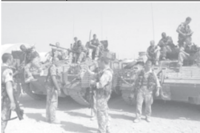
British soldiers stand on armoured combat vehicles in Basra, Iraq, on 7 Oct, 2005.