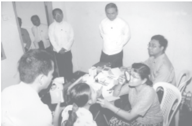
Mayor Brig-Gen Aung Thein Lin visits health care services given to a lady by a team of dental surgeons in Tuchaung Village. —(YCDC)

Tuchaung Village is one mile square. There are over 400 houses in the village. Business of the local people is agriculture. —MNA