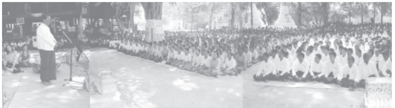
Minister U Aung Thuang holds a meeting with people from Panan, Pankhwa, Kade and Thangedaw villages in Kyaukse Township. — INDUSTRY-1

rural region development projects, Panan Village Basic Education primary School, MCWA and WAO was held. Commander Maj-Gen Khin Zaw K 500,000 for renovation of the school, member of the Secretariat of USDA U Aung Thuang K 250,000 for purchase of