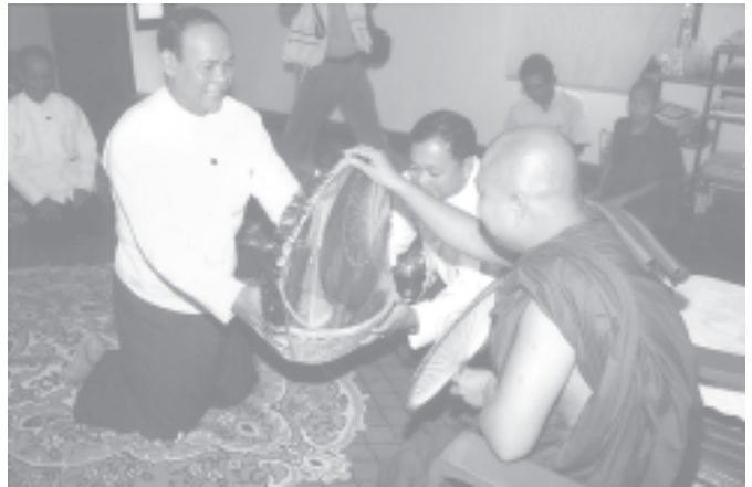
Mayor Brig-Gen Aung Thein Lin offers alms to Sayadaw of TatU Monastery in Tuchaung Village, Htantabin Township, Bhaddanta Vinayacara.

CEC member Brig-Gen Aung Thein Lin accepted 1,200 membership applications from Village USDA Organizer