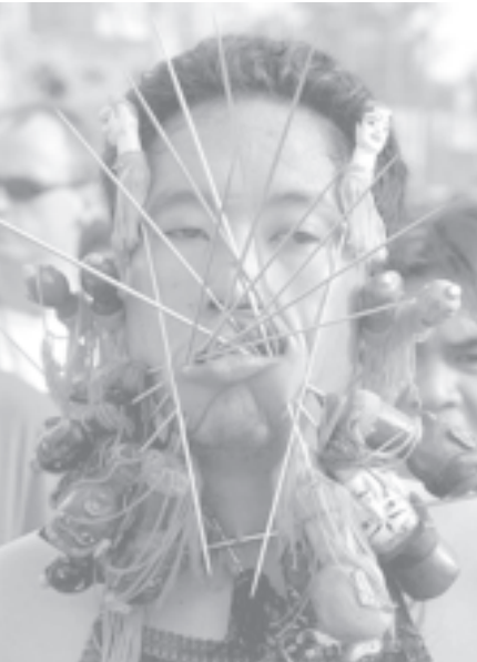
A Thai-Chinese devotee who pierced rods through his cheeks joins a rally to mark the annual Vegetarian festival in Phuket Province, about 690 km (429 miles) southwest of Bangkok, on 7 Oct, 2005.