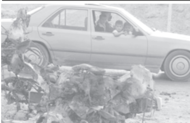
Iraqi children look at the remains of a car bomb in Samarra, Iraq, on 7 Oct, 2005. —INTERNET

It would issue watch advisories on tsunami, estimated arrival times, forecast of its strength, surge heights, extent of inundation and warning cancellation. The minister said the equipment, manpower and other related heads of expenditure have been provided to four institutions and government departments, including Department of Ocean Development and National Institute of Ocean Technology. —MNA/PTI