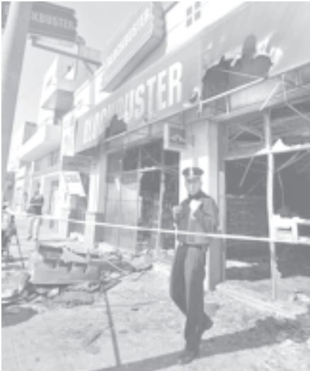
A policeman stands in front of the burned video store in the district of San Martin, Greater Buenos Aires, on 6 Oct, 2005. Three homemade bombs exploded on Thursday at two Citibank branches and a Blockbuster video store in Argentina in what appeared to be a protest against US President George W Bush's visit next month to attend the Summit of the Americas, police said.