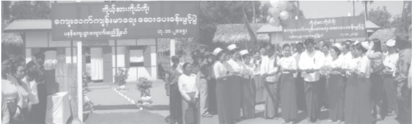
The opening ceremony of Rural Dispensary in progress in Panan Village of Kyaukse Township. — INDUSTRY-1