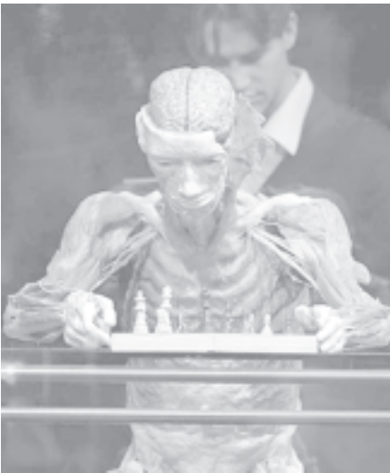
A man peers at the back of the "Chess Player", which is part of the "Bodyworlds" exhibit at the Franklin Institute in Philadelphia on 6 Oct, 2005.

Some species of waterfowl, like ducks and geese, are natural hosts of the H5N1 and do not fall ill from it. But the virus has always been known to be virulent in chickens, but they typically fall sick quickly and die within 24 hours of contracting it. — MNA/Reuters