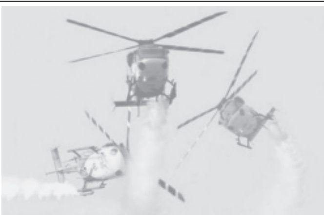
Air Force helicopter team Druw rehearses for India's Air Force Day in New Delhi on 6 October, 2005. The Indian Air Force celebrates its 73rd anniversary on Saturday, 8 October.