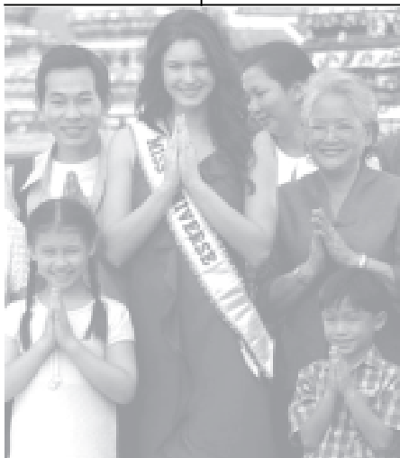
Miss Universe 2005 Natalie Glebova gives a traditional Thai greeting known as a 'Wai' during film advertisement in Bangkok on Thursday, 6 Oct, 2005.