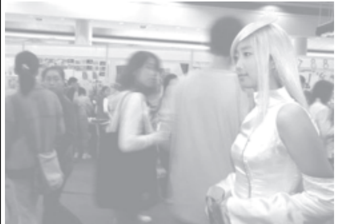
A Chinese youth depicting a cartoon character walks around among visitors at 2005 Animation Comics Games Carnival on 5 Oct, 2005, in Shanghai, China.