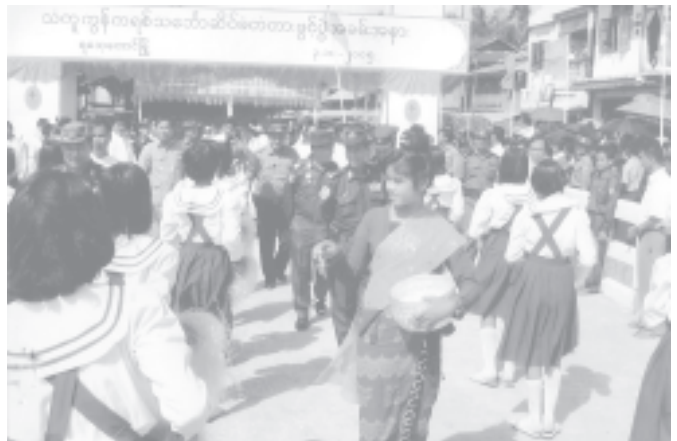
Commander Maj-Gen Khin Maung Myint, Minister Maj-Gen Thein Swe and Minister Brig-Gen Maung Thein inspect newly-inaugurated reinforced concrete jetty in Yathedaung.

of Township Development Affairs Committee reported on construction of the jetty. The commander presented gifts to the engineer who led construction tasks. They viewed the jetty with the length of 48 feet and width of 38 feet. They also looked into completion of Mayyu Hall and two storey-building at Rathedaung BEHS.