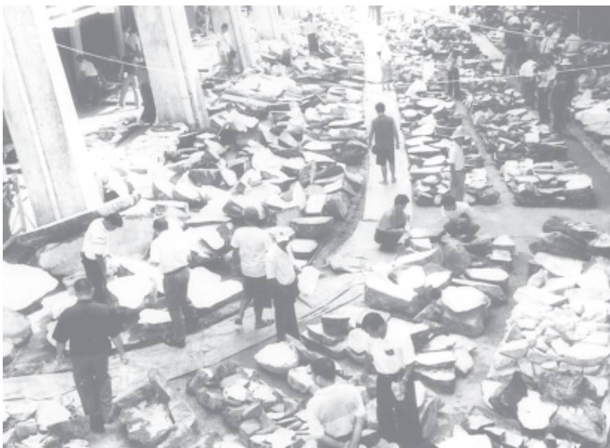
Merchants examining jade lots at 2005 Mid-Year Myanmar Gems Emporium.