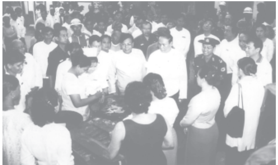
Commander Maj-Gen Myint Swe, Mayor Brig-Gen Aung Thein Lin and Deputy Minister Dr Mya Oo visit local people carrying out mass activities against dengue haemorrhagic fever in Mingala Taungnyunt Township. — MNA