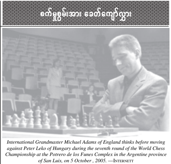
International Grandmaster Michael Adams of England thinks before moving against Peter Leko of Hungary during the seventh round of the World Chess Championship at the Potrero de los Funes Complex in the Argentine province of San Luis, on 5 October, 2005.