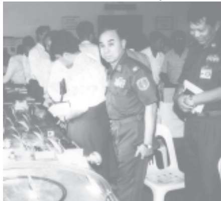
Departmental heads, experts, industrialists and guests observe machine parts. — MNA

Guests including Deputy Minister for Rail Transportation Thura U Thauung Lwin, Deputy Minister for Labour Brig-Gen Win Sein, officials, technicians and industrialists studied machine parts displayed at the show. Industry-2 Ministry officials also replied to queries raised by the visitors. — MNA