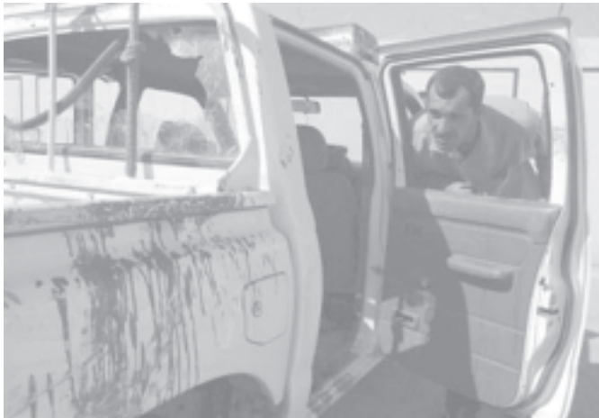
An Iraqi man examines a blood stained police patrol car in Kirkuk, Iraq, on 3 Oct, 2005.