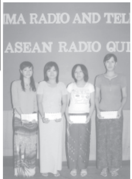
Winners of ASEAN quiz seen after the prize presentation ceremony.