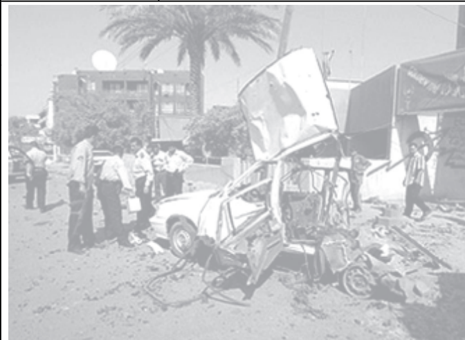
Iraqi policemen secure the site where a car bomb exploded in central Baghdad on 5 Oct, 2005.

The United States largely justified the invasion by charging that Saddam Hussein possessed weapons of mass destruction and was actively pursuing nuclear arms.