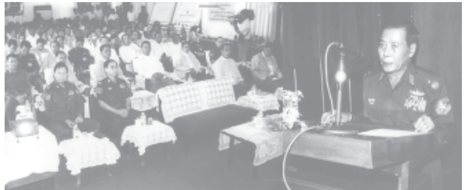
Minister Maj-Gen Saw Lwin delivers a speech at the ceremony to display machine parts manufactured by the Ministry of Industry-2.

The ceremony opened with the address of Minister for Industry-2 Maj-Gen Saw Lwin saying that as smelting technology, lathe, mould and die, finishing machines, rubber processing methods and electronic technologies are developing with greater momentum, means should be found to manufacture machine parts required by the ministry, based on the newly acquired technologies and innovations. The show will help integrate the experiences and expertise of senior technicians of ministries, research findings and innova-