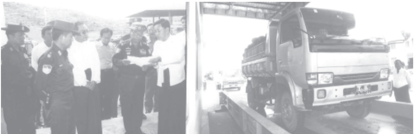
SPDC Member Lt-Gen Maung Bo inspects weighing of a vehicle of Yuzana Co Ltd.

Emergence of the State Constitution is the duty of all citizens of Myanmar Naing-Ngan.