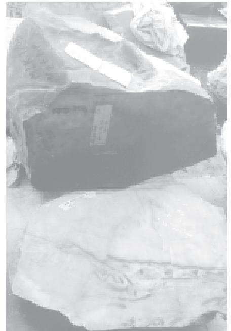
A pair of cut jade stones at the emporium. — NLM