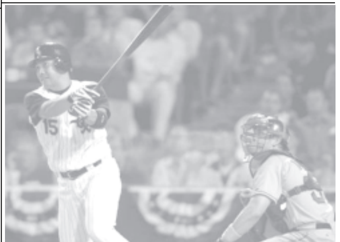
Chicago White Sox batter Tadahito Iguchi (15) from Japan and Boston Red Sox catcher Jason Varitek (R) watch as Iguchi's three run home run in the fifth inning gives the White Sox a 5-4 lead in the American League Division Series in Chicago on 5 October, 2005. White Sox won the game 5-4 and leads the series two games to none.