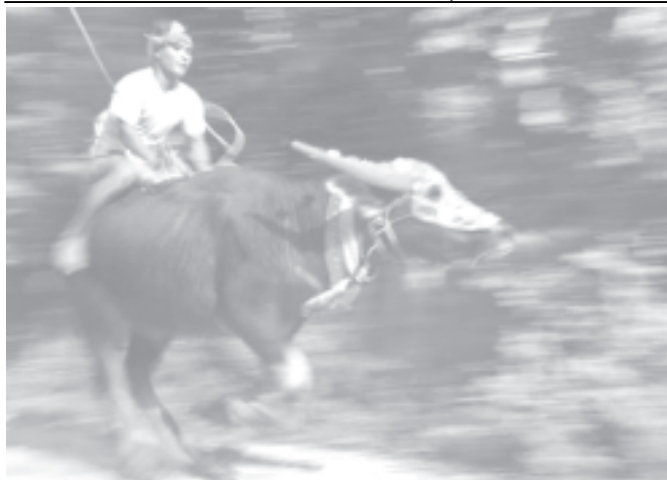
A Cambodian man rides on his buffalo during an annual buffalo racing ceremony at Virhear Sour Village in Kandal Province, 50 kms (31 miles) northwest of Phnom Penh, recently.

"Unless the economic outlook improves, we may see further reductions in planting for 2006," he added. Britain grain analysts expect that some marginal wheat area will not be planted for the 2006 harvest due to low grain prices and rising energy and fertilizer costs.— MNA/Reuters