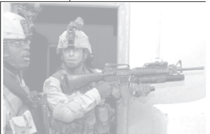
US soldiers conduct an overnight raid in the city of Tikrit, 170 kms north of Baghdad on 5 Oct, 2005.—INTERNET

Katrina and Rita and would continue to operate a zero-tolerance policy in all such cases.—MNA/Reuters