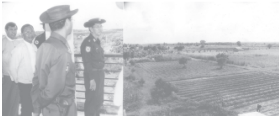
Maj-Gen Myint Swe inspects Yangon Division's farming zone in Hmawby Township, Yangon North District.

YANGON, 6 Oct — Maj-Gen Myint Swe, Chairman of Yangon Division Peace and Development Council and Commander of Yangon Command, accompanied departmental officials, inspected Yangon Division Vegetable Cultivation and Poultry Farming Special Zone near Nyaungnapin Village of Hmawby Township yesterday afternoon.