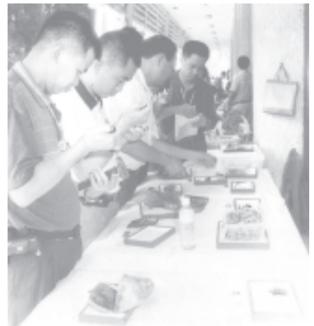
Merchants inspect jade lots.