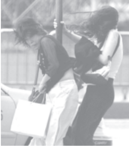
Two women in Taipei battle strong winds from Typhoon Longwang by holding onto a pole recently.