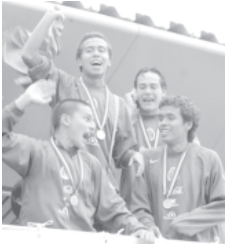
Mexico's U-17 players celebrate as they arrive at the international airport in Mexico City on 3 October, 2005. The team won the U-17 World Cup soccer championship Peru 2005 against Brazil at the National Stadium in Lima on 2 October.

LIMA (Peru), 4 Oct—Mexico scored twice in two minutes to set up a stunning 3-0 victory over defending champions Brazil to capture the FIFA Under-17 World Championship on Sunday.