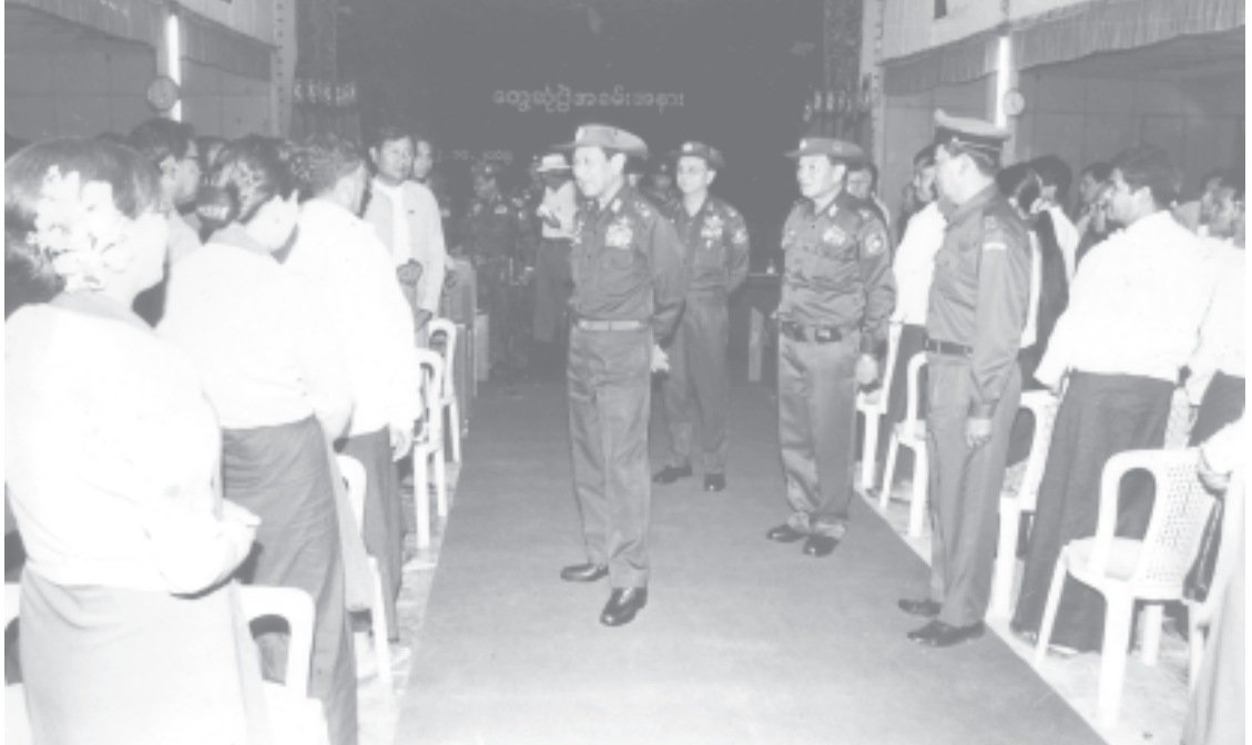
Vice-Senior General Maung Aye cordially greets departmental officials, members of social organizations, and townselders in Mogok.