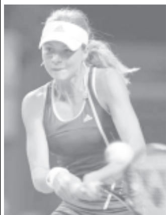
Russia's Maria Kirilenko returns a shot to Ayumi Morita of Japan at the first round of the Japan Open tennis championship in Tokyo on 4 October, 2005. Kirilenko won the match 6-4, 6-4.