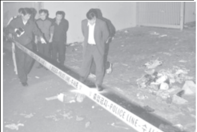
South Korean police officers investigate the cause of a music concert stampede at the stadium in Sangju, southeast of Seoul, on 3 Oct, 2005.