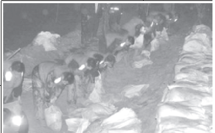
Chinese soldiers move sandbags to strengthen a dyke upon the approach of Typhoon Longwang in Xiamen, east China's Fujian Province, on 2 Oct, 2005.