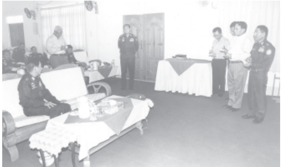
Vice-Senior General Maung Aye gives instructions on Yeywa Hydropower Project to the officials.

Vice-Senior General Maung Aye and party in-