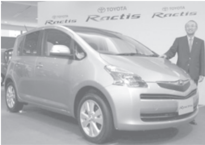
Toyota Motor Corp President Katsuaki Watanabe stands beside Toyota's new compact car model Ractis in Tokyo on Monday, 3 Oct, 2005.