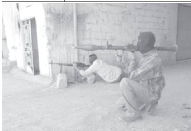
Suspected militants hold weapons in the streets of Ramadi, Iraq, on 3 Oct, 2005.