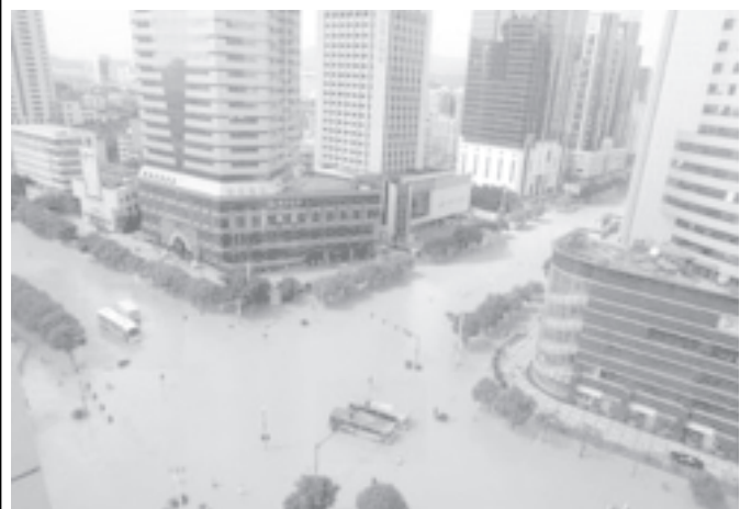
A general view of the flooded city centre of the Chinese city Fuzhou in Fujian Province, eastern China, on 3 October, 2005 after it was hit by Typhoon Longwang.