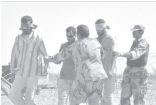
Iraqi army soldiers lead blindfolded prisoners in Baqouba, Iraq, on 3 Oct, 2005.

The 15th Foreign Ministers' Meeting of the Central Asia Economic Cooperation Organization was held in Kazak capital of Astana on Saturday. An agreement was passed during the meeting on strengthening economic cooperation in the next 10 years among the organization's member states, in the fields of trade, investment, telecommunications, energy, finance, agriculture, industry, transportation, tourism and environmental protection.—MNA/Xinhua