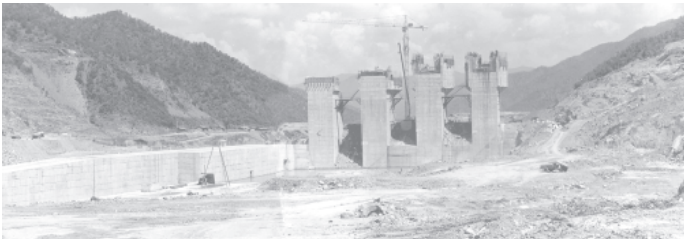
The power intake of Yeywa Hydropower Project on Myitnge River.

According to the data collected in 2003, there are 287 RCC dams in the world. The RCC dam of Yeywa hydel power project will be one of the largest ones in the world. Vice-Senior General Maung Aye and party arrived back here in the evening.—MNA