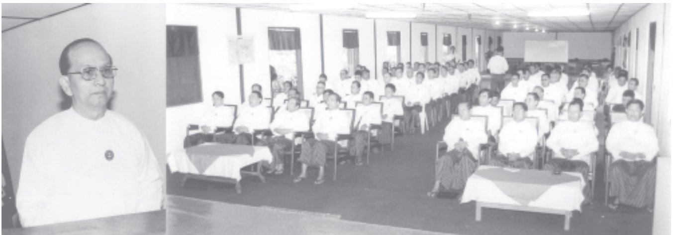
Secretary-1 Adjutant-General Lt-Gen Thein Sein addresses the opening of Advanced Organizing Course No 7/2005.