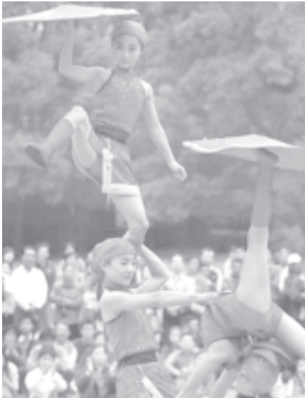
Acrobats from the Xinxiang Acrobat Group perform at a park in Nanjing, east China's Jiangsu Province, on 3 October 2005. — INTERNET