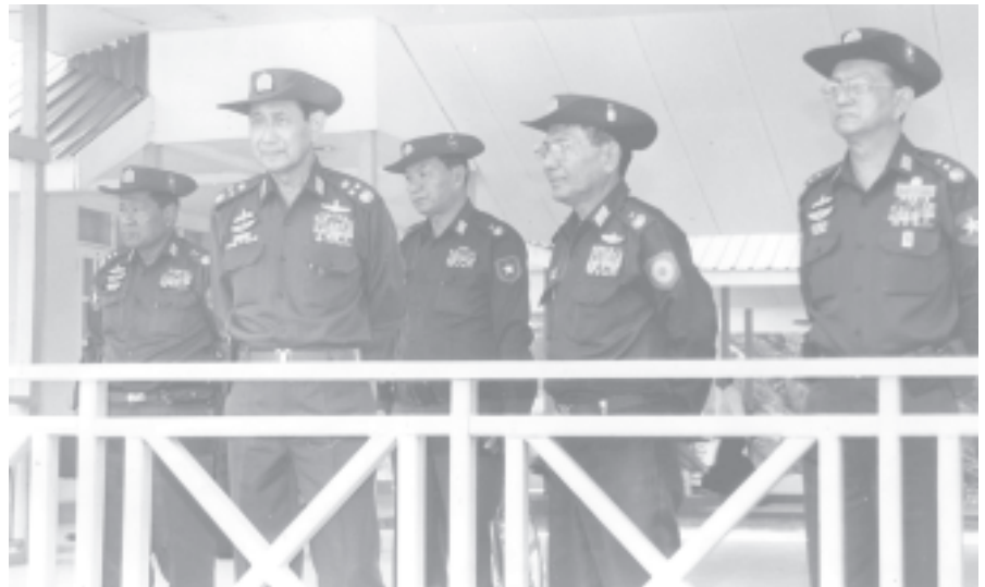
Vice-Senior General Maung Aye inspects Yeywa Hydropower Project.