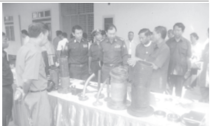
Deputy Minister for Energy Brig-Gen Than Htay inspects local-made spare parts and accessories on display.