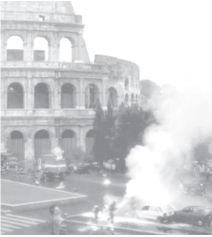
Italian firefighters put out the fire caused by the simulated explosion of a suicide bomber in front of Rome's ancient Colosseum on 3 October, 2005.