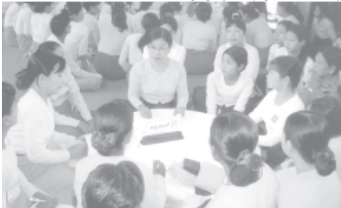
Members of Taninthayi Division, District and Township Women's Affairs Organization at the round table discussions on education, health and social affairs.

Next, the members of WAO viewed free health care services to local people given by specialists and they