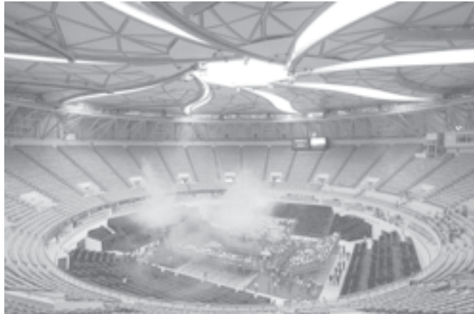
General view of the opening ceremony of Shanghai Qizhong Tennis Center on 3 Oct, 2005 in Shanghai, China.

Both sides are under pressure to sort out immigration chaos on Europe's only land borders with Africa.