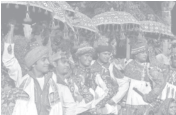
Indian men take part in rehearsals for the 'garba' dance ahead of Navratri festival in the western city of Ahmedabad, India on 1 October, 2005.