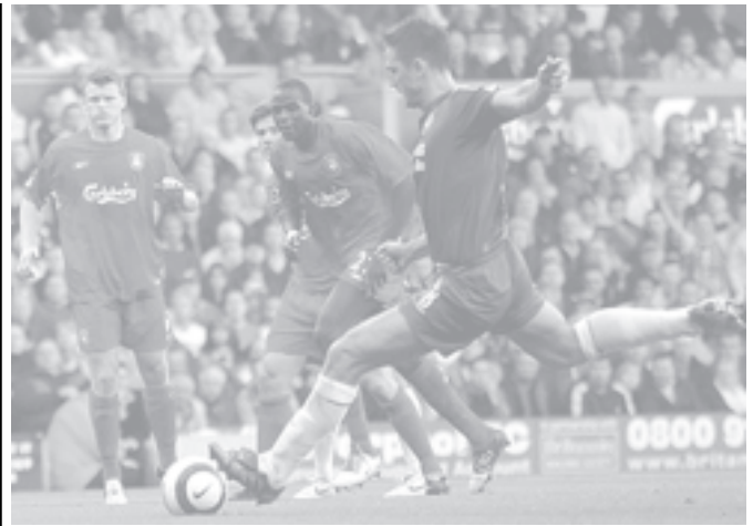
Chelsea's Frank Lampard (R) scores from a penalty, after a foul against teammate Didier Drogba during their Premiership match against Liverpool at Anfield football grounds. Chelsea won 4-1.