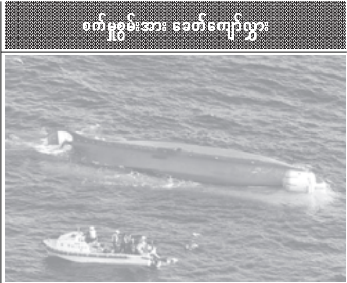
Japanese Coast Guardsmen, on a boat, front, approach the capsized No 3 Shinseimaru on waters off Nemuro, a port on Japan's northernmost main island of Hokkaido, recently.