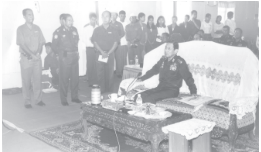
Vice-Senior General Maung Aye gives instructions on durability of Ayeyawady Bridge (Yadanabon).—MNA

Later, Vice-Senior General Maung Aye and party also inspected the construction of road around Taungthaman Lake and development of Mandalay in a motorcade. — MNA