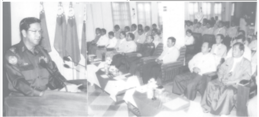
Minister Maj-Gen Hla Tun delivers a speech at the opening of Course No 26 for Township revenue officers.

Also present were Deputy Minister Col Hla Thein Swe, Vice-Governor of Central Bank of Myanmar U Than Nyein, Director-General of IRD U Hsan Tun and officials. Thirty-five trainees are attending the four-week course. — MNA