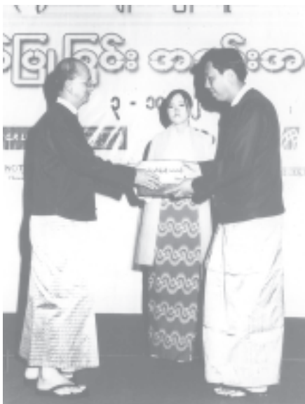
Secretary-1 Lt-Gen Thein Sein accepts cash donated by a wellwisher.

titles of the ASEAN U-18 Youth Championship-2003 and BIMSTEC YU-18 Youth Championship 2004. Selected Myanmar Youth U-20 Team also became the champion of ASEAN U-20 Youth Championship-2005 and the U-17 team also could retain its championship title for the second year.