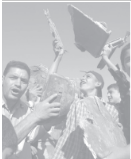
Iraqi youngsters shout holding the remains of a US military vehicle destroyed by a roadside bomb in Ramadi, Iraq, on 1 Oct, 2005. — INTERNET