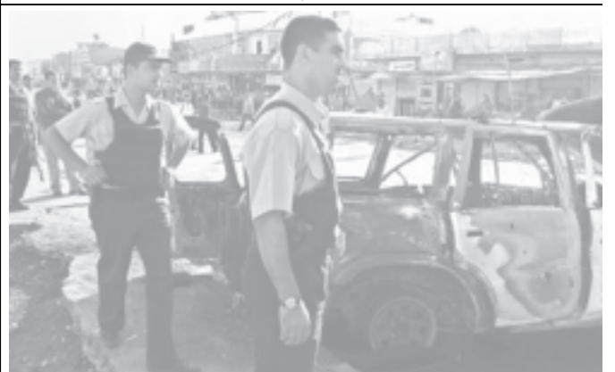
Iraqi police stand at the scene of a roadside bomb attack in the oil-rich city of Kirkuk, 250 km north of Baghdad on 1 October, 2005.