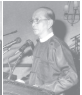
Secretary-1 Lt-Gen Thein Sein delivers a speech at a ceremony to honour the Selected Myanmar Youth Soccer Team who won AFF U-17 Youth Championship-2005.