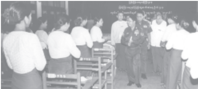
Information Minister Brig-Gen Kyaw Hsan meets with trainees at the opening ceremony of the Work Efficiency Course (Officer) No 3/ 2005 of IPRD.

3,1924 rural self-reliance libraries have been opened in the country.