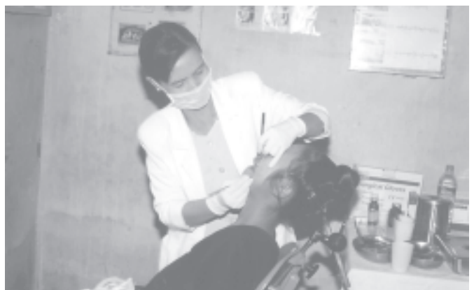
A specialist gives treatment to a patient in Hsaikkaung village, Hsiseng Township.

officials went right down to the grassroots level and held roundtable discussions. They gave talks on health and rural development. In the time of the State Peace and Development Council, people living in Hsaikkaung village are now enjoying fruits of rural development undertakings carried out by the government and the people harmoniously.