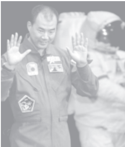
Japanese astronaut Soichi Noguchi, who orbited the earth on a Discovery mission, waves to a gathering at a Tokyo theater, on 1 Oct, 2005. Noguchi, a mission specialist, and other astronauts spent 15 days in the space aboard shuttle Discovery. They are to make a 'victory parade' in Noguchi's home town of Chigasaki.