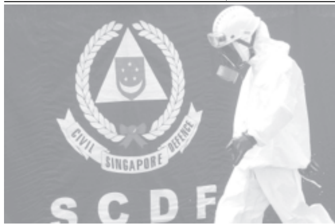
A member of the Singapore Civil Defence Force wears a chemical protection suit during an annual chemical spill exercise in Singapore recently.