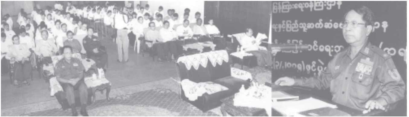
Minister for Information Brig-Gen Kyaw Hsan addresses at the opening ceremony of the Work Efficiency Course (Officer) No 3/ 2005 of IPRD.

YANGON, 3 Oct— A ceremony to open Work Efficiency Course (Officer) No 3/ 2005 of Information and Public Relations Department under the Ministry of Information took place at the News and Periodicals Enterprise on Pansodan Street this afternoon with an address by Minister for Information Brig-Gen Kyaw Hsan.