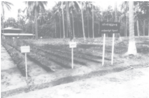
Lt-Gen Maung Bo inspects rubber and pepper cultivation in Kawthoung.

taken for growing of oil palm and rubber in the district, progress of cultivation of oil palm and rubber in 2005-2006 and measures being taken for extended cultivation of oil palm and rubber.