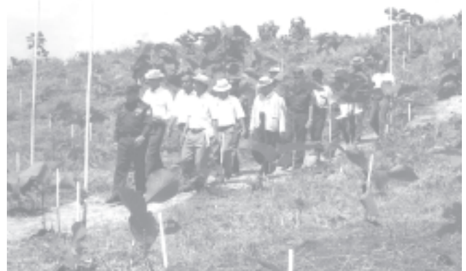
Minister Brig-Gen Thein Aung inspects teak plantations in Htigyaing Township. — FORESTRY

Minister Brig-Gen Thein Aung on 1 October went to the 850-acre teak plantation at Nantmae Reserved Forest in Mabein Township in Shan State (North) to