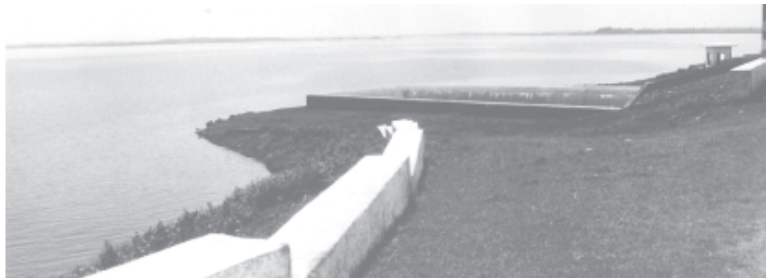
Water storage of Taungnawin Dam in Paukkaung Township, Pyay District.—MNA

In Bago Division (West), over 1.1 million acres of land have been put under monsoon paddy out of 1.2 million acres and preparations are to be made to grow edible oil crops and beans and pulses.