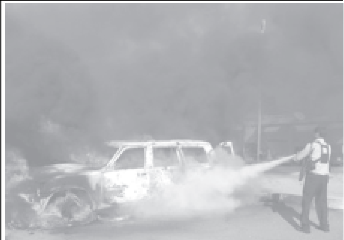
An Iraqi policeman attempts to put out a burning police patrol car in Kirkuk, Iraq, on 1 Oct, 2005.