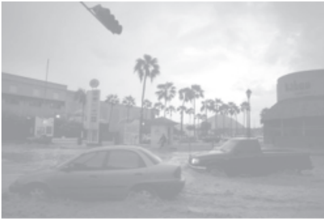
Cars drive through a flooding area in downtown Cabo San Lucas as Hurricane Otis passes 130 miles south west on 1 Oct, 2005, in South California, Mexico.