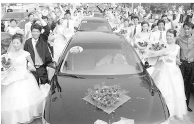
56 couples from east China's Shanghai Municipality, Jiangsu Province, Zhejiang Province and other places attend a group wedding ceremony in Kunshan, east China's Jiangsu Province, on 1 October, 2005. Lots of couples chose to get married on Saturday, China's National Day.