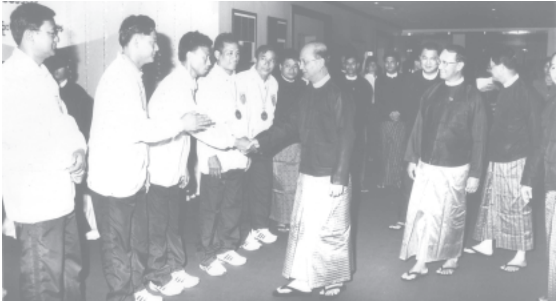
Secretary-1 Lt-Gen Thein Sein greets coach, manger and footballers of victorious Myanmar U-17 football team.

Myanmar soccer team had not won the championship title for 30 years. It was in 2002 that Myanmar youth soccer team became a champion of ASEAN U-17 Youth Championship-2002. The youth team also grasped the championship