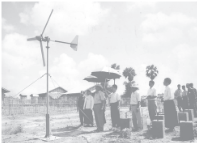
Minister U Aung Thuang inspects War Veteran Model Village No 2 in Hmawby Township.