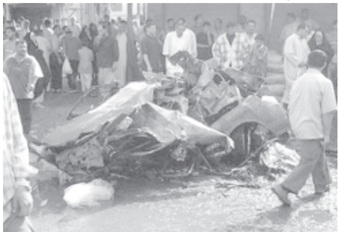
A destroyed vehicle sits near a market after a car bomb exploded in the southern Iraq town of Hilla, 100 km (62 miles) south of Baghdad, on 30 September, 2005.