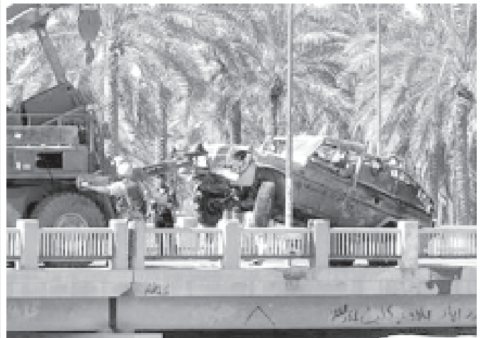
A damaged Danish Army patrol car is towed from a bridge in Basra, Iraq, on 1 Oct, 2005.