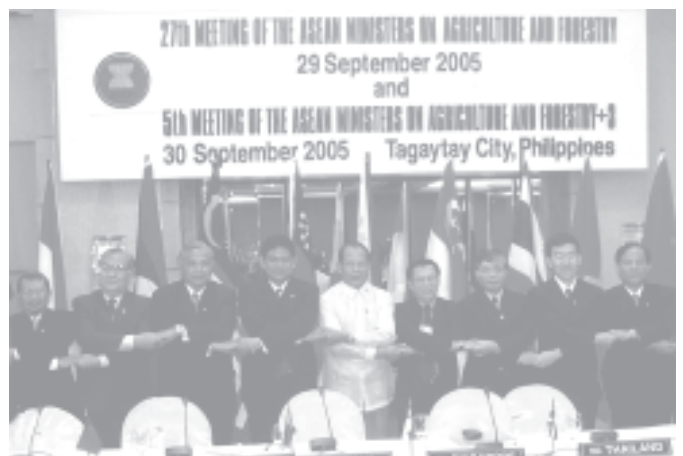
Minister Maj-Gen Htay Oo poses for a documentary photo together with ASEAN ministers on agriculture and forestry.

The meeting elected Minister of Agriculture of the Philippines Mr Domingo F Pan Ganiban as the meeting chairman and Minister of National Development of Singapore Mr Mah Bow