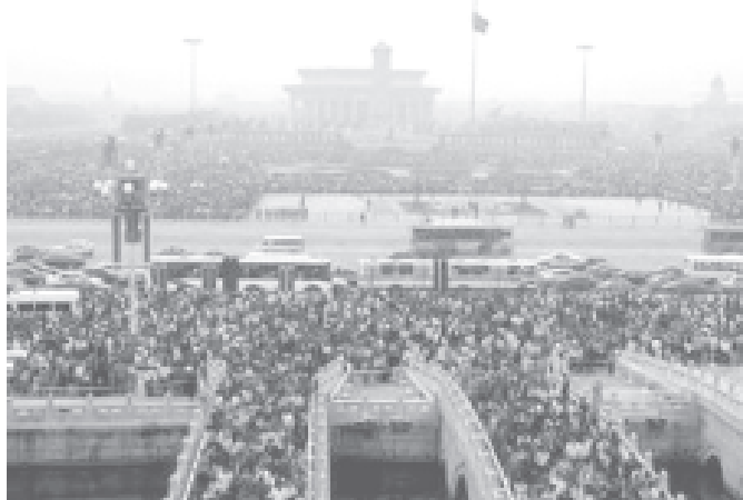
Chinese people gather at Tiananmen Square to celebrate the 56th anniversary of the founding of the People's Republic of China in Beijing on 1 Oct, 2005.

Besides, China has actively taken part in the United Nations affairs and carried out international cooperation on anti-terrorism, arms control, peace-keeping, development, human rights, law enforcement and environmental protection. MNA/Xinhua