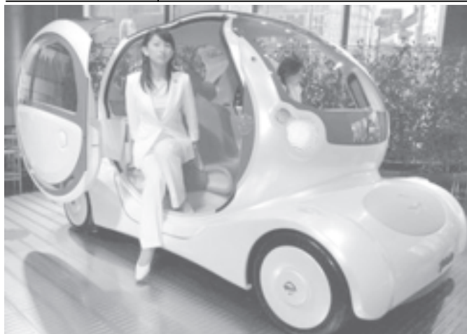
Nissan Motor's concept car 'Pivo', featuring an egg-shaped cabin atop a wheeled platform that can swivel around 360 degrees, is unveiled in Tokyo on 30 September, 2005 during a press preview for the upcoming Tokyo Motor Show 2005.