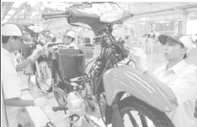
Workers assemble motorcycles at a Honda plant in Cikarang, West Java, Indonesia, on 30 September, 2005.