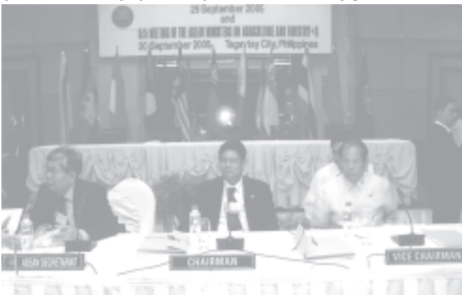
Minister Maj-Gen Htay Oo chairs the 5th Meeting of the ASEAN Ministers on Agriculture and Forestry+3. — A & I