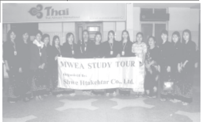
MWEA study tour group seen at the airport before their departure for KL, Malaysia.

The best time to plant a tree was 20 years ago. The second best time is now.