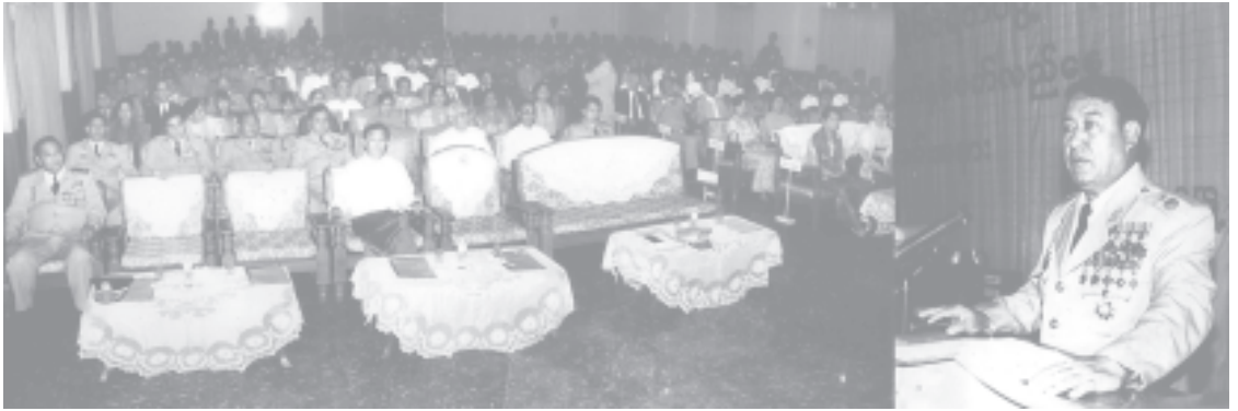
Minister for Home Affairs delivers a speech at the 41st Anniversary of MPF.

YANGON, 2 Oct— The ceremony to mark the 41st Anniversary of Myanmar Police Force was held at Drugs Elimination Museum at the corner of Kyundaw Street and Hanthawady Road in Kamayut Township here yesterday morning. Minister for Home Affairs Maj-Gen Maung Oo attended the ceremony and presented awards to outstanding members of MPF.