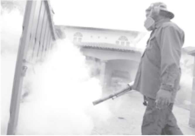
A municipal council worker dispenses insecticide using a fogging machine at a residential suburb in Shah Alam, near Kuala Lumpur, Malaysia, on 30 September, 2005.