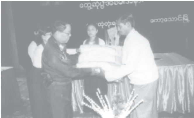
Lt-Gen Maung Bo presents mosquito nets to chairman of Pulon-tone-tone Ward PDC U Hsar Dat.—MNA

rural health centre, Lt-Gen Maung Bo and party viewed free medical treatment given to the