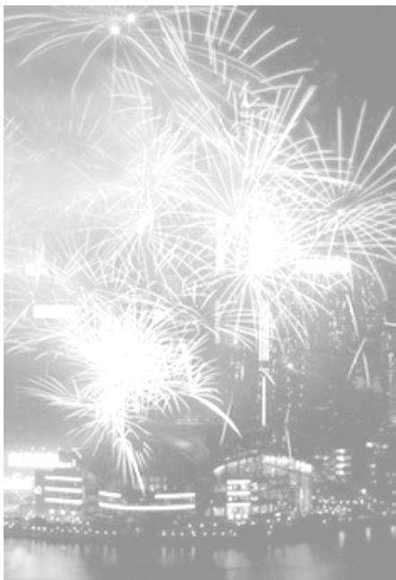
Firework explodes over Victoria Harbour in Hong Kong on 1 October, 2005 as celebrating China National Day. —INTERNET

With the completion of the construction of the new complex, Samsung targets 61 billion dollars in earnings from total semiconductor sales in 2012, compared with 16.2 billion dollars in 2004, said the statement. — MNA/Xinhua