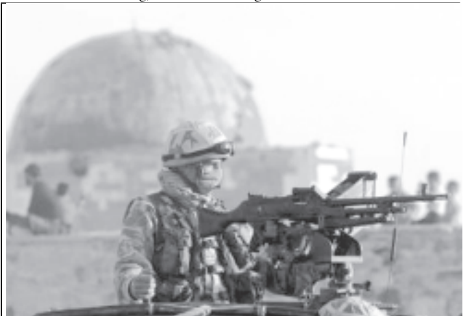
A British soldier from the International Security Assistance Force (ISAF) mans a machine gun atop a military vehicle in Kabul on 30 September, 2005.