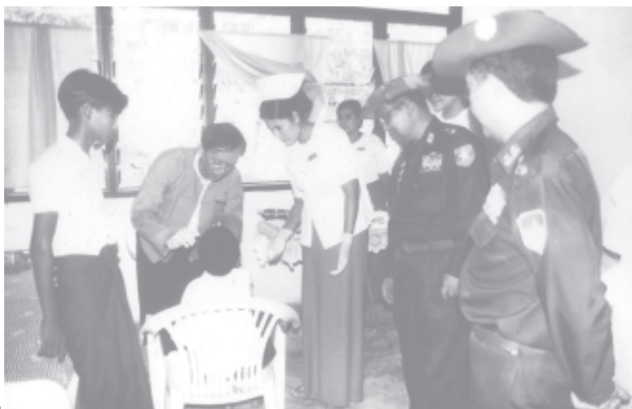
Lt-Gen Maung Bo views free medical treatment given at Pulon-tone-tone Village in Kawthoung.

Emergence of the State Constitution is the duty of all citizens of Myanmar Naing-Ngan.