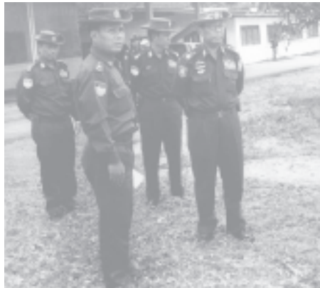
Lt-Gen Maung Bo and party view Pulon-tone-tone Beach.