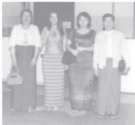
Two students of the Yangon Institute of Medicine-1 seen at the airport before departure for the Philippines.