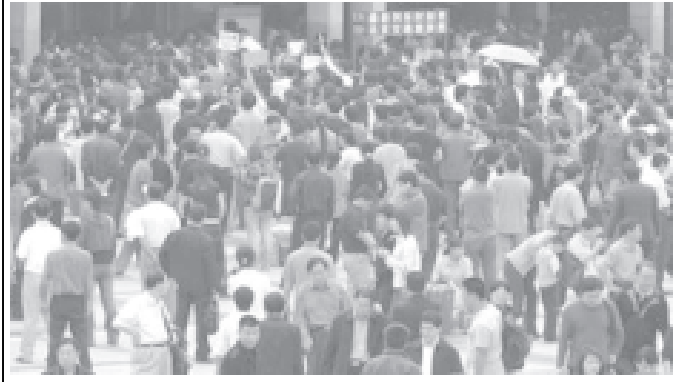
Travellers pass through Beijing Railway Station on the eve of the country's National Day, on 30 September, 2005.