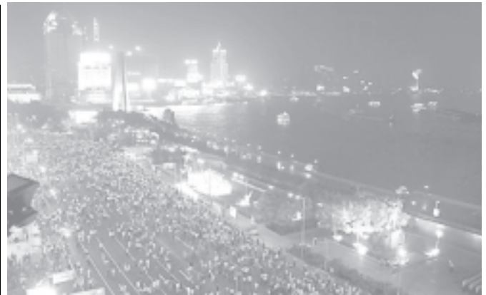
Citizens of Shanghai crowded in the waterfronts of the Huangpu River on the eve of the National Day on 30 September, 2005. China celebrates its 56th anniversary of the founding of the People's Republic of China on 1 October, 2005.