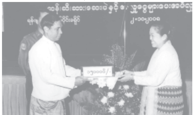
A wellwisher presents cash for Mary Chapman's School for the Dumb Yangon West District through Headmistress of Mary Chapman's School for the Dumb.

Afterwards, officials accepted donations of Yangon East District PDC and Thingangyun Township PDC, Yangon East District Maternal and Child Welfare Supervisory Committee, the iodized salt of Myanma Salt (See page 11)