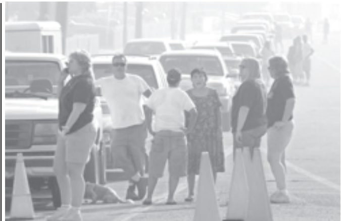
Residents stand amidst dense smoke as they wait to return to their neighbourhoods following wildfires in the Bell Canyon and Woolsey Canyon areas, on 30 September, 2005, in Los Angeles.