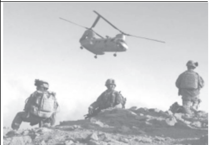
US soldiers establish security after landing in a Chinook helicopter near Baghdad during Diablo X , an operation that includes Marines, in this military handout photo released on 28 September, 2005.