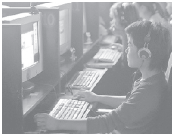
People surf the Internet at a cybercafe in Chengdu city, in China's southwestern province of Sichuan recently.