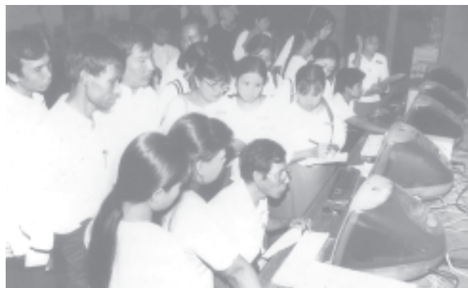
Trainees of Journalism Course No 1/2005 studying at computer room of Myanma Alin Daily.