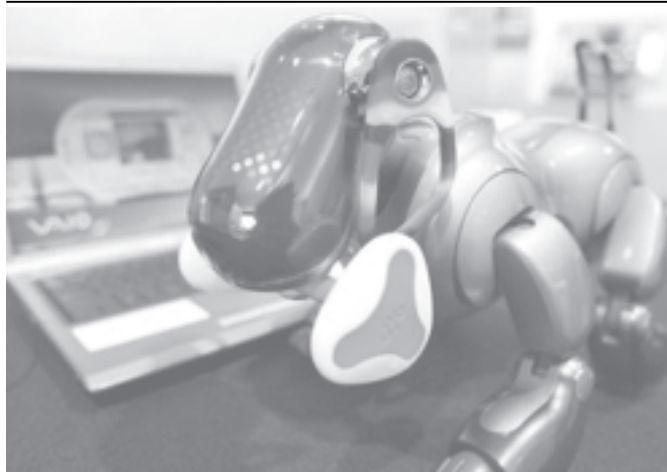
Sony Corporation's latest Aibo robot model ERS7M3 holds a bone next to a laptop computer displaying a diary kept by the pet robot at Sony Showroom in Tokyo on 29 September, 2005.