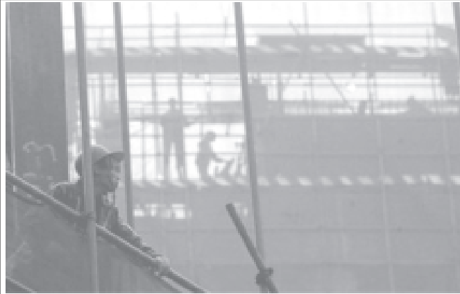
A Chinese worker looks out from scaffolding at a construction site in Beijing, China, on 29 September, 2005.