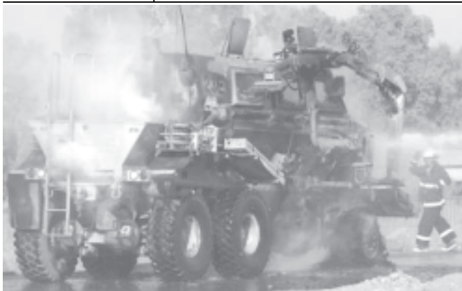
Iraqi firemen extinguish a US Army Buffalo armoured personnel carrier after it hit an improvised explosive device (IED) in Baghdad on 29 September, 2005.