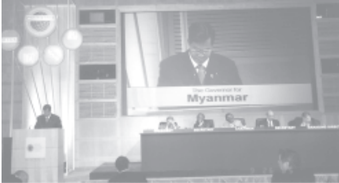
Minister for Finance and Revenue Maj-Gen Hla Tun explains financial matters and economic development of Myanmar at 60th Conference of IMF and WB.

YANGON, 30 Sept— Minister for Finance and Revenue Maj-Gen Hla Tun and party attended the 38th SEA Voting Groups at the hall of the BOD of World Bank, Washington DC, on 23 September morning.