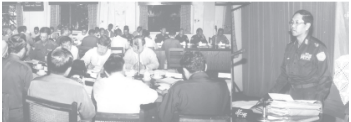
Commander Maj-Gen Myint Swe addresses the coordination meeting of Yangon Division Supervisory Committee for Ensuring Smooth and Secure Transport.