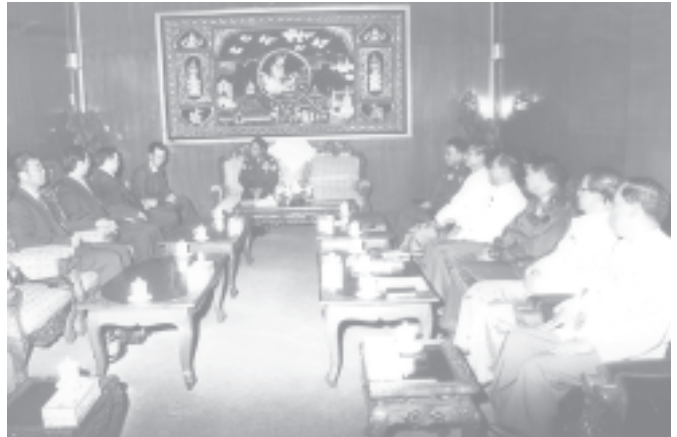
Minister for Information Brig-Gen Kyaw Hsan receives Chinese Ambassador Mr Li Jinjun.