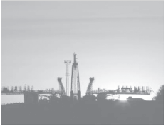
A silhouette of the launching pad ready for the Russian Soyuz TMA-7 rocket is seen against the rising sun at Baikonur cosmodrome in Kazakhstan on 29 September, 2005.