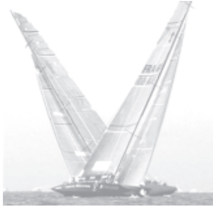
K-Challenge (FRA60), front, and Mascalzone Latino (ITA77) in action during their match race in the Louis Vuitton Act 8 of the 32nd America's Cup, on 29 September, 2005, off the Sicilian port town of Trapani.

Weather outlook for first weekend of October 2005: During the coming weekend, rain or thundershowers will be widespread in Yangon Division and scattered in Mandalay Division.