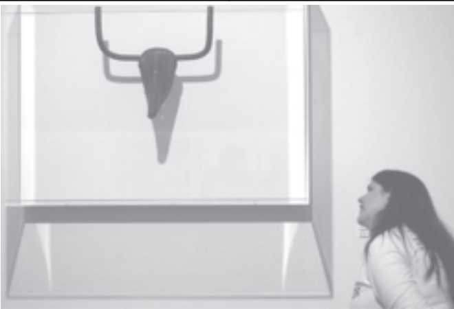
An unidentified visitor looks at a Picasso sculpture 'Bull Head' on exhibit in Berlin's Neue Nationalgalerie on 29 September, 2005. The exhibition of paintings, sculptures and other works by Pablo Picasso, that promises a glimpse of 'the private Picasso,' will open to the public on 30 September and run until 22 January, 2006. — INTERNET

It is believed to have been carrying eight crew members. The Coast Guard said it rescued one from the capsized boat while searching for the two missing crew members. — MNA/Xinhua