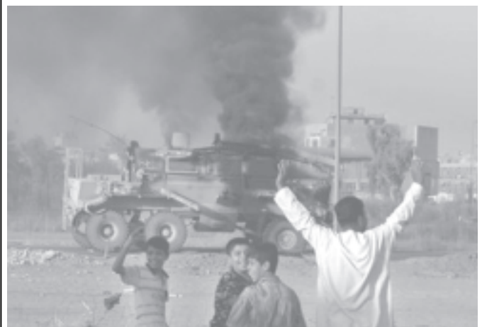
An Iraqi man raises his hands looking at a burning US military vehicle, in Baghdad, Iraq, on 29 Sept, 2005. —INTERNET

Meanwhile, more than 173 families were displaced and many of them are missing from six villages in Kanchanpur District in far-western Nepal following inundation caused by burst of a dam in the local Mahakali River on Sunday. — MNA/Xinhua