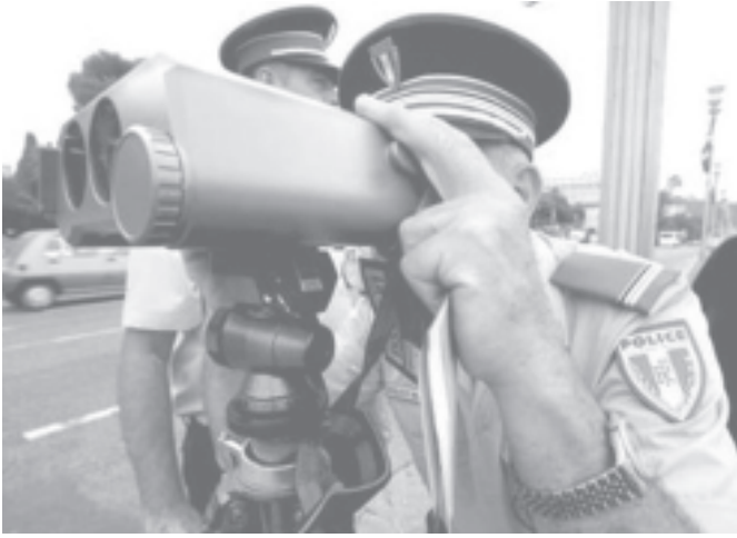
A French policeman looks through a binocular speed radar during a road safety awareness day in Nice, southeastern France, on 29 September, 2005.