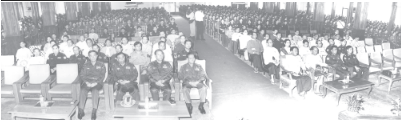
Secretary-1 Lt-Gen Thein Sein makes a concluding speech at special refresher course for teachers.

Emergence of the State Constitution is the duty of all citizens of Myanmar Naing-Ngan.