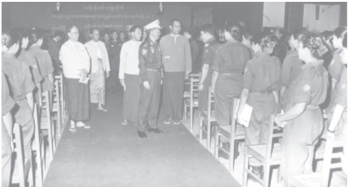
Secretary-1 Lt-Gen Thein Sein cordially converses with trainees of Special Refresher Course No 57 for Basic Education Teachers at CICS (Phaunggyi). — MNA

Today, the education sector is playing a more important role than any other sector, so all the teachers are to be firmly convinced that high education standard can serve as the engine for enhancing national strength.