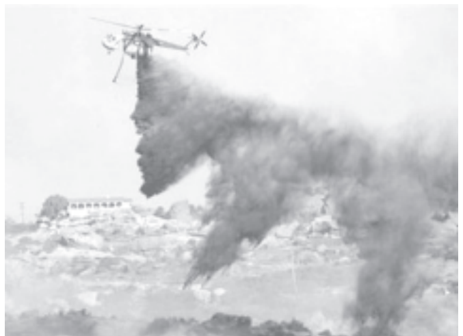
A helicopter drops fire retardant on hillsides on Thursday morning, 29 Sept, 2005, in the Chatsworth area of Los Angeles. Wind-driven brush fires are ringing huge areas of Southern California. Thousands of acres across four counties have been scorched.