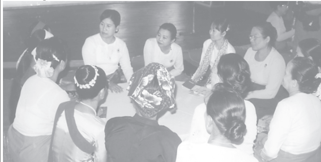
CEC member of MMCWA and members of Mon State MCWA briefing on objectives and tasks of MMCWA at Eindu Village in Hpa-an Township.