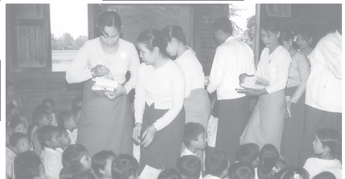
Members of USDA, WAO and MCWA distribute exercise books and pencils to school children at Thaleikkyi Village Primary School in Pyapon Township.