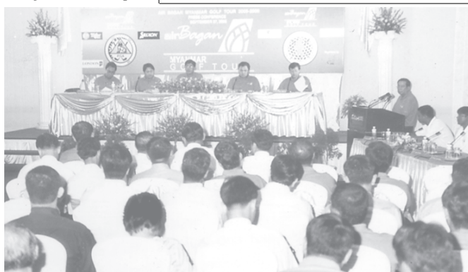
A press conference on Air Bagan Myanmar Golf Tour for 2005-2006 in progress.

nation this year, its arrangements for holding the golf tournaments all parts of the country, MGF's performance to bring up age-wise young golfers, its plans for dispatching young golfers to foreign countries to pick