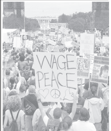
A large rally of anti-war demonstrators gather on the Ellipse near the White House (Rear) in Washington DC, on 24 September, 2005.

"After all the brinkmanship this is good news. It's good news because it will make a real difference to some of the world's poorest people." MNA/Reuters