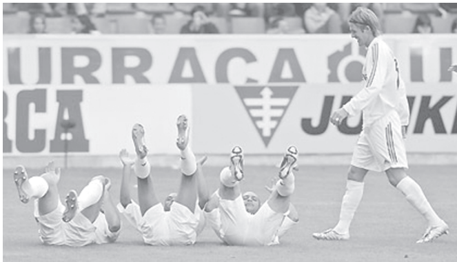
(L to R) Real Madrid's Brazilian players Ronaldo, Robinho and Roberto Carlos and David Beckham of England celebrate a goal by Ronaldo against Deportivo Alaves at the Mendizorroza Stadium in Vitoria in northern Spain on 25 September, 2005.