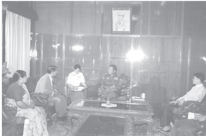
Population and Immigration Minister Maj-Gen Sein Htwa receives Bangladeshi Ambassador Mr M Khairuzaman. — MNA

Present were Deputy Minister for Immigration and Population U Maung Aung, directors-general, deputy directors-general and officials under the Ministry of social Welfare, Relief and Resettlement.— MNA