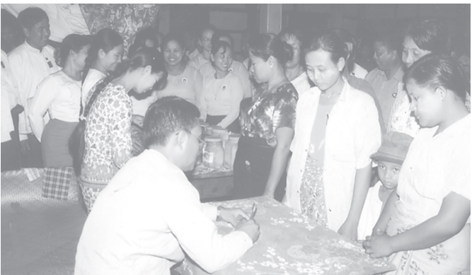
A mobile medical team comprising members of USDA, WAO and MCWA gives medical treatment to local people in Pyapon Township.