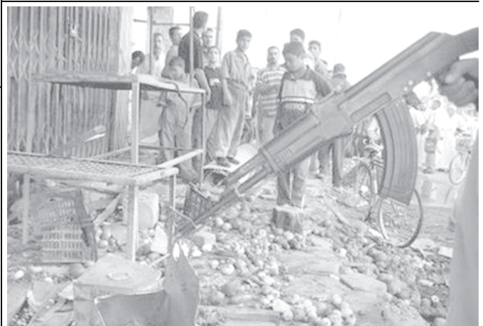
Local residents view the damage following a suicide bomb attack on a market in the Iraq town of Hilla, 100 km south of Baghdad, on 26 September, 2005.