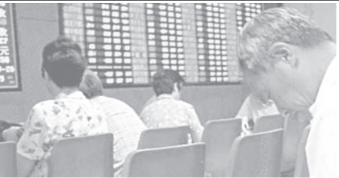
Shanghai investors examine stock index board Monday. News that more firms announced merging of their tradable and non-tradable shares cheered up the market slightly with the Shanghai Composite Index closing at 1155.04 points, up 0.27 per cent. — INTERNET