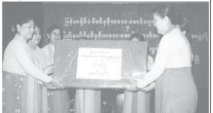
CEC Member of MMCWA hands over five bicycles to President of Kayin State MCWA.