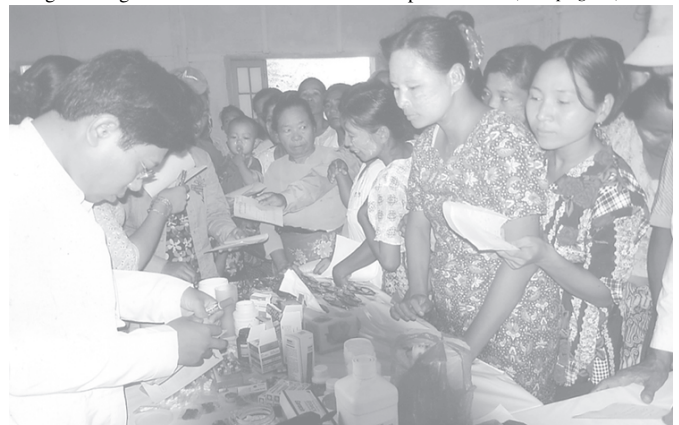
Staff of the Health Department distribute medicines to local residents in Hsinywagyi Village, Patheingyi Township.— INDUSTRY-1

During the round table discussions, salient points on WAO, health care services, prevention against human trafficking, public organization task covering adults and elderly persons, education cash assistance for the poor, presentation of WAO membership applications, medical assistance to the aged, donation of publications to the libraries, care for pregnant women, clothing assistance and prevention against dengue fever were discussed.