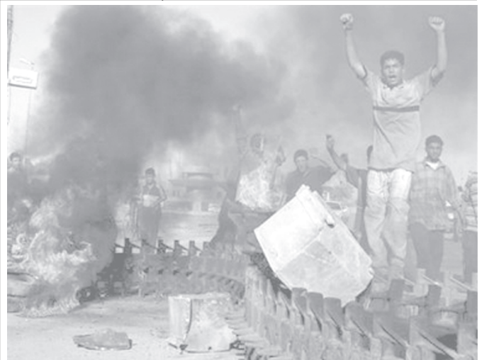
Iraqi youngsters shout standing on the remains of a US military armoured vehicle destroyed by a roadside bomb in Ramadi, Iraq, on 26 September, 2005.