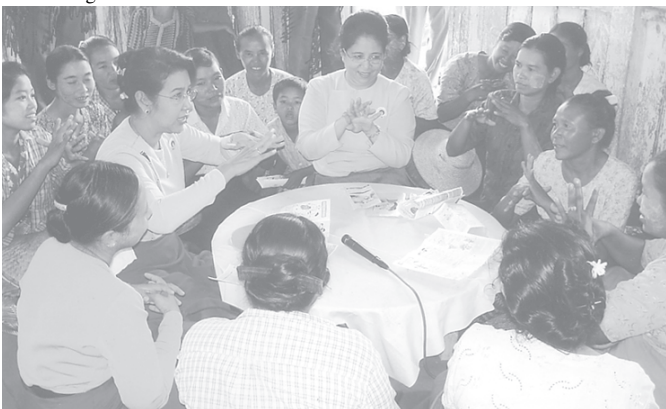
Members of Mandalay Division Women's Affairs Organization give talks on general knowledge at Hsinywagyi Village in Patheingyi Township.