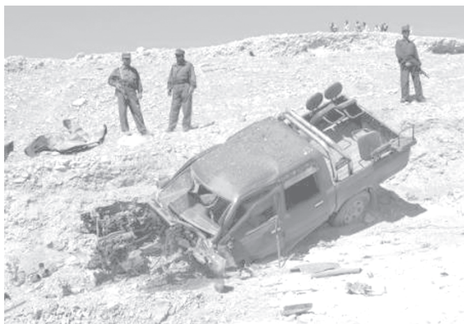
Afghan policemen stand guard near a destroyed pick up belonging to the Afghan border police in the district of Chapar Har about 30km (18 miles) south of Jalalabad City, Afghanistan, on 26 September, 2005. — INTERNET

fright. In Moyobamba, which is also a major flower and tobacco growing area, a police spokesman said the walls of some buildings had collapsed, including parts of the prison, but the inmates were accounted for. Radio reports said residents in Moyobamba, afraid of aftershocks, slept in the streets. — MNA/Reuters