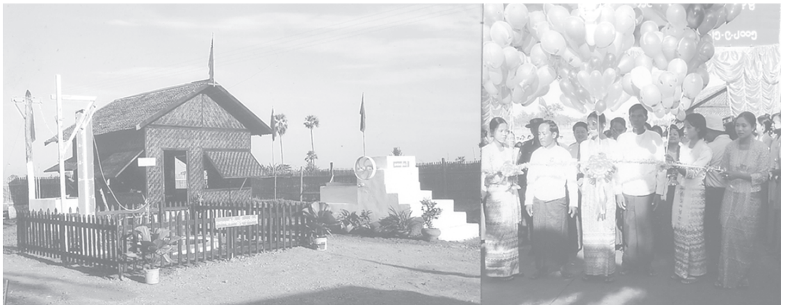
The inauguration ceremony of the bio-gas station at Ywathit Village in Patheingyi Township in progress. — INDUSTRY-1

Emergence of the State Constitution is the duty of all citizens of Myanmar Naing-Ngan.