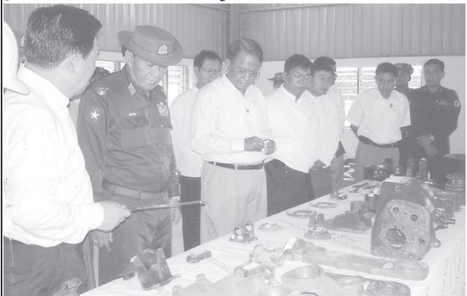
Commander Maj-Gen Khin Zaw and Minister U Aung Thaung inspect spare parts of machines produced by Myanma Industrial Zone. — INDUSTRY-1