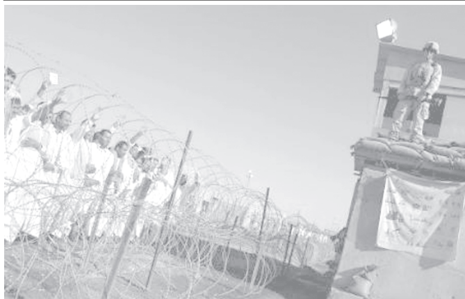
Iraqi detainees wave as they wait to be released from Abu Ghraib Prison in the town of Abu Ghraib, 33 km (21 miles) west of Baghdad on 26 September, 2005.