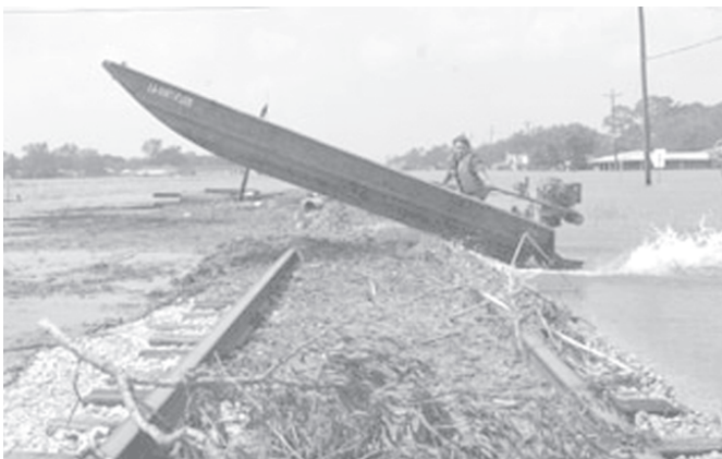
A man jumps a set of railroad tracks in his boat while navigating from one flooded area to another during a search and rescue mission for flooded residents caught in the storm surge following Hurricane Rita, in Delcambre, Louisiana, on 25 September, 2005.—INTERNET

The lawmaker said the USFK no longer holds nuclear weapons, which have since been moved off the Peninsula following the 1992 inter-Korean accord stating that neither side would allow, maintain or develop nuclear weapons in their countries.— MNA/Xinhua