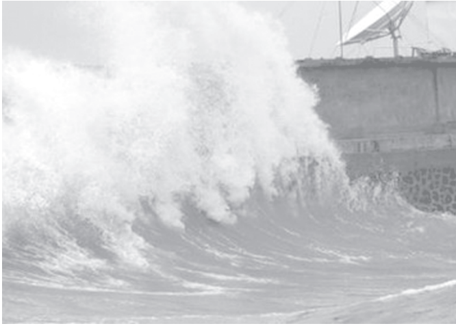
Waves caused by Typhoon Damrey hit a dock in Haikou, south China's Hainan Province, on 26 September, 2005.