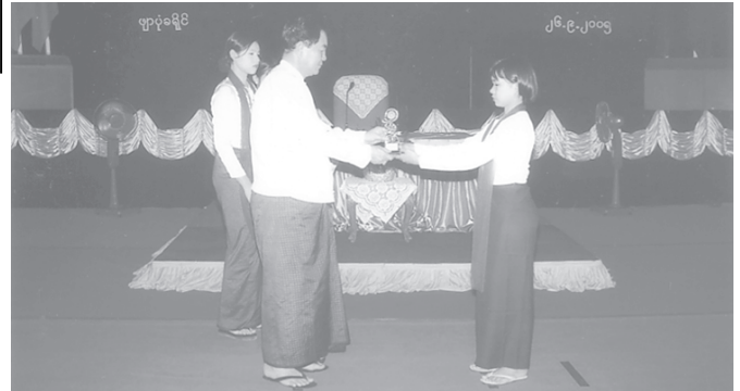
Minister Col Thein Nyunt presents a prize to an outstanding student at Pyapon District USDA's annual general meeting.