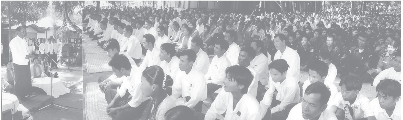
Minister U Aung Thuang meeting with local residents at Hsinywagyi Village in Patheingyi Township, Mandalay Division.

Development Associations, the five rural development tasks have been launched in the region, where Ywathit and Hsinywagyi villages in Patheingyi Township have emerged together with villages of other ar-