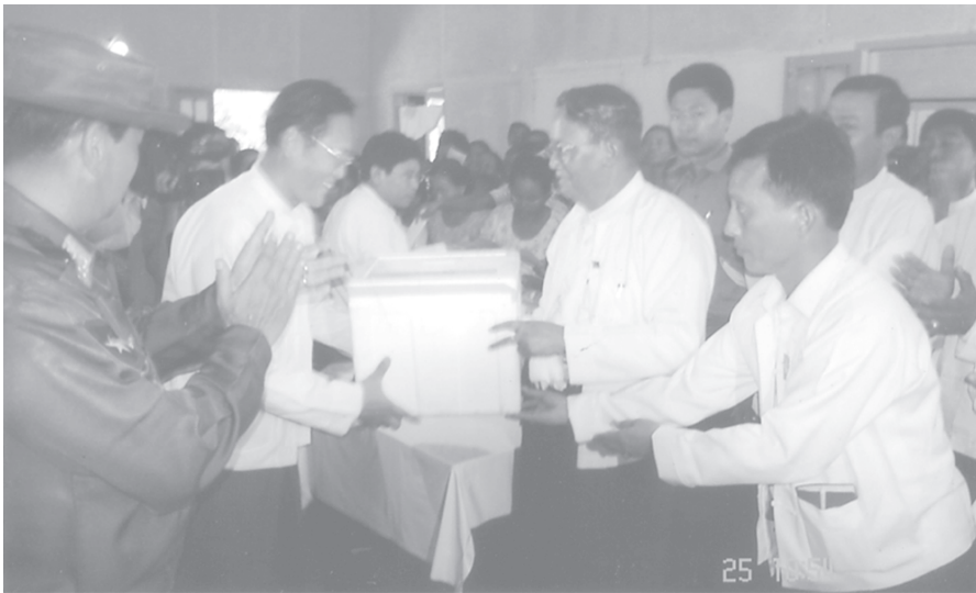
Minister U Aung Thuang presents anti-venom to the rural health centre in Hsinywagyi Village, Patheingyi Township. — INDUSTRY-1