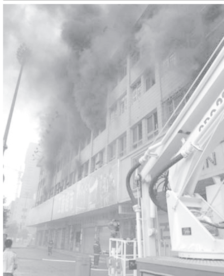
Heavy smoke billows out of a commercial building on fire in Changsha, central China's Hunan Province on 26 September, 2005.