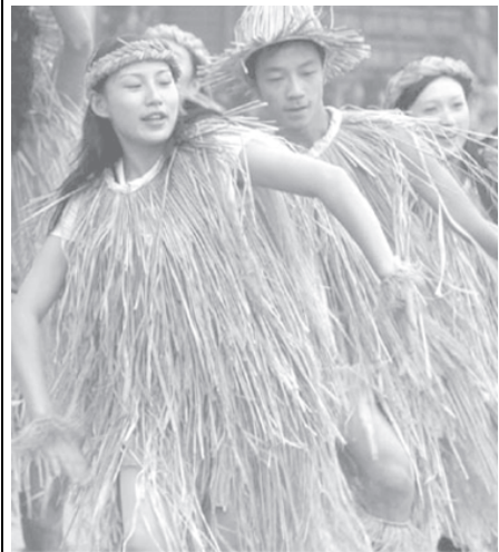
Chinese dancers perform during the opening ceremony of the 6th Yichang Three Gorges International Tourism Festival in Yichang, Central China's Hubei Province on 25 September, 2005.