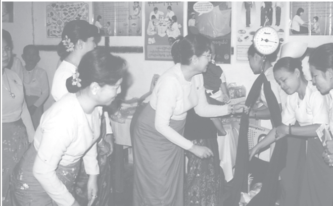
Members of MMCWA and Mon State MCWA supervise giving medical check-up to children at Eindu Village in Hpa-an Township. (from page 16)