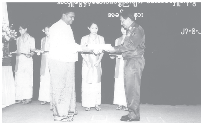
Minister Maj-Gen Sein Htwa accepts donation made by a wellwisher.

Wellwishers donated over K 11.47 million, 50