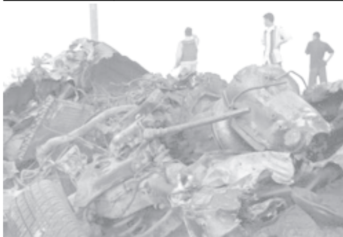
Men view the wreckage of vehicles after a suicide car bomb attack in the southern Iraq city of Musayib, 65km (40 miles) south of Baghdad, on 24 September, 2005.