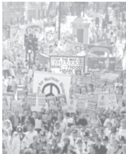
Anti-war protesters pass along Whitehall in London during a demonstration against the conflict in Iraq, on 24 September, 2005. — INTERNET

Britain's Ministry of Defence said the warrants had no legal basis. "All British troops in Iraq come under the jurisdiction of Britain," a defence spokesman said in London. — MNA/Reuters