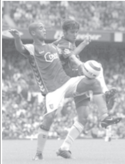
Aston Villa's Luke Moore, left, fights off a challenge from Chelsea's Paulo Ferreira during their English Premier League soccer match at Stamford Bridge in west London, on 24 September, 2005.

LONDON, 25 Sept — Chelsea's Frank Lampard fired the champions to a 2-1 victory over Aston Villa but there was a shock for Manchester United as they went down 2-1 at home to Blackburn Rovers on Saturday.