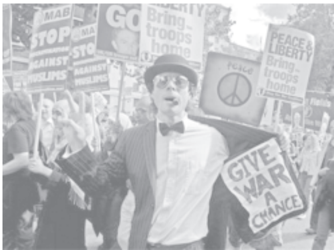
A man in a bowler hat flashes a 'V' for victory sign as he unveils a 'Give War A Chance' banner, attached to the inside of his jacket, while he marches with 'The War' protesters, in a demonstration in central London against the conflict in Iraq, on 24 September, 2005.