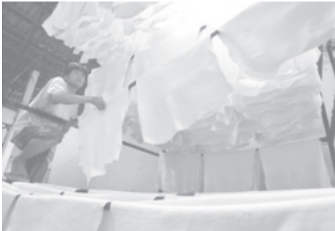
A Thai worker dries rubber sheets in the village's co-operative in Yala Province, 1,084 km (672 miles) south of Bangkok, on 24 September, 2005. —INTERNET

The industrial enterprises in the petroleum refining and coking sectors reported an economic losses of 8 billion yuan in the January-August period.—MNA/Xinhua