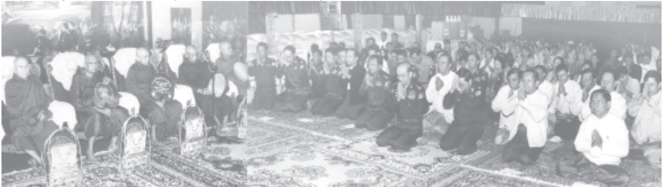
Secretary-1 Lt-Gen Thein Sein and party takes the Five Precepts from the Sayadaw at the donation ceremony for monasteries and nunneries in Thingangyun Township.

mand Maj-Gen Myint Swe, Minister for Social Welfare, Relief and Resettlement Maj-Gen Sein Htwa, Minister for Religious Affairs Brig-Gen Thura Myint Maung,