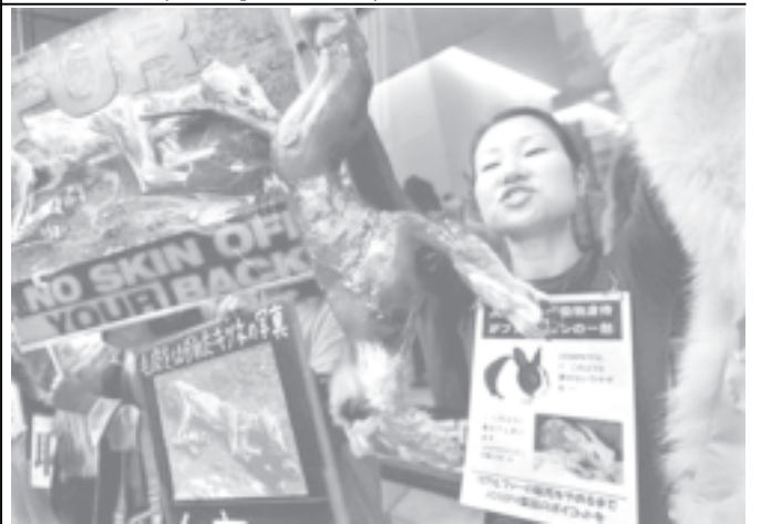
An anti-fur activist shouts a slogan 'No Skin Off, ' holding up a mock carcass of fox with real fur, during an anti-fur demonstration in Tokyo, on 24 September, 2005. The activists said they will hold the protest in London, New York, Paris and Cannes on Saturday.—INTERNET

Statistics also show that a high-risk waistline is more than 80 centimetres for women and 90 centimetres for men in China. — MNA/Xinhua