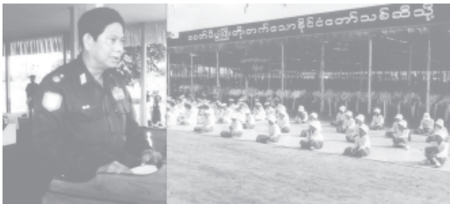
Minister for Agriculture and Irrigation Maj-Gen Htay Oo addresses opening ceremony of Nyaunggon Dam in Meiktila Township.

serving the interest of the people and boosting agricultural production. He gave guidance on implementation of dam projects and river water pumping projects for availability of water in the regions where there is scarcity of water. In accord with his guidance, the Ministry