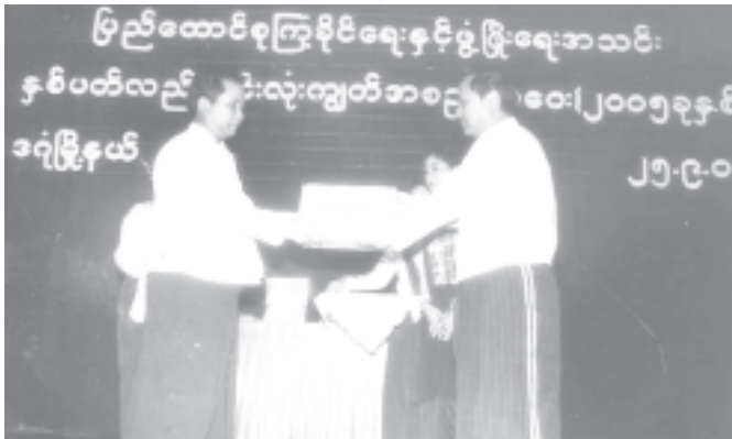
Secretary of Dagon Township USDA accepts cash donated by wellwishers.