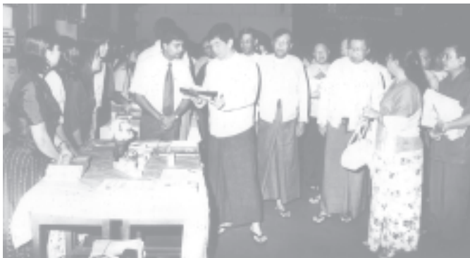
Minister for Health Dr Kyaw Myint views round medical stalls at the ceremony to mark World Heart Day.