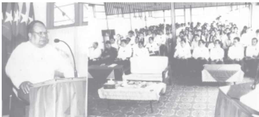
USDA CEC member Deputy Minister for Information U Thein Sein speaking at Annual General Meeting of Kamayut Township USDA.

Next, township USDA executives read out annual reports of various sectors, and ward organizers took part in the discussions. The meeting chairman explained the nine future work programmes and seven objectives of the association, and the meeting passed resolutions.