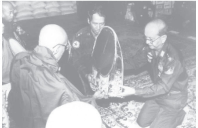
Secretary-1 Lt-Gen Thein Sein offers provisions to a Sayadaw at the donation ceremony for monasteries and nunneries in Thingangyun Township.