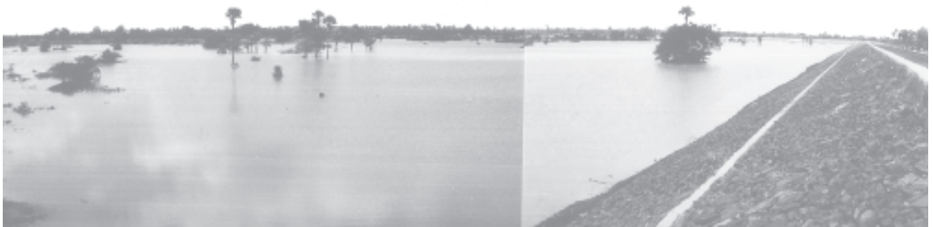
Newly opened Nyaunggon Dam in Meiktila Township.

tion. It is 6,400 feet long and 40 feet high and water storage capacity at full brim is 3,500 acre feet. (See page 9)