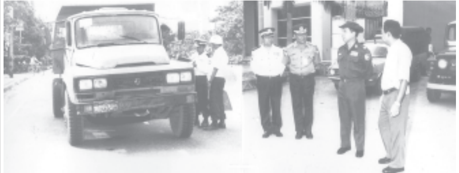
Dry Day Supervisory Committee Minister for Mines Brig-Gen Ohn Myint inspects functions of the dry day inspection teams.

YANGON, 25 Sept — Chairman of the Dry Day Supervisory Committee Minister for Mines Brig-Gen Ohn Myint, together with Leader of the supervision group Deputy Minister for Construction U Tint Swe and members Director-General of Myanmar Police Force Brig-Gen Khin Yi, senior military officers and departmental heads supervised functions of the dry day inspection teams, here, this morning.