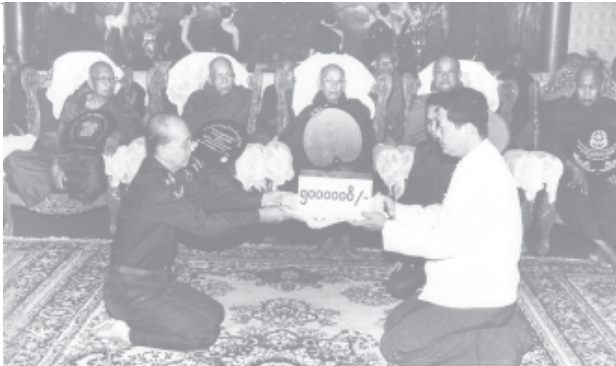
Secretary-1 Lt-Gen Thein Sein accepts cash donations from a wellwisher to the funds of monasteries in Thingangyun Township.