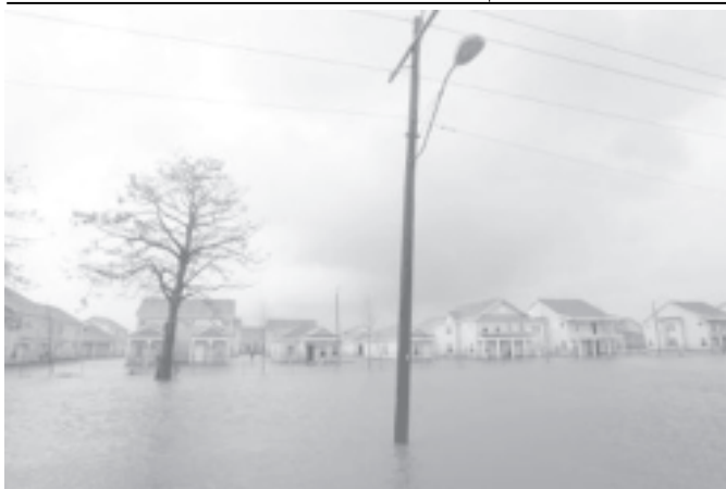
Homes in Orleans Parish are flooded after surging waters from Hurricane Rita over topped a western section of the levee along the Industrial Canal which had given way during Hurricane Katrina in New Orleans on 23 September, 2005.