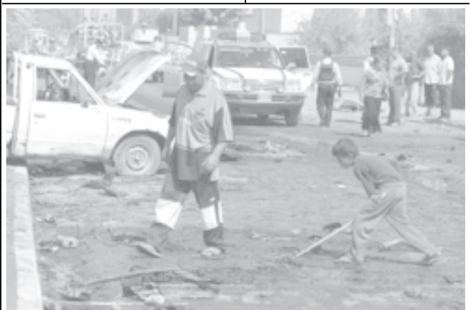
An Iraqi child clears debris at the scene of a suicide bombing in Baghdad, Iraq, on 24 September, 2005.