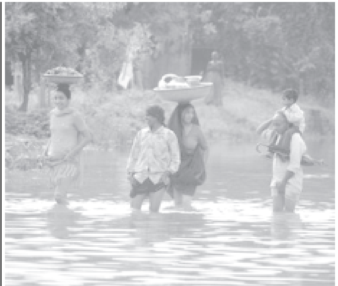
People wade through floodwaters in Vasana Chaudhari Village, about 50 kilometres (31 miles) east of Ahmadabad, India, on 24 September, 2005.