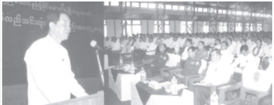
CEC member Col Thein Nyunt addressing annual meeting of Hinthada District USDA.

YANGON, 25 Sept — USDA CEC member Minister for Progress of Border Areas and National Races and Development Affairs Col Thein Nyunt attended the annual meeting of Hinthada District USDA at the town hall in Hinthada yesterday morning.