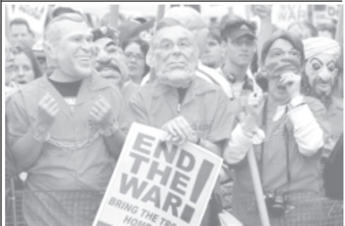
Anti-war protesters dressed in prison uniforms wear masks depicting (front row, L-R) US President George W Bush, Secretary of Defence Donald Rumsfeld and Secretary of State Condoleezza Rice during a series of protests and marches to end the war in Iraq, in Washington, on 24 Sept, 2005.