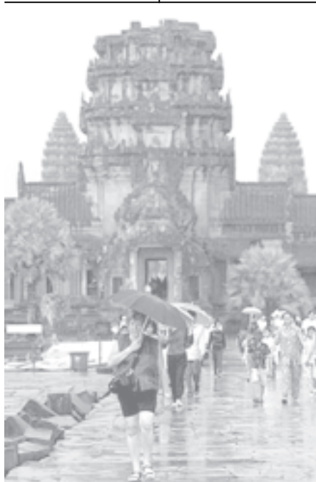
Tourists at the Angkor Wat temple complex in Cambodia. An independent watchdog warned that tomb raiders are decimating Cambodia's archaeological sites, looting ancient and remote cemeteries to sell antiques to tourists.