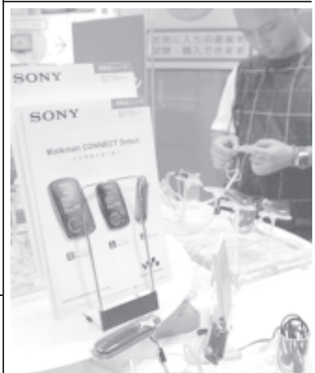
A visitor at Sony Corp showroom in Tokyo's Ginza shopping district checks one of the latest models of the Walkman portable music players on 23 September, 2005.