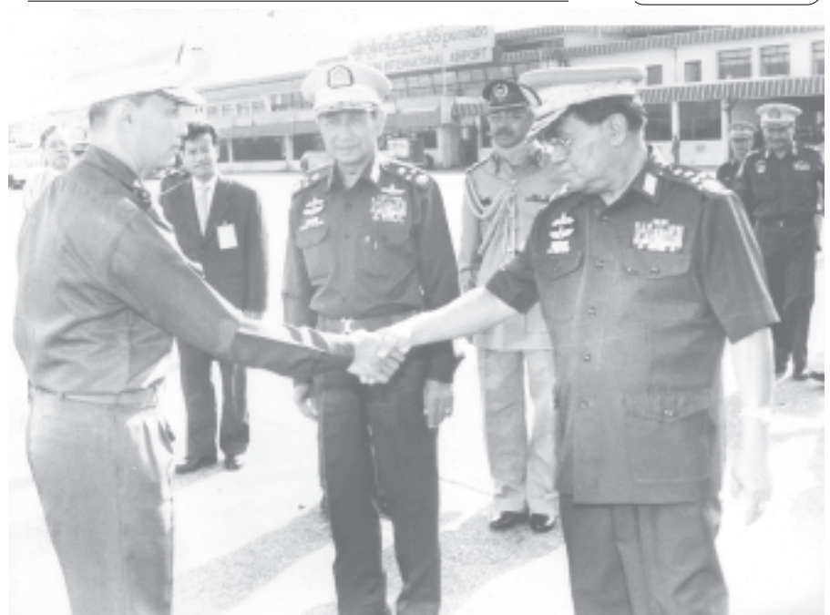
Senior General Than Shwe sees off General Thura Shwe Mann at Yangon International Airport.

Than Shwe, Vice-Chairman of the State Peace and Development Council Deputy Commander-in-Chief of Defence Services Commander-in-Chief (Army) Vice-Senior General Maung Aye, Prime Minister General Soe Win, Secretary-I of the State Peace and Development Council Adjutant-General Lt-Gen Thein Sein, members of the State Peace and Development Council, the Commander-in-Chief (Navy), the Commander-in-Chief (Air), the Chairman of Yangon Division Peace and De-