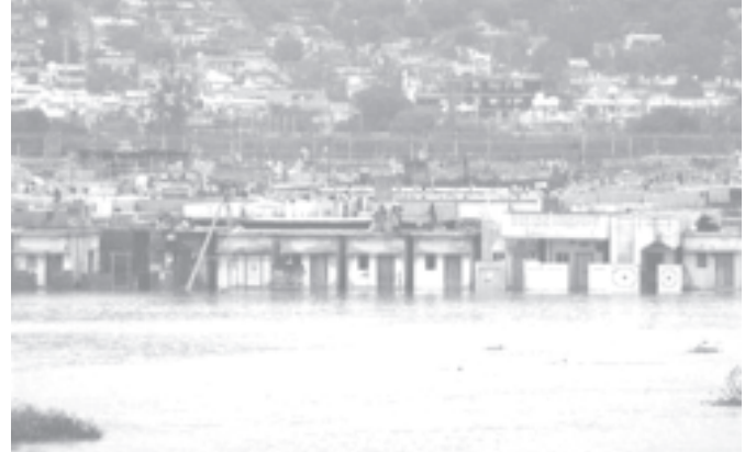
People stand on roofs as their homes are seen inundated by floodwaters in Vijayawada, about 270 kilometers (169 miles) southeast from Hyderabad, India, on 23 September, 2005.