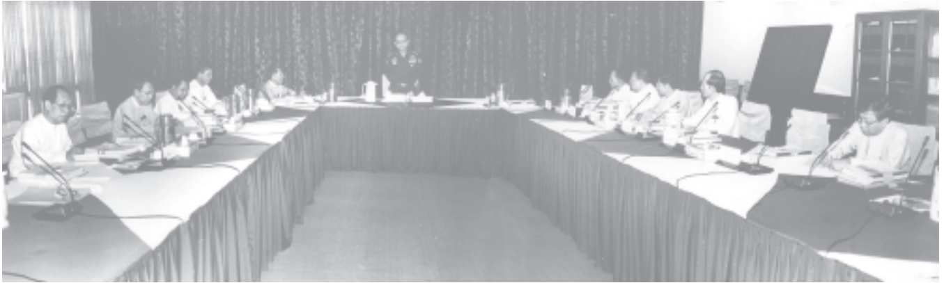
National Convention Convening Committee Chairman Secretary-1 Lt-Gen Thein Sein delivers a speech at meeting of NCCC No 5/2005.

YANGON, 24 Sept— The National Convention Convening Commission held its meeting No 5/2005 at Kyaikkasan Ground here this afternoon.