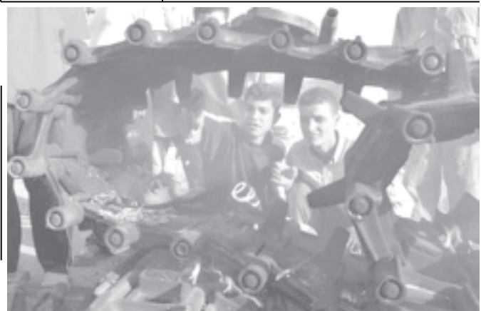
Iraqis gather around the remains of an US army armored vehicle destroyed by a road side bomb near Ramadi, Iraq, on 23 September, 2005.