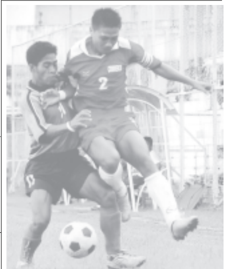
Players of Commerce and A&I fighting for a ball in Myanmar League at Padonma Grounds on 24-9-2005. Commerce trounced A&I 3-0.