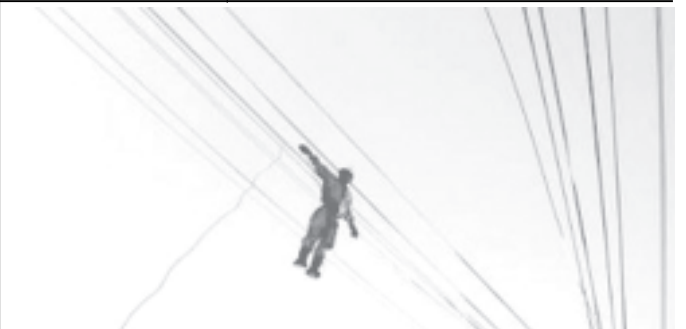
A fire fighter falls from a high altitude during a police parade in Changchun, capital of northeast China's Jilin Province, on 22 September, 2005.