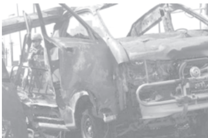
A US soldier views destroyed vehicles following a suicide bombing in Baghdad on 23 September, 2005.