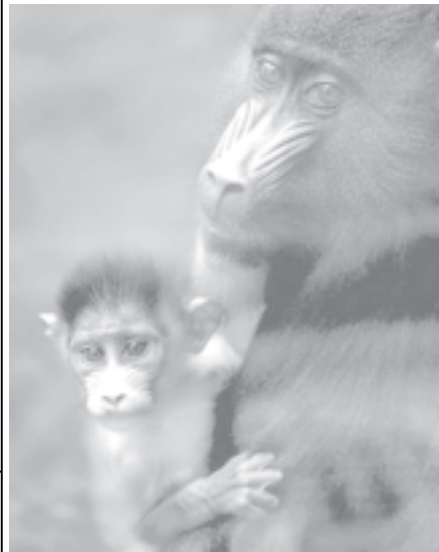
A one-month-old male mandrill holds its mother at the Hongshan Forest Zoo in Nanjing, east China's Jiangsu Province, on 23 September, 2005.—INTERNET

The two universities have so many good applicants they are forced every year to turn down around 10,000 students with three or more A grades at A-level. — MNA/Reuters