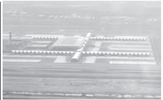
Bangkok’s new international airport is seen from a light plane in Bangkok on 23 September, 2005. Suvarnabhumi Airport will receive Thailand’s Prime Minister Thaksin Shinawatra’s inaugural flight on 29 September.