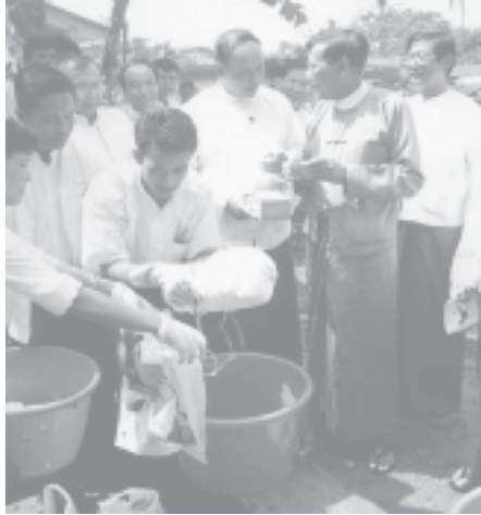
CEC member Mayor Brig-Gen Aung Thein Lin, Deputy Minister for Health Dr Mya Oo and officials view health activities in Kwammoedein Village of Kayan Township.

(from page 10) Yangon Division WAO Yangon Division WAO USDA will spend its funds on expense of medical treatment for 109 pa-