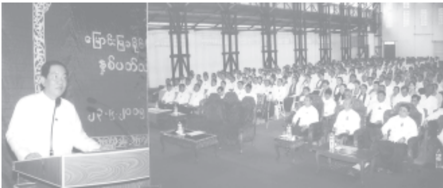
CEC member Minister for PBANRDA Col Thein Nyunt addresses annual meeting of Myaungmya District USDA.

YANGON, 24 Sept — USDA CEC member Minister for Progress of Border Areas and National Races and Development Affairs Col Thein Nyunt attended the annual meeting of Myaungmya District USDA at Myaungmya BEHS yesterday morning.