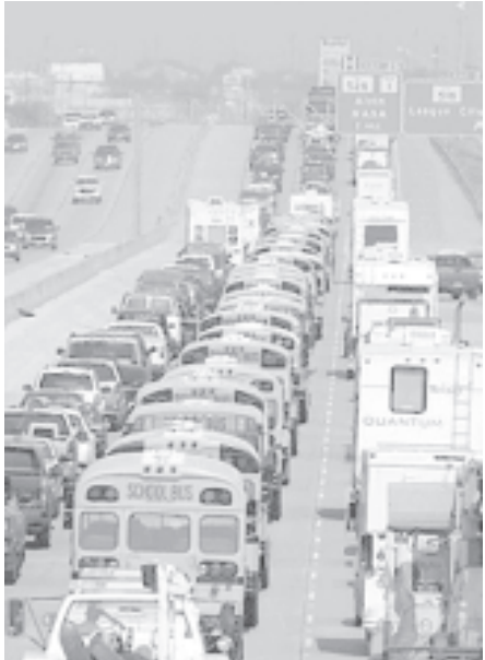
School buses used to evacuate residents from Hurricane Rita leave Galveston County, Texas on 23 September, 2005.