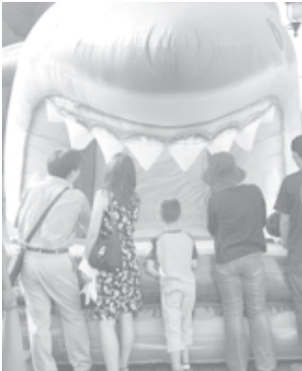
Holiday makers face with a giant shark as they wait for people come down the inflatable 'Jaws' slide at an amusement park in Yokohama, southwest of Tokyo, on 23 September, 2005, Autumn Equinox Day, a national holiday.

Damrey is already affecting Hong Kong with hazy. And isolated showers are expected this evening. —MNA/Xinhua