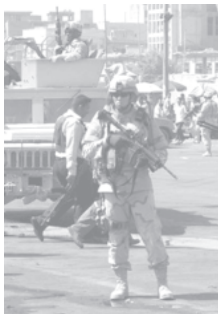
US military police secure the area where a suicide bombing took place in Baghdad, Iraq, on 23 September, 2005.