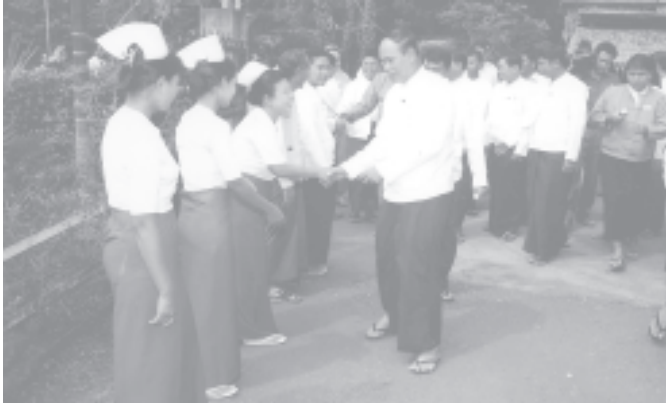
CEC member Mayor Brig-Gen Aung Thein Lin cordially greets nurses in Kwammoedein Village of Kayan Township.

ple at the hall of Kwammoedein Village BEMS. Kwammoedein