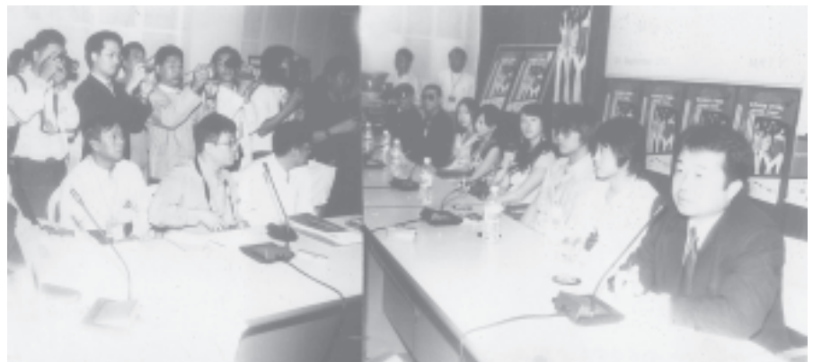
Visiting Korean artistes meet with local journalists at Myanma Radio and Television.