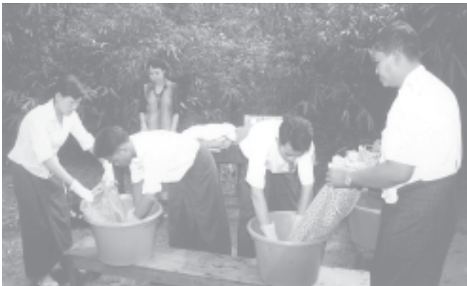
A group of health staff including specialists taking measures for public health in Kwammoedein village, Kayan township.