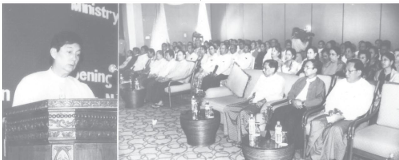
Minister Dr Kyaw Myint addresses the opening ceremony to review the accomplishments of National Health Plan 2001-2006.

Executives of Myingyan District and Kyaukpadaung Township USDAs reported on social welfare tasks being carried out joining hands with locals. — MNA