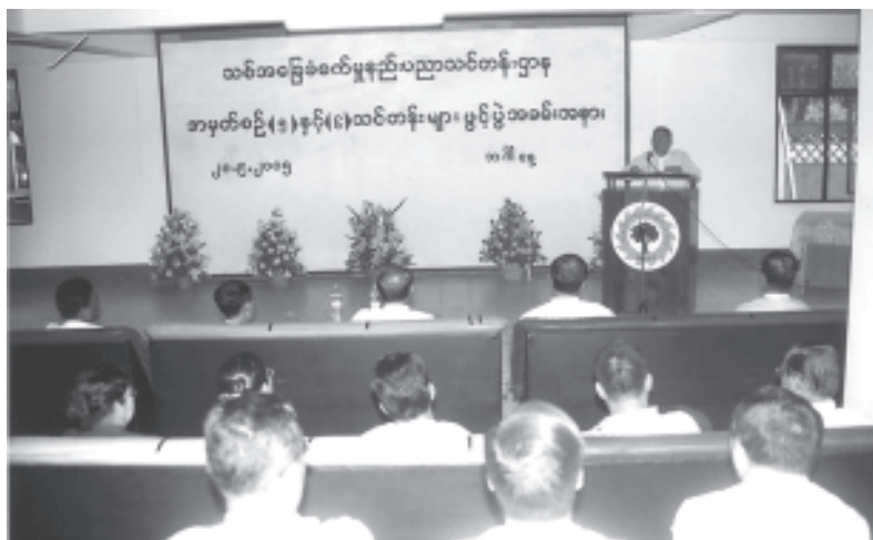
The opening session of the wood-based technologies courses Nos 5 and 6 in progress. UMFCCI

YANGON, 22 Sept — Organized by Myanmar Timber Entrepreneurs Association, the wood-based technologies courses Nos 5 and 6 were opened at Wood-based Technology Training School in Dagon Myothit (North) Township with a speech by Vice-