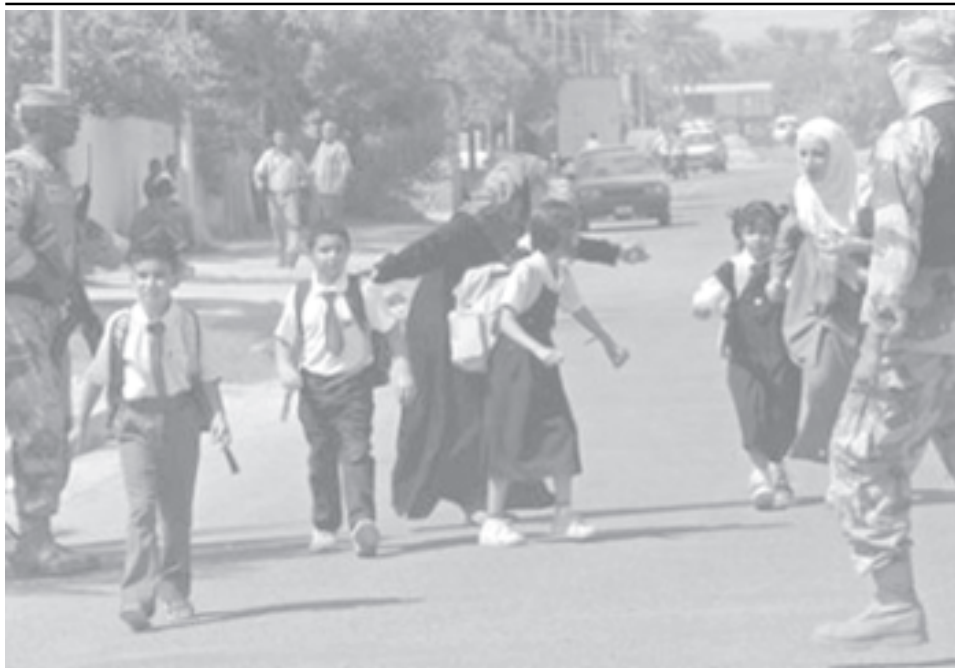
Families are evacuated from a neighbourhood after a gun battle erupted in Baghdad on 21 September, 2005.