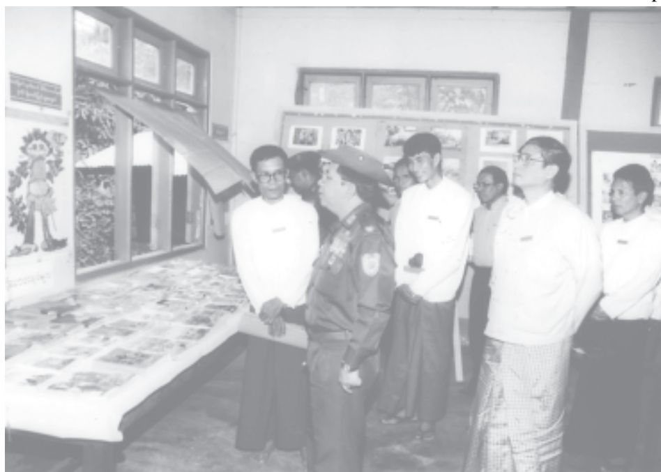
Information Minister Brig-Gen Kyaw Hsan inspects posters and books displayed at Pyinmana Township Information and Public Relations Department.