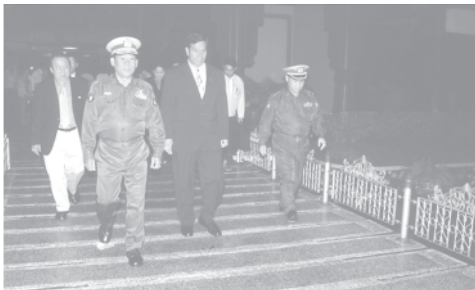
Minister for Finance and Revenue Maj-Gen Hla Tun being seen off at the airport before departure for Washington DC.

YANGON, 22 Sept — Maj-Gen Hla Tun, Minister for Finance and Revenue, left here by air