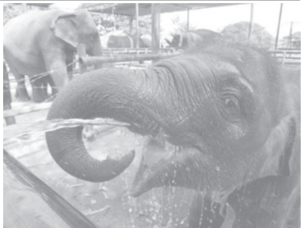
A one-year-old elephant quenches its thirst at the Ayutthaya elephant camp, 80 km (50 miles) north of capital Bangkok on 21 September, 2005.