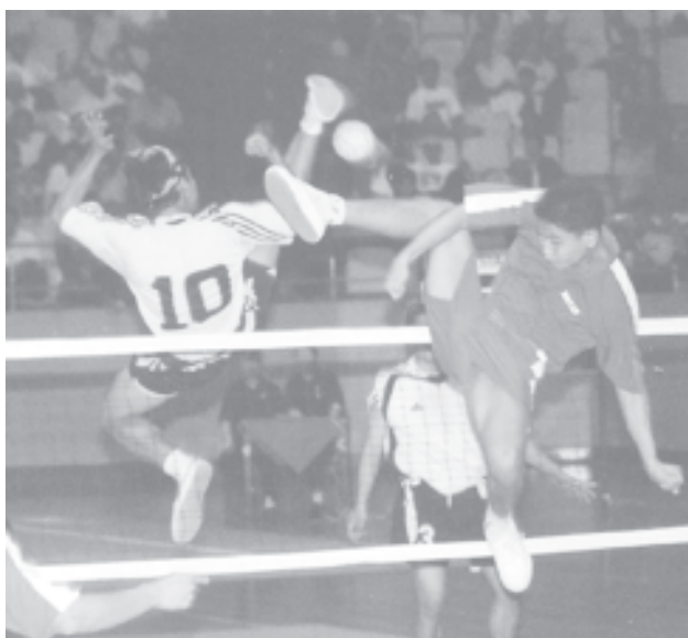
Myanmar blocks attacks of Malaysia in the Friendly Sepak Takraw match.