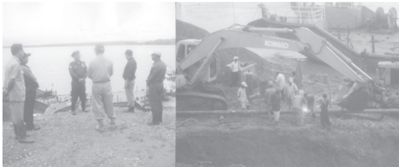
Minister Brig-Gen Lun Thi inspects the laying of gas pipelines across Ayeyawady River. — ENERGY

YANGON, 22 Sept — Minister for Energy Brig-Gen Lun Thi inspected the site of Yonseik-Thayet 6-inch Ayeyawady River crossing natural gas pipeline laying project near Yonseik Village of Aunglan Township on 19 September.