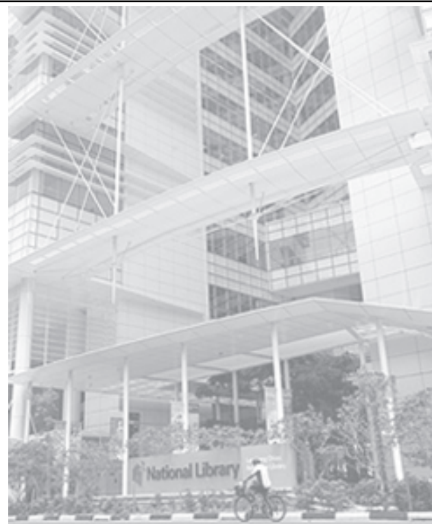
A view of the newly-built Singapore's National Library building which is five times larger than the old premises and holds more than 634,000 items including seven levels of reference materials on Southeast Asia stored in print and digital formats for visitors.