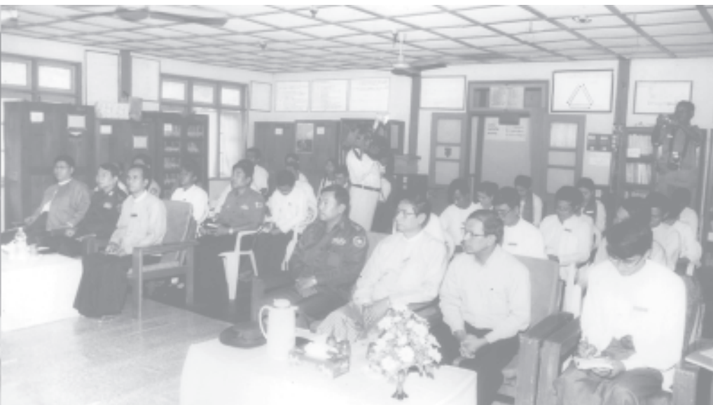
Information Minister Brig-Gen Kyaw Hsan delivers an address at the books donation ceremony held at Pyinmana Township Information and Public Relations Department.