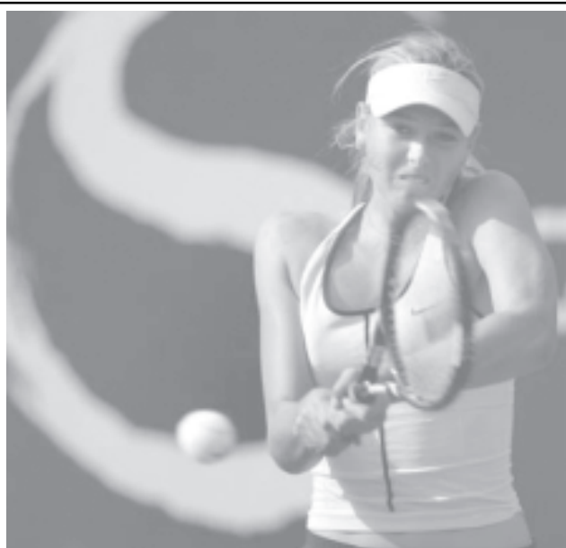
Maria Sharapova of Russia returns a shot to Israel's Shahar Peer during their women's singles match at the China Open tennis tournament in Beijing on 22 September, 2005.