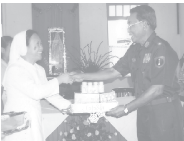
Deputy Minister Brig-Gen Kyaw Myint presents K 100,000 and medicines for the Little Sisters of the Poor through Sister Clare.

At a ceremony, Patron of holding committee of the International Day for Older Persons Deputy Minister for Social Welfare, Relief and Resettlement Brig-Gen Kyaw Myint explained the purpose of the donation and contributed K 100,000 to the fund of the Little Sisters of the Poor and presented medicines for older persons.