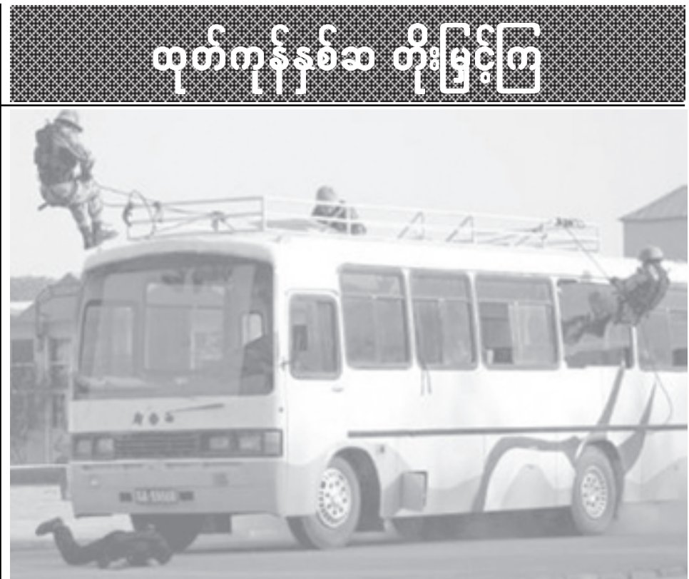
Chinese police conduct an anti-terror exercise to save the 'hijacked passengers' in a bus in Nanjing, east China's Jiangsu Province, on 21 September, 2005.