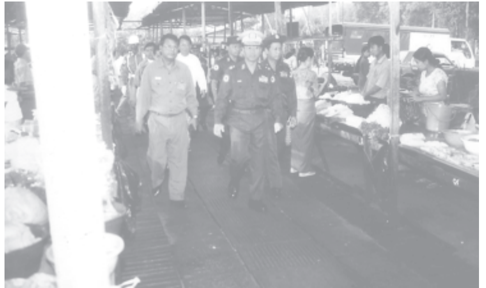
Commander Maj-Gen Myint Swe inspects Tax-free Market on Kaba Aye Pagoda Road in Yankin Township.—MNA

YANGON, 22 Sept — Chairman of Yangon Division Peace and Development Council Commander of Yangon Command Maj-Gen Myint Swe inspected tax-free markets in Yangon City today.