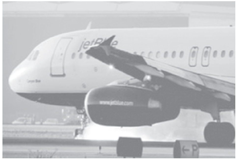
Flames stream from the broken nose gear of a JetBlue Airbus 320 as it makes an emergency landing at Los Angeles International Airport on 21 Sept, 2005. —INTERNET

Pointing out that a change in the composition of the Council is an “imperative,” Singh said the G-4 framework resolution has made UN reforms a central issue which can no longer be ignored. — MNA/PTI