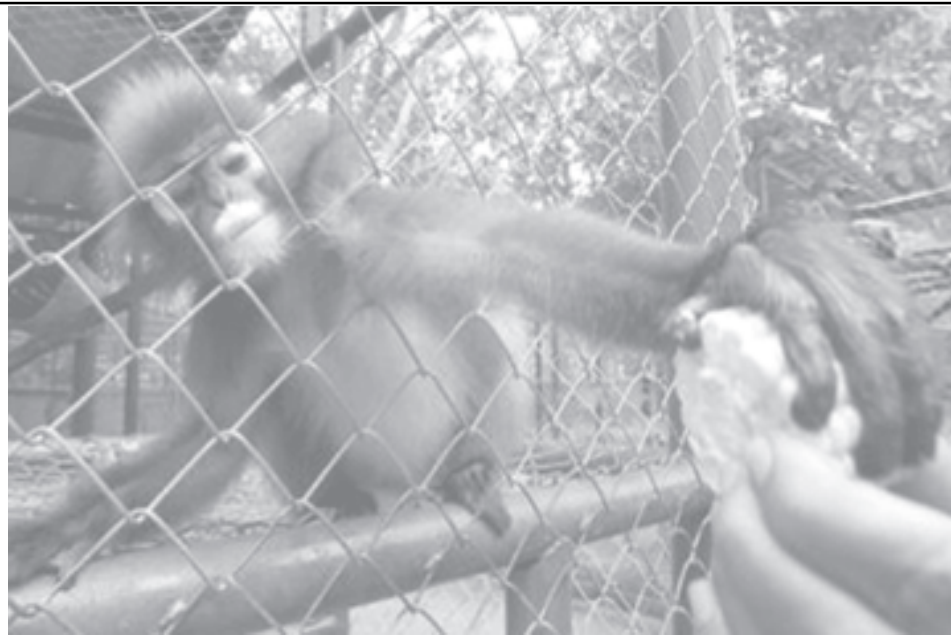
A worker feeds an abandoned leaf monkey at the Wildlife Rescue Centre in Phetchburi Province, 100 km south of Bangkok, on 17 September, 2005. —INTERNET

There has been heightened sensitivity about airline safety in Cyprus since a Boeing 737-300 run by privately owned Helios Airways crashed in Greece on August 14, killing all 121 on board in the country's worst aviation disaster. — MNA/Reuters