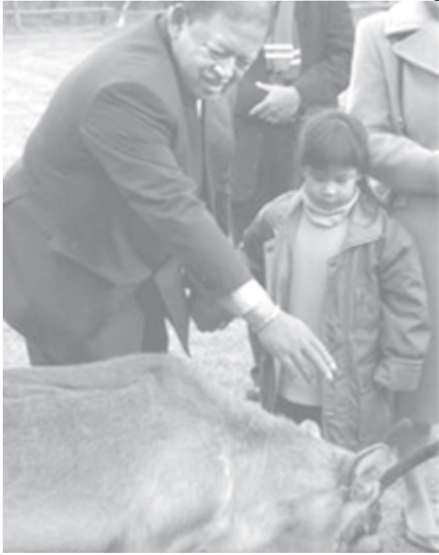
Malaysia's King Yang di-Pertuan Agong XII (L) and his grand daughter visit a reindeer farm close to Arctic Circle in Rovaniemi, Finland, on 21 September, 2005. The King and Queen of Malaysia are on a three-day state visit to Finland.