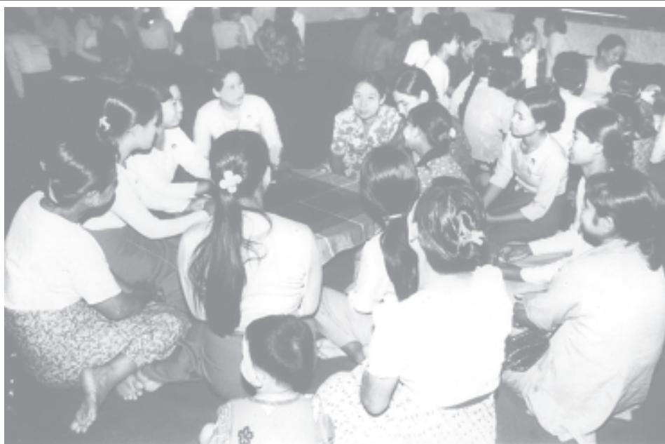
Members of MWAF and MCWA hold frank discussions with local womenfolk of Kayan Model Village. — MNA

Also present on the occasion were officers and other ranks of Flying Training Base and Ground Training Base, senior military officers of Meiktila Station and guests. — MNA