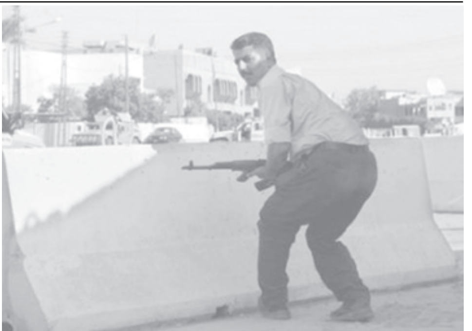
An Iraqi policeman takes cover during a gunfight with guerillas in Baghdad's Mansour District on 21 September, 2005.