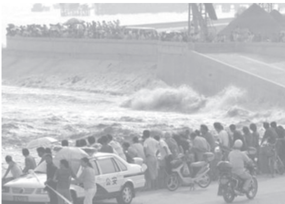
Chinese tourists gather to watch the tide on the bank of Qiantang River in Hangzhou in east China’s Zhejiang Province on 20 September, 2005.