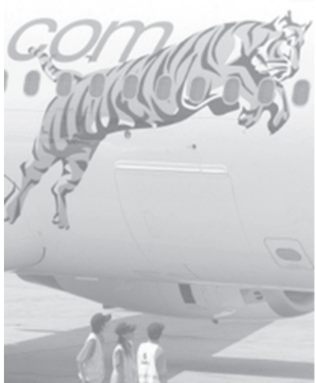
Tiger Airways staff check a plane before take off at the terminal at Singapore's Changi International Airport. Singapore-based budget carrier Tiger Airways plans to expand its network to southern China, India and Cambodia and more than double capacity to three million passengers next year.

Pakistan has deployed some 80,000 troops along the border with Afghanistan to check the militants' cross-border movement.