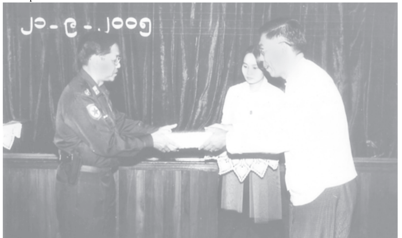
Commander Maj-Gen Myint Swe accepts cash donated by a wellwisher for 13th Myanmar Traditional Cultural Performing Arts Competitions.

To promote Myanmar traditional culture and hand down lofty national cultural heritage to the youth today, the 13th Myanmar Traditional Cultural Performing Arts Competitions are held yearly. The competitions are going to take place with seven lofty aims.