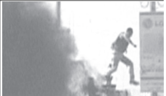
Television footage shows a soldier jumping from a British tank as it comes under attack from a crowd in the southern Iraqi city of Basra, on 19 September, 2005. — INTERNET

Just 35 per cent of those polled approved of Bush's handling of the economy, with 63 per cent saying they disapproved. The poll of 818 adults was conducted between Friday and Monday, and has a margin of sampling error of plus or minus 4 percentage points. — MNA/Xinhua