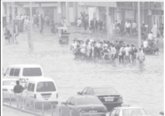
Residents wait for buses as cars break down on a waterlogged street after heavy rains in Jinan, capital of east China's Shandong Province, on 19 September, 2005.—INTERNET