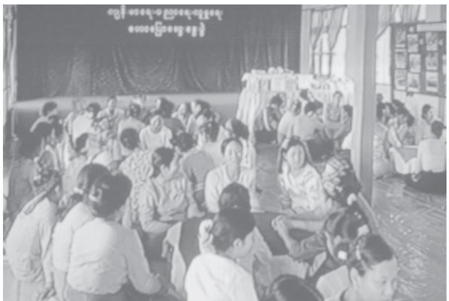
MNAF and MCWA members discuss health, education and social matters at BEHS (Branch) in Namsalat Village of Hsenwi Township.— MNA

Next, the commander, the minister and party viewed participation of USDA members in pollination at the Hsinshweli paddy fields. —MNA