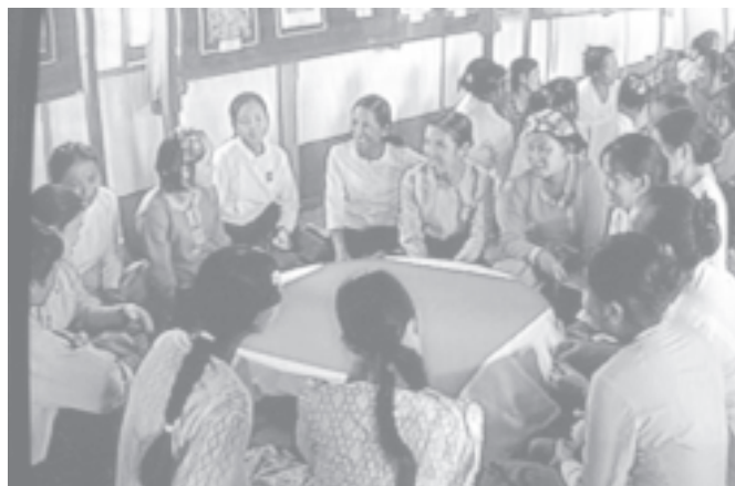
MWAF and MCWA members discuss health, education and social matters at BEHS (Branch) in Namsalat Village of Hsenwi Township.

Development tasks in health and education sectors are being performed with the assistance and cooperation of UN agencies — WHO, UNICEF and FAO, and successes have been achieved.