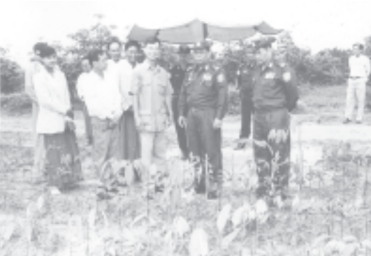
Lt-Gen Maung Bo inspects the rubber research and propagation farm in Kyonphaik village, Mudon Township.