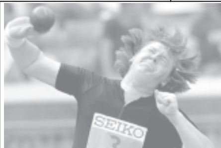
Giving it a good shot: Nadezhda Ostapchuk of Belarus competes in the women's shot put final at the Seiko Super track and field meet in Yokohama.