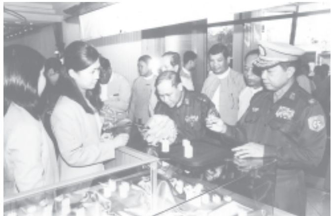
Minister for Mines Brig-Gen Ohn Myint inspects selling of gold coins at special gold shop.