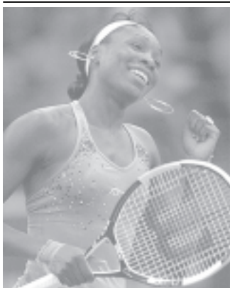
Venus Williams, seen here in Seoul on 19 September 2005, is now in Beijing where she will be playing in the China Open this week.