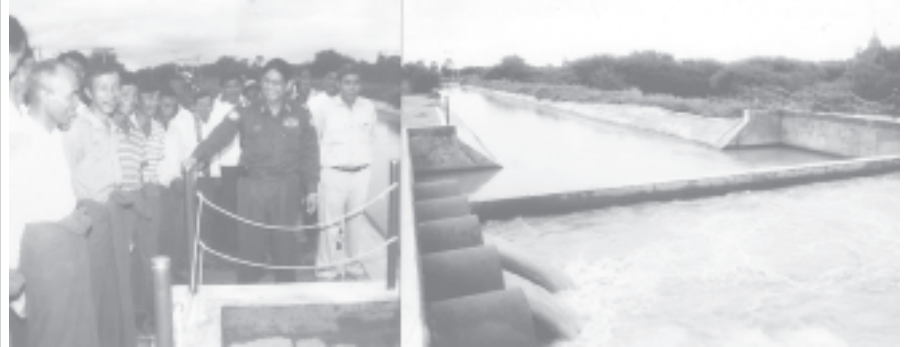
Minister for Agriculture and Irrigation Maj-Gen Htay Oo inspects Lawkananda River Water Pumping Project in NyaungU Township. — A&I

During his tour of NyaungU Township, Minister Maj-Gen Htay Oo also went to Latpanchayaw and Thukaungti river water pumping stations in the region. At Latpanchayaw river water pumping station, the minister inspected supply of irrigation water and 1,500 acres of monsoon paddy field in the catchment area.— MNA