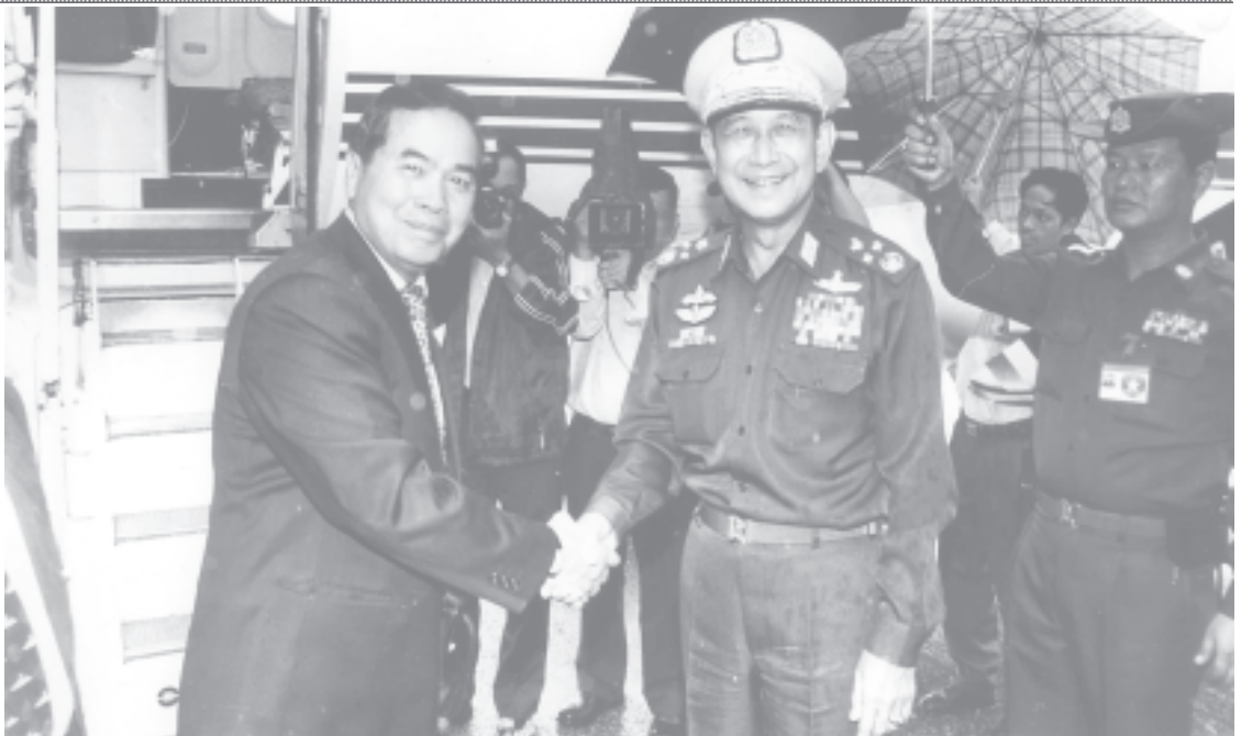
Vice-Senior General Maung Aye bids farewell to Thai Supreme Commander General Chaisit Shinawatra at the airport before his departure for Bagan-NyaungU.

The Thai Supreme Commander and party left No 1 Tatmadaw Guest House in a motorcade to Yangon International Airport. Vice-Senior General Maung Aye and party (See page 8)