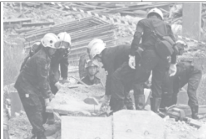
Singapore and Brunei rescue team search for supposed survivors in abandoned construction site during a drill in Kuala Lumpur, Malaysia, on 19 September, 2005. —INTERNET

The latest deaths reported by the military: A soldier was killed 75 miles north of Baghdad, Iraq, when his vehicle was struck by an explosive on Tuesday. Four soldiers were killed by explosives in two separate incidents on Monday in Ramadi, Iraq.— Internet