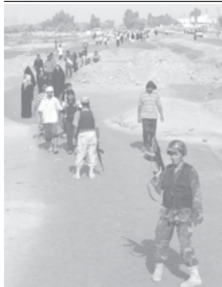
Iraqi soldiers man a checkpoint for visitors arriving at Iraqi city of Kerbala, 110 kms (70 miles) south of Baghdad, on 18 September, 2005.

Kurdish rebels, Islamist radicals and far-leftists have all launched bomb attacks in Turkey in recent years.