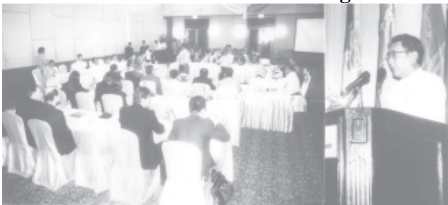
Deputy Minister for Electric Power U Myo Myint delivers an address at the opening session of RPTCC-4.

YANGON, 21 Sept — The 4th Meeting of the Regional Power Trade Coordination Committee (RPTCC-4) was held at Traders Hotel here today.