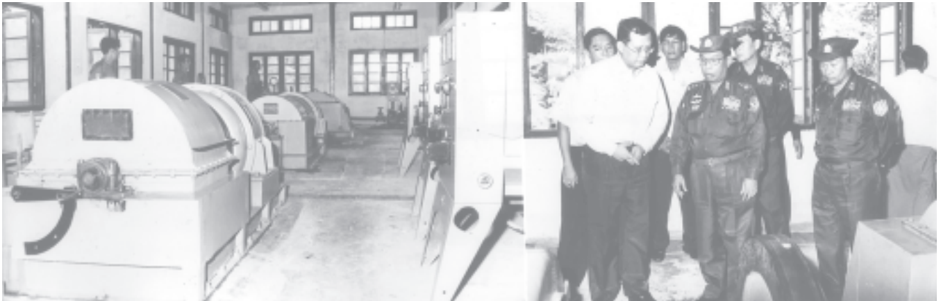
Lt-Gen Maung Bo inspects Zinkyaik small-scale hydropower plant in Zinkyaik Village, Paung Township.

YANGON, 21 Sept— Member of the State Peace and Development Council Lt-Gen Maung Bo of the Ministry of Defence continued his inspection tour around Mon State on 19 September.