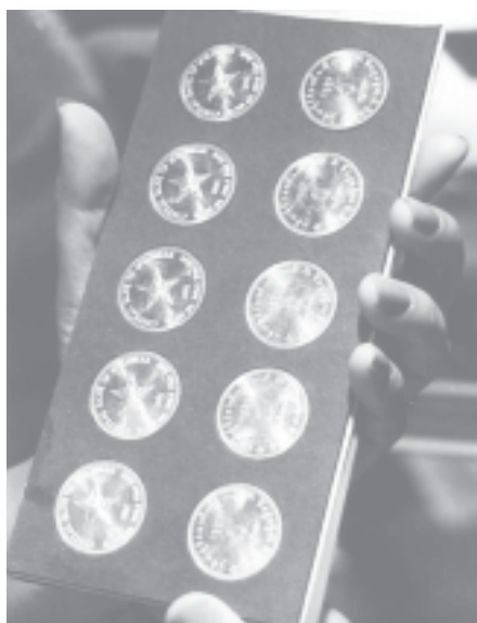
One tical gold coins.