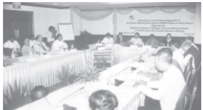
The second day session of Workshop on Growing Integration of Greater Mekong Sub-regional ASEAN States in Asian Region in progress. — MNA

In the evening, the dinner was hosted by Ambassador U Nyunt Tin to those present. — MNA