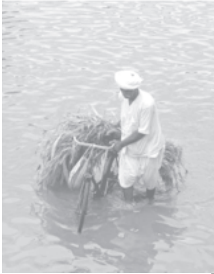
An Indian man pushes his bicycle through a flooded road in the western Indian city of Ahmedabad on 19 September, 2005. Heavy rain swamped parts of the western India and disrupted traffic.