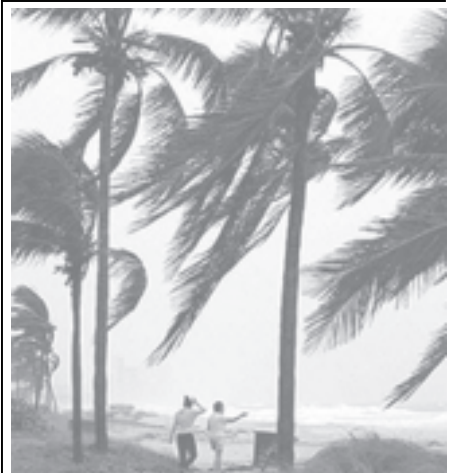
Women walk on Miami Beach in Florida. Storm-weary New Orleans residents began fleeing their devastated city again as Hurricane Rita threatened the Gulf Coast three weeks after Katrina's deadly passage through Louisiana.