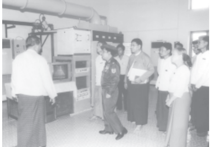
Minister Brig-Gen Kyaw Hsan inspects TV retransmission station in Nyaunglebin, Bago Division.—MNA

Myanma Television retransmission station in Nyaunglebin is airing test