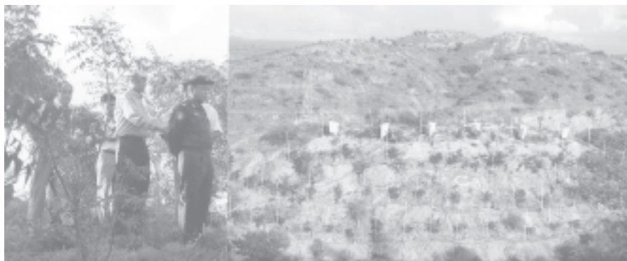
Brig-Gen Thein Aung inspects tree plantations at Shwepondaung in Yenangyoung Township.—FORESTRY

At the timber extraction office at the foot of Mandalay Hill, the minister met with officials of Forest Department and Myanmar Timber Enterprise and gave necessary instructions. MNA