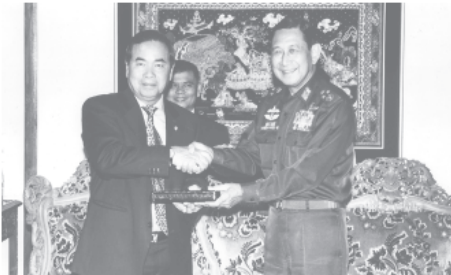
Vice-Senior General Maung Aye presents documentary photo album and video tapes to Thai Supreme Commander General Chaisit Shinawatra at the lounge of the airport.