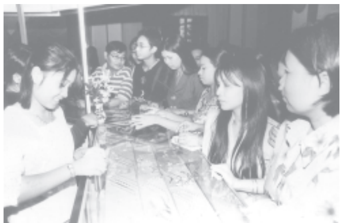
Buyers seen at Special Gold Shop of Myanmar Gems Enterprise.