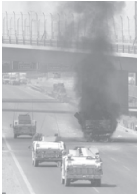
US military vehicles drive by a burning truck following a roadside bomb attack in western Baghdad on the Ghazaliya Khadraa highway that targeted four trucks loaded with food supplies for Americans on 17 September, 2005.