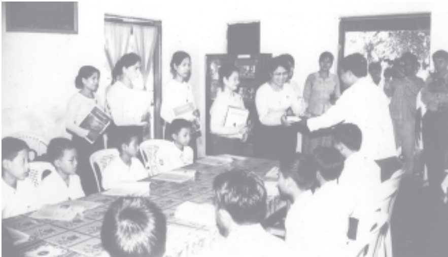
Ayeyawady Division Women's Affairs Organization, Myaungmya Women's Affairs Organization donate books to Myaungmya Youth Training Centre.