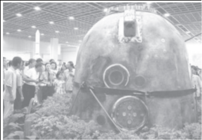
A Chinese official (with loudspeaker) gestures to the re-entry capsule of the Shenzhou-V spaceship on display in Nanjing, east China's Jiangsu Province on 17 September, 2005. China might launch its second manned space mission next month, the Shanghai Morning Post reported early this month citing a space official.