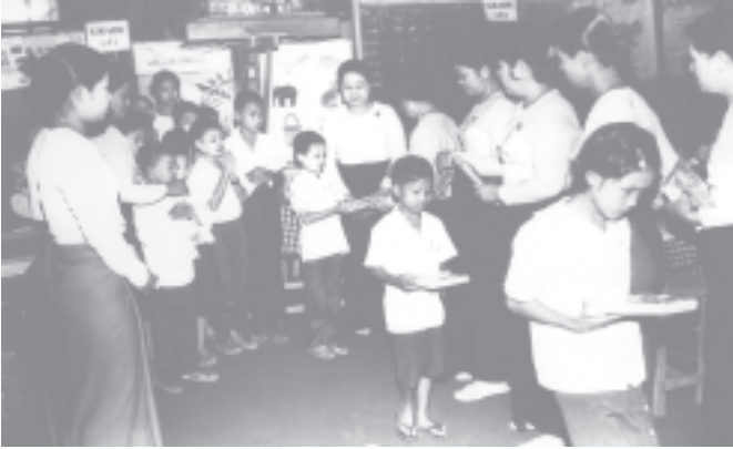
Members of MWF and Ayeyawady Division WAO provide cash assistance, school uniforms and stationery to school children.