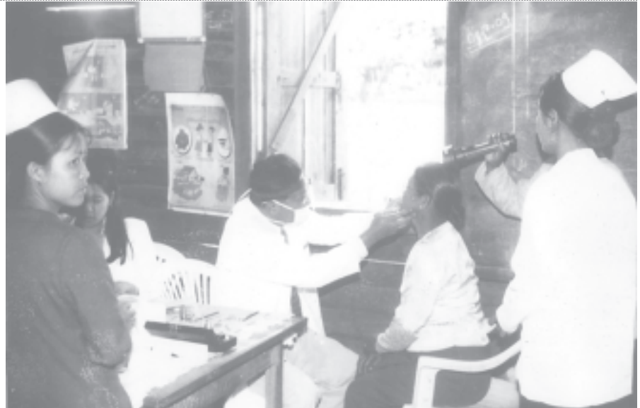
Specialists of Shan State Hospital give treatment to eye, ear, nose and tooth patients.