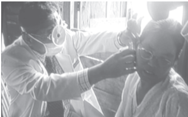
A specialist of Shan State Hospital gives treatment to eye, ear, nose and tooth patients.