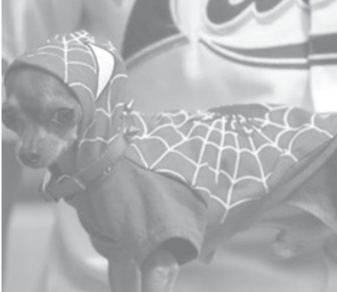
"Guinness", one of the 256 chihuahua dog entries in a race to determine America's fastest chihuahua, is seen dressed in his Spiderman outfit at Petco Park in San Diego, California on 18 September, 2005.

BAGHDAD, 19 Sept — Two suicide car bombers separately blew themselves up at Iraqi police commandos in two towns south of Baghdad on Monday, killing seven commandos and one civilian, police said. "A suicide bomber drove an explosive packed vehicle near a police commandos patrol in the town of Muhmoudiyah, some 30 km south of Baghdad," an Interior Ministry source told Xinhua on condition of anonymity. "Another suicide bomber struck another police commandos on the entrance of Latifiyah, about 40 km south of the capital," the source said. Seven commandos and a civilian were killed in the blasts, he said, adding two commandos were also wounded in the attacks. The two towns are part of the so-called triangle of death in southern Baghdad, where guerillas frequently attacked US and Iraqi security forces. MNA/Xinhua