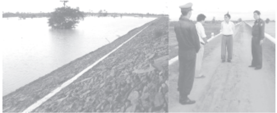
Maj-Gen Htay Oo inspects Nyaungon Dam being built in Meiktila Township.

YANGON, 19 Sept—Minister for Agriculture and Irrigation Maj-Gen Htay Oo on 17 September met with the chairman of Meiktila District Peace and Development Council and members of Meiktila District and Township Agriculture Service Coordination Committee at the meeting hall of Montaing Dam in Meiktila Township, Mandalay Division and discussed matters on irrigated facilities and greening in the region. At the meeting, the minister stressed the importance of timely cultivation of paddy, disseminating of quality strain and techniques and boosting the per acre yield.