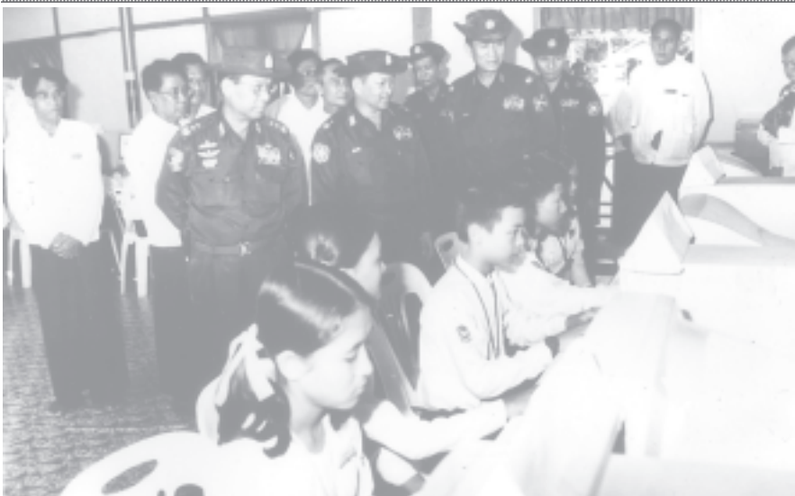
Lt-Gen Maung Bo and party visit Mottama Basic Education High School in Paung Township.

Public participation needed to promote education system into electronic education Lt-Gen Maung Bo attends opening ceremony of multi-media classrooms of Mottama BEHS