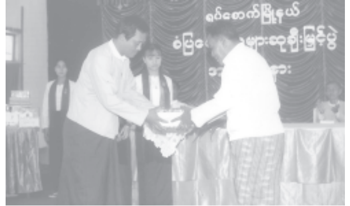
An official presents prize to a villager at prize-distribution ceremony of Model villages competition.

villages are to make efforts for all-round development by implementing the fifteen development tasks, and only then will they be designated as model villages. If there is no cooperation between the government and people, the nation will lag behind in development.