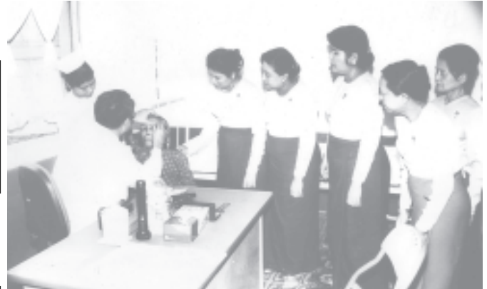
Members of MWF and Ayeyawady Division WAO visit Inma model village station hospital where a specialist is giving treatment to patients.