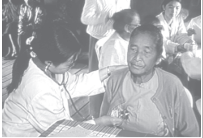
A doctor providing a medical check-up to a villager