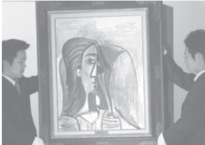
Pablo Picasso's artwork 'Buste de femme' is displayed by staff at an auction in Tokyo on 17 September, 2005. The painting was sold at an auction for 180 million yen ($1,616,306). —INTERNET

In December, Castro and Chavez signed an agreement fixing payment for these services within a broad cooperation deal that renewed oil shipments at preferential rates. — MNA/Reuters