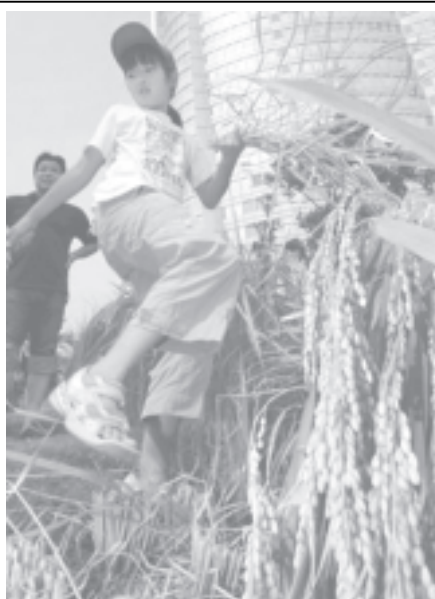
A Japanese girl harvests rice during a harvesting event atop a high-rise building at Tokyo's Roppongi Hills complex on 19 September, 2005.