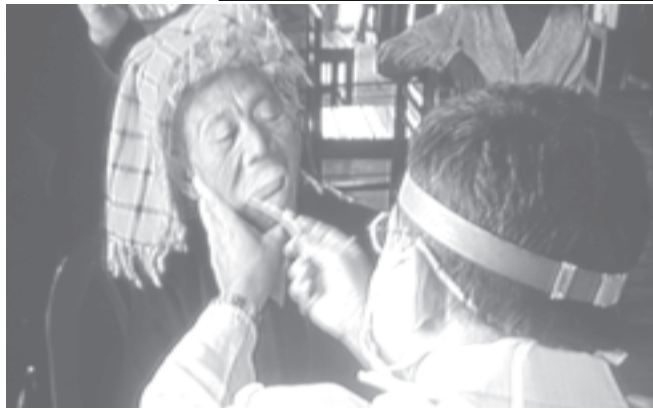
A specialist of Shan State Hospital gives treatment to eye, ear, nose and tooth patients.