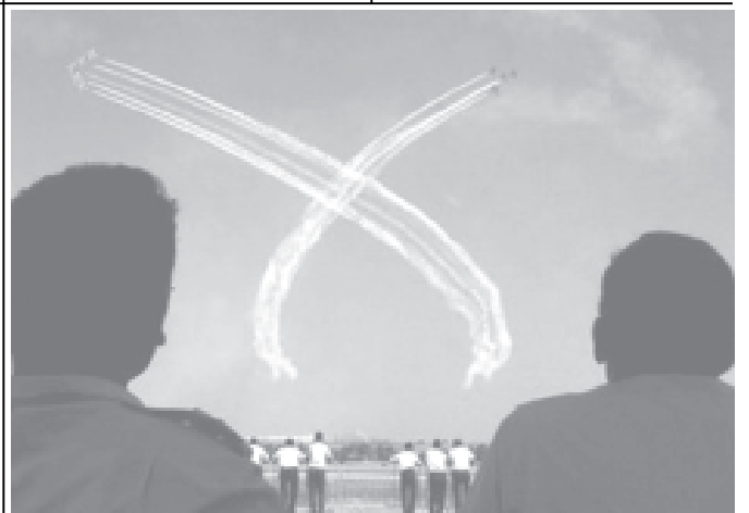
Greek Air Force officers watch a formation of MB-339A PAN from Italy's Pony aerobatic team during an airshow at the air-force base of Tanagra, 70 kilometres (about 43 miles) north of Athens, on 17 September, 2005. Air forces from 13 countries take part in the three-day static and flying show. —INTERNET

According to the original plan, the Three Gorges Project on the Yangtze River, with an estimated cost of 180 billion yuan (approximately 21.7 billion US dollars), will have 26 generators with a combined generating capacity of 18.2 million kilowatts. — MNA/Xinhua