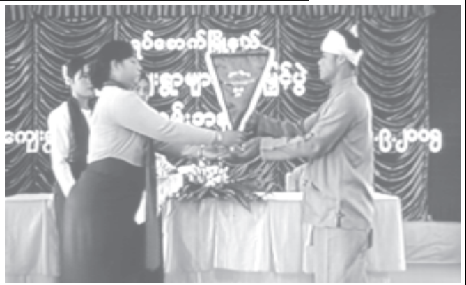
An official gives prize to a villager at prize-distribution ceremony of Model Villages competition—MNA