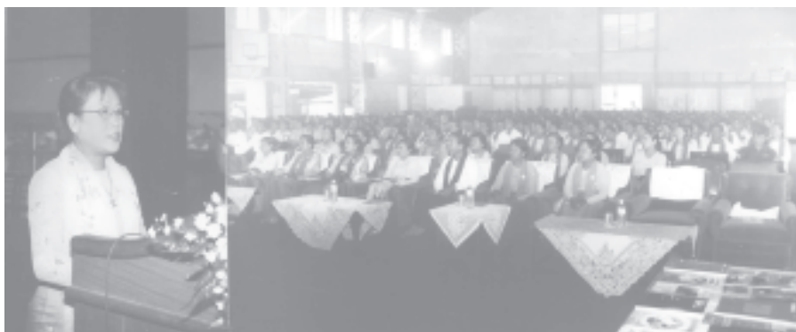
Daw Khin Thet Htay addresses the ceremony to launch the anti-TB programme.—MNA