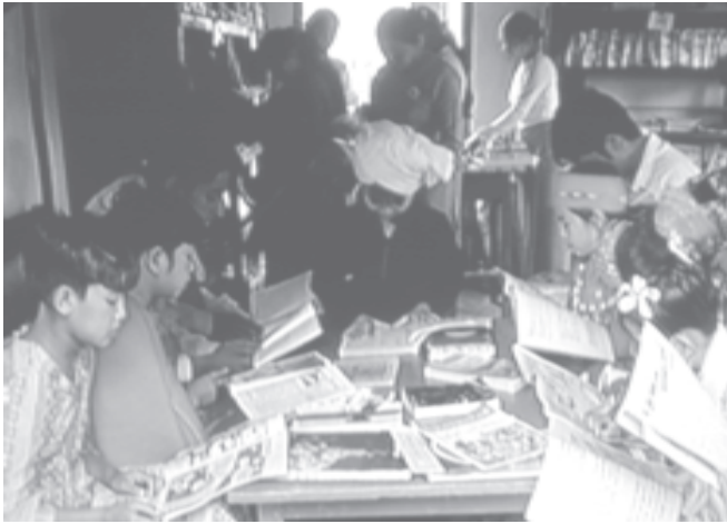
Bookworms seen at Alinyaung Library in Pinphyit Village in Yaksawk Township.