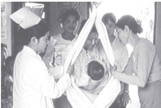
Staff of Shan State General Hospital take part in rural health care services at Pinphyit Village.