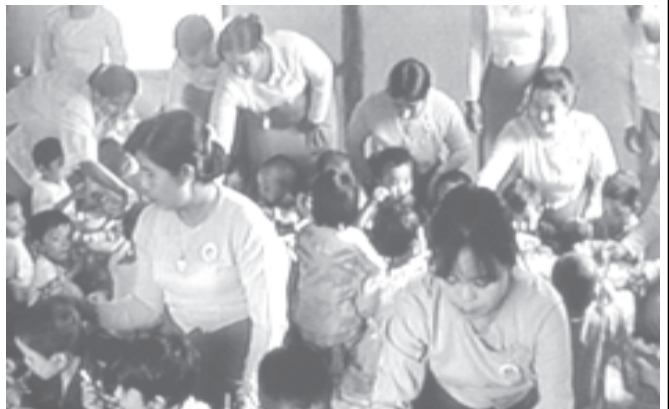
Members of USDA, WAO and MCWA giving nutrition to children at Pinphyit Village in Yaksawk Township.