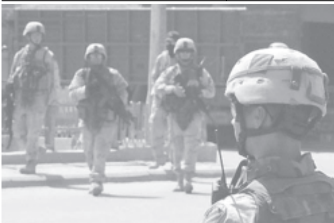
US soldiers patrol following a car bomb explosion recently in Baqouba, 60 kms northeast of Baghdad.

The soldier, assigned to the 56th Brigade Combat Team, was taken to a US military hospital where he died of his wounds on Saturday night. The attack occurred near Al Asad Air Base in a volatile guerilla region near Syria. At least 1,899 members of the US military have been killed since the beginning of the Iraq war in March 2003, according to an Associated Press count.—Internet