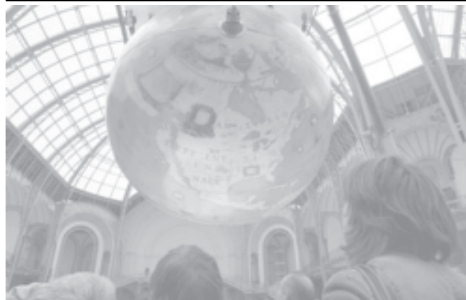
Visitors take a look at the Coronelli terrestrial globe displayed in the newly opened Grand Palais in Paris, on 17 September, 2005 during Heritage Day.

At the same time, developing countries must achieve good governance, fight corruption, make efficient use of their limited resources, and plan and carry out appropriate development strategies, he said. —MNA/Xinhua