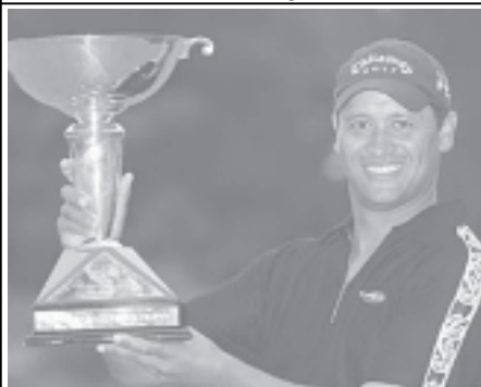
New Zealand's Michael Campbell poses with the World Match Play trophy after beating Ireland's Paul McGinley recently.