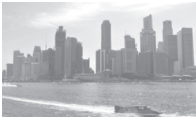
An F1 powerboat races during a timed trial session in front of the Singapore skyline on 17 September, 2005.