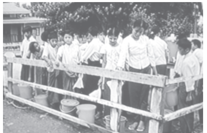
Members of USDA, WAO and MCWA participating in sanitation works at Pinphyit Village in Yaksawk Township.