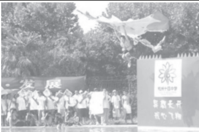
A Chinese student holding a wing jumps from a platform during a flying contest at a park in Hangzhou, east China's Zhejiang Province, on 18 September, 2005. Students from a senior high school hold the contest to see who can fly the longest distance with self-designed flying devices.