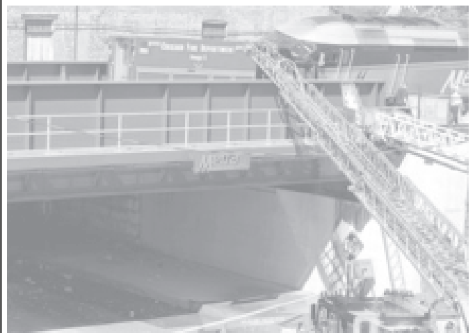
Rocks fall down after a Metra commuter train sits off the tracks after derailing on 17 September, 2005, on Chicago's South Side. —INTERNET

Seventeen of the injured were in serious condition. —MNA/Xinhua