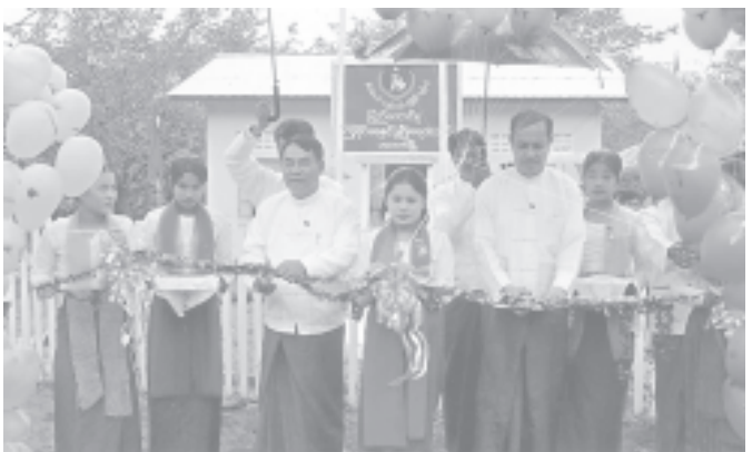
USDA CEC member Minister Brig-Gen Maung Maung Thein and Secretary of Taninthayi Division USDA U Kyaw Kyaw Htay open the new office of Palauk USDA. — (L&F).

YANGON, 12 Sept— CEC Member of the Union Solidarity and Development Association Minister for Livestock and Fisheries Brig-Gen Maung Maung Thein on 10 September morning met with USDA members, Myanmar Women's Affairs Federation, social organizations and local people at Tanlamwut Village Primary School in