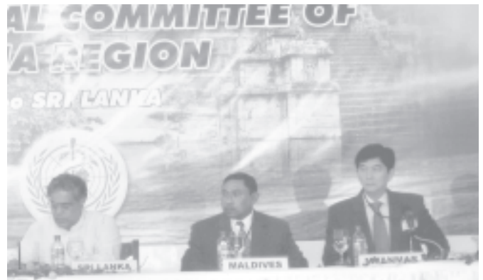
Minister Dr Kyaw Myint attends the 23rd WHO Health Ministers' Meeting on South East Asia Region.

Dr Samlee Plianbangechang extended greetings to those present. The meeting was chaired by Minister of Health of Democratic Republic of Sri Lanka