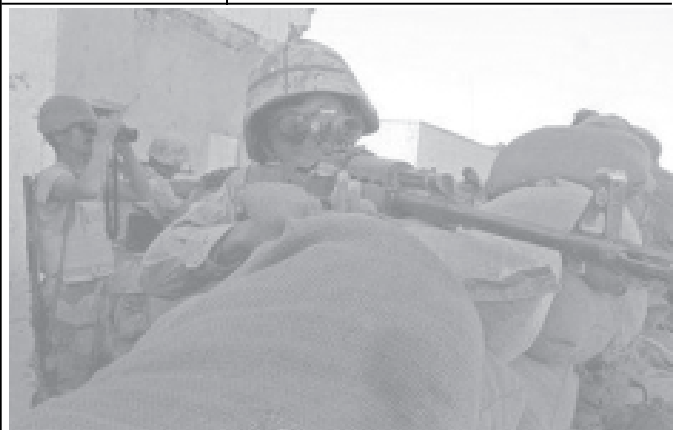
Iraqi soldiers man an observation post in the northern Iraq town of Tal Afar on 11 September, 2005.