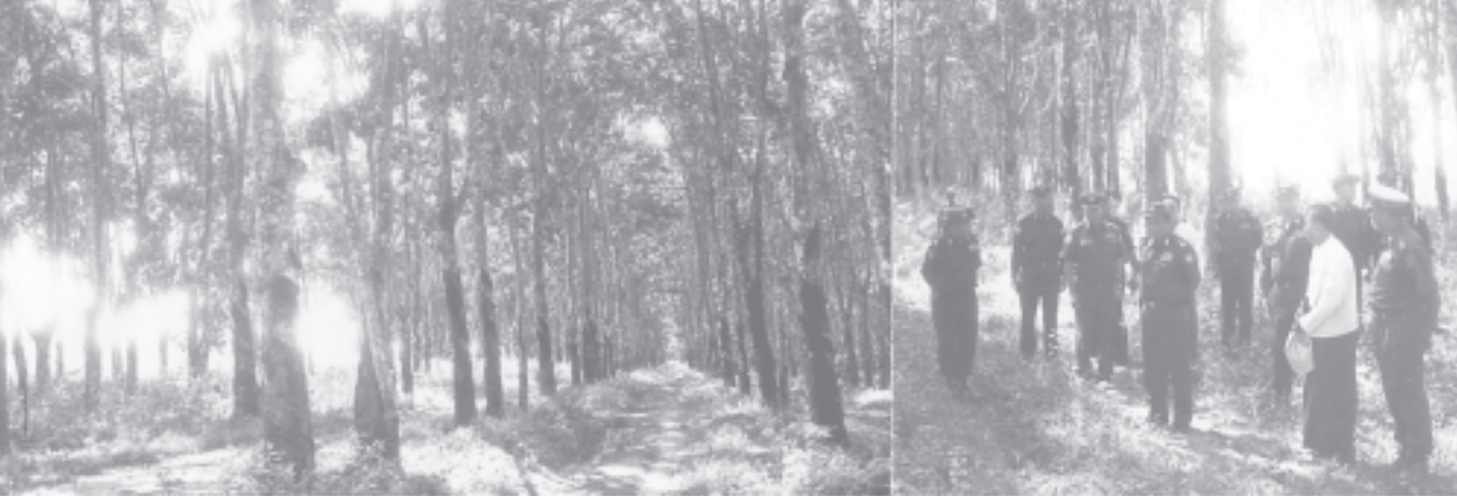
Lt-Gen Ye Myint inspects production process of rubber in the rubber research farm in Naungnan village in Myitkyina.

YANGON, 13 Sept — Member of the State Peace and Development Council Lt-Gen Ye Myint of the Ministry of Defence on 11 September met with departmental officials in Kachin State and members of the supervisory committee for agriculture and gave instructions on agricultural tasks and regional development tasks.