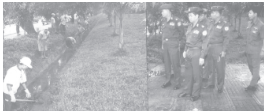
Commander Maj-Gen Myint Swe and Mayor Brig-Gen Aung Thein Lin oversee measures taken for upgrading roads and sanitation in Yangon.

First, they inspected repaving of Parami Road section in South Oakkalapa township and dredging of ditches on both sides of the road with the use of heavy machinery. The commander and the mayor also inspected tarmacking of roads, dredging of ditches and sanitation tasks being carried out in Mayangon Township, Bahan Township and Kyimyindine Township and left necessary instructions to officials. —MNA