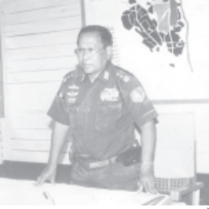
Lt-Gen Ye Myint meets rubber growers at the rubber research farm in Naungnan Village, Myitkyina township. — MNA