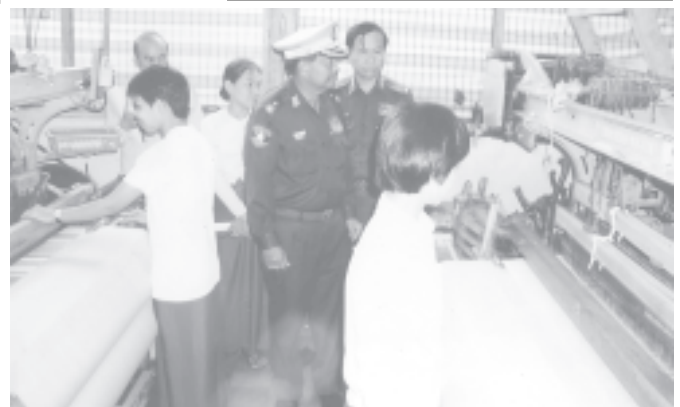
Minister Maj-Gen Sein Htwa inspects the weaving workshop at women development centre.

YANGON, 13 Sept — The second Art Exhibition organized by Shar Nyo was displayed from 4 to 30 September from 6 am to 5 pm at No 84, Daw Phwa Shin Road in Hlinethaya Industrial Zone-1. About 40 abstract paintings were displayed at the exhibition which is the very first of its kind in Myanmar. The modern paintings focus on colour and texture, it is learnt.—NLM