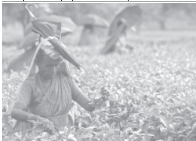
An Indian worker plucks tea leaves at Gulma tea garden estate on the outskirts of northeastern Indian city of Siliguri, on 12 September, 2005. India is one of the top tea producers in the world. —INTERNET

ABC said the young man apparently converted to Islam at an Orange County, California, mosque as a teen-ager. — MNA/Reuters