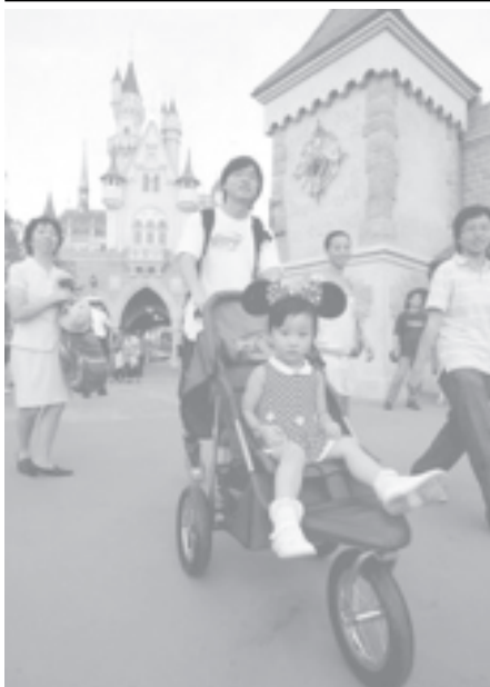
A girl dresses like Minnie Mouse at Hong Kong Disneyland as it celebrates the grand opening in Hong Kong, on 12 September, 2005. —INTERNET

After a state visit to Mexico, Hu will attend the United Nations summit marking the world body's 60th anniversary in New York, and visit the Canadian city of Vancouver on his way back to Beijing. MNA/Xinhua