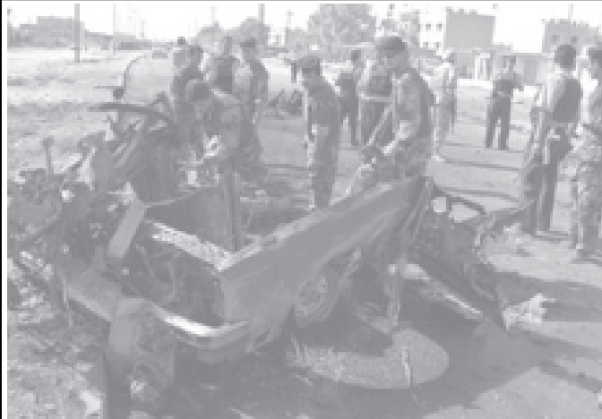
Iraqi police survey the scene following an explosion in the northern city of Kirkuk, some 240 kilometres (150 miles) from Baghdad, on 12 September, 2005. A car bomb exploded in a residential neighbourhood, injuring one person.