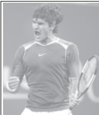
Roger Federer of Switzerland screams after winning the third set during the US Open final against Andre Agassi of the US at the USTA National Tennis Centre in Flushing Meadows, New York. Federer won 6-3, 2-6, 7-6 (7/1), 6-1.