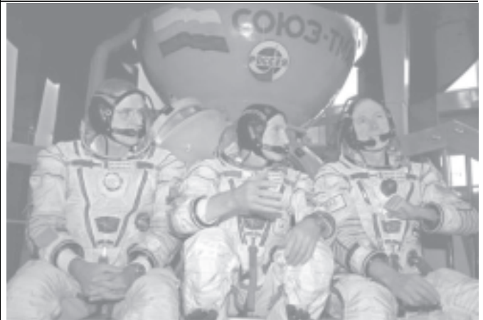
US astronaut William McArthur, Russian cosmonaut Valery Tokarev and US space tourist Gregory Olsen sit in front of a Soyuz replica spaceship and answer reporters' questions ahead of their last day of examinations at the training center in Star City near Moscow on 12 September, 2005. Olsen, McArthur and Tokarev are due to blast off to the International Space Station from Baikonur cosmodrome in October.