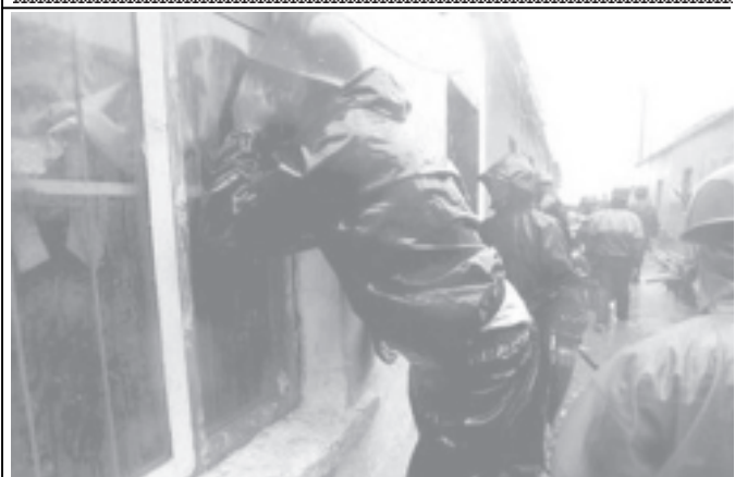
Local officials check and help to evacuate villagers upon the arrival of Typhoon Khanun in Taizhou, east China's Zhejiang Province, on 11 September, 2005.