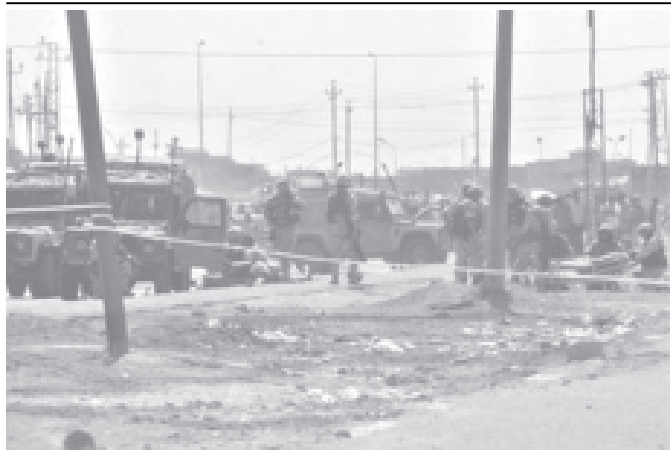
British soldiers secure the area following an explosion in the southern city of Basra, on 11 September, 2005. One British soldier was killed and two were wounded when a roadside bomb exploded near their convoy.