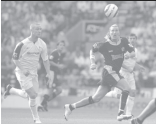
Blackburn's Robbie Savage, centre, keeps an eye on the ball as Bolton's Kevin Nolan, left, looks on during their English Premier League soccer game at the Reebok Stadium, Bolton, England, on 11 September, 2005.