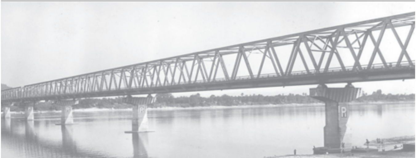
Bala Min Htin Bridge on Ayeyawady River in Kachin State seen on 11-9-2005. (Arrangements are being made to build retaining wall to prevent bank erosion.) (News on Page 16)

Emergence of the State Constitution is the duty of all citizens of Myanmar Naing-Ngan.