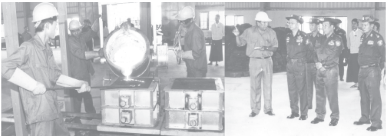
Secretary-1 Lt-Gen Thein Sein views production process of Foundry Shop at Taunggyi (Ayethaya) Industrial Zone.— MNA

YANGON, 11 Sept — Secretary-1 of the State Peace and Development Council Lt-Gen Thein Sein, accompanied by Member of the State Peace and