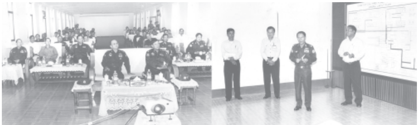
Secretary-1 Lt-Gen Thein Sein hears reports on matters related to Coal-Fired Power Plant by Minister for Electric Power Maj-Gen Tin Htut.

Construction of the machine shop was completed cent per cent. The shop will be installed with 30 machines, and of them 20 have been installed. Now, the shop is under test-running programme. Of them, 80 per cent of machines at the shop is serving orders of private entrepreneurs. On completion of installing the remaining four machines, the shop will conduct its functions on a commercial scale.