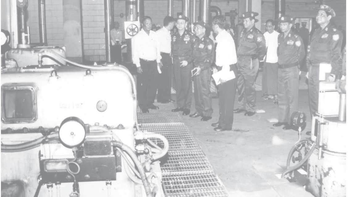
Secretary-1 Lt-Gen Thein Sein inspects turbine room of Coal-Fired Power Plant (Tikyit) near Pyntha Village of Pinlaung Township.— MNA

In-charge of the industrial zone Minister for (See page 8)