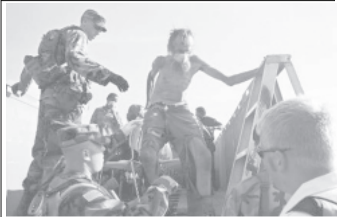
A man who was evacuated from his neighbourhood is helped from a truck at a processing centre in New Orleans on 9 September, 2005. Many residents have remained in the city despite the threat of forced evacuation by authorities.