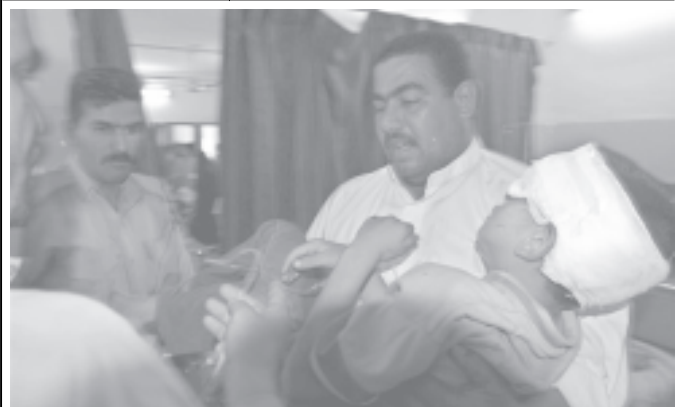
Ten years old boy is taken for treatment to a hospital in Baghdad, on 8 September, 2005.