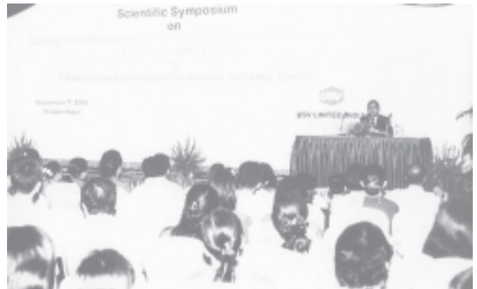
Introduction of new medicine for diabetes in progress.