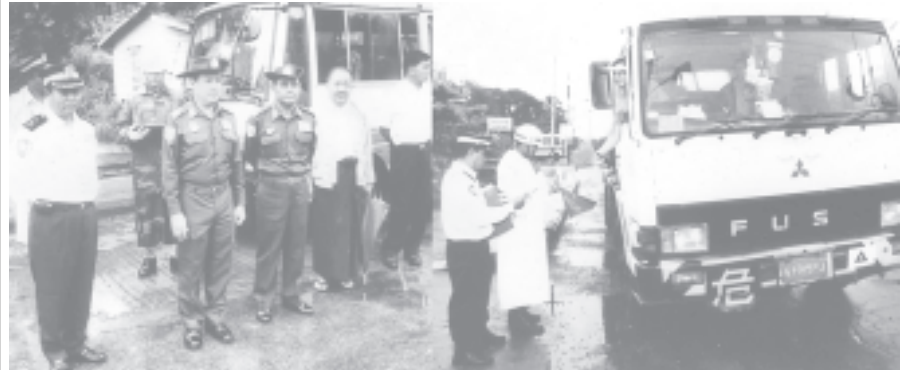
Vice-Chairman of Dry Day Supervisory Committee Minister for Transport Maj-Gen Thein Swe and party supervise tasks of dry day inspection teams.—MNA

YANGON, 11 Sept — Vice-Chairman of the Dry Day Supervisory Committee Minister for Transport Maj-Gen Thein Swe, together with deputy leader of the supervisory group Deputy Minister for Energy Brig-Gen Than Htay, committee members Vice-Adjutant-General Maj-Gen Hla Shwe, Provost Marshal Maj-Gen Saw Hla, senior military officers, departmental heads supervised the functions of inspection teams this morning.