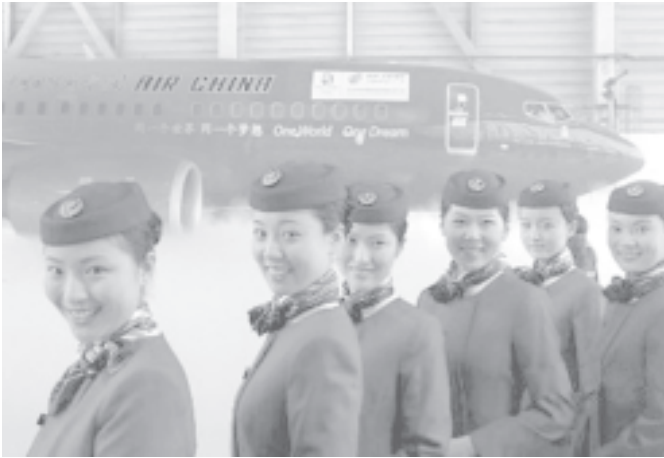
Smiling air stewardesses pose in front of the 2008 Olympic-themed Boeing 737 jetliner owned by Air China in Beijing on 7 September, 2005.—INTERNET