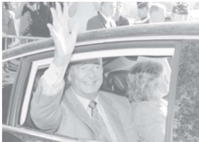
French President Jacques Chirac (L) and his wife Bernadette wave from their car as they leave the Hospital Val de Grace in Paris on 9 September, 2005. French President Jacques Chirac left hospital on Friday and said he felt well after a week's treatment for a blood vessel problem that affected his vision.