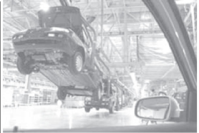
China and India are the largest growth markets worldwide for cars. China is expected to overtake Germany this year as the third largest car manufacturer after the US and Japan while India is today's fastest growing large car market.

"Fortunately the Defence Minister was not in the car at that time, but four persons in the convoy have been arrested in this regard," he added. The Defence Minister, together with some other high-ranking officials, left for Panjshir Valley to pay homage to the late Masood at his home Saturday morning.