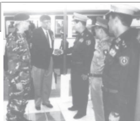
Deputy Commandant of National Defence College Brig-Gen Than Maung welcomes delegation of National Defence College of Bangladesh at the airport.

Sayadaw Agga Maha Pandita Bhaddanta Ingisa of Thakayta Township delivered a sermon, and the congregation shared merits gained.