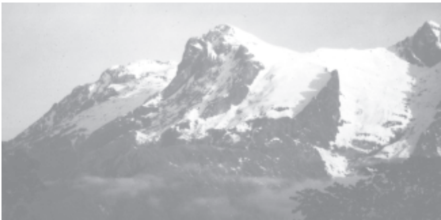
Serene beauty of Phonganrazi ice-capped mountain in Kachin State.