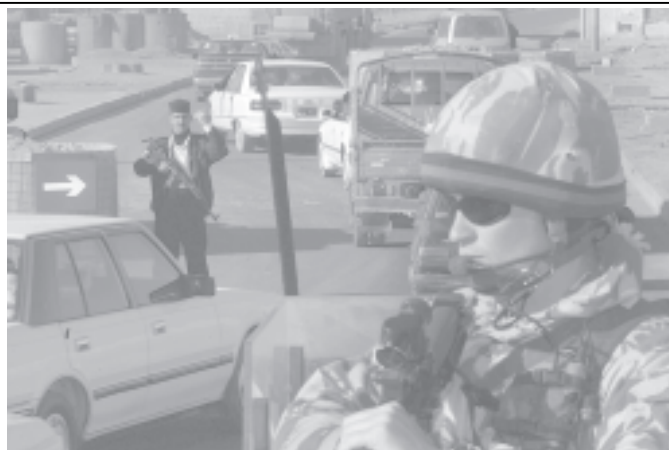
A soldier secures the area after the bomb attack in southern Iraqi City of Basra on 7 September, 2005.

Since 1 May, 2003, when President Bush declared that major combat operations in Iraq had ended, 1,757 US military members have died, according to AP's count. That includes at least 1,361 deaths resulting from hostile action, according to the military's numbers.—Internet