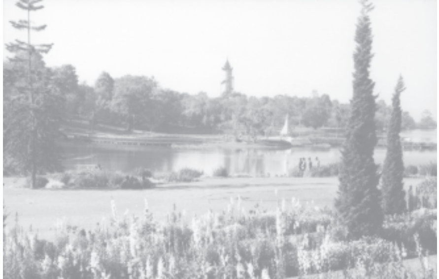
PyinOoLwin Kandawgyi Gardens with diverse species of flowers in bloom.

The distance between Yangon and Pyay, and