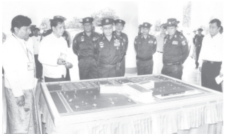
MEC Chairman Secretary-1 Lt-Gen Thein Sein inspects scale model of the main building of Loikaw University.

Of the private industrial zones set up by the Government, modern Foundry Shop, Press Shop, Forging Shop, Machine Shop and Heat Treatment Shop have been built at Taunggyi (Ayethaya) Industrial Zone, Monywa Industrial Zone and Mandalay Industrial Zone. And, they are producing machine parts. As the industrial sector plays an important