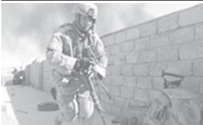
A US soldier runs for cover in Tal Afar on 9 September, 2005.