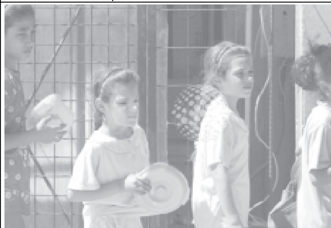
Iraqi girls que in line at a food distribution centre in Baghdad on 9 September, 2005.

Sheehan embarked on a 25-state bus tour after keeping vigil at Bush's ranch in Crawford, Texas, for nearly a month. The tour will end in the nation's capital on 24 September, when anti-war protesters plan a major demonstration.