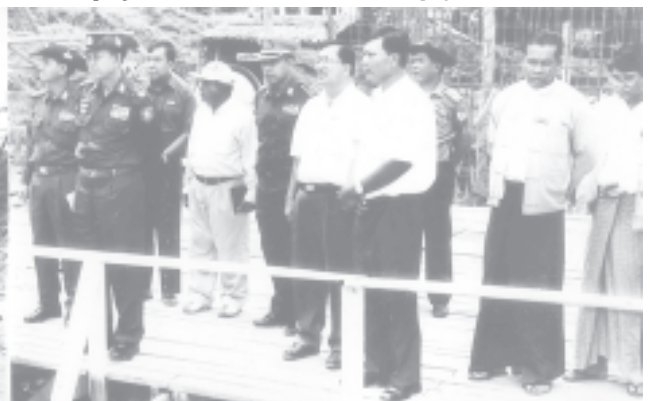
Lt-Gen Khin Maung Than oversees construction of Thayetabin Bridge on Yangon-Sittway Road.