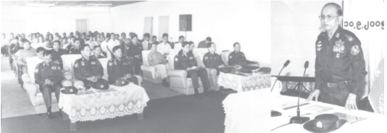
Secretary-1 Lt-Gen Thein Sein meets the chairman of the industrial zone supervisory committee and entrepreneurs at Taunggyi (Ayethaya) Industrial Zone.