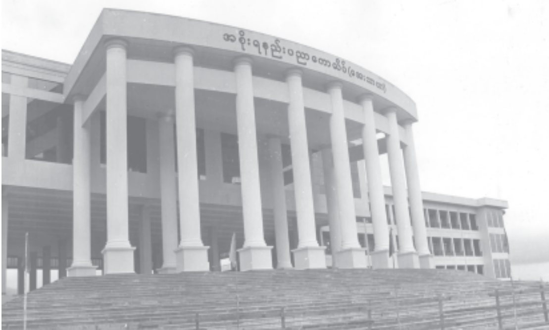
Completion of three-storey main building at Government Technological College (Ayethaya) in Taunggyi.

Emergence of the State Constitution is the duty of all citizens of Myanmar Naing-Ngan.