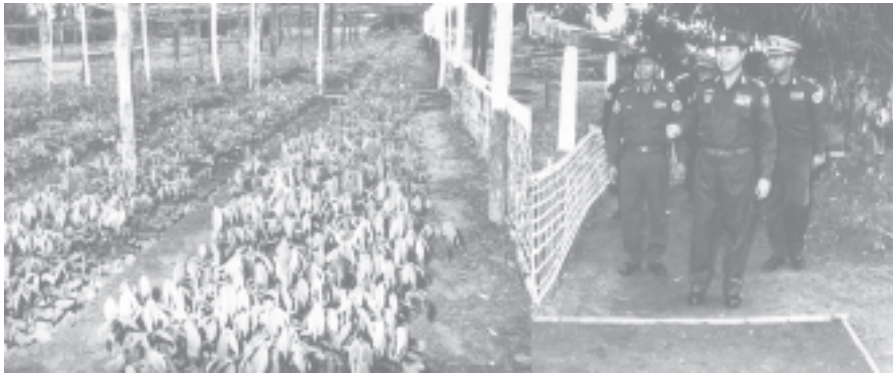
Lt-Gen Khin Maung Than visits rubber nursery in Kyauktaw Station.