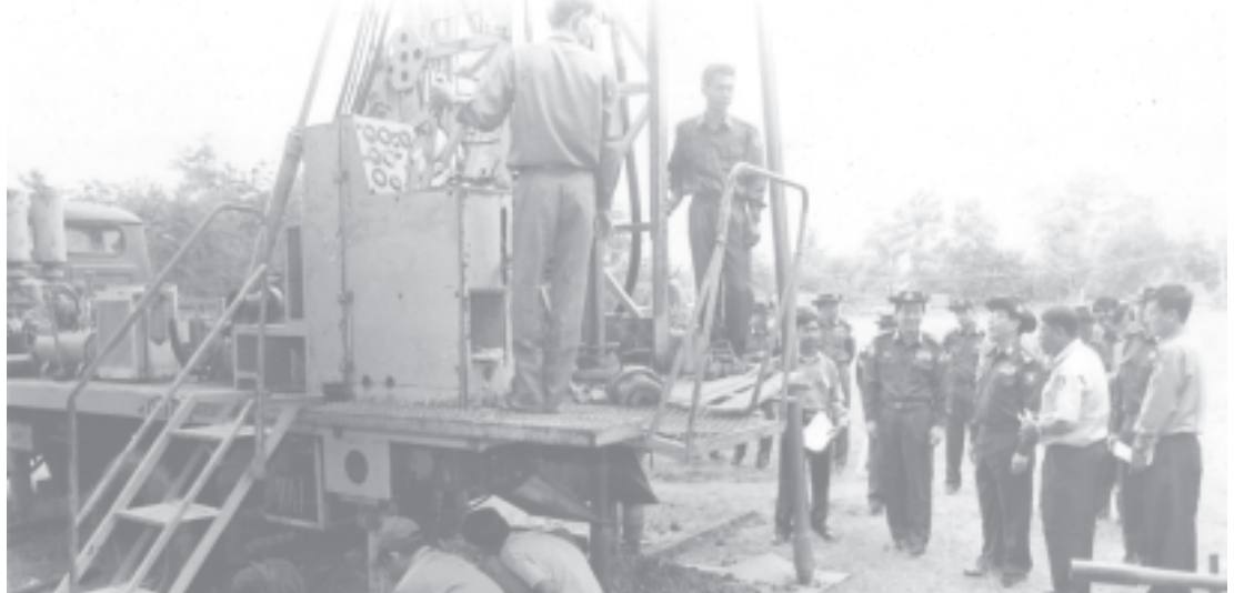
Prime Minister General Soe Win views the sinking of a tube-well in Pauk. — MNA

Although large creeks such as Kyaw and Yaw pass through the district, there are limits to use their waters for irrigation. Moreover, it is important to tap and conserve the natural resources, as nature conservation and regional development have interrelations. The ongoing dry regional greening project covers the task of beautifying Tantkyi, Tetma and Kyaukhsin hills lying in Pakokku District, and small dams are being built at possible places and water pumping stations installed along the banks of Ayeyawady and Chindwin rivers