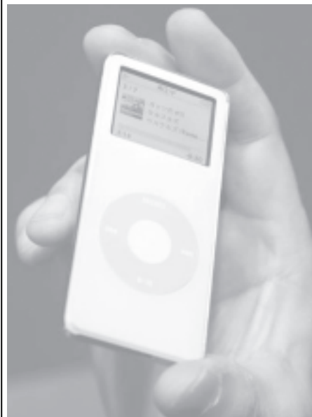
An Apple Computer Inc employee holds the new digital music player 'iPod Nano' at a news conference in Tokyo on 8 September, 2005.—INTERNET

"The Chinese Government will consider to mobilize resources within our means to assist the littoral states at their request in the areas of capacity building, technical exchanges and personal training," he said. — MNA/Xinhua