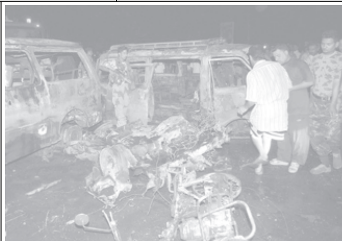
Iraqi police survey the scene after a late-night explosion in the southern Iraqi city of Basra, on 7 September, 2005.

The report said "attacks, threats and intimidation against project contractors and subcontractors" were to blame. A quarter of the $200m-worth of completed US-funded water projects handed over to the Iraqi authorities no longer worked properly because of "looting, unreliable electricity or inadequate Iraqi staff and supplies", the report found.—Internet