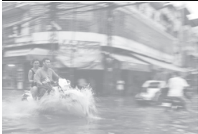
Tourists ride through floodwaters in Phnom Penh on 7 September, 2005. Heavy rainfall overburdened the capital's old sewer systems, causing floods in the capital.

The top Saudi diplomat said his country will seek the endorsement of this proposal at the coming UN General Assembly. — MNA/Xinhua