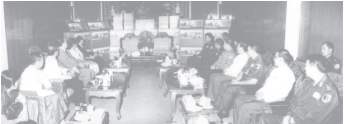
Minister Brig-Gen Kyaw Hsan expresses thanks at the ceremony to donate TV sets and medicines for rural people, Tamadawmen and members of Myanmar Police Force. — MNA

Next, Minister for Information Brig-Gen Kyaw Hsan explained cent per cent development tasks for all parts of the nation being carried out by the Government, undertaking of ru-