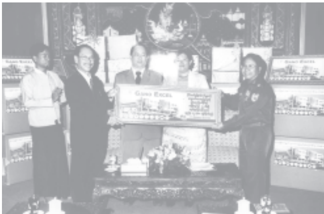
Minister Brig-Gen Kyaw Hsan accepts TV sets and medicines donated by officials of Gano Excel Enterprise SDN BHD.