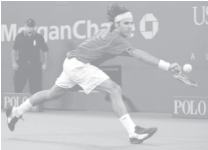
Switzerland's Roger Federer lunges to make a return to Argentina's David Nalbandian in their quarterfinal tennis match at the US Open tennis tournament in Flushing Meadows, New York, on 8 September, 2005.