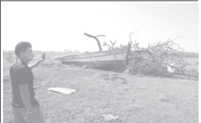
A man finds his boat on land, where it was carried by Hurricane Katrina, in Clermont Harbor, Mississippi on 8 September, 2005.