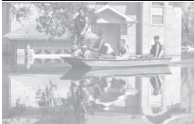
Members of the South Carolina game warden patrols on a boat during a rescue mission in the Gentilly neighborhood of New Orleans, Louisiana on 7 September, 2005.