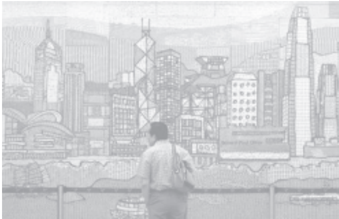
A man looks at part of a gigantic stamp mosaic, measuring 6.45 metres long and 3.97 metres high, featuring the skyline of Hong Kong island, displayed at Hong Kong Post Headquarters in Hong Kong on 8 September, 2005.