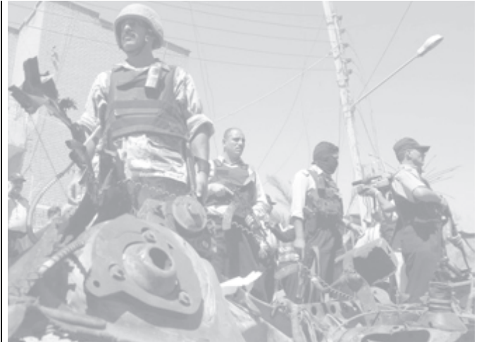
Iraqi police survey the scene following an explosion in Baghdad, on 8 September, 2005.