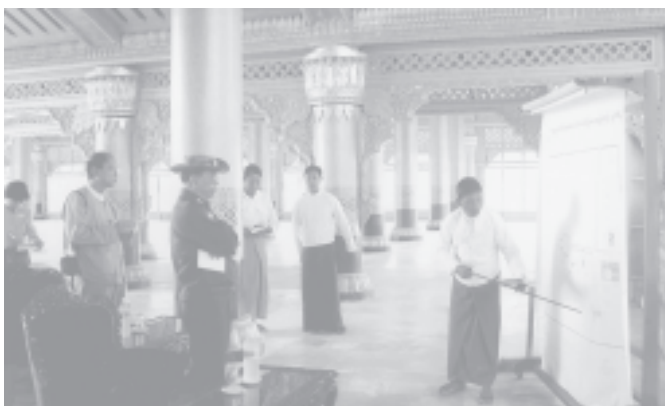
Minister for Culture Maj-Gen Kyi Aung visits Kanbawzathadi Palace in Bago — MNA

He also inspected arrangements being made for the greening of the environs of the palace. — MNA