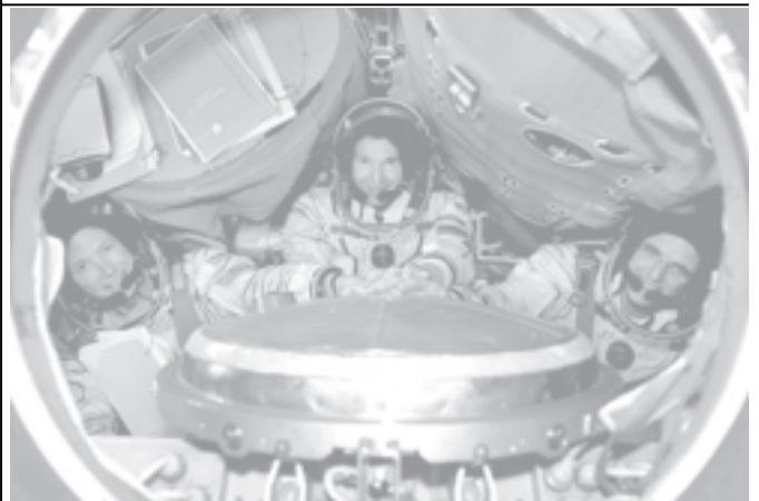
US Space tourist Gregory Olsen (L), Russian cosmonaut Valery Tokarev (C) and US astronaut William McArthur look out of a Soyuz TMA spacecraft simulator in Star City outside Moscow, on 7 September, 2005.