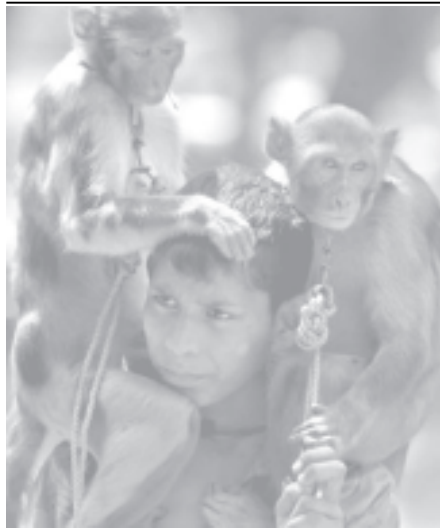
A 13 year old Indian boy sits inside the premises of a school with his monkeys in the northern Indian city of Chandigarh on 8 September, 2005.