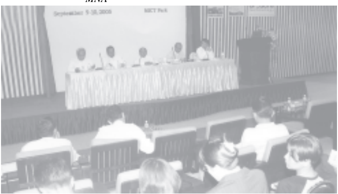
The annual conference of Myanmar Computer Professionals Association in progress.