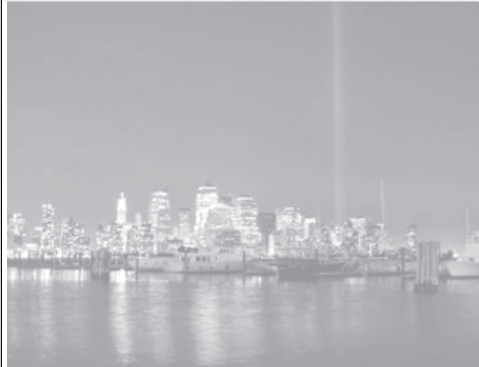
Twin beams of light known as the "Tribute in Lights" are tested at the former site of the World Trade Centre in New York on 7 September, 2005.