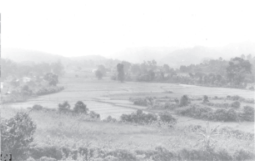
Lt-Gen Kyaw Win inspects the thriving Shweyina paddy strains at the entrance to Mongpon.