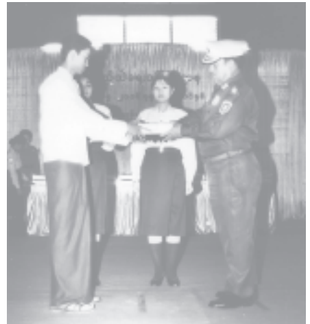
Minister Maj-Gen Maung Oo presents gift to a student who passed matriculation exam with six distinctions. — MNA

YANGON, 9 Sept — The 7th prize-distribution ceremony in conjunction with the ceremony to present stipend to the students for 2005-2006 academic year and prizes to the outstanding athletes of the social committee under the Ministry of Home Affairs, took place at the gymnasium on Kyaikwaing Pagoda Road in Mayangon Township this afternoon, attended by Minister for Home Affairs Maj-Gen Maung Oo.