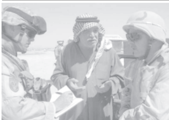
US soldiers check an Iraqi at a checkpoint in Baghdad recently.