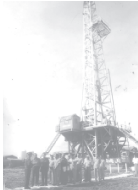
Minister for Energy Brig-Gen Lun Thi inspects drilling of No 27 Well and production of natural gas at Nyaungdon Oil and Gas Field.— ENERGY

Field, which produce 100 million cubic feet of gas and 800 barrels of condensate daily.— MNA