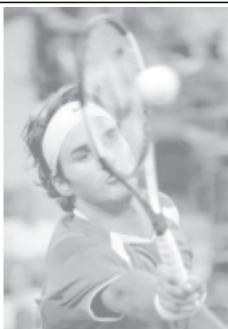
Switzerland's Roger Federer returns a shot to France's Fabrice Santoro during their second round match at the US Open tennis tournament in Flushing Meadows, New York, on 2 September, 2005. Federer defeated Santoro 7-5, 7-5, 7-6.