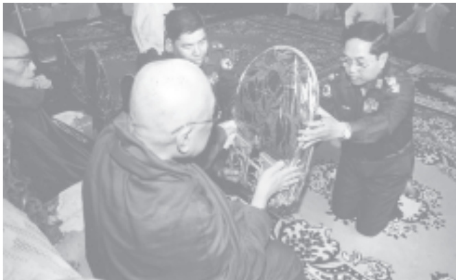
Commander Maj-Gen Myint Swe offers alms to a Sayadaw.