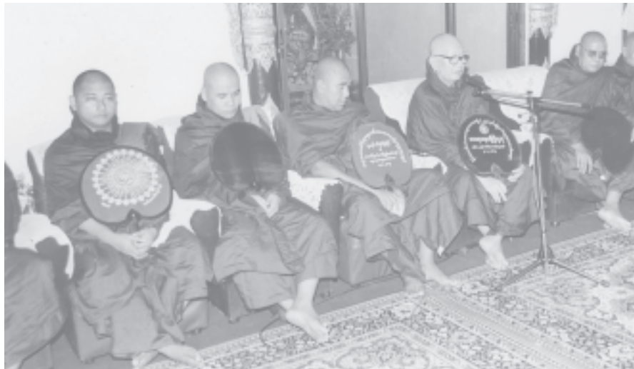
Secretary-1 Adjutant-General Lt-Gen Thein Sein and party share merits gained at the ceremony to donate provisions to 10 monasteries and a nunnery in Hlinethaya Township.