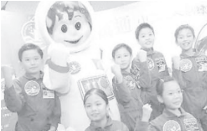
The six kids who took a "moonwalk" recently pose for photographers at a Press conference in Hong Kong on 29 August, 2005.