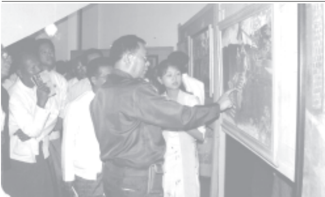
Culture Minister Maj-Gen Kyi Aung views works of the graduate students of University of Culture (Mandalay).— CULTURE

The Government emphasizes development of the region by building factories. Thanks to construction of the factories, local people have the job opportunities. In the education and health sector, universities and hospitals have been opened and upgraded in the region.