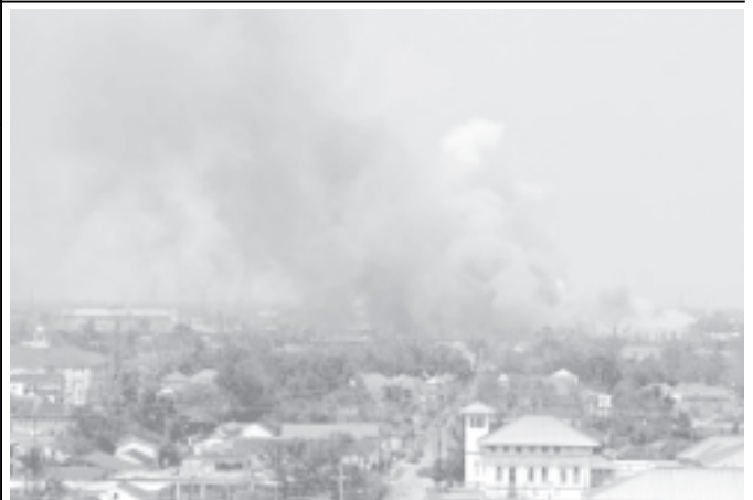
Fires burn in New Orleans five days after Hurricane Katrina hit the city, on 2 September, 2005. —INTERNET

Zhang made the remarks at a Press conference in response to a question from the Associated Press whether the Chinese Mainland would not threaten Taiwan with its nuclear weapons. — MNA/Xinhua