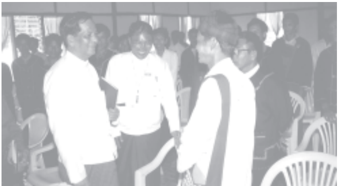
Education Minister Dr Chan Nyein meeting with headmasters, headmistresses and members of the school boards of trustees in Kengtung Township. —EDUCATION

The minister met education staff at No 3 BEHS in Kengtung. On 3 September, the minister also inspected basic education schools and donated exercise books and stationery for the students.—MNA