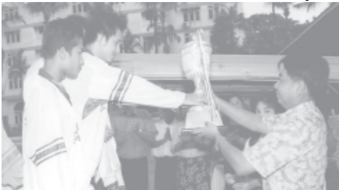
Deputy Minister Brig-Gen Aye Myint Kyu presents the championship trophy to Sports & Physical Education Institute Team (A).

YANGON, 4 Sept — Final team events of swimming contest for 2005 took place this evening at National Swimming Pool here.