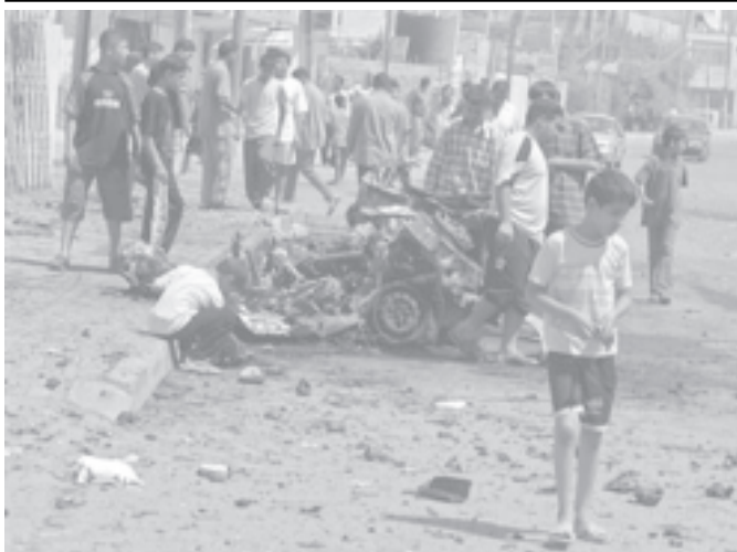
Iraqis look at the damage caused by a car bomb that exploded in the Al A'adamea District of Baghdad on 2 September, 2005. —INTERNET

It was not immediately clear how long it would take to repair the line and bring it back to full capacity.—Internet