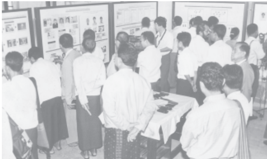
Local and foreign journalists and mediemen study evidences and documentary photos displayed at the Press Conference (6/2005) of the Information Committee of the State Peace and Development Council on 28-8-2005.