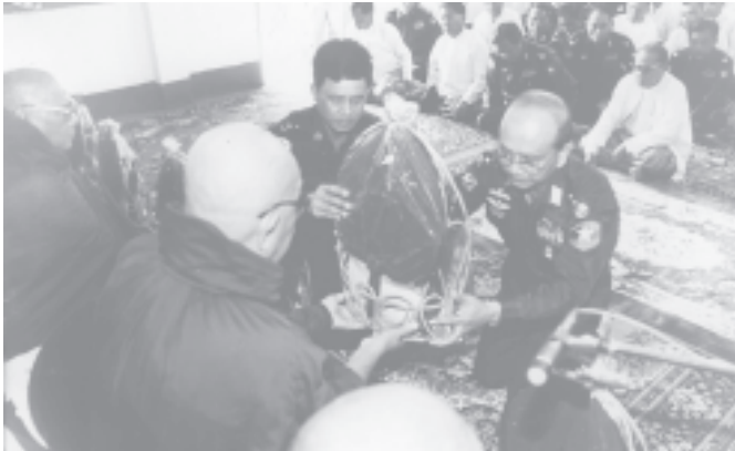
Secretary-1 Lt-Gen Thein Sein offers alms to a Sayadaw at the ceremony to donate provisions to monasteries and a nunnery of Hlinethaya Township.