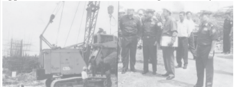
Commander Maj-Gen Soe Naing and Minister for Construction Maj-Gen Saw Tun inspect construction of approach railroad of Thanlwin Bridge (Mawlamyine) on Mottama Bank. — CONSTRUCTION

YANGON, 4 Sept—Chairman of Mon State Peace and Development Council Commander of South-East Command Maj-Gen Soe Naing and Minister for Construction Maj-Gen Saw Tun inspected construction of approach railroad at Thanlwin Bridge (Mawlamyine) of Public Works on 3 September.