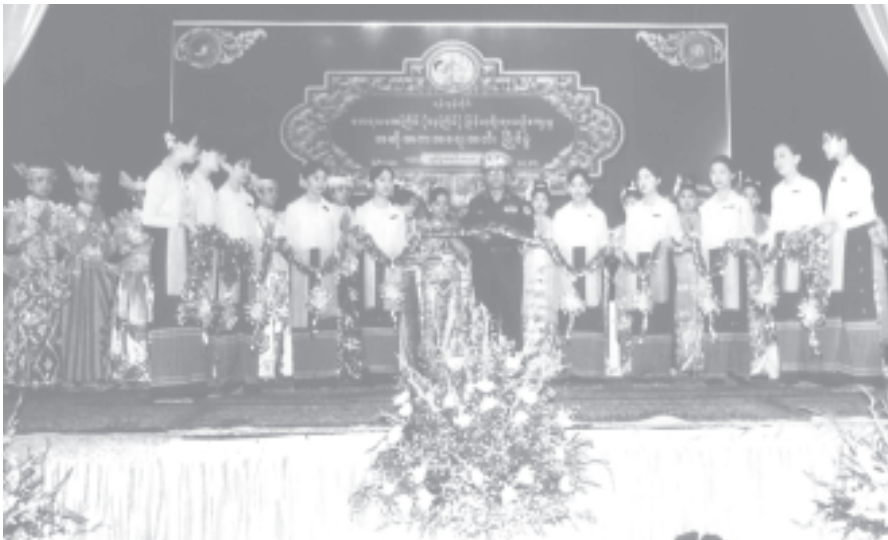
Commander Maj-Gen Myint Swe cuts the ribbon at the opening ceremony of 13th Myanmar Traditional Cultural Performing Arts Competitions of Yangon Division. —MNA

A total of 322 artistes are taking part in the competitions. — MNA