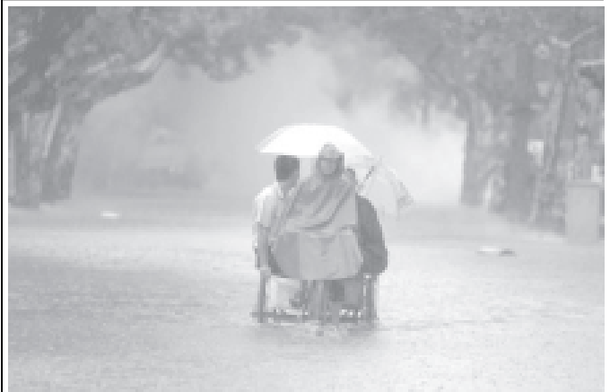
A Chinese man rides a tricycle on a flooded street in Hefei, east China's Anhui Province, on 3 September, 2005.