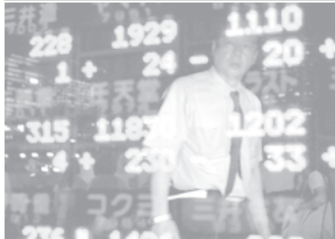
A Japanese man gazes at stock prices lit up outside a brokerage in Tokyo on 1 September, 2005.