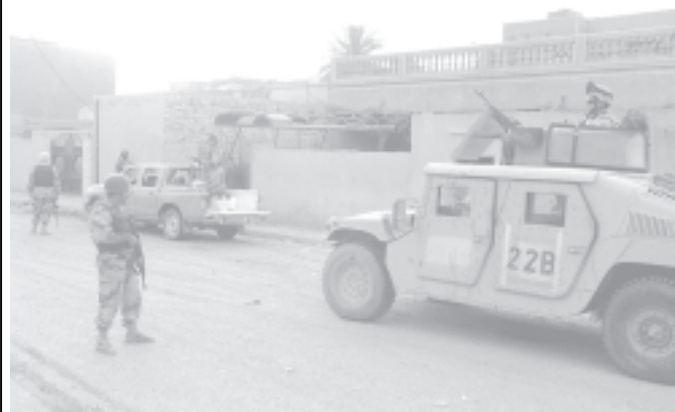
Troops on patrol as US military deaths in the Iraq war rose in August to the highest monthly total since January.

The British military has reported 93 deaths; Italy, 26; Ukraine, 18; Poland, 17; Bulgaria, 13; Spain, 11; Slovakia, three; El Salvador, Estonia, Thailand and the Netherlands, two each; and Denmark, Hungary, Kazakhstan and Latvia one death each. Since 1 May, 2003, when President Bush declared that major combat operations in Iraq had ended, 1,749 US military members have died, according to AP's count. That includes at least 1,355 deaths resulting from hostile action, according to the military's numbers.—Internet