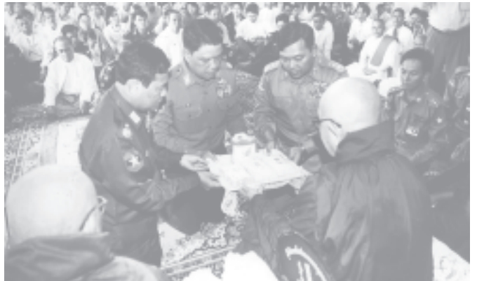
Maj-Gen Hla Shwe, Commodore Nyan Tun and Col Chan Maung donate offerings to a Sayadaw. — MNA

for the monasteries and a nunnery in Hlinethaya Township amounted to 509 bags of rice, 119 viss of edible oil, 195 viss of gram, 1,088 viss of iodized salt, 218 tubes of tooth paste, 1,815 bottles of tradi-tional medicines, 1,136 bars of soap, 1,088 cakes of soft soap, 54 bags of dry fish, 11 boxes of pep-per powder, 250 packets of Top brand detergent and K 5,534,850. — MNA