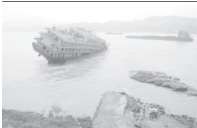
A cruise ship that had run aground because of fog breaks into two and is stranded in a river in southwest China's Chongqing municipality on 1 September, 2005. All 160 people aboard the ship were saved and moved to a safe place.

One person had died as a result in Jiangxi Province, the Beijing News said. Chinese authorities had evacuated hundreds of thousands of people from their homes as they braced for the typhoon, which weakened into a tropical storm on Friday.— MNA/Reuters