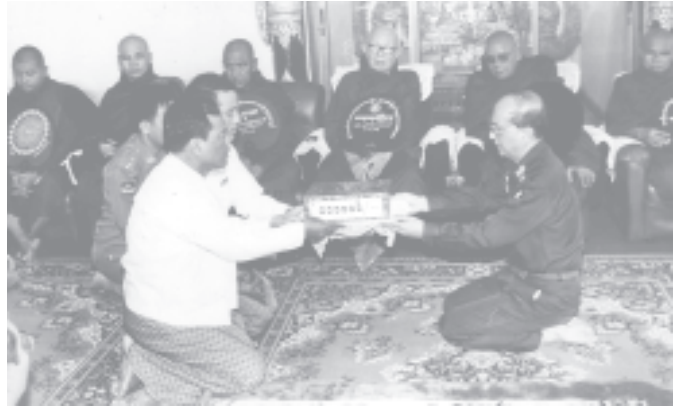
Secretary-1 Lt-Gen Thein Sein accepts cash donations from a wellwisher.