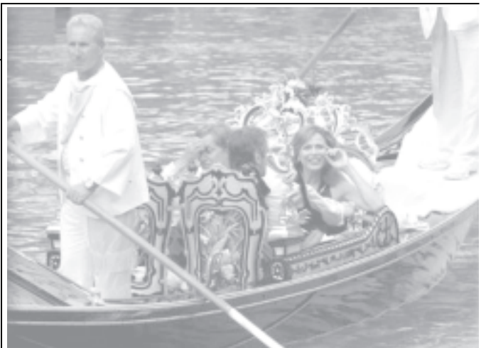
British actor Jeremy Irons (seated 2nd R), Swedish actress Lena Olin (seated R) and director Lasse Hallstrom arrive on a traditional gondola to attend a photocall in Venice on 3 September, 2005. Irons and Olin are starring in Hallstrom's latest movie "Casanova", which is showing at the Venice film festival.