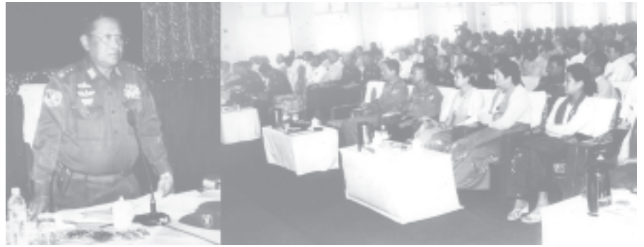
Lt-Gen Ye Myint meeting with departmental officials and members of social organizations at the City Hall in Magway.

Officials presented reports on water supply tasks of the project, cultivation of monsoon paddy and power supply