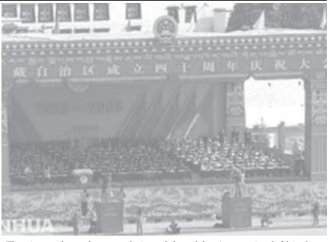
The picture shows the general view of the celebration meeting held in front of the Potala Palace in Lhasa, capital of southwest China's Tibet Autonomous Region, on 1 September, 2005.

The burned fisherman, Yi Fulai by name, is still under treatment.