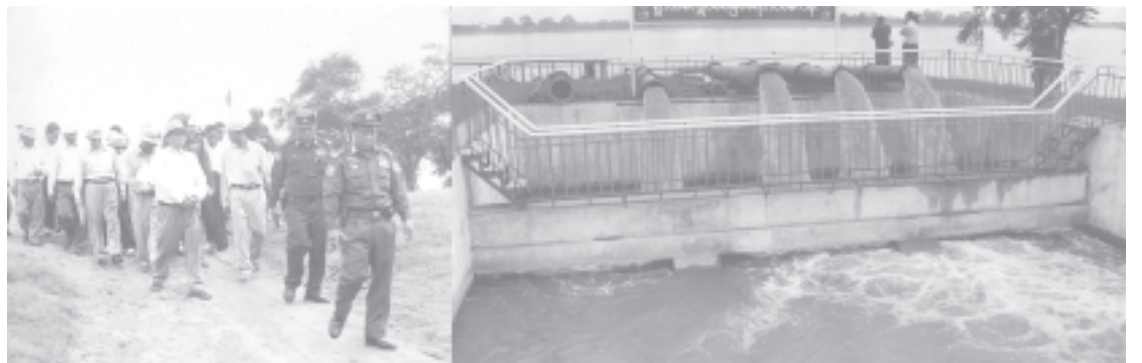
Lt-Gen Ye Myint on his inspection tour of Ywathit River Water Pumping Station Project in Ngazun Township. — MNA

At Ngathayauk river water pumping project, Lt-Gen Ye Myint inspected flow of water into main canal of the project and irrigation of the project. — MNA