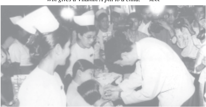
Minister Dr Kyaw Myint gives a Vitamin A pill to a child.

people, the nutrition week activities achieved remarkable successes in 2003 and 2004.