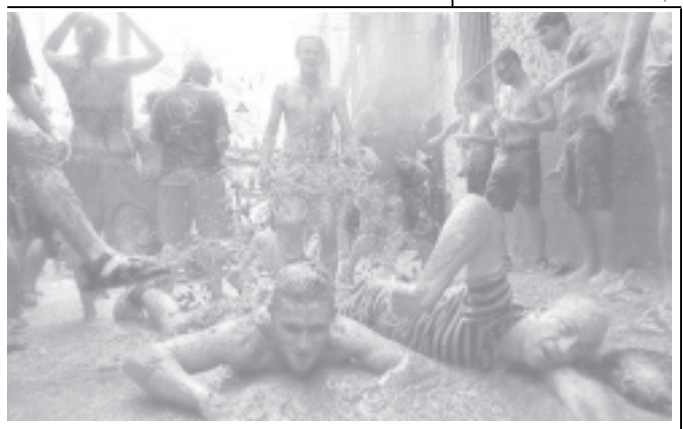
Revellers swim in tomato pulp during the annual 'Tomatina' (tomato fight) in the Mediterranean village of Bunol, near Valencia, in Spain on 31 August, 2005