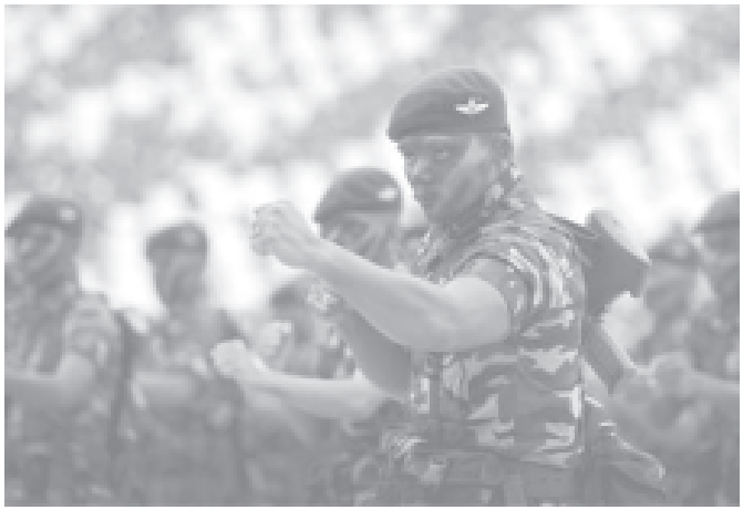
Malaysian military personnel perform during a rehearsal for the country's National Day celebrations in Putrajaya outside Kuala Lumpur on 29 August, 2005. Malaysia will celebrate the 48th anniversary of its independence on Wednesday.