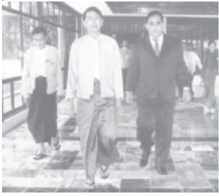
NPED Deputy Minister Col Thurein Zaw being seen off at the airport. — MNA

The deputy minister was seen off at Yangon International Airport by Minister for National Planning and Economic Development U Soe Tha, departmental officials and families. — MNA