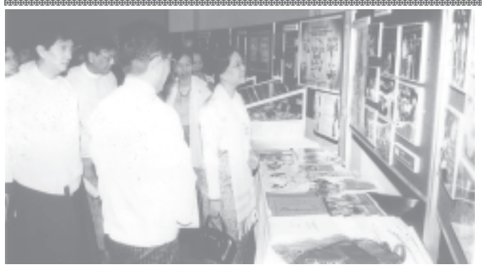
Minister Dr Kyaw Myint and guests observe photos of nutrition week activities after the opening ceremony.

YANGON, 1 Sept -The Ministry of Health, the Ministry of Mines, UNICEF and WHO launched Nutrition Week activities at a ceremony held at the International Business Centre on Pyay Road here this morning.