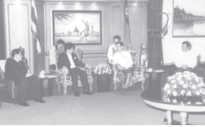
Minister for Foreign Affairs U Nyan Win meets with Thai counterpart Dr Kantathi Suphamongkhon and party.

YANGON, 1 Sept -Visiting Thai delegation led by Dr Kantathi Suphamongkhon, Minister for Foreign Affairs of the Kingdom of Thailand called on his counterpart Foreign Minister U Nyan Win at the latter's office