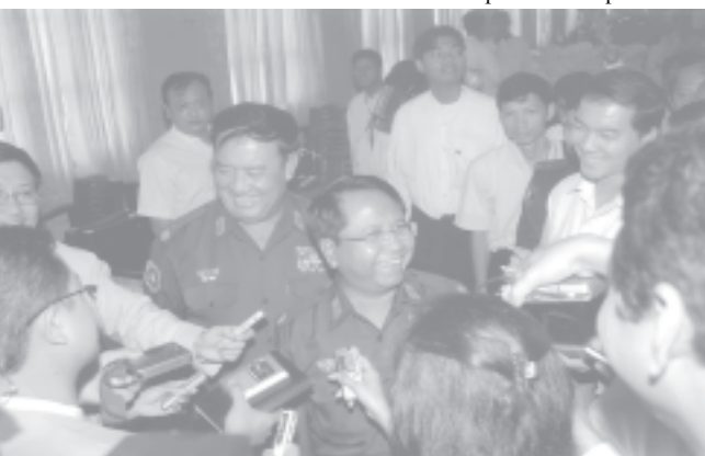
Minister for Information Brig-Gen Kyaw Hsan answers the queries raised by journalists at Press Conference 6/2005.—MNA

I will now conclude my article, with the message "All the media persons of Myanmar are to launch media counter-offensive against the media attacks of internal and external destructive elements", while documenting the ever-flourishing mutual trust and love between the government and the people.