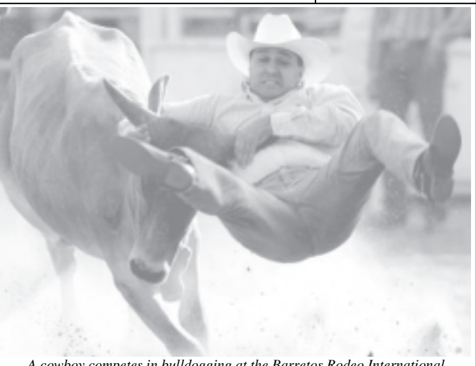
A cowboy competes in bulldogging at the Barretos Rodeo International Festival in Barretos, about 438 km (272 miles) northwest of Sao Paulo, on 28 August, 2005.