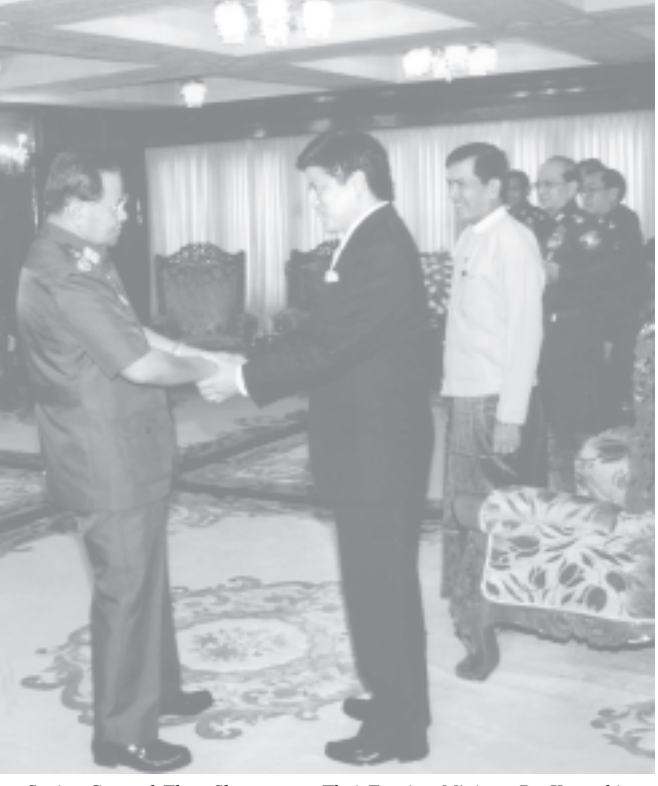
Senior General Than Shwe greets Thai Foreign Minister Dr Kantathi Suphamongkhon.

Credentials Hall of the | the State Peace and Development Council General Thura Shwe Mann, Prime Minister General Soe Win, Secretary-1 of the State Peace and Development Council Lt-Gen Thein Sein, Minister for Foreign Affairs U