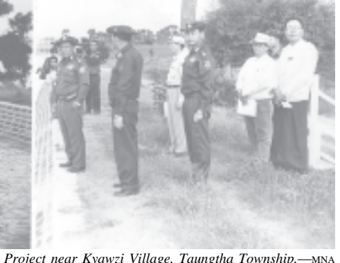
Lt-Gen Ye Myint supervises tasks at Kyawzi River Water Pumping Station Project near Kyawzi Village, Taungtha Township.