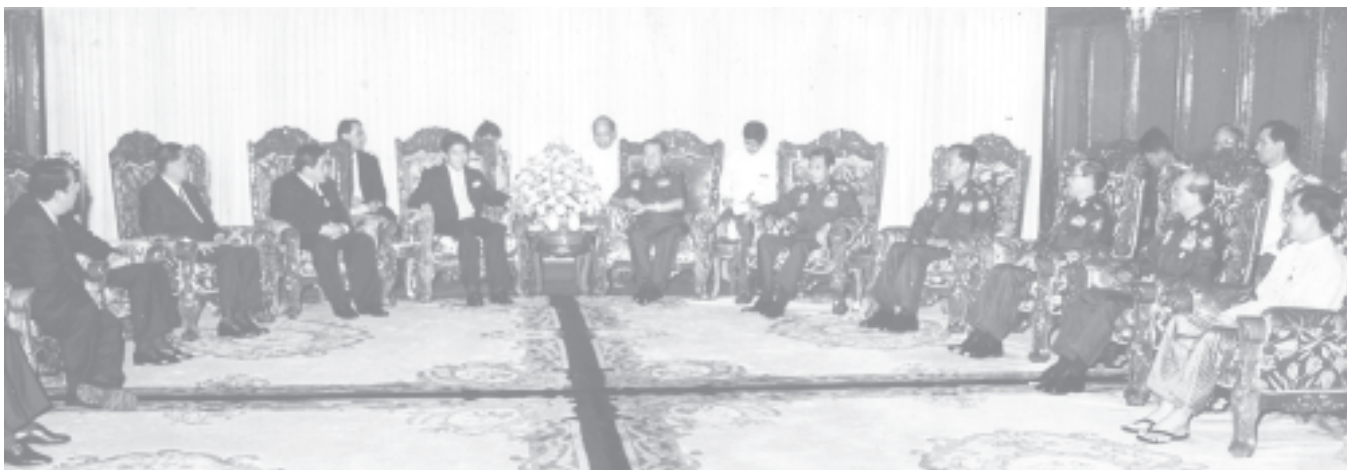
Senior General Than Shwe receives visiting Thai Foreign Minister Dr Kantathi Suphamongkhon and party

Emergence of the State Constitution is the duty of all citizens of Myanmar Naing-Ngan.