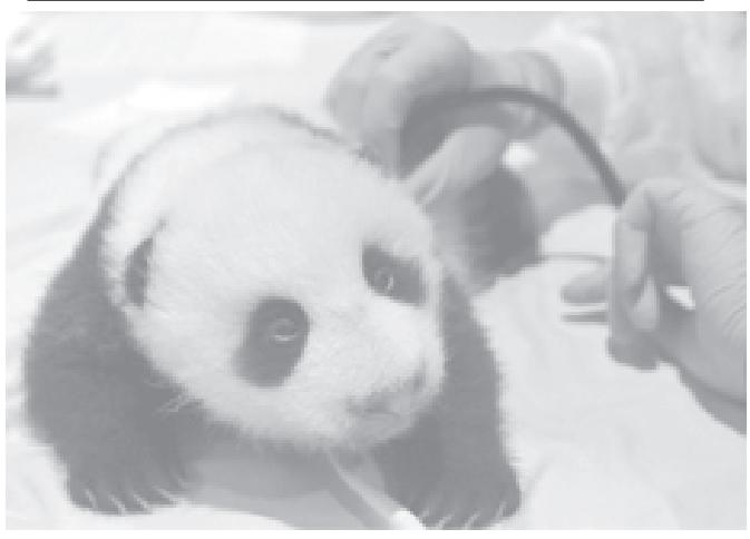
The National Zoo's seven-week-old male giant panda cub undergoes its fourth health exam in Washington 30 August, 2005.

In 2000, the National Assembly unanimously agreed to ratify the nuclear test ban treaty, aligning Cambodia with most of the world's nations in a global campaign aimed at preventing nuclear proliferation. MNA/Xinhua