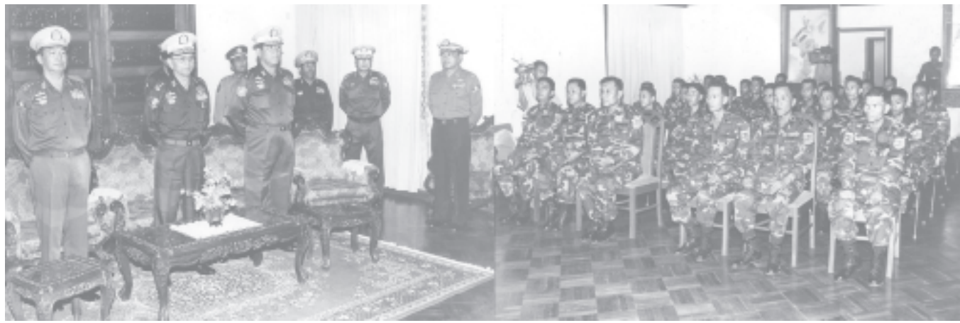
Secretary-1 Lt-Gen Thein Sein exhorts the Myanma Tatmadaw shooting team to compete inthe 15th ASEAN Countries Defence Services (Army) Shooting Contest to be held in Darussalam of Brunei. (News on page 16)