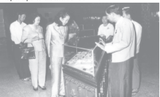
Visiting Thai Minister for Foreign Affairs Dr Kantathi Suphamongkhon's wife and party visit Myanma Gems Mart on Kaba Aye Pagoda Road.