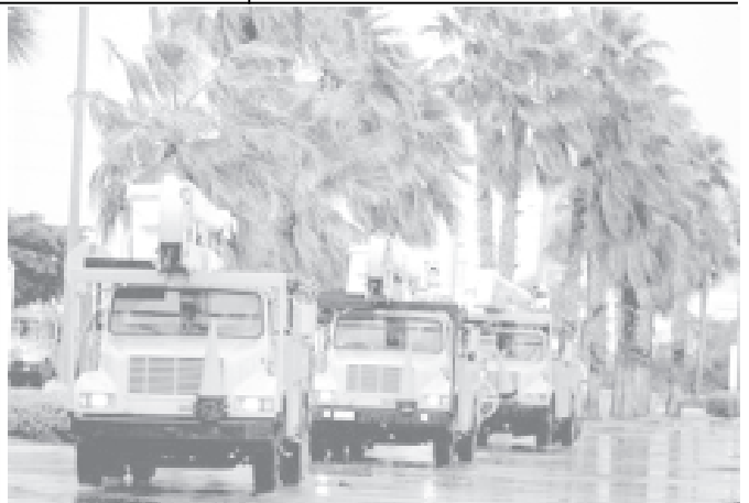
Trucks arrive in Cutler Ridge, Florida, a Miami suburb, after Hurricane Katrina passes through an area on 26 August, 2005.