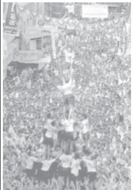
Indian devotees form a human pyramid as they try to break a clay pot containing butter during celebrations for the Hindu festival 'Janmashtami' in Mumbai on 27 August, 2005.