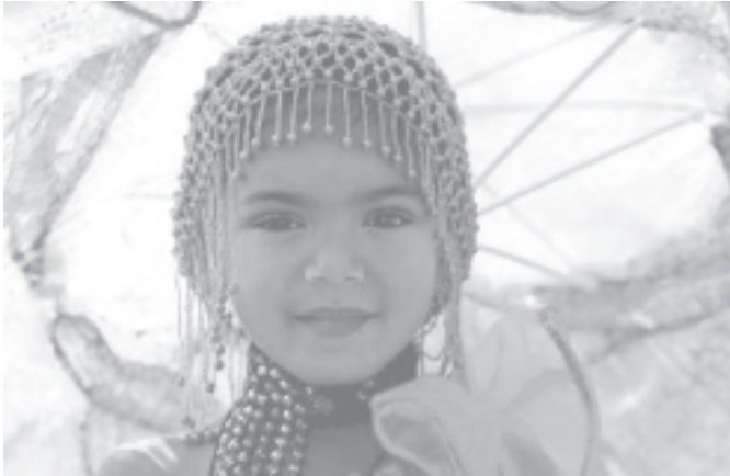
A young girl smiles at the annual Notting Hill Carnival in London, on 28 August, 2005.