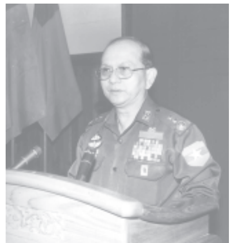
Secretary-1 Lt-Gen Thein Sein addresses opening of special refresher course No 23 for basic education teachers.

Till now the nation is not totally free from the evil legacy of the colonial subjugation, personality cult and ideological and racial prejudices. She is still in the process of freeing totally herself from those evil legacies. She is also warding off the attempts to dominate her by trying to break up national unity, and drive in a wedge to weaken and break up the Union for recurrence of the evil situation the nation faced soon after regaining independence.