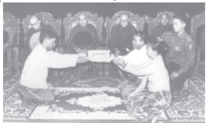
Deputy Minister for Religious Affairs Brig-Gen Thura Aung Ko accepts cash donation at a ceremony to donate provisions to six monasteries in Ahlon Township.