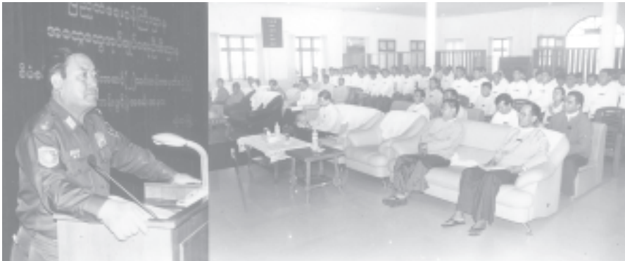
Minister Maj-Gen Maung Oo addresses opening ceremony of Management Course No 3 (Grade-2) of the General Administration Department.

YANGON, 29 Aug — Management Course No 3 (Grade-2) of the General Administration Department-GAD was opened this afternoon at the training school of the General Administration Department in Mingaladon Township with an opening address by Minister for Home Affairs Maj-Gen Maung Oo.