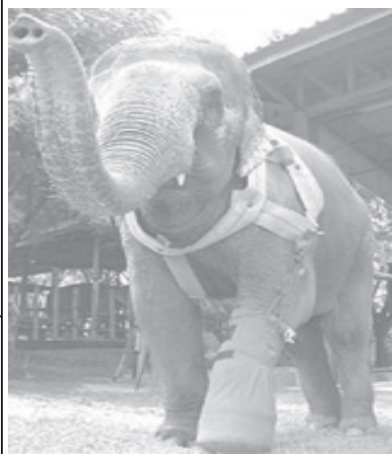
A Thai elephant who lost a foot after stepping on a landmine six years ago has had a temporary limb fitted. Motala will have daily practice walking with the limb, say vets.