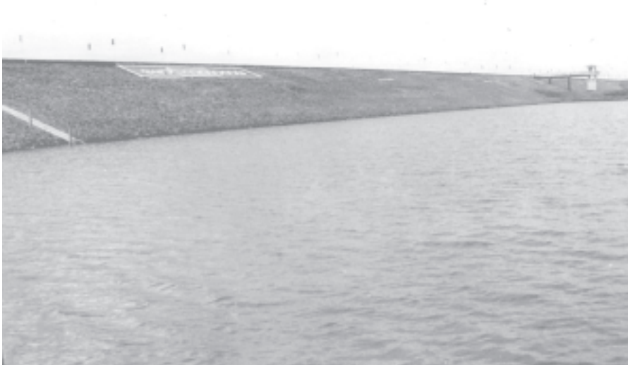
Phaungkata Dam in Salingyi Township, the 177th facility built after 1988. — MNA

The government constructed a large number of dams and reservoirs one after another the length and breadth of the nation for development of agriculture and the Phaungkata Dam is 177th of its kind. The dam will be able to benefit about 1,500 sown acreage in Salingyi Township,