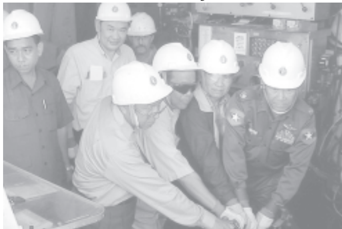
Minister Brig-Gen Lun Thi starts the drilling of Zawtika (1) test well at the work site No M-9 of Mottama offshore oil exploration. — ENERGY

PTTEPI Co will continue drilling the new test oil wells in 2005-2006.—MNA