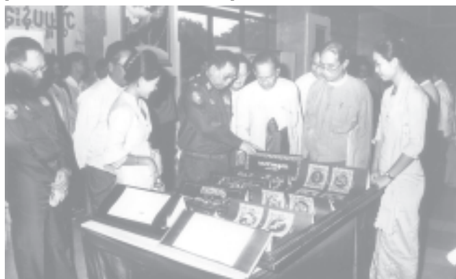
Culture Minister Maj-Gen Kyi Aung and party view works of students from Yangon University of Culture, displayed at National Theatre.