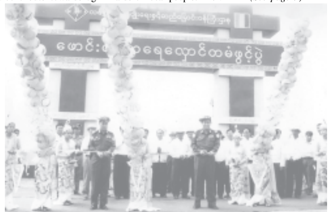
Commander Maj-Gen Tha Aye and Minister Maj-Gen Htay Oo formally open the Phaungkata Dam in Salingyi Township

government is encouraging the agriculture sector (See page 9)