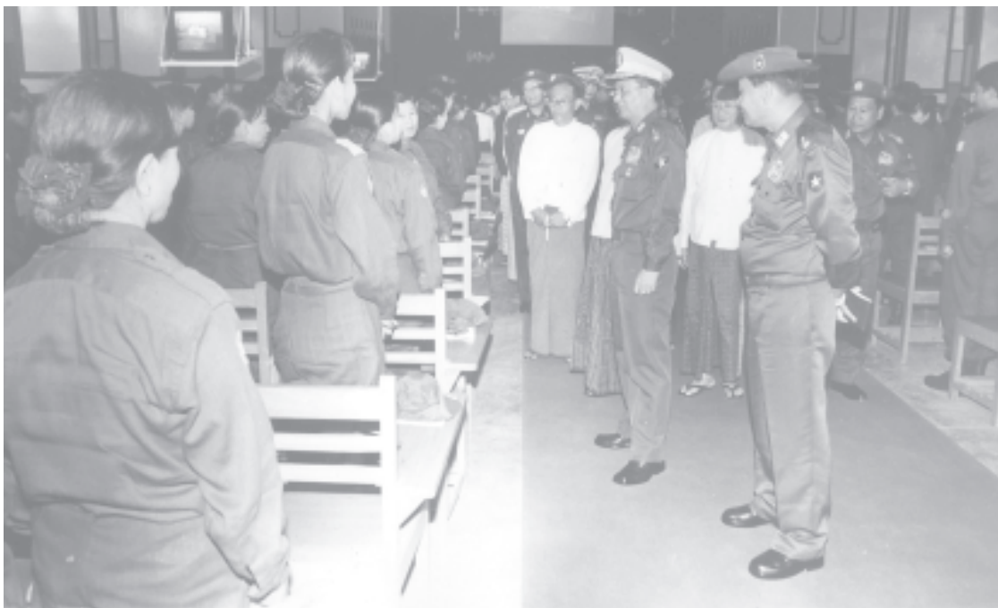
Secretary-1 Lt-Gen Thein Sein greets trainees of special refresher course No 23 for basic education teachers.

By attending the special refresher courses, teachers will gain more knowledge and experiences, and their capabilities will improve. Only then will the education of their students improve. The Secretary-1 said teachers are responsible not only for discharging duties in education sector but also for serving interests of the State. Nowadays, the Union of Myanmar is systematically implementing