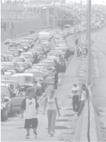
Drivers and passengers wait outside their vehicles as traffic snarls on the interstate highway leaving downtown New Orleans on 28 August, 2005. Authorities in New Orleans ordered hundreds of thousands of residents to flee on Sunday as Hurricane Katrina strengthened into a rare top-ranked storm and barreled towards the vulnerable US Gulf Coast city.