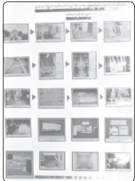
Documentary photos on the break-in of the Tooth Relic Pagoda.

Our local politicians have passed various periods. They have experienced during the 1988 incidents how BBC and other media fuelled unrest for spreading anarchy throughout the country by broadcasting instigative, slanderous and fabricated news. I believed that our journalists know how BBC's recent broadcasts were made timely with terrorist destructive elements' plan for creating unrest. However, some so-called politicians in interviews with RFA, DVB, VOA and other broadcasting stations tried to aggravate the issue. It is regrettable for the country and the peo-