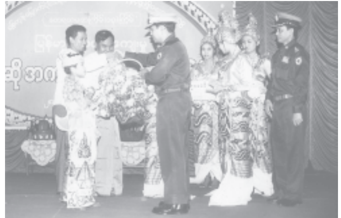
Maj- Gen Myint Swe presents the basket of flowers to the artistes.