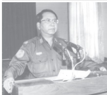
Minister Brig-Gen Kyaw Hsan speaking at the Press Conference 6/2005.—MNA

The State prevented, wiped out or crushed almost all plots, attacks of underground, aboveground and expatriate elements Public participation indispensable to deter terrorist acts