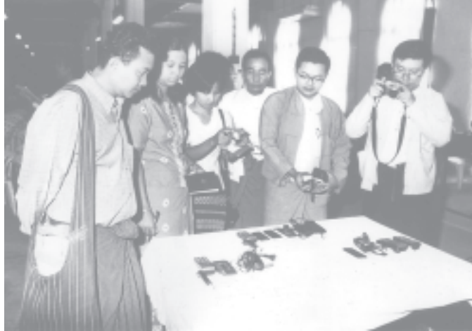
Journalists study seized satellite phones and accessories.

news items are to be released after due examination of their authenticity and accuracy. Some are to be released a little bit late as investigations must be made thoroughly. Otherwise, difficulties might be encountered if we promptly release news before thorough investigations. In such cases, we issue news only after we have exposed the links and taken necessary actions. For instance, we did not release the news on theft of Replica of Tooth Relic in Yangon immediately and we exposed the case only at this press conference. It was in consideration of not harming the efforts for exposing the culprit and investigating the case. To amplify my statement, we found that the culprit firstly tried to ascertain whether the case had been covered in the daily newspapers as well as by TV and radio.