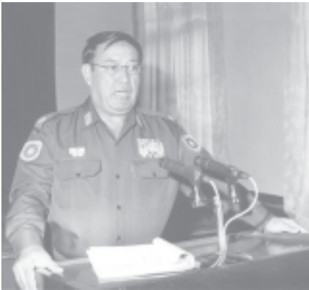
Minister for Home Affairs Maj-Gen Maung Oo at the Press Conference.

YANGON, 28 Aug—The following is the clarification made by Minister for Home Affairs Maj-Gen Maung Oo at the Press Conference No 6/2005.