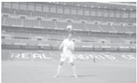
Real Madrid's new soccer player Robinho from Brazil heads a ball during his presentation ceremony at Santiago Bernabeu stadium on 26 August, 2005. Robinho passed a medical at Real Madrid on Friday before signing a five-year deal with the nine-times European champions.