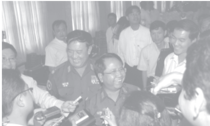
Information Minister Brig-Gen Kyaw Hsan and Home Affairs Minister reply to questions made by media persons.

(Clarification made by Brig-Gen Khin Yi is reported separately).