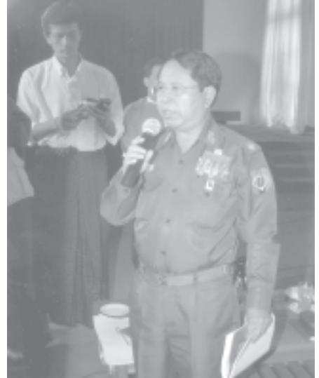
Minister Brig-Gen Kyaw Hsan.—MNA

Now, to safeguard lives and properties of the people, responsible personnel are investigating and exposing destructive acts of terrorist destructionists and their hardcores who had infiltrated into the country. In this regard, all the media persons of Myanmar are to launch counter-offensives against media offensives of internal and external terrorist destructive elements. The people on their part should be well aware of the traps of fabricated and instigative false news made by the internal and external terrorist destructive elements in collusion with broadcasting stations and media. In preventing terrorist destructive elements not to infiltrate and launch terrorist acts, the entire people are to join hands with the Government and to exercise a constant vigilance against movements of terrorist destructive elements and their cohorts.—MNA