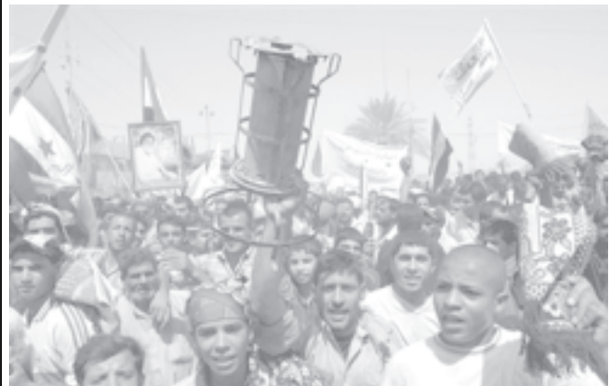
An Iraqi man holds up a kerosene stove during a demonstration to protest the lack cooking fuel, electricity and water in the Sadr city district of Baghdad on 26 August, 2005. —INTERNET

"In the light of a global terrorist threat and our own experience in the Jemaah Islamiyah episode, our security agencies have taken measures over the last few years to strengthen security at our borders, key infrastructure and iconic buildings," the statement said. — MNA/Xinhua