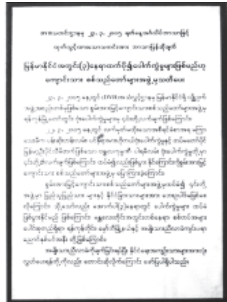
A documentary photo of DVB announcement displayed at the Press Confernece 6/2005.—MNA