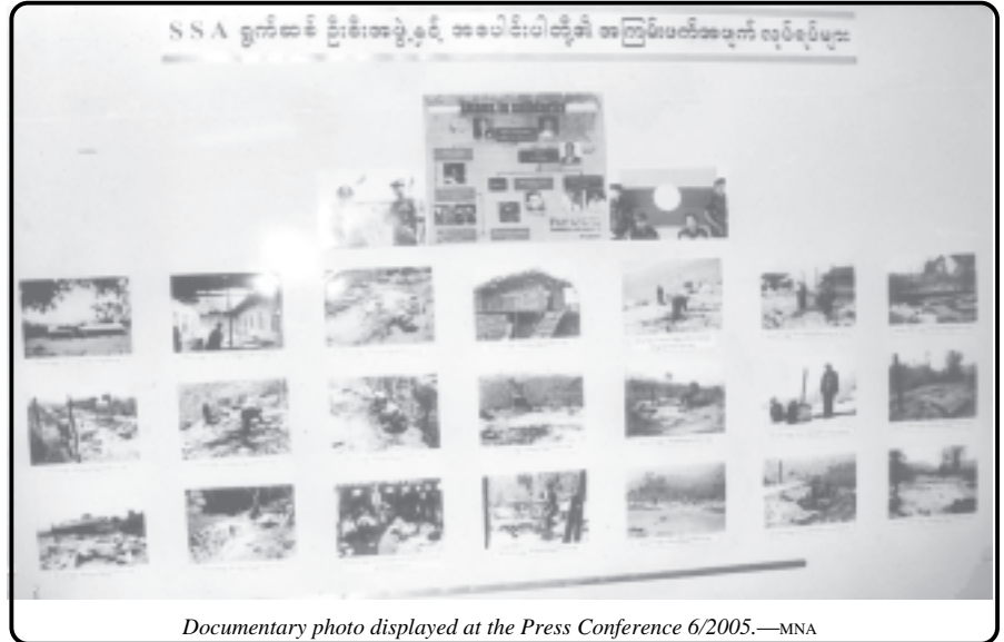
Documentary photo displayed at the Press Conference 6/2005.—MNA

As members of VBSW are daredevil, they in collusion with those from God's Children Army raided again Rachaburi Hospital, Thailand on 24 January 2000. How-