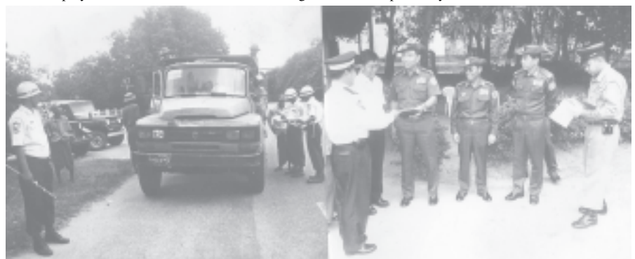
Members of the Dry Day Supervisory Committee supervise tasks of a dry day inspection team at the main point of Yangon City. —MNA

The dry day teams inspected dry day pass, driver's licence, wheel tax bill, wearing the departmental uniforms and breaking the traffic rules from 7 am to 5 pm today. — MNA