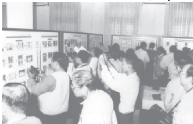
Local and foreign mediapersons observe documentary photos displayed at the press conference No 6/2005.