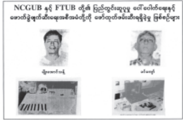
A documentary photo displayed at the Press Confernece 6/2005.