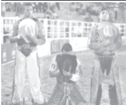
Cowboys pray prior to the Barretos Rodeo International Festival competitions in Barretos, 438 km (272 miles) northwest of Sao Paulo, on 26 August 26, 2005.

The three provinces of Heilongjiang, Jilin and Liaoning of northeast China jointly put forward a group of projects in 10 industrial sectors for luring overseas investment. The 10 sectors cover modern manufacturing, petrochemical, processing of farm produce, traditional Chinese medicine, energy resources and new building materials, among others.