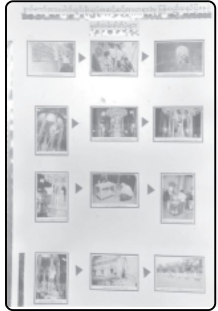
Documentary photos on step-by-step demonstrations of the theft of the replica Tooth Relic.

At a time when information on the incident was being collected the length and breadth of States and Divisions, an owner of gold shop in Lewe, Mandalay Division, informed the Lewe Police Station at 9.30 am on 18-8-2005 that a suspicious person came to sell gold. The information led to the arrest of the person who smelt gold, the rickshaw-man of Pinyinman who brought the person and an owner of gold shop in Pinyinman