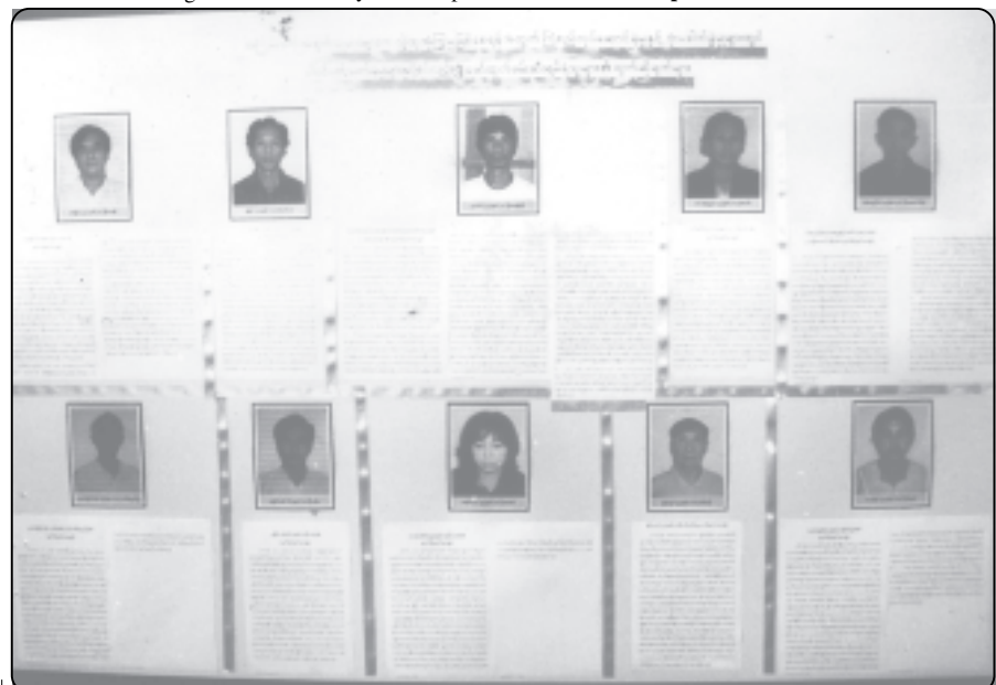
Statements of those arrested on conspiracies and bomb blasts committed by destructive elements.