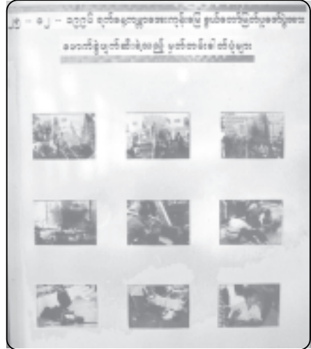
Documentary photos on scenes of bomb blasts at the ceremony at which the Buddha tooth relic was shown for public obeisance on 25-12-1996.