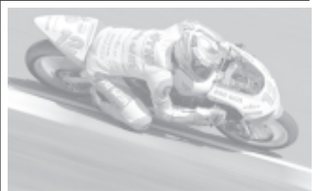
The Honda 125cc rider Thomas Luthi of Switzerland cuts a curve during the first qualifying session for the Czech Grand Prix at the Masaryk's circuit in Brno, Czech Republic on 26 August, 2005. Luthi clocked the fifth fastest time in today's classification for 125cc category.