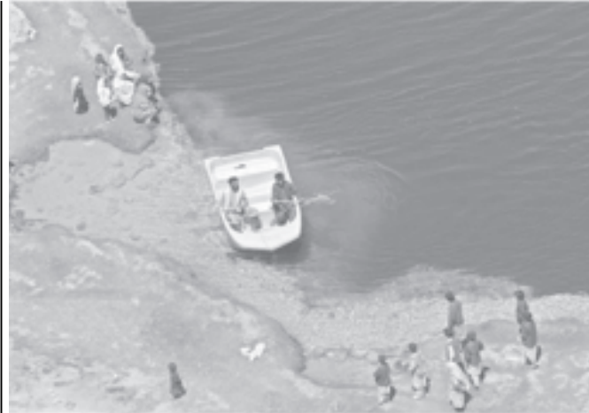
Afghan men and women relaxes next to Band-i-Amir lake, about 310 km (193 miles) northwest of Kabul, Afghanistan on 25 August, 2005. Band-i-Amir lake is one of the most popular tourist spots in Afghanistan.