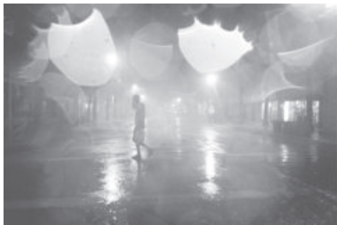
A man crosses an empty street in South Beach under heavy rain as tropical storm Katrina hits Miami, Florida, on 25 August, 2005. Katrina strengthened into a hurricane from a tropical storm on Thursday and deluged Florida's densely populated southeast coast with rain, heightening fears of flooding.