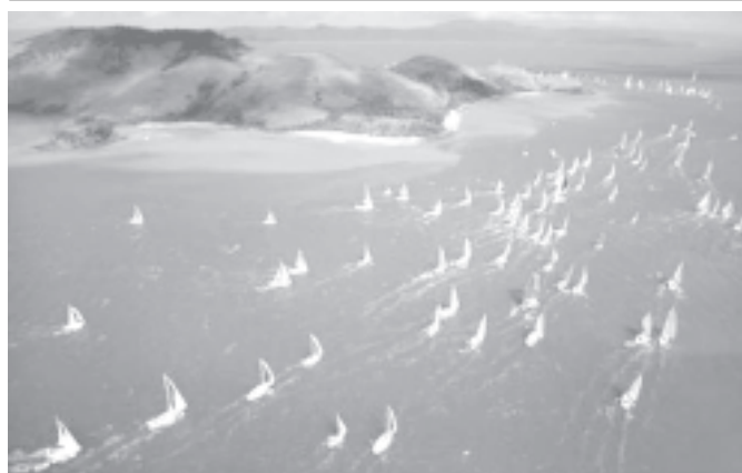
Yachts competing in the Premier Cruising section sail around Dent Island during day six of the Hamilton Island race week at Hamilton Island in Queensland on 26 August, 2005. The event will run until Sunday.