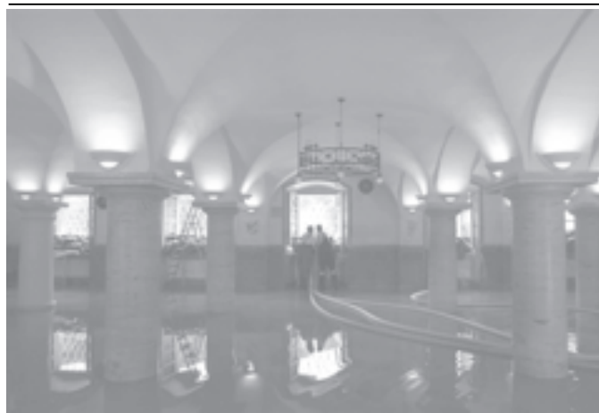
Rescue workers pump out water from inside the monastery of Weltenburg near Kelheim about 80 kilometers (49.7 miles) north of Munich on 25 August, 2005.

"But these times, these remaining months, are really the make or break of Iraq. These months are critical to the success or failure of this project of democratization, of regime change, whether for the United States, its allies or for us," he said. — MNA/Reuters