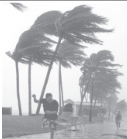
Beachgoers run on a sidewalk as Hurricane Katrina strikes in Deerfield Beach, Florida, on 25 August, 2005.