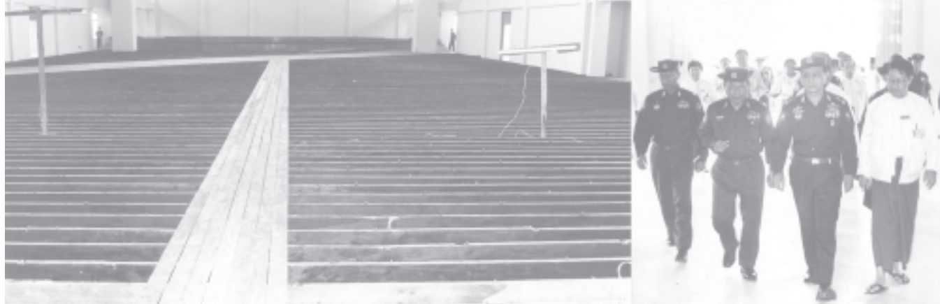
Secretary-1 Lt-Gen Thein Sein inspects construction of a gymnasium at Dagon University of Yangon East District.