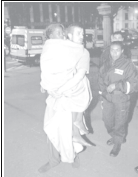
A fire brigade rescuer (R) helps evacuate victims after a blaze raced through an apartment in Paris on 26 August, 2005.