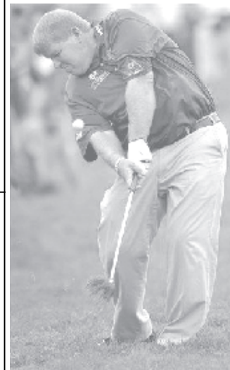
John Daly of the US hits from the rough at the fifth hole during the second round of the International Golf Open in Munich, on 26 August, 2005.