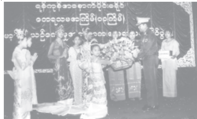
Commander Maj-Gen Myint Swe presents a basket of flowers to artistes. YANGON COMMAND

Altogether 160 contestants from 13 townships in the district will take part in the competitions. MNA