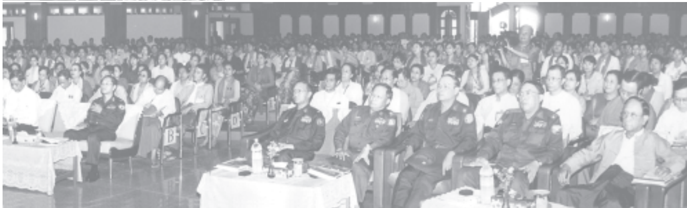
Secretary-1 Lt-Gen Thein Sein holds a meeting with the rector and faculty members of Dagon University in Yangon East District. — MNA

Since its assumption of State duties, the Tatmadaw Government has been making all-out efforts to ensure stability, peace and progress of the nation, and to raise the living standard of the people. It has been discharging nation-building duties through political, economic and social sectors with the aim of handing over State duties to the public when it has constructed basic foundations for national development to a reasonable extent.