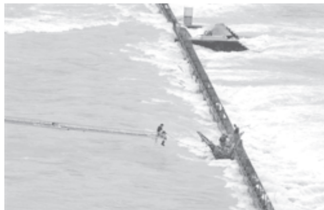
A firefighter sits on a ladder and tries to release wood gathered in the river Aare in Berne, Switzerland, on 25 August, 2005. The water level of the river is going down and emergency services and residents began a clean up process in parts of Switzerland on Thursday after days of torrential rain caused rivers and lakes to burst their banks.