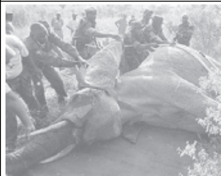
Kenyan rangers move a tranquilised 22-year-old male elephant during a project to transport 400 of the beasts from Shimba Hills National Reserve to Tsavo East National Park recently.

their education for their sports career in their youth but found it hard to make a living once their playing days were over. "I want the government to think about the welfare of retired athletes," said the 24-year-old, who is the first badminton player in the world to hold the Olympic and world crowns concurrently.