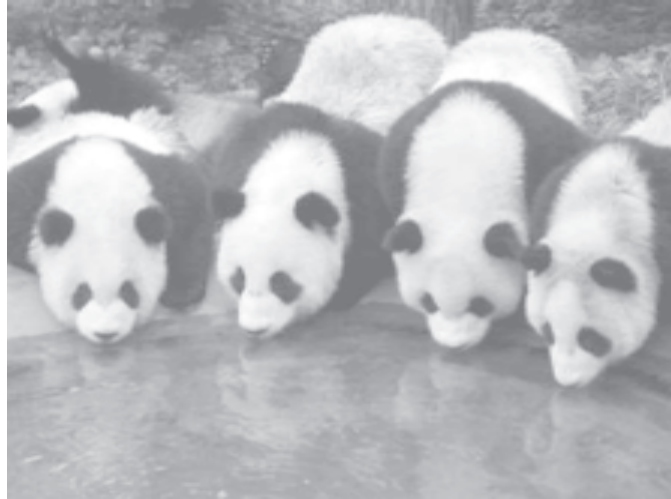
Four giant pandas drink water at a pool at the China Giant Panda Protection and Research Centre in Wolong, southwest China's Sichuan Province, on 26 August, 2005.