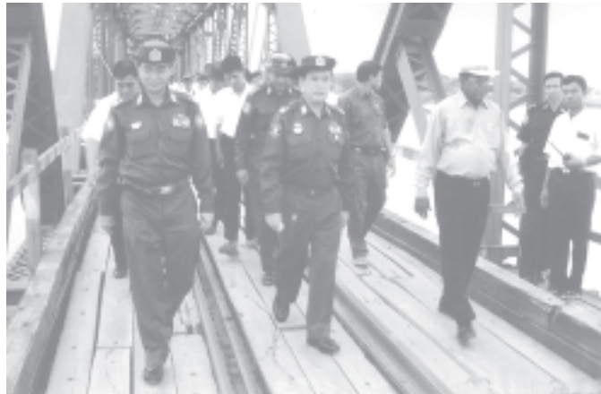
Ministers Maj-Gen Thein Swe and Maj-Gen Aung Min inspect durability of Myokwin Bridge. — TRANSPORT

After hearing reports, ministers gave necessary instructions. Next, ministers and party inspected the durability of Myokwin bridge. On arrival at Bo Myat Tun Bridge, ministers inspected the progress of preventive measures against river bank erosion and left instructions there. MNA