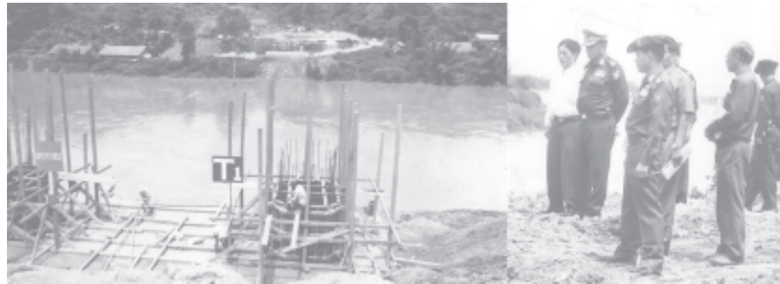
Lt-Gen Kyaw Win inspects the site for construction of Shweli Bridge (Namkham).

Moreover, 21178 acres of land have been put under rubber in the whole Shan State