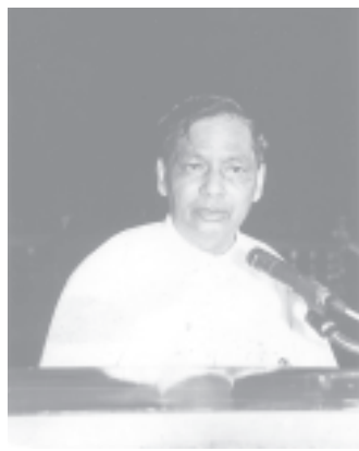
Minister for Education Dr Chan Nyein explains facts about Dagon University.

tasks and in constructing basic infrastructures for national development. After the meeting, the Secretary-1 cordially greeted the teachers, and inspected the construction of a gymnasium and construction of buildings in the university campus. —MNA