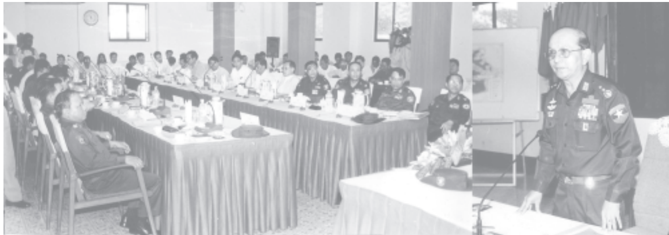
Secretary-1 Lt-Gen Thein Sein addresses the meeting to coordinate all-round upgrading of Kandawgyi Gardens and Zoological Garden (Yangon).

Yangon mayor, deputy ministers, the director-general of the State Peace and Development Council office, departmental heads, members of the committee and guests. (See page 8)