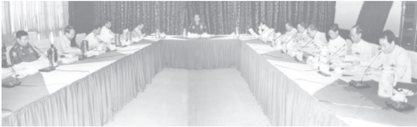
NCCC Chairman Secretary-1 Lt-Gen Thein Sein delivers a speech at the Meeting No 4/2005 of the National Convention Convening Commission.

YANGON, 27 Aug— Meeting No 4/2005 of the National Convention Convening Commission took place at the meeting room of NCCC on Kyaikkasan Grounds, here, this afternoon. Chairman of the National Convention Convening Commission Secretary-1 of the State Peace and Development Council Lt-Gen Thein Sein attended the meeting and made a speech.