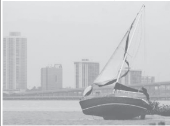
A boat that ran aground on the coast of Key Biscayne, Florida, after Hurricane Katrina struck the Miami, on 26 August, 2005.