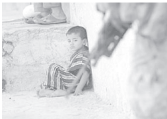
A boy watches a US Marine during checks against guerrillas in Hit, western Iraq recently.