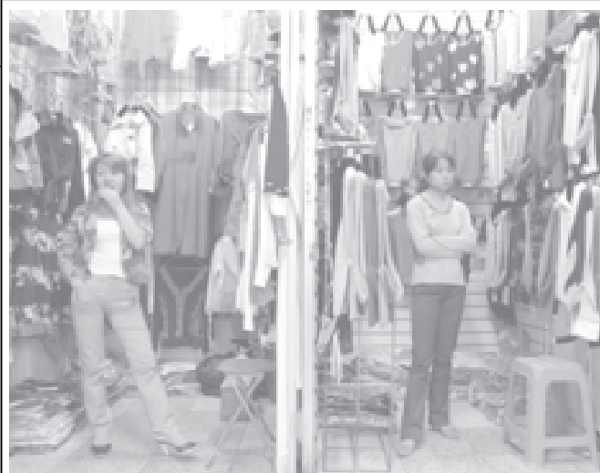
Chinese shopkeepers wait for customers at a clothing market in Beijing on 26 August, 2005. —INTERNET

Some areas could get up to 15 inches of rain, the hurricane centre said. Skies darkened and rain poured as the outer bands of the storm moved ashore. Some streets were already flooding and emergency managers urged people to stay inside. — MNA/Reuters