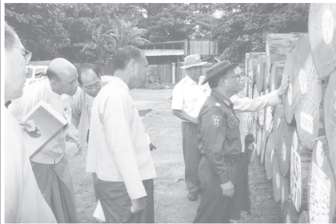
Minister Brig-Gen Thein Aung inspects log lots to be sold through tender system at Setsan Raft Jetty.— FORESTRY

YANGON, 26 Aug — Minister for Forestry Brig-Gen Thein Aung inspected sorting of log lots to be sold through tender system at Kan-3 raft jetty of Foreign Trade and SawMill Division of Myanma Timber Enterprise in Ahlon Township and Setsan raft jetty in Pazundaung Township this morning.