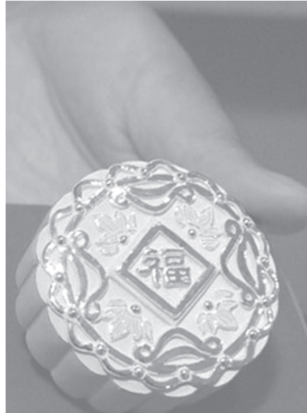
A gold mooncake is displayed at a jewellery store in Hefei, East China's Anhui Province, on 11 August, 2005. The cake sells at a price of some 3,000 yuan. China will be celebrating the traditional Mooncake Festival on 18 September.