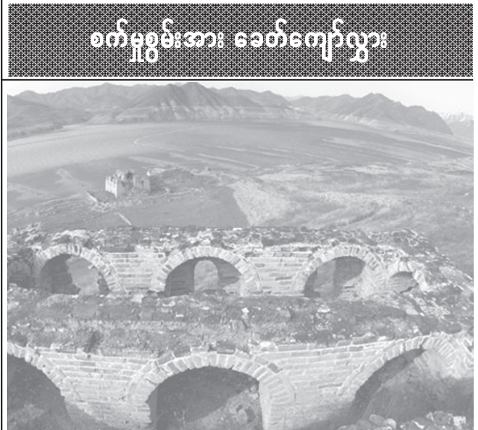
The photo taken on 23 March, 2003 shows a section of the "Great Wall Under Water", which emerges out of the Panjiakou Reservoir in Kuancheng Manchu Autonomous County, north China's Hebei Province.

Top Iranian officials have insisted that Tehran is ready to continue nuclear negotiations with the EU but will never suspend the uranium conversion work again, saying the future talks should be focused on the restarting of more advanced nuclear activities.—MNA/Xinhua