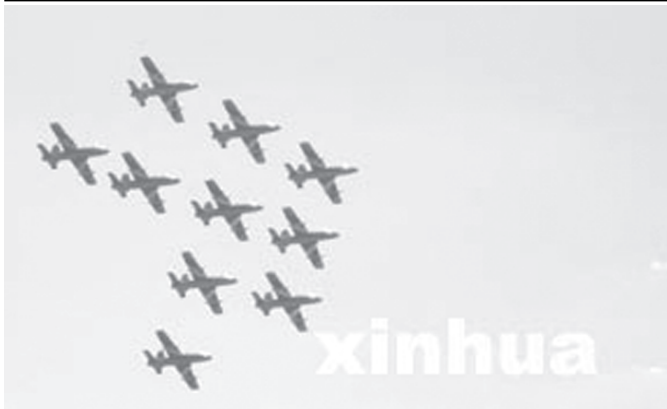
An acrobatics team from Italy performs during the closing ceremony of the Moscow International Air Show in Zhukovsky, outside Moscow, capital of Russia, on 21 August, 2005. Aerospace companies from some 40 countries attended the six-day air show which attracted over 650,000 visitors.