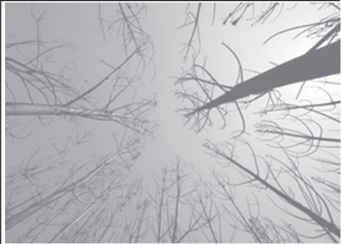
Burnt trees after a forest fire in Vale de Canas, near Coimbra, Portugal, on 25 August, 2005.