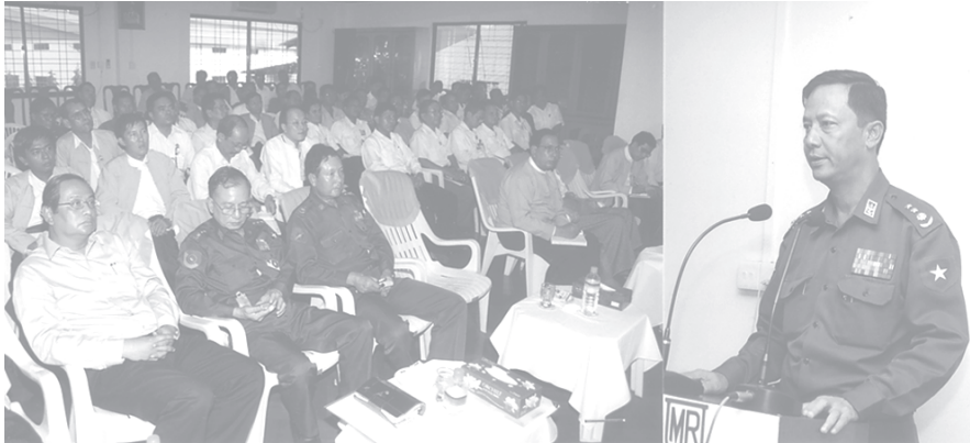
Minister for Cooperatives Col Zaw Min speaking at the introduction of moulds and dies assembled by Fair Sun Mould and Die Industry in Shwepyitha Industrial Zone.

YANGON, 26 Aug — Chairman of the Industrial Development Study and Cooperation Committee Minister for Cooperatives Col Zaw Min attended the introduction of moulds and dies assembled by Fair Sun Mould and Die Industry in Shwepyitha Industrial Zone this afternoon.