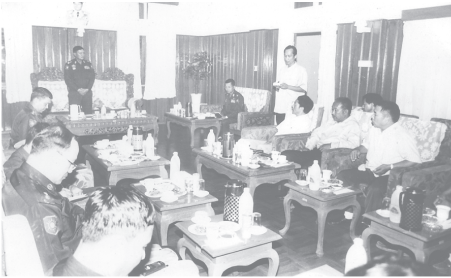
Lt-Gen Kyaw Win meeting with representatives of national race groups of Shan State (North) Special Region-1 Kokang Region.