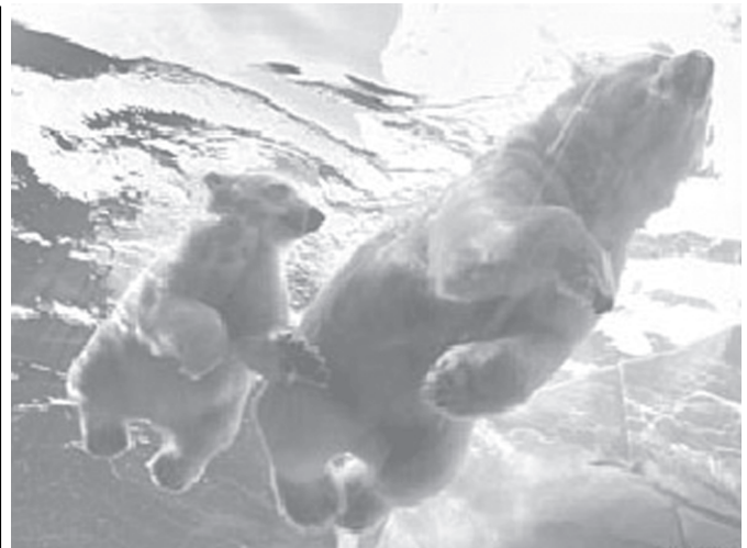
A polar bear cub gets a swimming lesson from first-time mum Barle at a zoo in Royal Oak, Michigan. — INTERNET

Bangladesh, Bhutan, India, Indonesia, South Korea, Maldives, Myanmar, Nepal, Sri Lanka, Thailand and Timor are expected to participate in the meeting. — MNA/Xinhua