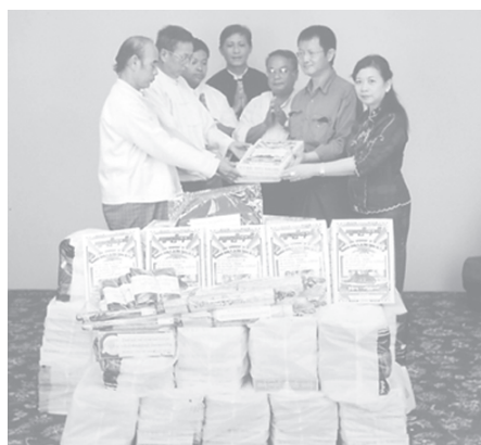
Officials of Buddha Pujaniya 9,900 Lights Organization accepts robes donated by wellwishers. — H