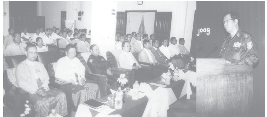
Minister for Finance and Revenue Maj-Gen Hla Tun speaking at the concluding ceremony of Proficiency Course No 25 for Heads of Township Internal Revenue Department.

YANGON, 26 Aug — The Proficiency course No 25 for heads of Township Internal Revenue Department of the Ministry of Finance and Revenue, concluded at the meeting hall of the department on Pansodan Street this morning, attended by Minister for Finance and Revenue Maj-Gen Hla