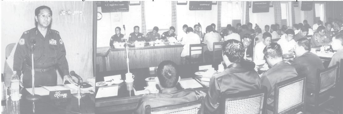
Commander Maj-Gen Myint Swe speaking at the meeting of Yangon Division Supervisory Committee for Ensuring Smooth and Secure Transport.

The officials reported matters related to the smooth and secure transportation in Yangon Division to the commander who fulfilled the (See page 10)