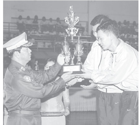
Minister for Finance and Revenue Maj-Gen Hla Tun presents championship trophy to MICB team.

Next, Deputy Minister Col Hla Thein Swe gave away prizes to the winners in the men's doubles event. Later, Minister Maj-Gen Hla Tun presented prizes to the winners in the singles events and cham-