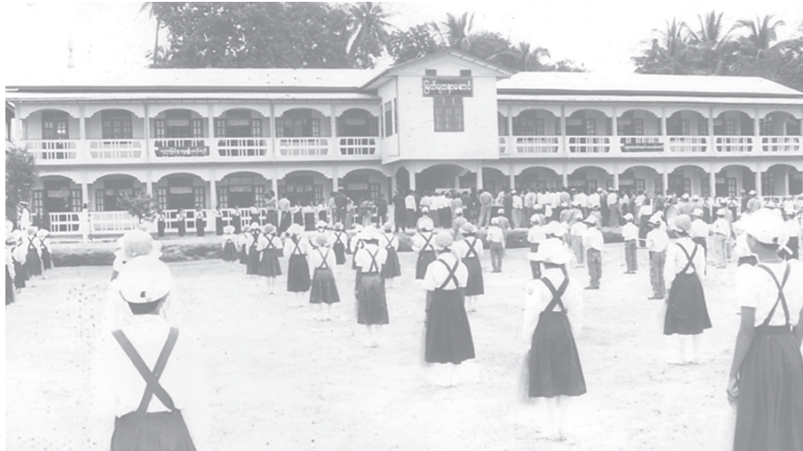
Newly opened two-storey building of Kyondoe BEHS seen at the opening ceremony.