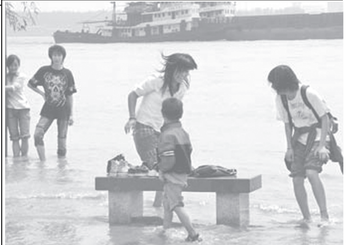
People play on a flooded sidewalk on the banks of the Hanjiang River in Wuhan, the capital of Central China's Hubei Province, on 24 August, 2005.

CPI is the largest oil producer in Indonesia, producing 478,000 barrels per day at present, roughly half of the country's total oil output, from its wells across Riau Province.—MNA/Xinhua