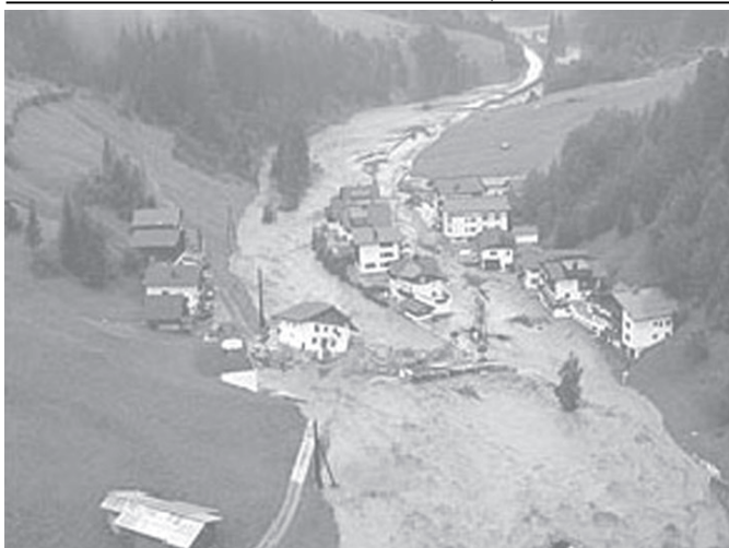
In Austria, floods have caused chaos in the west of the country, leaving three people dead and one missing recently. — INTERNET