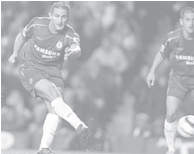
Frank Lampard capitalises on a defensive mix-up to put Chelsea ahead 1-0 up at Stamford Bridge on 21 Aug, 2005.

"We are improving slowly and I'm sure things are going to get better soon," he added. — MNA/Reuters