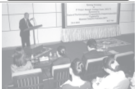
PROJECT MANAGER TRAINING COURSE OPENED: IT Project Manager Training Course, 2005 FY was opened on 24-8-2005 at MICT Park in Hline Township. The course was sponsored by Centre of the International Cooperation for Computerization-CICC of Japan and Myanmar Computer Federation.

YANGON, 25 Aug— Symposium on "An Update on Antimicrobials" organized by Myanmar Medical Association will be held at the auditorium of MMA on 3 September, 2005. Those interested are invited to attend the symposium and on site registration is available.