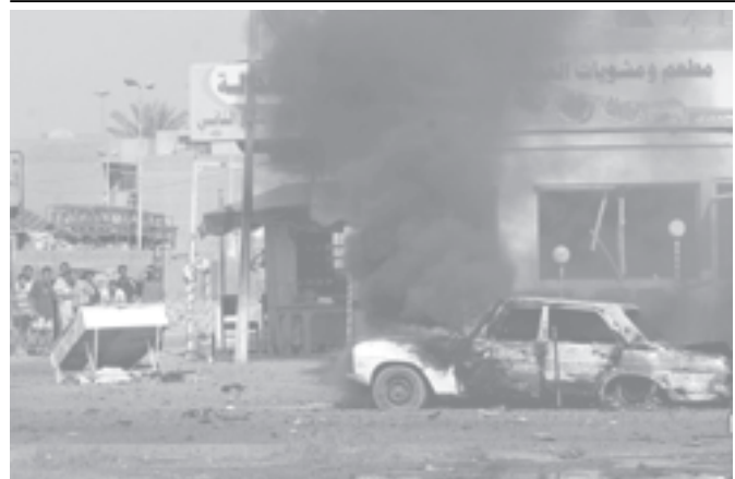
Iraqis look at the scene after a car bomb explosion in the Hay al-Jamma district in west Baghdad on 24 August, 2005.—INTERNET

Fifty-four percent said the military kept them well informed compared to 77 percent in 1999, and 61 percent felt the media kept them well informed versus 79 percent in 1999.—INTERNET