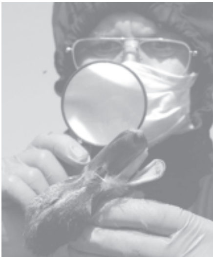
Animal health worker makes tests on a slain wild duck near the Siberian village Bolshiye Prudy 100 km (62 miles) north of Krasnoyarsk, on 24 August, 2005. The bird flu virus which has swept six Russian regions has been found in a wild duck in another Siberian province, officials said on Wednesday, but the agriculture minister said that its spread had been curbed. INTERNET

Oil hit a peak earlier this month of 67.10 US dollars per barrel. The looming end of the peak driving season in the United States after the September 5 Labour Day holiday and worries that oil prices could eat into economic growth kept a lid on gains. — MNA/Reuters