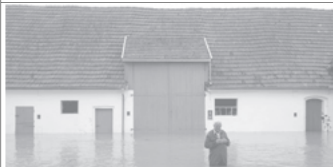
A resident stands waist deep in his flooded courtyard in the Bavarian village of Moos near Neuburg at the River 'Donau' about 60 kilometres north of Munich on 24 August, 2005.

The Titanic sank off Canada on her maiden voyage on the night of 14 April, 1912, with the loss of over 1,500 passengers and crew. Theories about why and how she sank have abounded ever since.