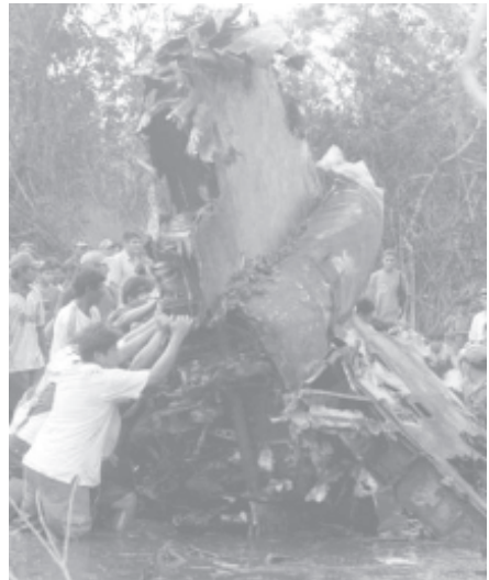
Rescue workers and local people remove the debris of a plane from TANS airliner that had crashed in Peru’s northern jungle on 24 August, 2005.