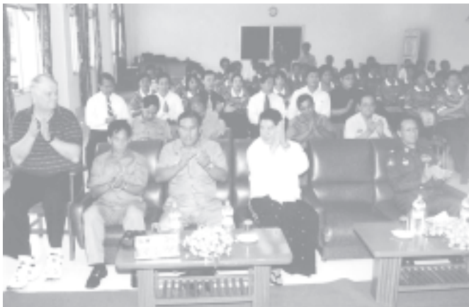
Minister for Sports Brig-Gen Thura Aye Myint attends concluding ceremony of Table Tennis Coaching Course Level-1.— MTFP

YANGON, 25 Aug — Chairman of Myanmar Olympic Committee Minister for Sports Brig-Gen Thura Aye Myint delivered an address at the ceremony to conclude the Table Tennis Coaching Course Grade-I, jointly organized by International Olympic Committee, MOC, International Table Tennis Federation and Myanmar Tennis Federation, at the hall of National Football Training Centre (Thuwunna), here, this morning.