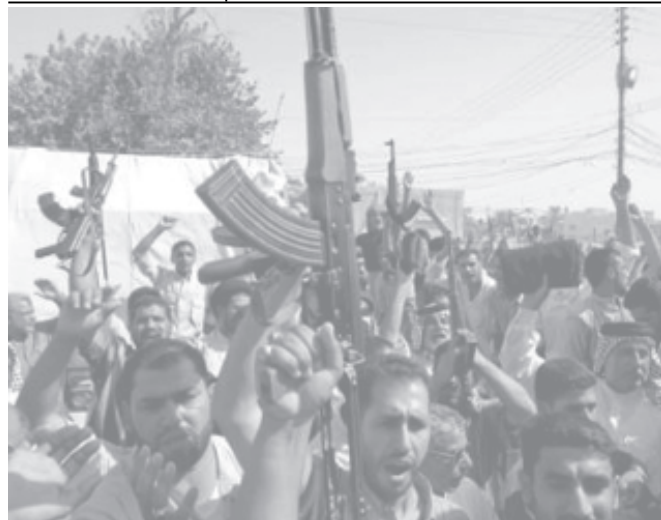
Supporters of Iraqi cleric Moqtada al-Sadr show their support during a demonstration in Najaf on 25 August, 2005. —INTERNET

According to the draft tabled for the 17th session of the Standing Committee of the 10th National People's Congress on Tuesday, the minimum limitation of registered assets of stock companies was cut to five million yuan (610,000 US dollars) from the current 10 million yuan (1.22 million US dollars). The draft has also reduced the minimum of registered assets of limited corporations from 100,000 yuan (12,200 US dollars) to 30,000 yuan (3,659 US dollars).