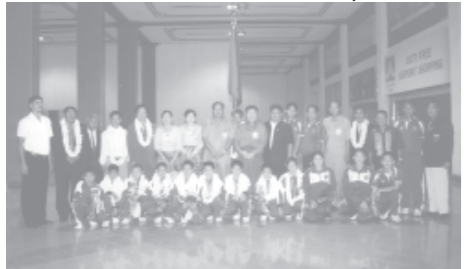
Victorious Myanmar diving team arrives back at Yangon International Airport.