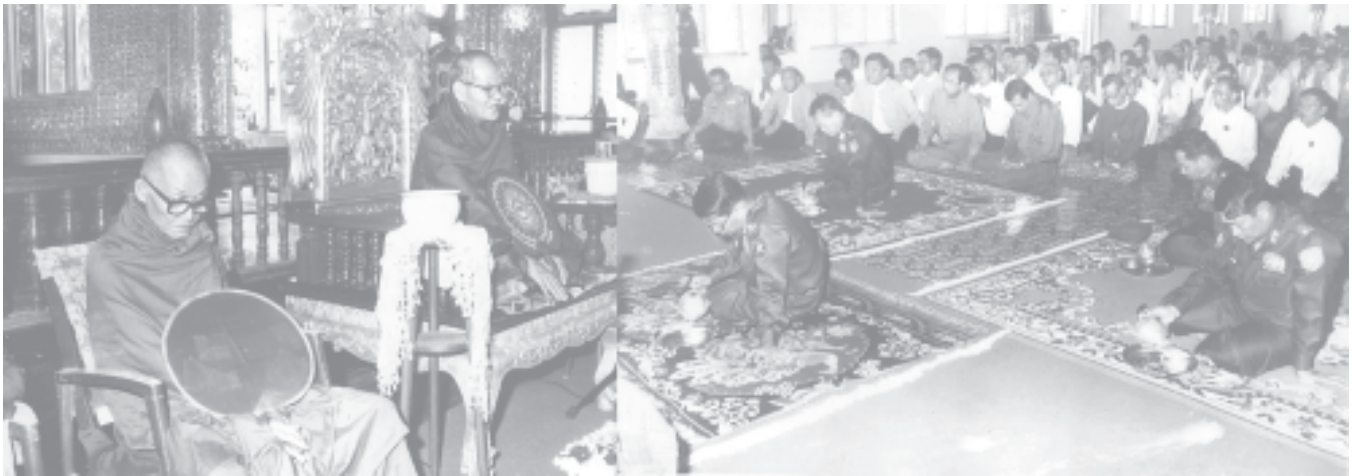
A Sayadaw delivers a sermon at the ceremony to offer provisions to monasteries in Kawkareik in Kayin State.

YANGON, 25 Aug — A ceremony to offer provisions to monasteries in Kawkareik, Kayin State, organized by Kayin State Peace and Development Council, was held on 22 August at Zinathukha Lawkatharaphu Pagoda in Kawkareik.