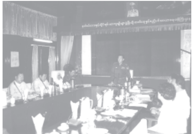
Minister Col Thein Nyunt addresses the coordination meeting to bring about joint efforts for ensuring food sufficiency in Shan State.— PBANRDA

Deputy Minister Brig-Gen Than Tun and officials concerned were also present at the meeting. — MNA