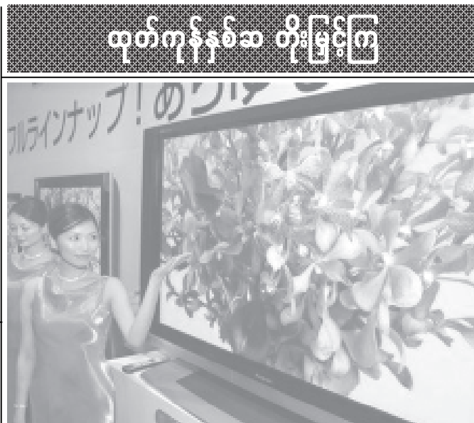
A model presents Panasonic brand products maker Matsushita Electric Industrial Co's new 65-inch plasma television "VIERA TH-65PX500" at an unveiling in Tokyo on 25 August 2005.