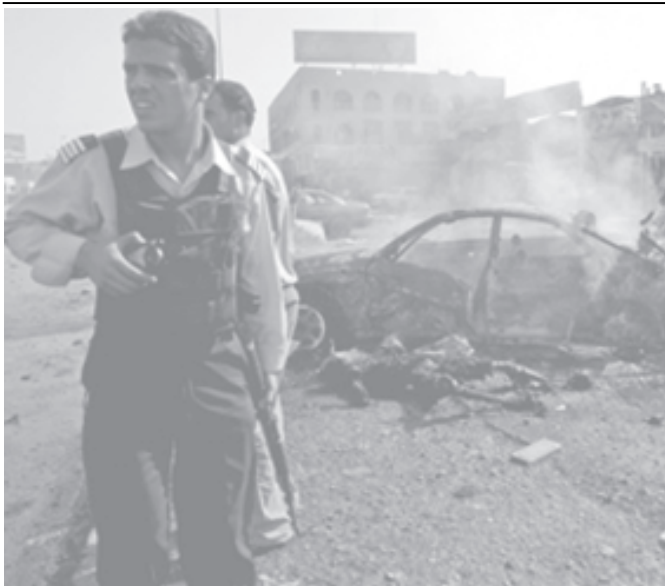
An Iraqi policeman stands near the wreckage after a car bomb exploded in west Baghdad on 24 August, 2005.