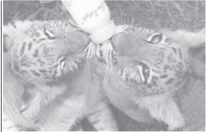
A pair of cubs, born from a lion and a female tiger, drink milk at a wildlife park in Haikou, China's Hainan Province, on 23 August, 2005.