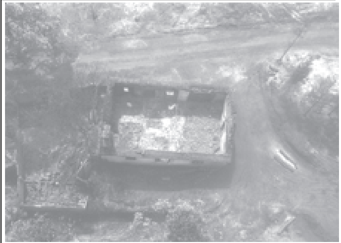
A house is burnt after a forest fire in Miranda Do Corvo near Coimbra, central Portugal on 24 August, 2005. Water-dumping aircraft from around Europe battled on Tuesday to help drought-hit Portugal contain raging forest fires that have killed at least 14 people.