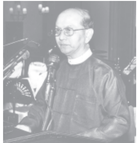
Secretary-1 Lt-Gen Thein Sein delivers an address at a ceremony to honour the victorious Myanmar U-20 Football team.