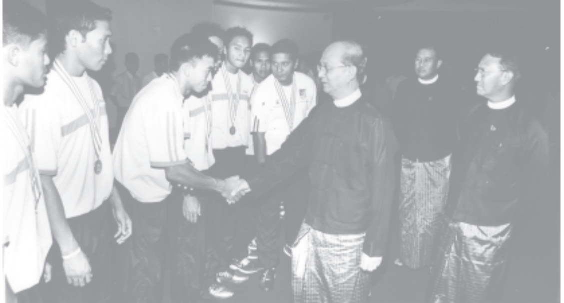
Secretary-1 Lt-Gen Thein Sein shakes hands with a player of Myanmar U-20 football team at a ceremony to honour the victorious Myanmar U-20 football Team.

Also present on the occasion were Chairman of Yangon Division Peace and Development Council Commander of Yangon Command Maj-Gen Myint Swe, ministers, Chairman of Committee for Ensuring the Success of Myanmar Sports Chairman of Yangon City Development Committee the Yangon Mayor, members