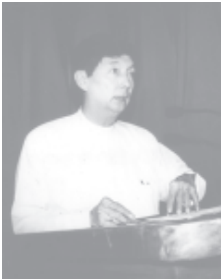
Minister Dr Kyaw Myint addresses the 17th meeting of Country Coordinating Mechanism (CMM) of Myanmar.

YANGON, 22 Aug — The 17th meeting of Country Coordinating Mechanism (CMM) of Myanmar on control of AIDS/TB and malaria with the funds of GFATM took place at the Ministry of Health in Dagon Township here this afternoon, with an opening address by Minister for Health Dr Kyaw Myint.