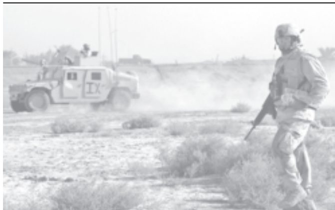
US soldiers search an area beside a highway on the outskirts of Baghdad. Iraq roped in disenchanted Sunni Arabs for last-minute talks on thorny issues dogging the drafting of the constitution just hours before a deadline to complete the charter expires.—INTERNET

The wariness, congressional aides and outside strategists said in interviews last week, reflects a belief among some in the opposition that proposals to force troop drawdowns or otherwise limit Bush's options would be perceived by many voters as defeatist. Some operatives fear such moves would exacerbate the party's traditional vulnerability on national security issues.—Internet