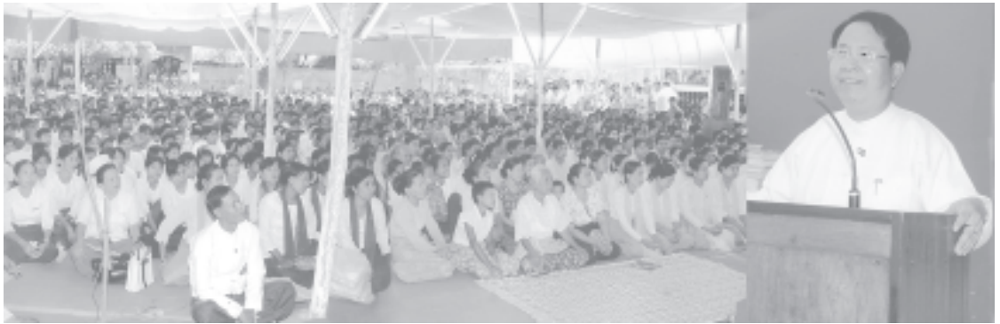
Secretariat Member of USDA Minister Brig-Gen Kyaw Hsan meets locals of Salingyi Township. — MNA

In his address delivered at the meeting, the minister said the government has been building infrastructures including roads, bridges and dams which are necessary for development of education, health and economic sectors. However, internal and external destructive elements have been causing hindrances to the development of the State and efforts to build