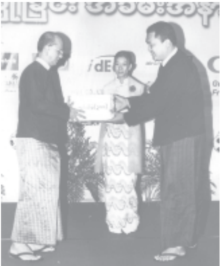
Secretary-1 Lt-Gen Thein Sein accepts cash donation presented by a wellwisher for U-20 football team. — MNA

when the government and the people cheer the Myanmar U-20 football team, all soccer athletes are to make efforts to retain the achievements in the future, to participate in Myanmar national team and to triumph over