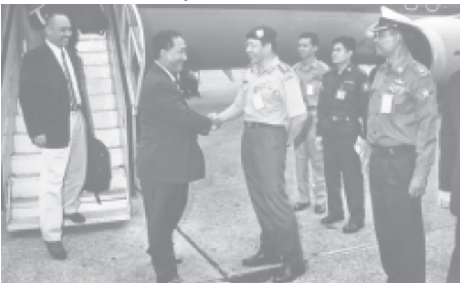
A study group led by Col Sheikh Mokhsin bin Sheikh Hassan of Malaysian Armed Forces Staff College being welcomed at the airport.— MNA