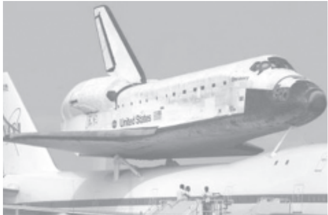
NASA workers wait to remove the space shuttle Discovery from the back of a modified Boeing 747 after it landed at the Kennedy Space Center in Cape Canaveral, Florida, on 21 August, 2005.