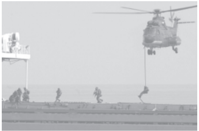
A team from Singapore's Navy Divers Unit rappel down from a Singapore Air Force Super Puma helicopter and storm a merchant vessel during Exercise Deep Sabre in the South China Sea off Singapore recently.—INTERNET

She also asked Chinese scientific workers to vigorously disseminate scientific knowledge, popularize practical advanced technologies for the benefit of the people.—MNA/Xinhua