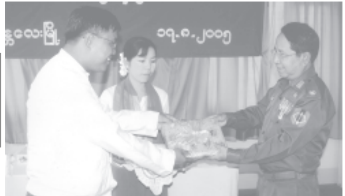
Minister Brig-Gen Kyaw Hsan accepts books worth K 120,000 donated by Mandalay Chanmyathazi Township Peace and Development Council.