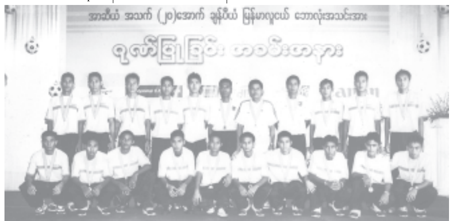
Victorious selected Myanmar soccer team.