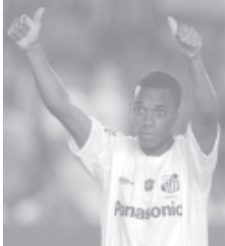
Brazilian Robinho gestures to fans at the start of his last match for Santos before his transfer to Spain's Real Madrid, in the Brazilian port city of Santos, on 21 August, 2005.

RIO DE JANEIRO, 22 Aug —Robinho celebrated his last home game for Santos by converting two penalties in a 4-3 Brazilian championship win over Figueirense on Sunday.