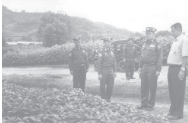
Lt-Gen Kyaw Win inspects 100-acre cultivation of local battalion in Lashio.