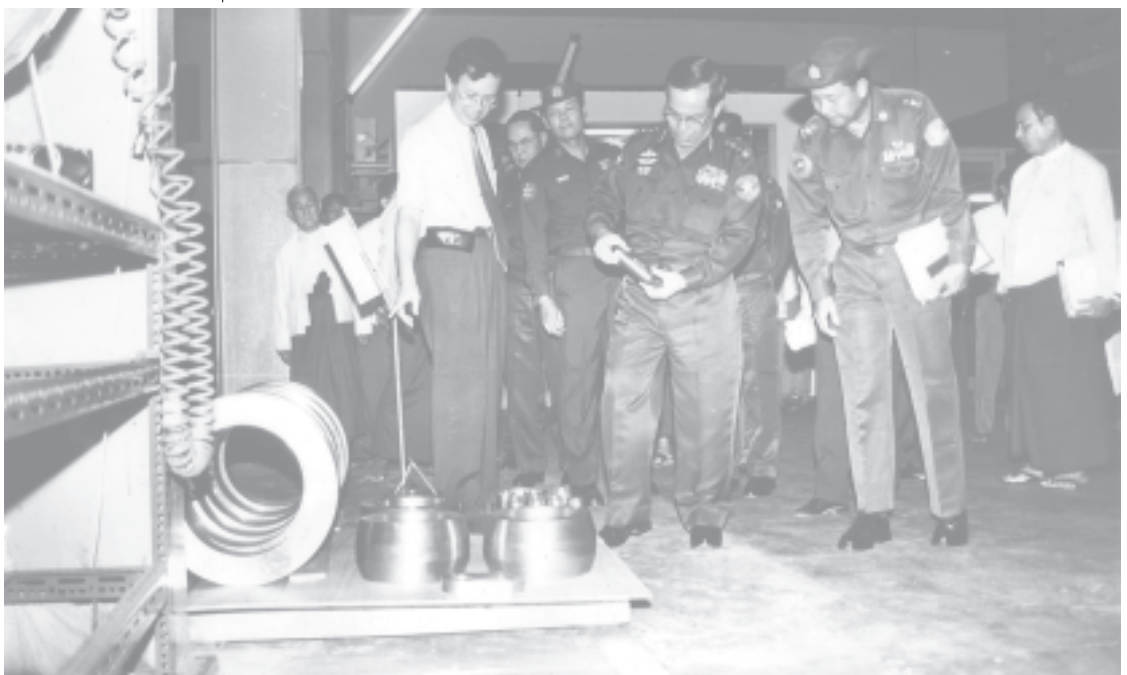
Prime Minister General Soe Win inspects parts of machines manufactured by Fair Sun Mould and Die Industry in Shwepyitha Industrial Zone. — MNA

Emergence of the State Constitution is the duty of all citizens of Myanmar Naing-Ngan.