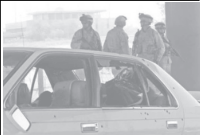
US troops stand guard beside a car in which Iraqi interior ministry officers were killed by gunmen on the road leading to the Baghdad international airport, on 21 August, 2005.