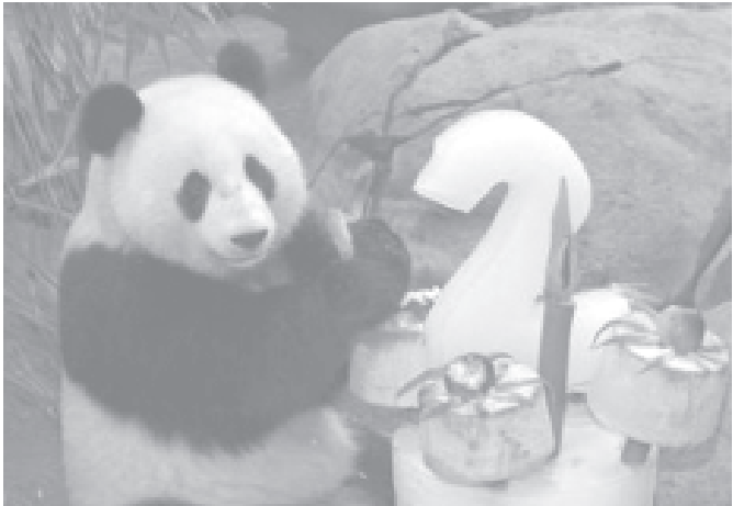
The San Diego Zoo's giant panda cub, Mei Sheng, holds onto a piece of his birthday cake in San Diego, on 19 August, 2005.