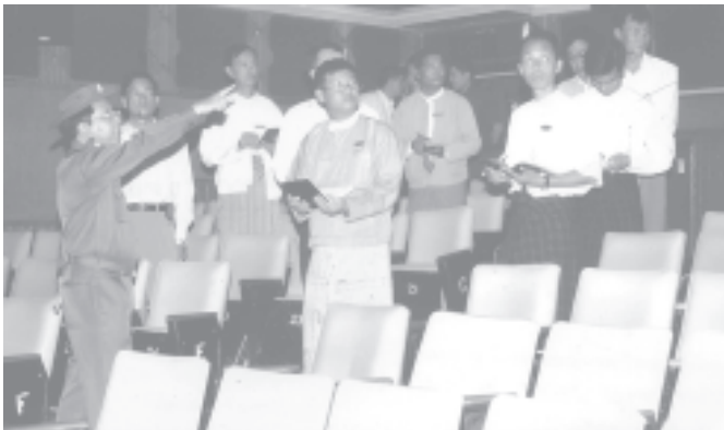
Minister Brig-Gen Kyaw Hsan inspects Win Light cinema in Mandalay.