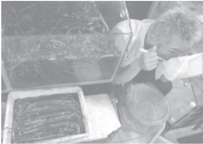
A Chinese vendor eats lunch near live and prepared eels at a wet market in Beijing, China, on 22 August, 2005.