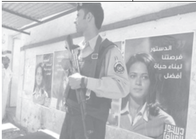
An Iraqi policeman stands guard in front of a police station in Basra, on 21 August, 2005.