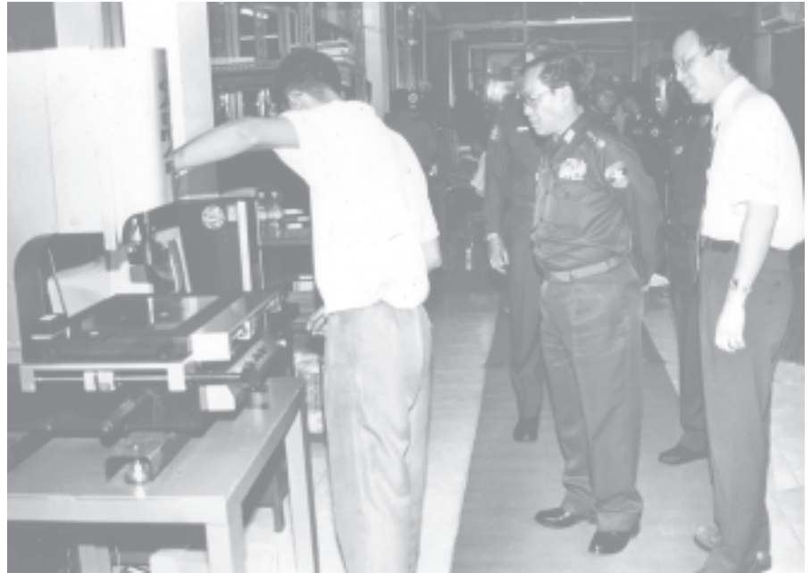
Prime Minister General Soe Win inspects Fair Sun Mould and Die Industry in Shwepyitha Industrial Zone.

They next inspected Electro Discharge Machine (EDM) used in production of mould and die. The