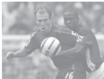
Chelsea's Arjen Robben, left, battles for the ball with Arsenal's Lauren during their English Premier League soccer match at Stamford Bridge stadium in London, on 21 August, 2005. Chelsea won the match 1-0.