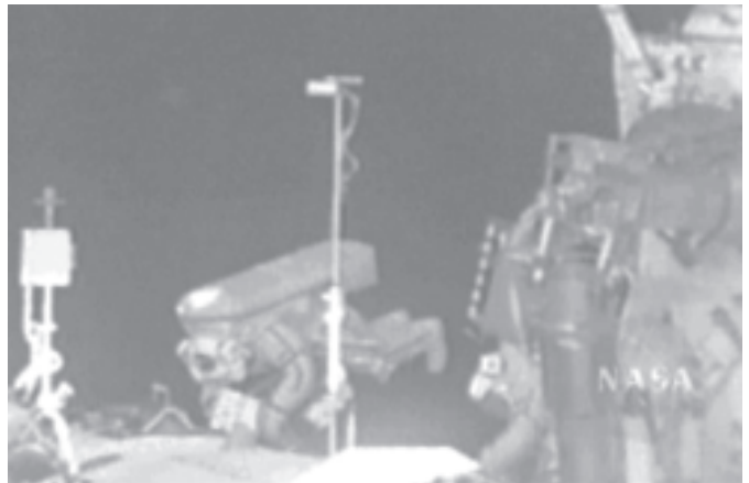
In an image from NASA television, a silhouette of one of the astronauts conducting a space walk is seen outside the International Space Station, on 18 August, 2005 in space.