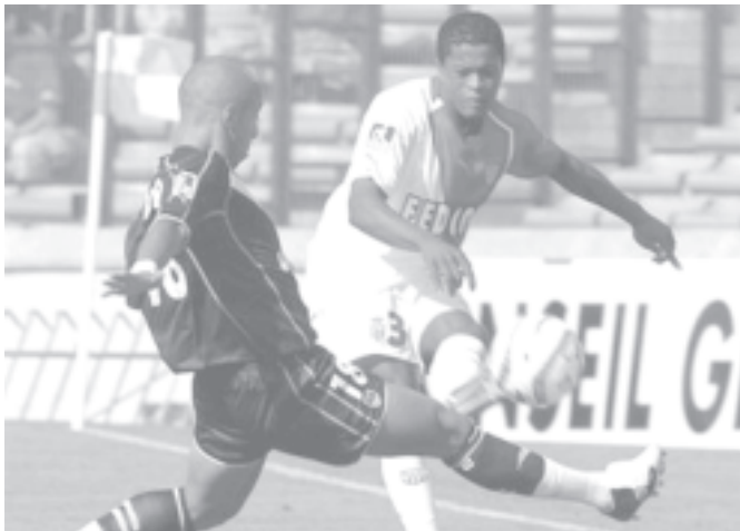
Monaco's Patrice Evra, right, challenges Bordeaux's Julien Faubert for the ball during their French League One soccer match in the Bordeaux Stadium, southwestern France, on 20 August, 2005.

When asked whether he would sign Owen if the England player was offered to him on loan, Benitez said: "I would prefer to work with the players I have at the moment and it's difficult to talk about hypotheses." — MNA/Reuters