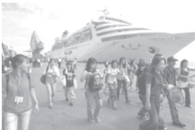
Tourists leave the ship Fuji Maru after arriving at a port in Dandong, northeast China's Liaoning Province on 19 August, 2005.