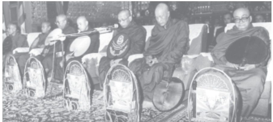
Secretary-1 Lt-Gen Thein Sein and party take Five Precepts from members of the Sangha at the ceremony to donate provisions to monasteries in South Okkalapa Township.

for monasteries in South Okkalapa Township were 402 bags of rice, 159 viss of edible oil, 1,595 viss of iodized salt, 319 tubes of tooth paste, 287 viss of gram, 12,482 bottles of traditional medicines, 4,194 bars of soap, 75 litres of fish sauce, 848 viss of dry fish, 600 packets of vermicelli, 480 boxes of mosquito coils, 100 pictures of