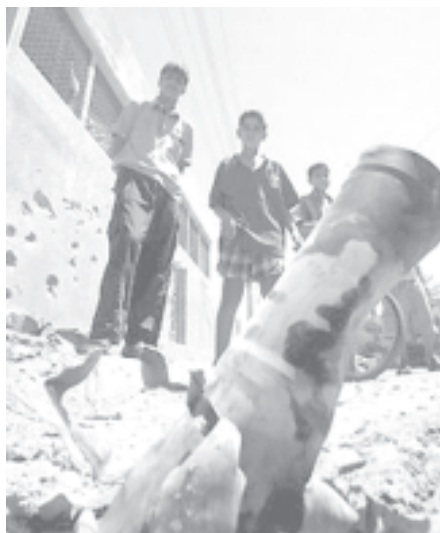
Iraqi children look at a mortar rocket that landed in the al-Mansur District of Baghdad recently.