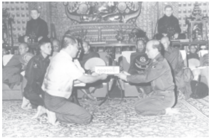
Lt-Gen Thein Sein accepts cash donated by wellwishers for 17 monasteries in Yangon East District.