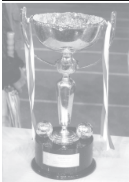
Championship trophy of Myanmar U-20 Football team.