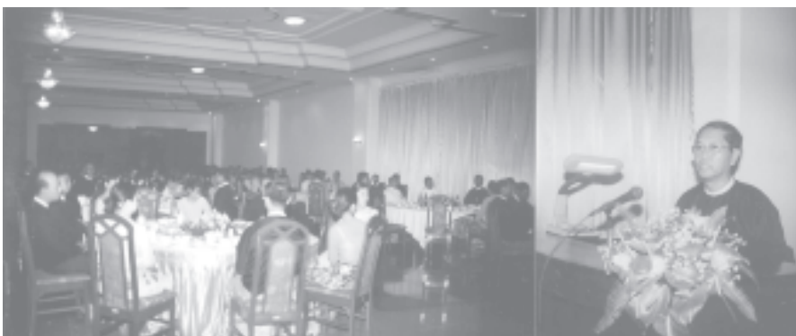
Commander Maj-Gen Myint Swe delivers an address at a ceremony to honour the victorious sports teams of Yangon Command.