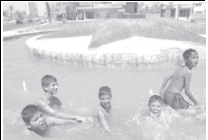
Iraqi children refresh themselves in a fountain in Baghdad, on 20 August, 2005. Temperatures in Iraq are reaching over 45°C (114° F).