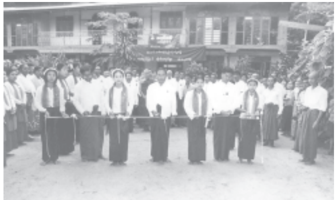
Minister Brig-Gen Kyaw Hsan attending the opening of Alinthis Library in Beikthayat village, Salingyi township.

Officials of Sagaing Division, Monywa District USDA and Division and District IPRD donated books to the library.