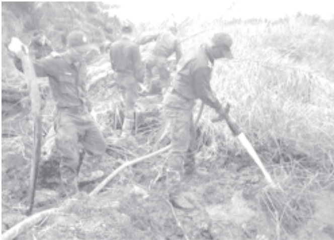
Firefighters from Singapore spray water to douse remaining fires on a peat land in Rokan Hilir, Riau Province, Sumatra island, Indonesia, on 20 August, 2005.