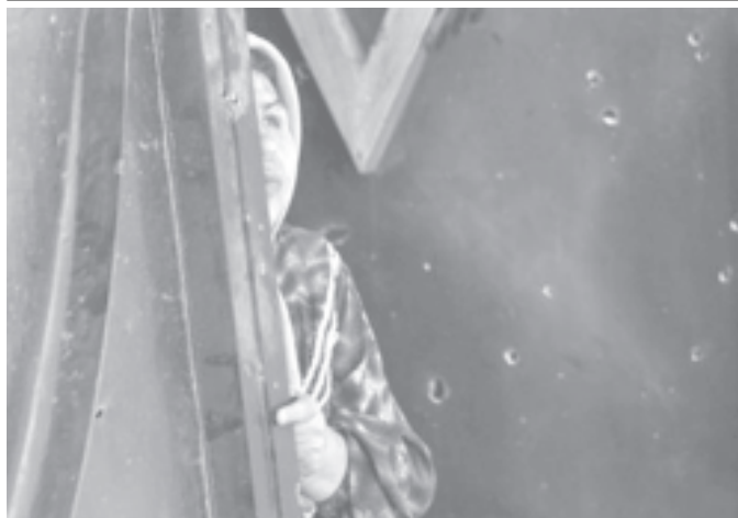
An unidentified woman looks from shrapnel riddled gate of her damaged home after a rocket exploded outside the house, in Monsur District in Baghdad, on 20 August, 2005.

A police spokesman said it may have been an underground explosion. An electrical transformer could have been the cause of the explosion, one official said. Witnesses reported a large bang shortly before 10 am near Post and Kearny streets in front of a Ralph Lauren store in the central business district.