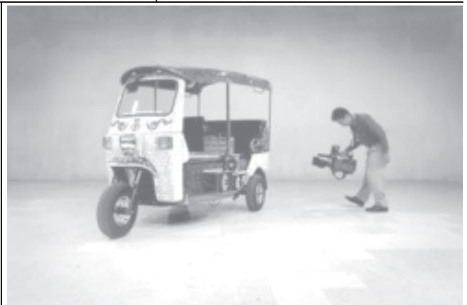
A camera man films a Thai tuk tuk covered with over 100,000 crystals inside a studio in the outskirts of Bangkok on 19 August, 2005. Tuk tuks, which are named after the sound of their engines, are generally used as taxis in Thailand. —INTERNET