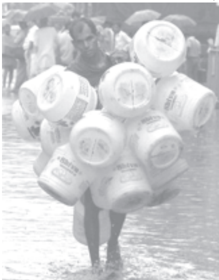
A man wades through a flooded street with empty containers in Kolkata, India, on 20 August, 2005.—

Representatives at the talks toured a fast-receding glacier. Areas of summer melt in Greenland have expanded sharply in recent years. Many scientists say that a build-up of greenhouse gases from fossil fuels burnt in cars, factories and power plants is contributing to what could become catastrophic global warming. Representatives of nations including the United States, Japan, China, India, Mexico and the European Union were at the informal talks hoping to smooth policy splits after Washington pulled out of the United Nations' Kyoto protocol in 2001.—MNA/Reuters