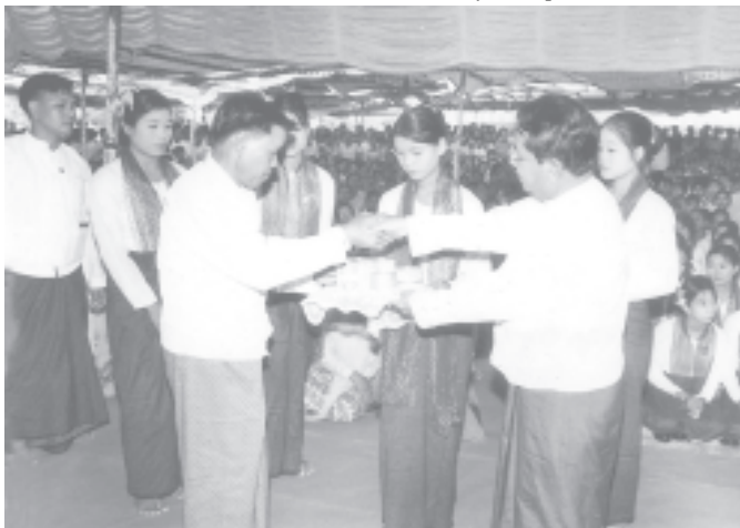
Minister Brig-Gen Kyaw Hsan gives gifts to the people of Salingyi township.

Next, he presented K 200,000 for regional development and personal goods, clothing and