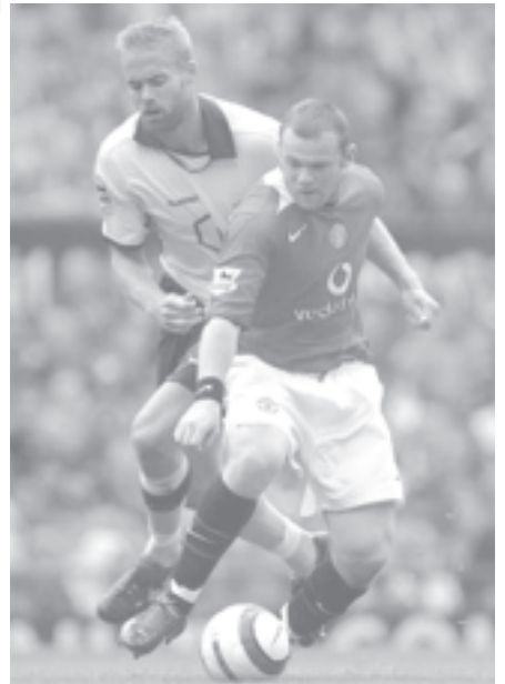
Manchester United's Wayne Rooney, right, controls the ball from Aston Villa's Olof Mellberg during their English Premier League soccer match at Old Trafford Stadium, Manchester, England, on 20 August, 2005. Manchester United won the match 1-0.