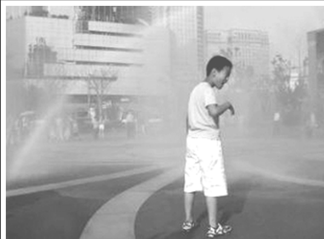
A Chinese boy enjoys the mist from a water fountain causing a rainbow in Shanghai on 20 August, 2005. Hot summer weather continues to prevail over China's financial capital of Shanghai.