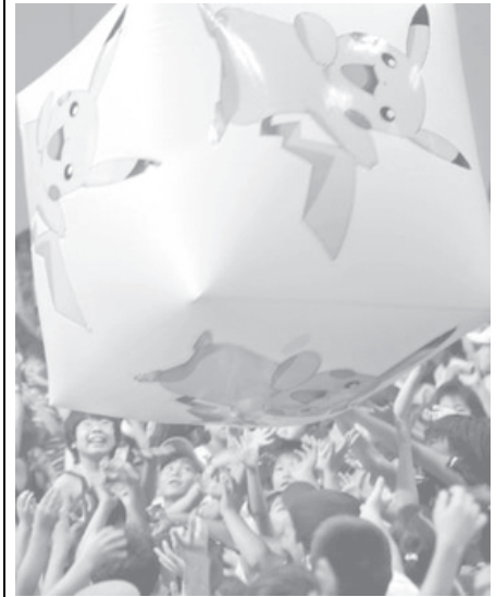
Japanese children play with a big Pokemon cube during Pokemon Festa 2005 in Yokohama, south of Tokyo on 20 August, 2005. Over 900,000 people attended the largest Pokemon event in Japan in nine places during this summer.