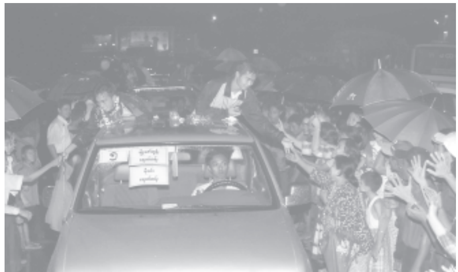
Myanmar football team being welcomed by soccer enthusiasts.