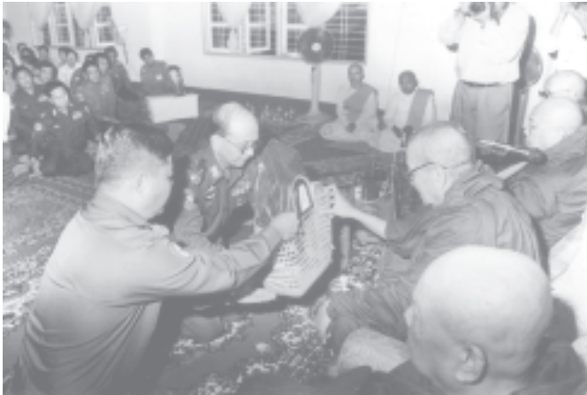
Lt-Gen Thein Sein presents offertories to a Sayadaw.