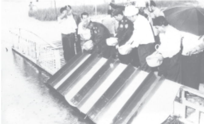
Lt-Gen Maung Bo free fingerlings into the farmland in Khayon Village of Kyaikmaraw Township.