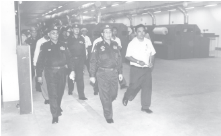
Prime Minister General Soe Win inspects Textile Factory (Pakokku).