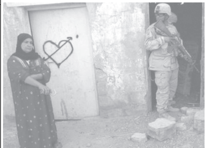
A US soldier stands watch next to an Iraqi woman as members of his squad search her farm in the northern Iraq town of Samarra in this military handout photo released on 12 August, 2005.