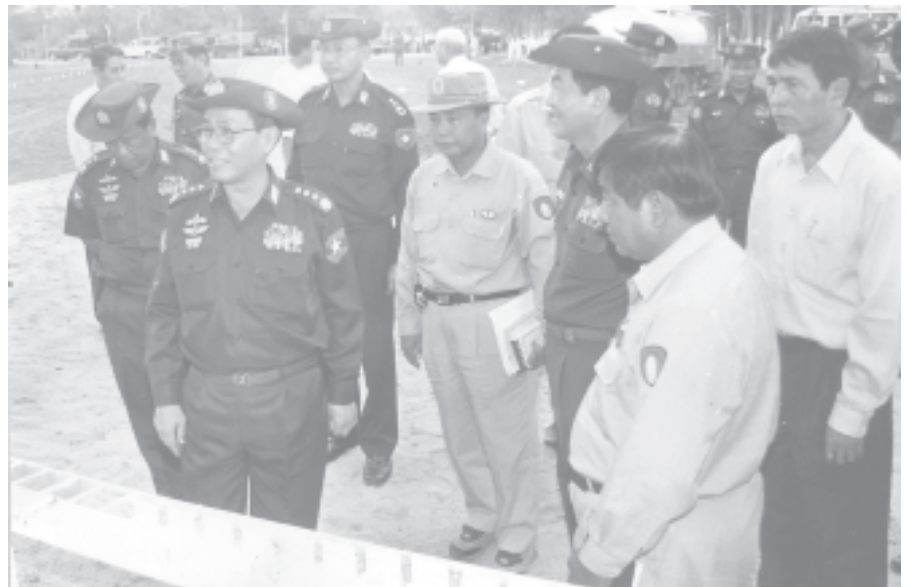
Prime Minister General Soe Win inspects the sinking of tube-well in Ngapyawdwin, Ward-2, Myaing.