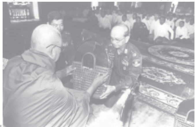
Secretary-1 Lt-Gen Thein Sein offers alms to a Sayadaw.