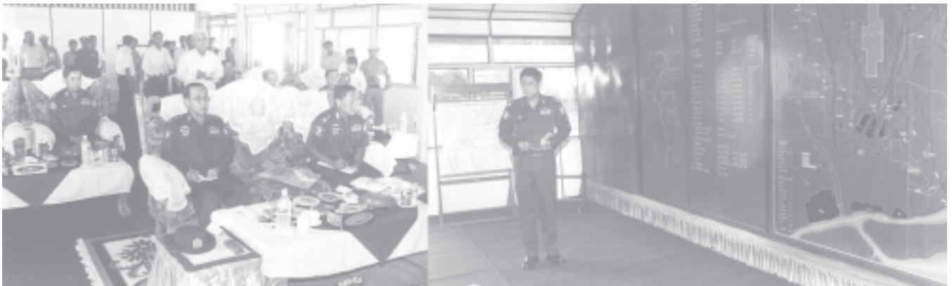
Minister Maj-Gen Htay Oo reports to Prime Minister General Soe Win on facts about Kyeeywa river water-pumping project in Pakokku. — MNA