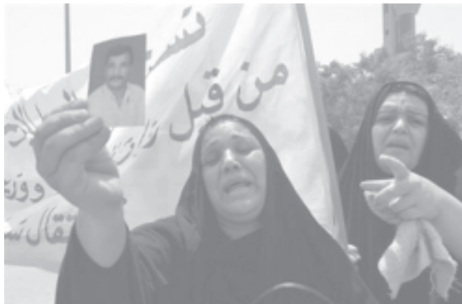
An Iraqi woman holds her husband's photograph as she cries during a protest of women demanding to know where the men in their families were taken after an early morning raid in their neighbourhood, on 13 August, 2005, in Baghdad, Iraq.