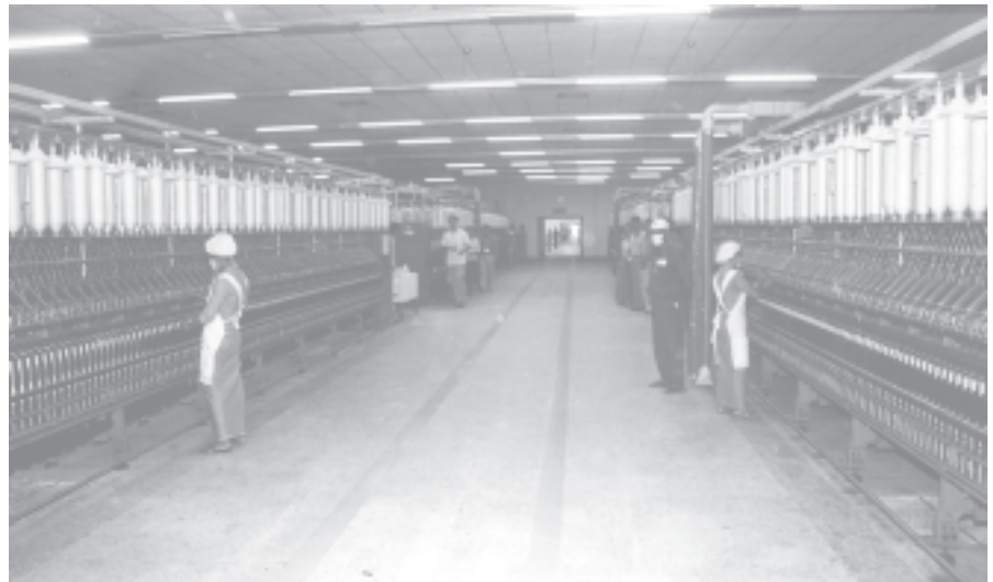
Worksite of Textile Factory (Pakokku).

At 11 am, the Prime Minister and party met with members of Pakokku Industrial Zone Supervisory Committee and industrial