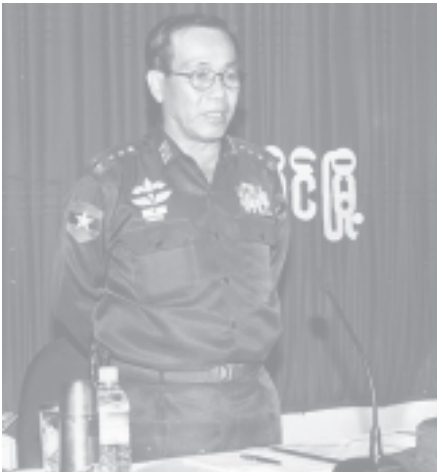
Prime Minister General Soe Win meets departmental personnel, social organization members and townsenders in Myaing.

in the region, availability of water and raising of the living standard of rural people.