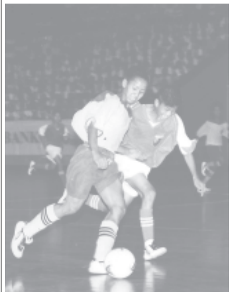
Yellow and red teams of Sports and Physical Institute playing at the futsal skill demonstration.

Teheran says it aims only to produce electricity and denies Western accusations it is seeking a nuclear bomb. Schroeder said he was against the spread of atomic weapons to more countries. But he included a rebuke to the current group of countries which already have the nuclear bomb.