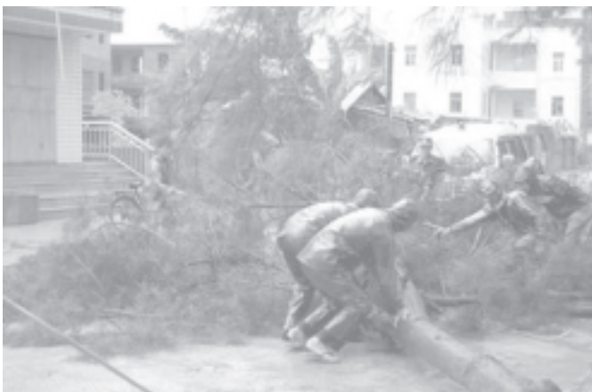
Chinese soldiers and residents remove a tree toppled by tropical storm Sanvu in Xiamen, east China's Fujian Province, on 13 August, 2005. —INTERNET

Natural disasters, mainly storms and floods, killed 232 people, left 38 others missing, injured 187 others, destroyed 4,200 houses and 3,000 hectares of rice, and killed over 2,000 cattle and 170,000 poultry in Vietnam last year, causing a total property loss of over some 57 million US dollars. — MNA/Xinhua