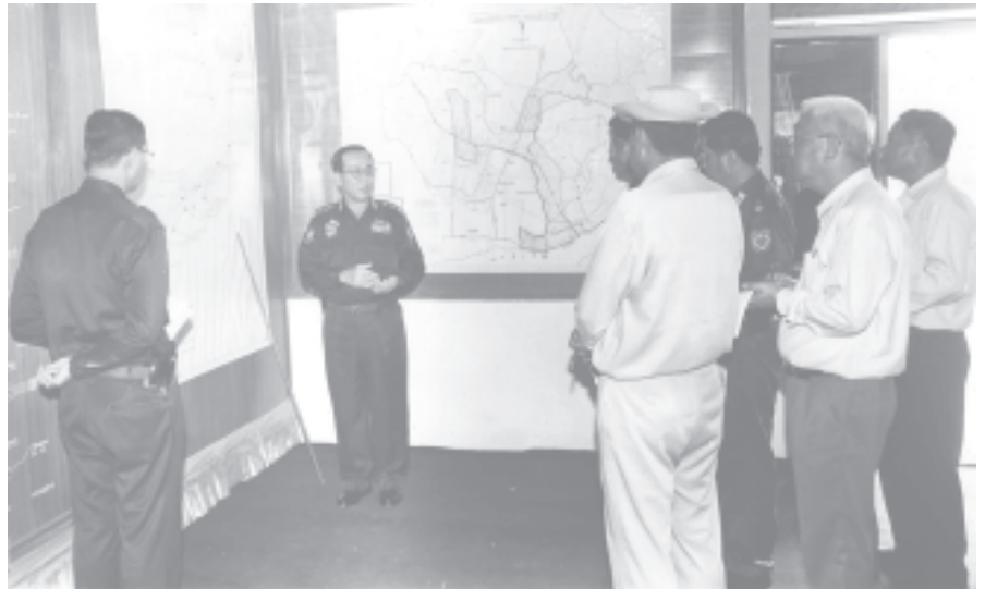
Prime Minister General Soe Win gives instructions to officials on Kyeeywa river water pumping project in Pakokku.

As development projects are being implemented to ensure the equitable development of all regions of the country, Myaing Township has now enjoyed more progress than it was in the past. The most required in the region is water, and so emphasis is being paid on the supply of water by tapping water supply resources in the region. For Myaing township to get enough drinking water, the government will cooperate with local people, said the Prime Minister. Service personnel and local authorities at various levels are to make efforts systematically for the project. It is necessary for the staff in shouldering their duties to be patient and diligent in the interest of the region and the department. In so doing, they are to be well aware that their efforts are not to cause a burden to the public. The State, while implementing the political, economic and social infrastructures, is striving to build a democracy that is compatible with the own situations of the country. That is why all the people are to work together in unity realizing the goodwill of the State, the Prime Minister said.