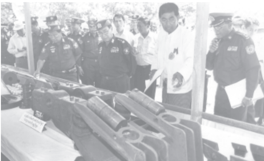
Prime Minister General Soe Win inspects machines produced by Pakokku Industrial Zone.— MNA

YANGON, 14 Aug — Prime Minister General Soe Win, accompanied by member of the State Peace and Development Council Lt-Gen Ye Myint, ministers, deputy ministers and officials of the State Peace and