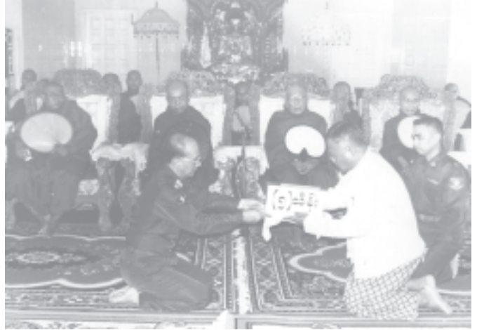
Secretary-1 Lt-Gen Thein Sein accepts cash donation for monasteries and nunneries in Yankin Township. — MNA

The afternoon's donation included 427 packages of rice, 278 viss of edible oil, 1,462 viss of iodized salt, 6,207 packages of traditional medicines, 263 viss of gram, 448 tubes of tooth paste, 4,920 packages of traditional medicines, 1,462 bars of soap, 1,462 cakes of soft soap, 781 viss of dried fish and K 14,468,950. — MNA