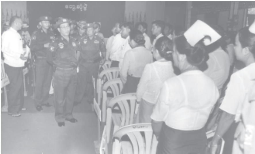
Prime Minister General Soe Win meets departmental personnel, social organization members and townselders in Myaing. — MNA

Later, Brig-Gen Thein Aung made a speech and the ceremony concluded. — MNA