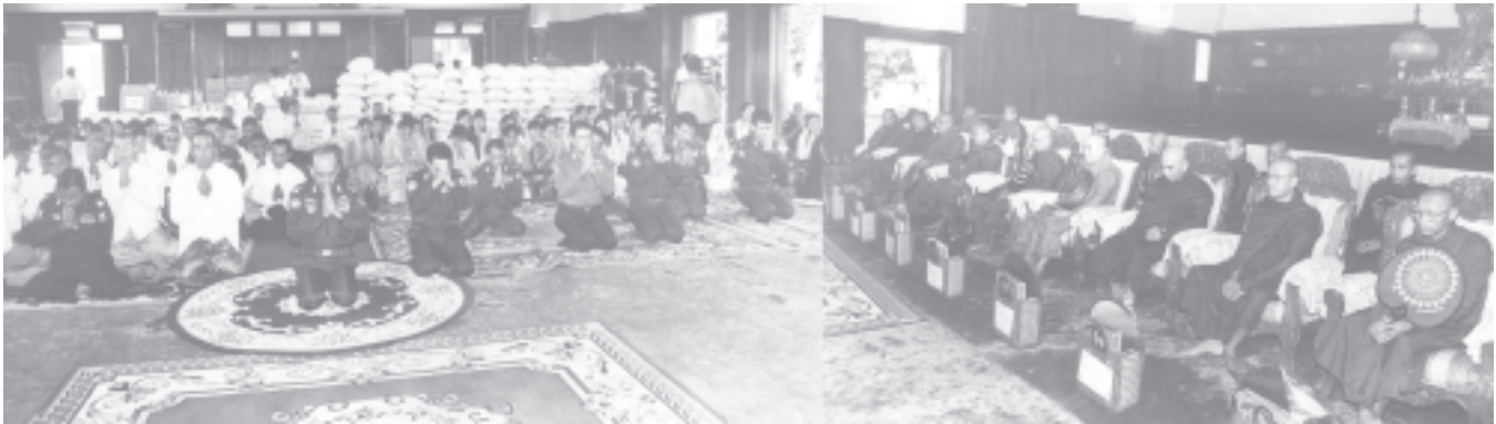
Secretary-1 Adjutant-General Lt-Gen Thein Sein and party taking Five Precepts from a Sayadaw at the ceremony to donate rice and alms to monasteries in Dagon Township.