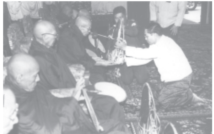
Commander Maj-Gen Myint Swe presents offertories to a Sayadaw.