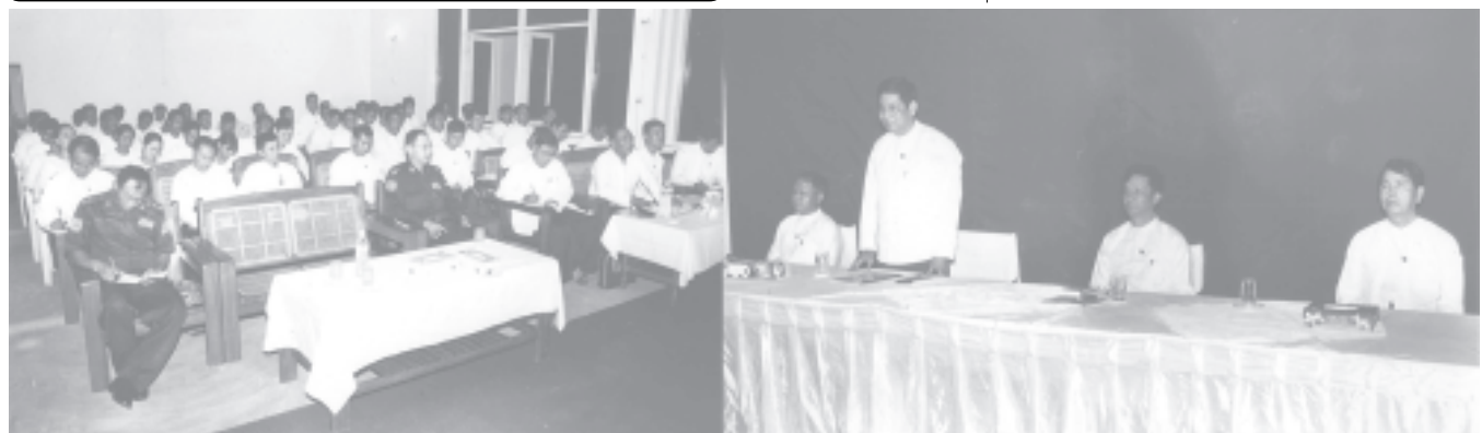
USDA Secretary-General Maj-Gen Htay Oo, CEC members meet district/township secretaries, CEC members, organizers and members in Pakokku.

As development projects are being implemented to ensure equitable development of all regions of the country, Myaing Township has now enjoyed more progress than it was in the past. The most required in the region is water, and so emphasis is being paid on the supply of water by tapping water supply resources in the region. For Myaing township to get enough drinking water, the government will cooperate with local people.