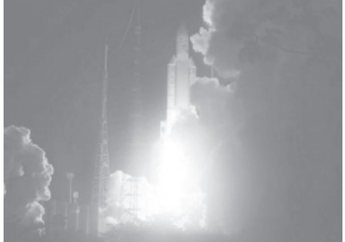
Ariane 5 G carrying the Thaicom 4 - iPSAT satellite blasts off from Kourou Space Centre in French Guiana on the equatorial northeast coast of South America, on early 11 August, 2005.