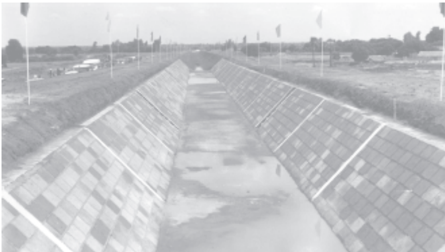
Kyeeywa river water-pumping project being implemented in Pakokku Township.

Kyeeywa and Nonpot river water pumping projects in Pakokku Township, Shwechaung and Wayathazi river water pumping projects in Yezagyo Township and Sanphe project in Pauk Township and Aukseik and Yawwa project in Seikpyu Township are being implemented. The completed project can irrigate about 20,000 acres of farmland. Kyeeywa river water pumping project will irrigate 5,000 acres of farmland.