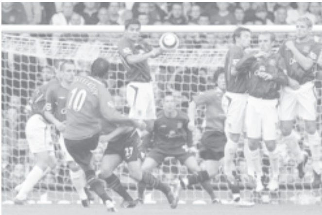
Manchester United's Ruud van Nistelrooy, left, hits the bar with a free kick against Everton during their English Premiership League soccer match at Goodison Park, Liverpool, England, on 13 August, 2005. Manchester United won the match 2-0.