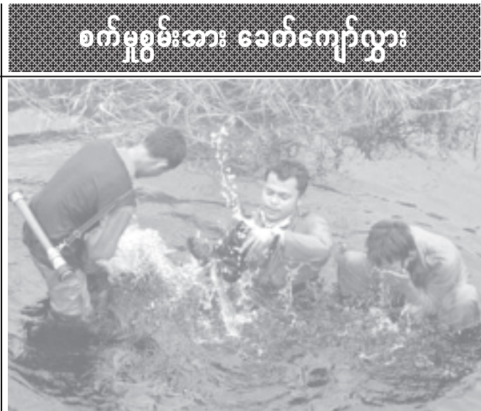
Firefighters clean themselves at a river after spraying water on burnt peat land in Rokan Hilir, Riau Province in Indonesia, on 13 August, 2005.

Vice-chairmen of the Central Military Commission Guo Boxiong, Cao Gangchuan and Xu Caihou also attended the meeting.