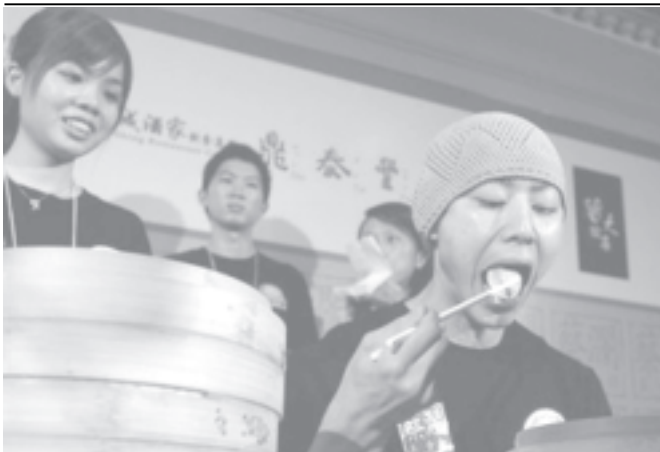
Takeru Kobayashi from Japan swallows the vegetarian dumplings during the dumpling eating contest in Hong Kong on 13 August, 2005. Kobayashi, 27, fended off 30 challengers to win the contest, downing 83 steamed dumplings in eight minutes. Kobayashi, a professional competitive eater, is the world champion of hot dog eating contests, setting a world record of downing 53 1/2 frankfurters in 12 minutes.

The background to the blast, which happened outdoors between two vehicles, was unclear, a spokesman said. "A terrorist background can however be excluded," he added. — MNA/Reuters