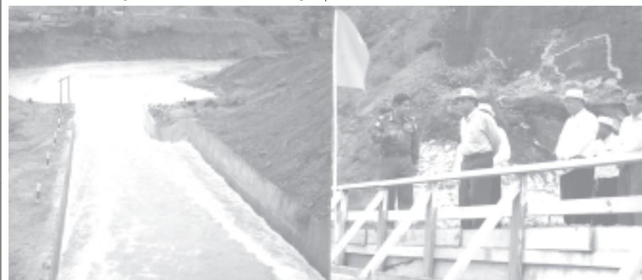
Minister for Agriculture and Irrigation Maj-Gen Htay Oo inspects outlet of diversion tunnel at Khabaung Dam.

In Oktwin Township, the minister looked into Shwelaung sugarcane plantations. The minister stressed the need for officials to strive for acquisition of techniques, quality strain sugarcane and raw materials for the Sugar Mill. — MNA