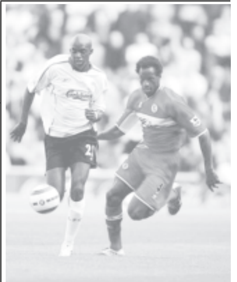
Liverpool's Momo Sissoko, left, beats Middlesbrough's Ugo Ehiogu, right, during their English Premier League soccer match at Middlesbrough's Riverside Stadium, on 13 August, 2005.