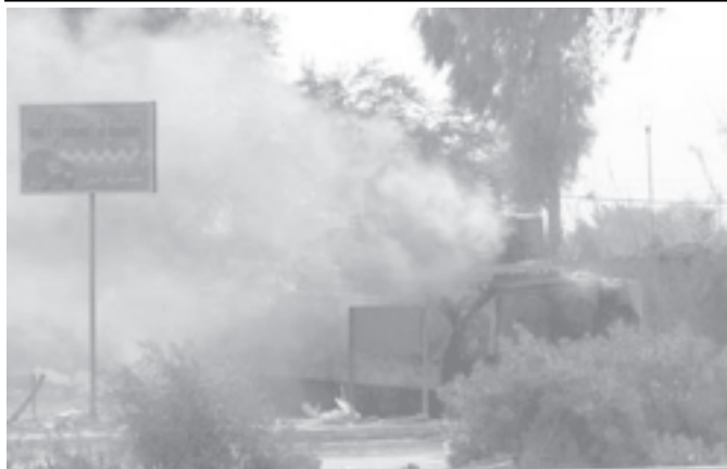
A US Army armoured vehicle burns after hitting a roadside bomb in Baghdad's Sadr City District on 13 August, 2005.