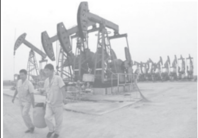
Chinese workers carry a barrel of waste oil at the Liaohe oilfield in Panjin, northeast China's Liaoning Province, on 12 August, 2005.