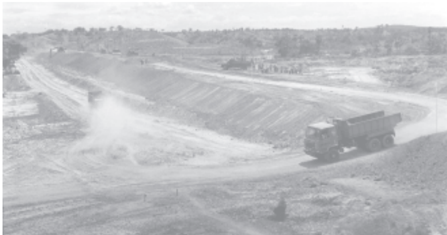
Prime Minister General Soe Win inspects earthwork of Myagetaung samll dam project in Yesagyoo Township.

Drinking water supply project is being implemented to provide water for 874 villages in the townships of Pakokku, Myaing, Yesagyoo, Pauk and Seikphyu in Pakokku District, and it will be completed very soon.