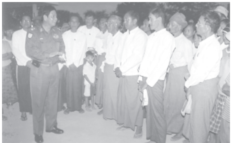
Minister for Agriculture and Irrigation Maj-Gen Htay Oo cordially converses with local people in Aleywa Village of Meiktila Township. — A&I

Afterwards, the minister met with local people and USDA members. At the meeting, he said the Government is striving for cent per cent development of the State including rural and border areas. USDA is to carry out five rural development tasks, joining hands with the local people. Therefore, all are to participate in the regional development, the minister said. — MNA