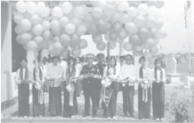
Commander Maj-Gen Myint Swe, Deputy Minister for Construction U Tint Swe and Deputy Minister for Education U Myo Nyunt formally open the new building of BEMS No 29 in Dagon Myothit (South) Township.