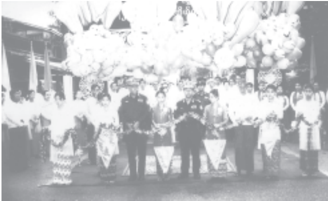
Commander Maj-Gen Myint Swe, Mayor Brig-Gen Aung Thein Lin and Chairman of Committee for Repaving Road U Kyaw Din formally open the road. — MNA

Present were Chairman of Yangon Division Peace and Development Council Commander of Yangon Command Maj-Gen Myint Swe, Minister for Religious Affairs Brig-Gen Thura Myint Maung and Chairman of Yangon City Develop-