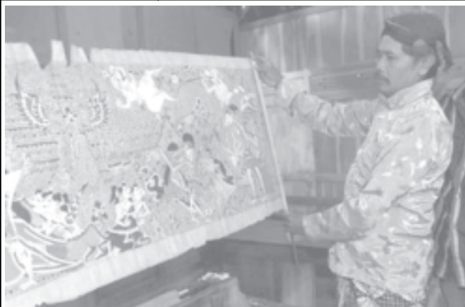
An artist shows a traditional painting depicting Mahabharata and Ramayana epics in Gelaran village, near Java's cultural heart of Yogyakarta, central Java, on 12 August, 2005.

Uganda's tourism industry had a major setback about six years ago when terrorists hit Bwindi Impenetrable National Park and killed tourists and officials.