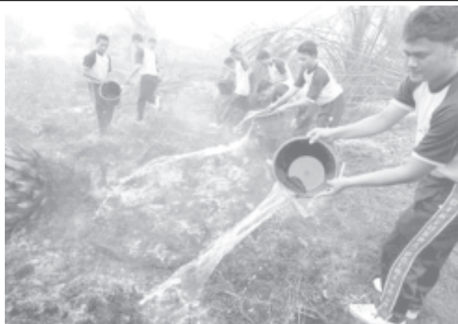
Indonesian policemen in sports attire help firefighters spray water on burnt peat land in Rokan Hilir, Riau Province, on 12 August, 2005.