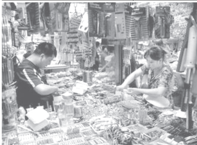
Chinese customers shop at a retail department store in China's financial centre of Shanghai, on 12 August, 2005.