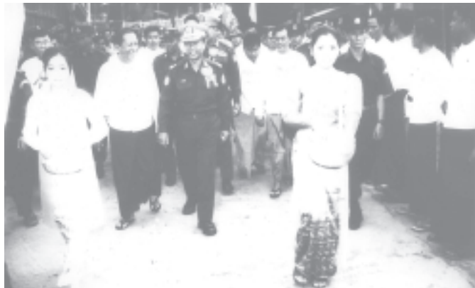
Commander Maj-Gen Myint Swe, Mayor Brig-Gen Aung Thein Lin and officials inspect the new road. — MNA