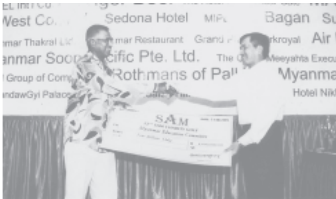
Minister U Nyan Win accepts K 4 million donated by Singapore Association of Myanmar-SAM.