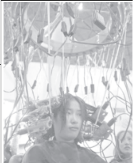
A Chinese woman tries on a new hair marcelling (perming) machine at the 2005 China International Beauty Exhibition in Beijing, on 12 August, 2005.