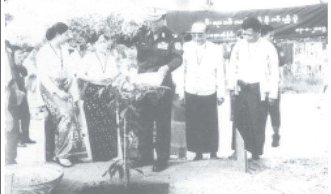
Commander Maj-Gen Myint Swe plants a star flower tree to mark tree planting ceremony held at West Yangon University.

YANGON, 13 Aug — West Yangon University held the rainy season tree planting ceremony at the university in Htantabin Township this morning, attended by Chairman of Yangon Division Peace and Development Council Commander of Yangon Command Maj-Gen Myint Swe.