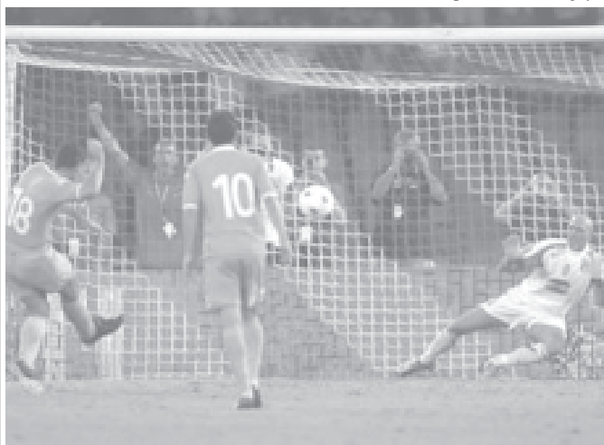
Napoli's Sosa (L) scores from the penalty spot during the Trophy Birra Moretti soccer match against Juventus at the San Paolo Stadium in Naples on 12 August, 2005.