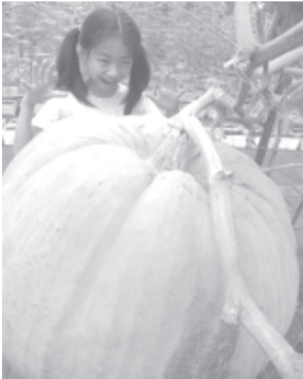
A little girl poses for a photo with a huge pumpkin at an agricultural garden in Beidaihe, a city in north China's Hebei Province, on 11 Aug, 2005. Two over-100-kilogram pumpkins borne in the garden have surprised many tourists here.