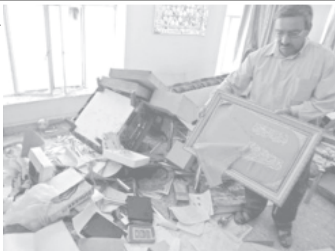
A man picks up a piece of torn art work following a raid by US troops in Baghdad on 12 Aug, 2005.

new Constitution, the first since the oust of President Saddam Hussein. But the discussions among Iraqi parties have been deadlocked because of sharp differences over autonomy of Kurds and other issues.—MNA/Xinhua