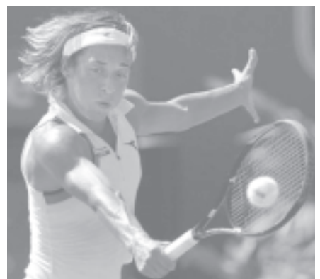
Italy's Francesca Schiavone returns a shot to Spain's Conchita Martinez during the quarterfinals of the JP Morgan Chase Open WTA tennis tournament in Carson, California, on 12 August, 2005.

This ban is a punishment for violence at a June qualifying match against Morocco in Nairobi. Before the 18 June match, overzealous Kenyan fans waiting outside of the Nyayo Stadium lost patience and broken into the stadium. During the chaos, a 15-year-old school boy was stampeded to death and scores were injured. — MNA/Xinhua