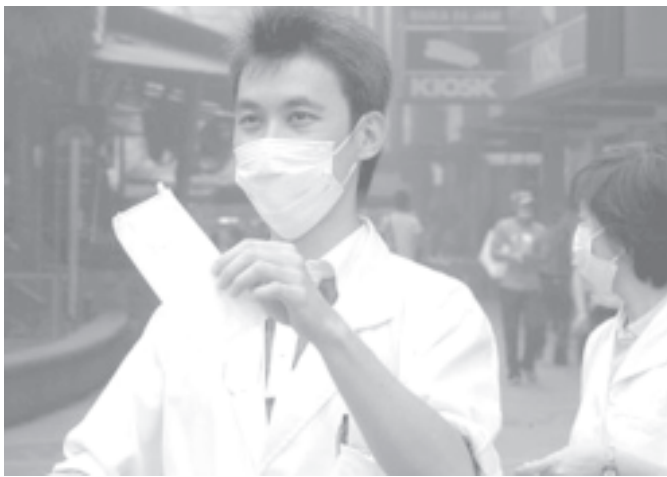
A man sells masks in downtown Kuala Lumpur on 11 August, 2005. Malaysia got a short breathing space on Friday from its worst air pollution crisis in eight years as changing winds scattered acrid smoke from forest fires burning in neighbouring Indonesia.