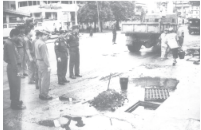
Commander Maj-Gen Myint Swe and Mayor Brig-Gen Aung Thein Lin inspect sanitation tasks on Gyadawya Road in Bahan Township.—YANGON COMMAND

YANGON, 13 Aug—Chairman of Yangon Division Peace and Development Council Commander of Yangon Command Maj-Gen Myint Swe and Chairman of Yangon City Development Committee Mayor Brig-Gen Aung Thein Lin this morning inspected measures for sprucing up Yangon City.