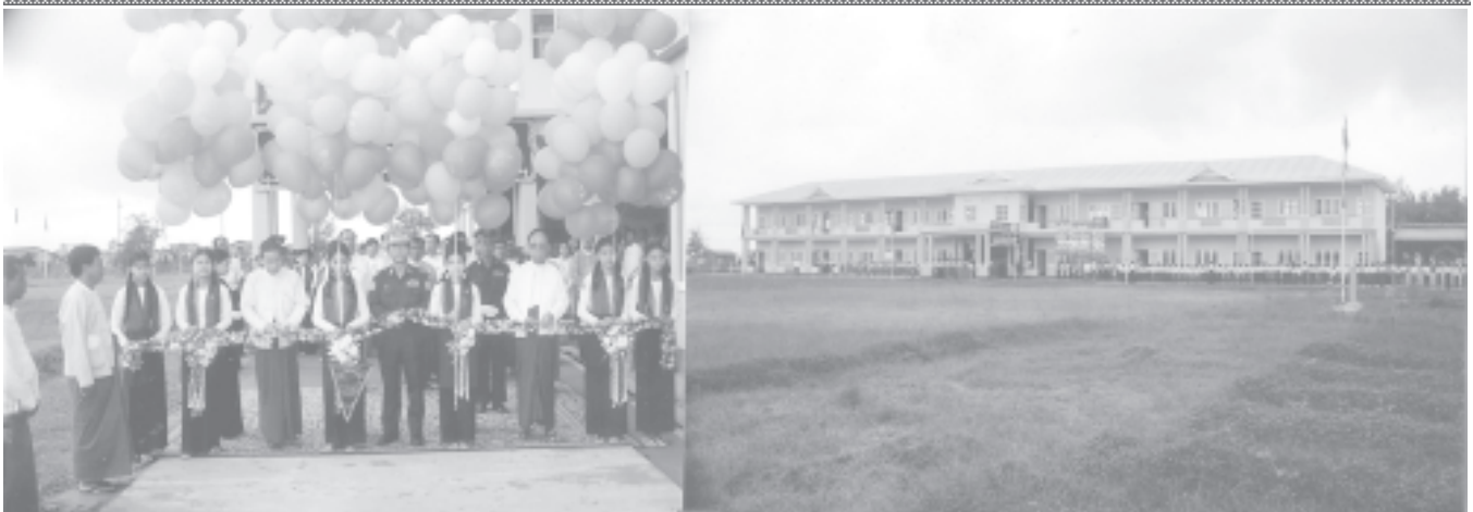
Commander Maj-Gen Myint Swe, Deputy Minister for Construction U Tint Swe and Deputy Minister for Education U Myo Nyunt formally open new building of BEMS No 1 in Dagon Myothit (Seikkan) Township.— YANGON COMMAND

YANGON, 13 Aug — A ceremony to hand over new buildings of basic education schools were held in Dagon Myothit (South) and (Seikkan) Townships this morning.