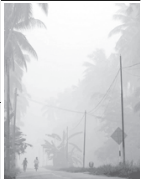
Malaysia children ride bicycles in haze-covered Pulau Indah village in Klang about 70 km (43 miles) west of Kuala Lumpur, on 11 August, 2005.