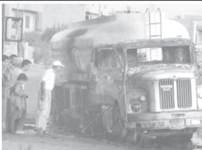
Local residents look at a fuel truck which was destroyed during a gunbattle in the northern Iraqi city of Mosul on 12 Aug, 2005.

Carter's comments came one day after President George W Bush rejected calls for a quick pullout. Bush, who is vacationing at his ranch in Texas, said a premature withdrawal would betray the Iraqis just as they are being trained to defend themselves and eventually take over from US soldiers. Carter was in Kings Bay, Georgia, to tour the USS Jimmy Carter, a newly commissioned nuclear submarine. Carter, a former Navy submarine officer, and his wife Rosalynn spent on Thursday night on the submerged vessel.—Internet