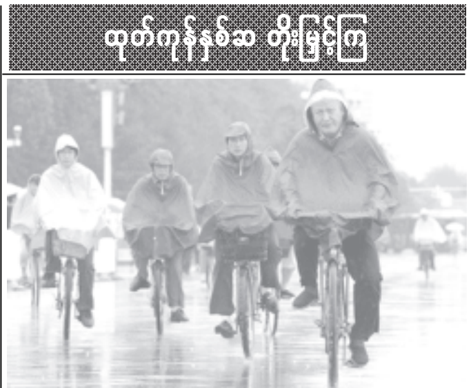
Cyclists ride through heavy rain in Beijing recently. Floods and related disasters have killed 910 people in China so far this year with another 218 missing, the International Red Cross said as it launched an emergency appeal for 4.4 million dollars in aid.

We hope to see a united and strong ASEAN. We hope to make joint efforts with all ASEAN members states to promote regional cooperation and contribute to regional peace and prosperity." Sihamoni said the leaders and peoples from the two countries have established profound friendship over the past years. His visit to China is aimed at carrying the traditional friendly relations into the future. — MNA/Xinhua