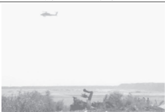
A US military helicopter flies over the site of a downed Apache gunship near the northern city of Kirkuk, on 12 August, 2005.—INTERNET

A Red Cross official said earlier this week there had been no deaths but said there were fears the water could spread disease in the city of 600,000 where there are many open latrines and drainage is poor. — MNA/Reuters