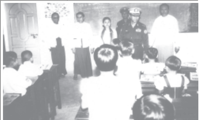
Commander Maj-Gen Myint Swe, Deputy Ministers U Tint Swe and U Myo Myint look into the new school building.

ပြန်ကြားရေးဝန်ကြီးဌာန ပြန်ကြားရေးနှင့်ပြည်သူ့ဆက်ဆံရေးဦးစီးဌာန