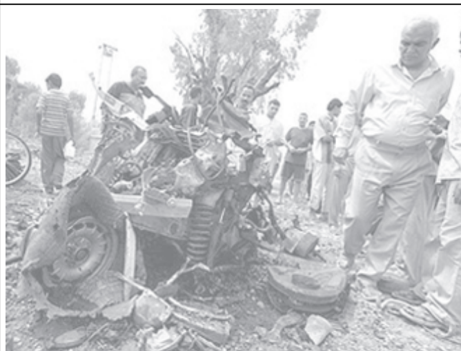
Residents look at the remains of a vehicle used by a suicide bomber following an attack in Baghdad on 10 Aug, 2005.