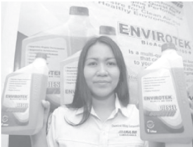
A Filipino promotion personnel displays a newly launched oil product—coconut methyl ester blended with diesel—at a petrol station in Manila, on 11 August, 2005.