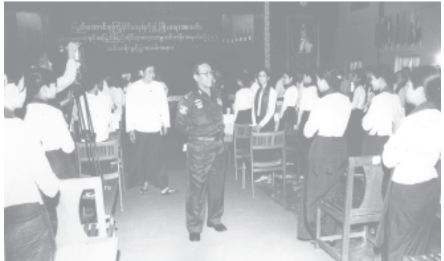
Prime Minister General Soe Win cordially greets the trainees after the opening ceremony of USDA Myanmar and International Studies Course No 9. — MNA

At present, the Tatmadaw has been implementing work programmes and policies that are in conformity (See page 8)