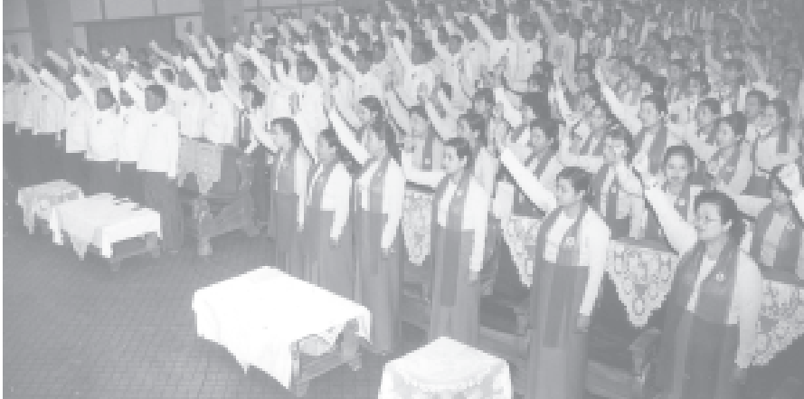
Those present chanting slogans at the mass meeting on guarding against the danger of internal and external destructionists through united strength of the people in Haka, Chin State. — MNA

atically carry out tasks for prevention of violence against women and rehabilitation; to carry out eradication of trafficking in women and children as a national duty, and to cooperate with international, regional, internal and external organizations in carrying out matters on women's rights in accord with traditional culture & customs of national races.