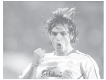
Fernando Morientes from Liverpool celebrates his goal against CSKA Sofia during their third round Champions League Qualifier football match in Sofia. Liverpool won 3-1.