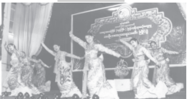
Maj-Gen Myint Swe attends entertainment of Culture Students (Yangon) and artistes at the opening ceremony of the higher education level 13th Myanmar Traditional Cultural Performing Arts Competitions.