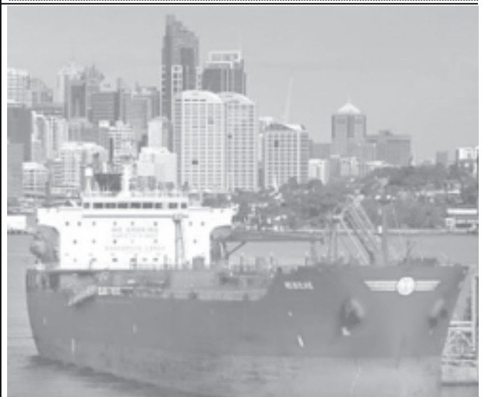
The Singapore registered tanker 'Resolve' is berthed at an oil depot in Sydney Harbour, on 9 August, 2005.