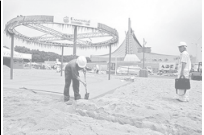
A worker flattens 1,000 tons of white sand acquired from China to make a beach in front of the national gymnasium in Tokyo during preparations ahead of a nine-day event called 'Tokyo Plage.'—INTERNET

Nearly 800 delegates from 120 countries and regions across the world, most of whom are public health ministers, are taking part in the five-day conference. MNA/Xinhua