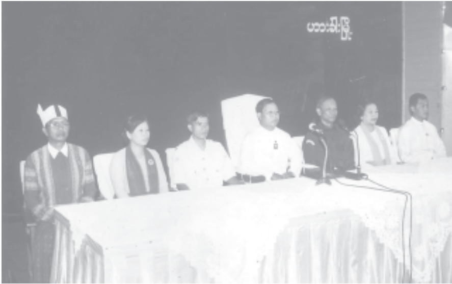
The meeting chairman and members of panel of chairman seen at the mass meeting in Haka.