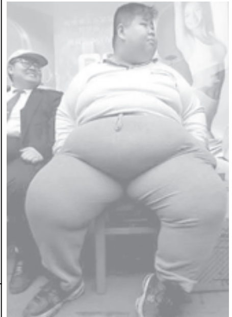
There is no link between sugar and obesity because health problems linked to weight gain are caused by increased consumption of calories and a lack of exercise, a US sugar industry group said on 10 August, 2005.—INTERNET