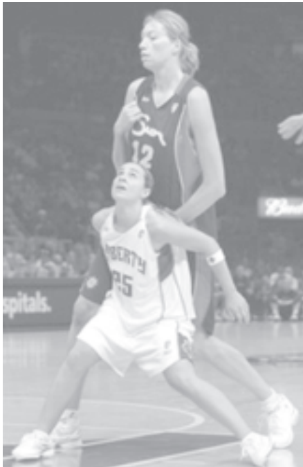
The New York Liberty's Becky Hammon, in front, guards the Connecticut Sun's 7-foot-two-inch centre Margo Dydek, of Poland, during the second half of their WNBA game at Madison Square Garden in New York on 2 Aug, 2005.

However, the 2004 Bundesliga champions pulled themselves back into contention in the 73rd minute when German international Miroslav Klose turned deftly in the area before rifling the ball past Basel goalie Pascal Zuberbuehler. — MNA/Reuters