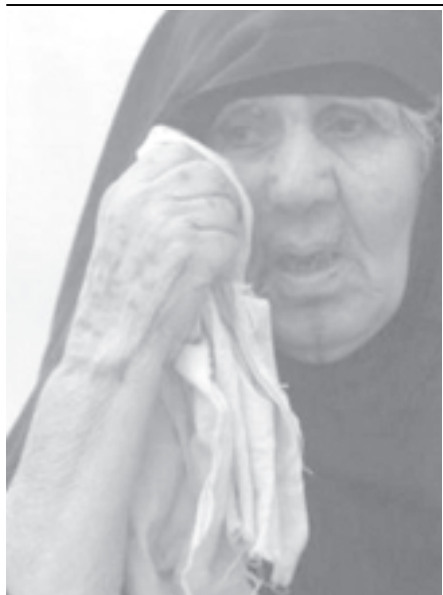
An Iraqi woman having trouble breathing during a massive sandstorm seeks treatment at the Yarmouk hospital, on 8 Aug, 2005, in Baghdad, Iraq.