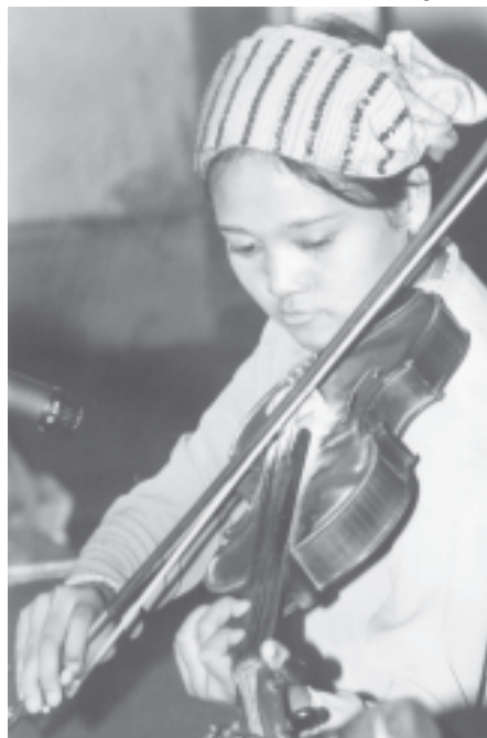
A national race damsel takes part in higher educational level women's violin contest in the 12th Myanmar Traditional Cultural Performing Arts Competitions.

Myanmar culture and performing arts have flourished in their own traditional form and style. It is a bounden and historic duty of the present-day people to safeguard and preserve the national characters and hand them down to the new genera-