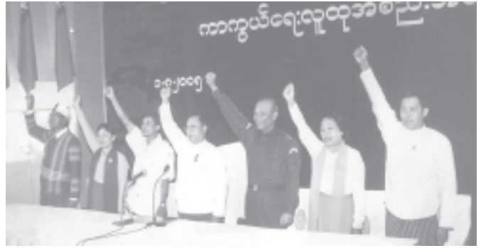
Members of the panel of chairmen chanting slogans at the mass meeting held in Haka, Chin State.

State, the Tatmadaw Government had laid down Our Three Main National Causes, four political objectives, four economic objectives and four social objectives and is marching to realize them. Furthermore, the Government upholding the four-point people's desire, and six resolutions laid down at the mass meeting held in Bagan and has laid down and is implement-