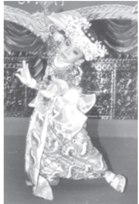
A boy gives performance in basic education level boys' dance contest (aged 5-10) of the 12th Myanmar Traditional Cultural Performing Arts Competitions.

We need to have the ability to harmonize our efforts to preserve our culture and to apply innovative ideas in doing so. It is important for the race to uplift the national prestige and integrity and preserve and safeguard cultural heritage and national character, while introducing innovations