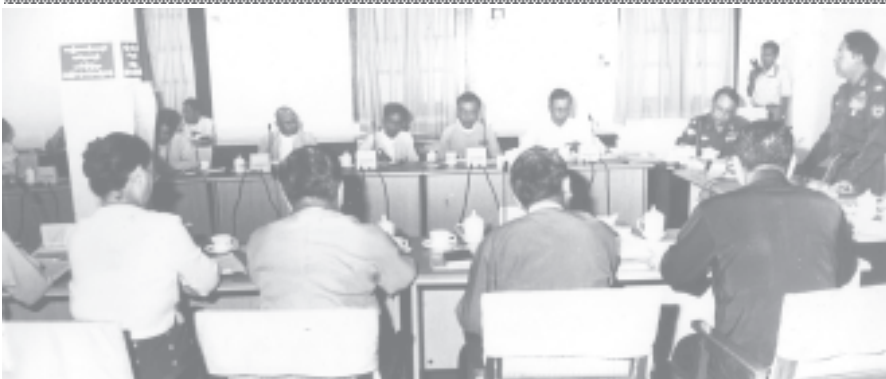
Minister Brig-Gen Kyaw Hsan delivering a speech at the coordination meeting. — MNA

YANGON, 11 Aug—The Committee for Printing and Distribution of School Textbooks held its meeting No 2/2005 at the Ministry of Information on Theinbyu Road here this afternoon to deal with matters on distribution of school textbooks in 2006-2007.