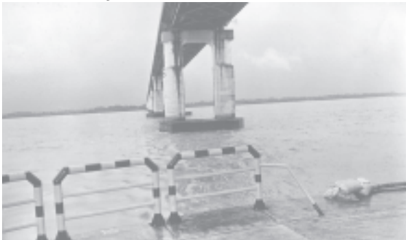
Member of the State Peace and Development Council Lt-Gen Khin Maung Than inspects flow of water under Bo Myat Tun Bridge.