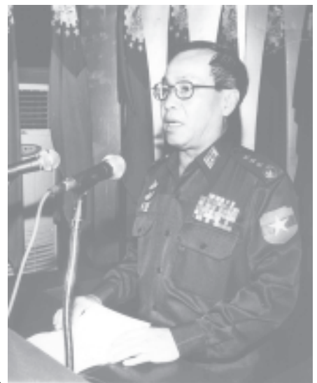
Prime Minister General Soe Win delivers an address at opening of Myanmar and International Studies Course No 9 of USDA.

For hundreds of years, Myanmar had been an independent and sovereign nation. The nation stood as the First Myanmar Empire in Bagan period, the Second Myanmar Empire in Toungoo period and the Third Myanmar Empire in Konbound period when unity was strong and the nation was powerful. Myanmar lost independence after the three aggressive wars launched (See page 16)