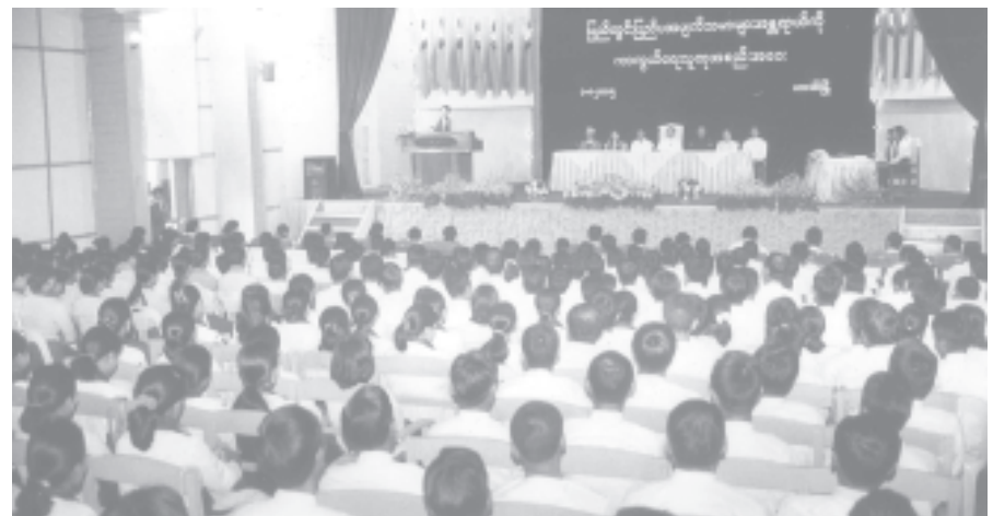
Mass meeting to guard against the dangers posed by internal and external destructive elements through the united strength of the people in progress in Haka, Chin State.