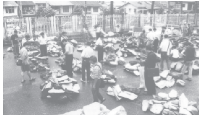
Gem merchants at home and abroad view jade lots displaying at the 19th gems and jades sales 2005.

The 19th gem and jade sales of UMEHL will