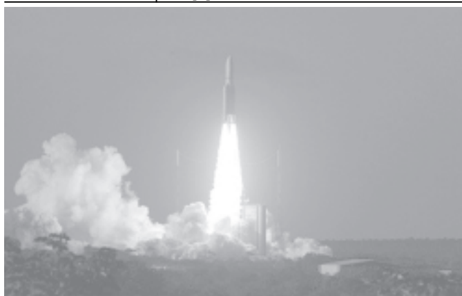
An Ariane 5 super-rocket is launched in Kourou, French Guiana. A rocket launched from South America was due to deploy a satellite that its Thai operator says will bring broadband Internet access to the remotest corners of Asia.