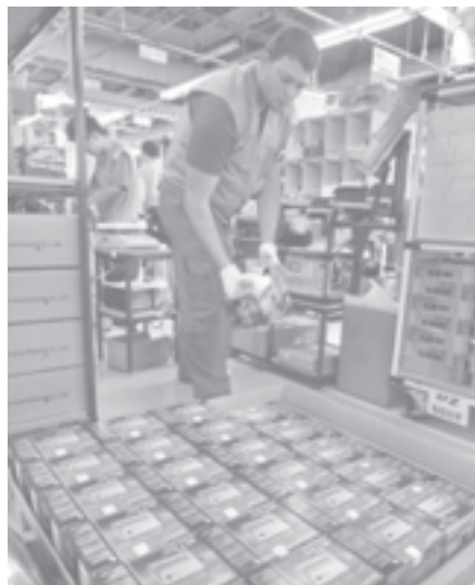
An employee of Japan's electronics giant Sony packs digital cameras into a container for shipment. Japan's current account surplus fell by an unexpectedly wide margin in June as soaring oil prices boosted the costs of imports and demand dwindled abroad for Japanese electronics on 11 Aug, 2005.

As soldiers tended to the casualties, the patrol came under attack by small arms fire and rocket-propelled grenades, the spokesman said. The contractor wounded in the attack was a dog handler, he said; dogs are often used by the military to detect explosives.— Internet