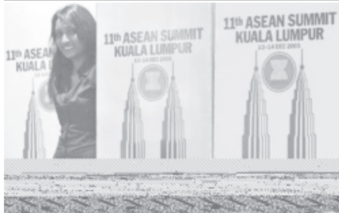
An international student of Lim Kok Wing University College stands next to newly launched logo of the 11th ASEAN Summit in Putrajaya, outside Kuala Lumpur, on 8 August, 2005. The 11th ASEAN Summit is to be held in the Malaysia's capital of Kuala Lumpur from December 12 - 14, 2005.—INTERNET

Commerce Ministry statistics show that the export value of garments, textiles and shoes increased by 8.95 per cent to 906 million dollars in the January-June period from 832 million dollars in the first six months of 2004.— MNA/Xinhua