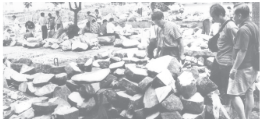
Gem merchants inspect jade lots at 19th Gems and Jade Sales of UMEHL.— MNA

So far 835 local merchants and 283 merchants from abroad arrived at the sales and they inspect gems and jade lots. — MNA