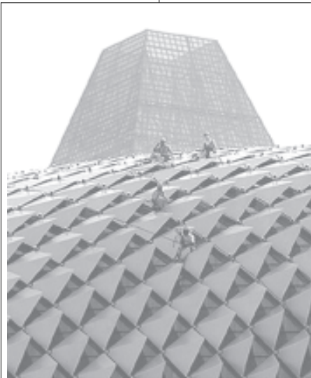
Workers clean the roof of the Esplanade, Singapore's ultramodern performing arts centre. Singapore is in the midst of a makeover designed to reposition itself as an arts and entertainment hub to rival some of the most vibrant capitals of the world.