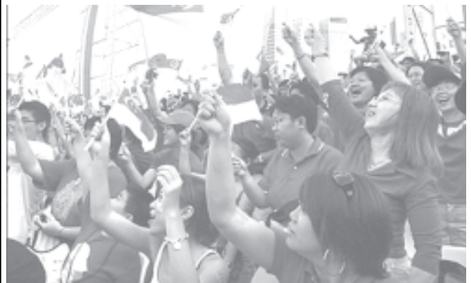
Singaporeans wave the national flag as they attend celebrations marking the Singapore's 40th National Day. The Republic of Singapore was born on 9 August, 1965 after leaving the Malaysian federation.