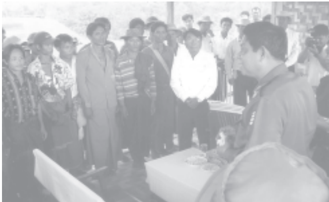
Minister for Agriculture and Irrigation Maj-Gen Htay Oo meets local farmers in Aingma Village of Pale Township.—A&I

Later, the minister cordially greeted the local people. According to