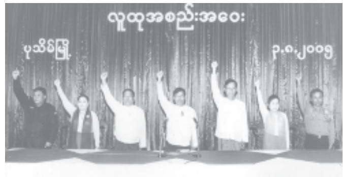
Members of the panel of chairmen chanting slogans at the mass meeting held in Patheingyi, Ayeyawady Division.

Union Spirit is the oneness of the entire people living in any part of the nation under the single State Flag. The Union Spirit is essential in building a nation. All the citizens must realize the value of the Union, sovereignty, Independence and Union Spirit upholding non-disintegration of the Union, non-disintegration of national solidarity and perpetuation of sovereignty.