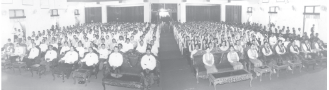
The mass meeting to guard against the dangers posed by internal and external destructive elements through the united strength of the people in progress in Patheingyi, Ayeyawady Division.

Thanks to the cooperative efforts of the government and the people, we are now witnessing the fruits of development. We relied on water-