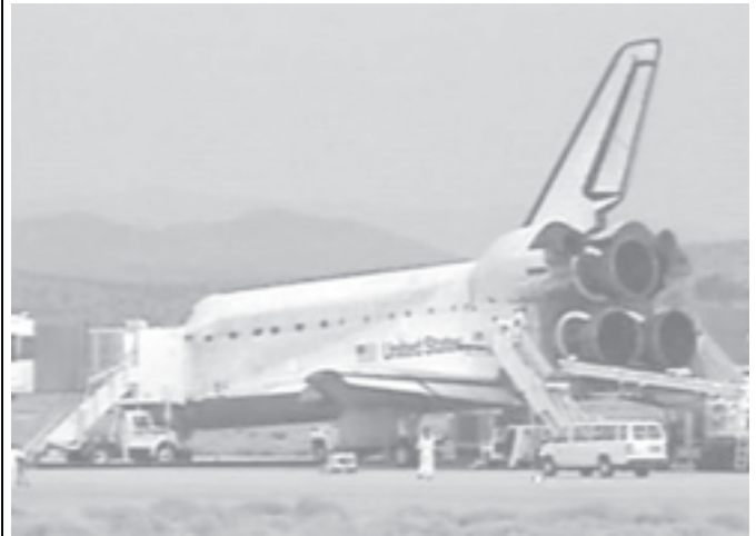
The shuttle Discovery sits on the runway after a successful re-entry and landing at Edwards Air Force base in California, on 9 August, 2005. Discovery and its seven astronauts returned to Earth safely on Tuesday, bringing a successful end to NASA's troubled return to human spaceflight 2 1/2 years after the destruction of sister ship Columbia.