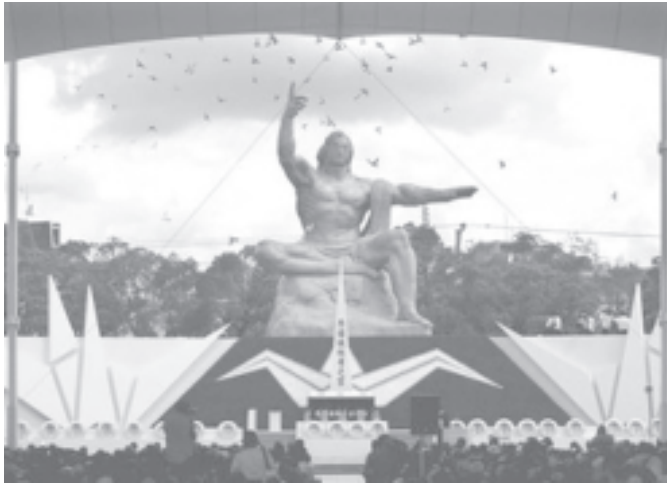
Doves fly over the Statue of Peace during the ceremony to mark 60th anniversary of the atomic bombing in Nagasaki, southwestern Japan on 9 Aug. 2005. The atomic bomb attack on this city left more than 80,000 dead and hastened the end of World War II exactly 60 years ago.