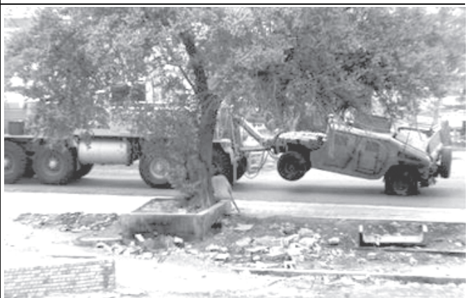
A US military Humvee damaged by a suicide car bomb explosion is towed away by US troops, on 9 August, 2005, in Baghdad, Iraq. Iraqi government officials say five civilians were killed with over 35 injured. It was not immediately known if there were any US military killed or wounded in the attack.