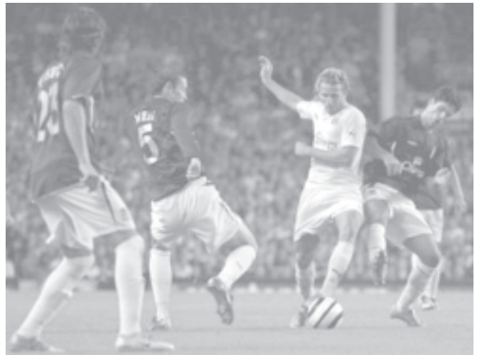
Everton's midfielder Mikel Arteta (R) and defender David Weir (2nd L) battle with Villarreal's forward Diego Forlan (2nd R), as Everton's defender Alessandro Pistone (L) looks on, during their UEFA Champions League third qualifying round, first leg soccer match against Villarreal at Goodison Park in Liverpool, north England, on 9 August, 2005.