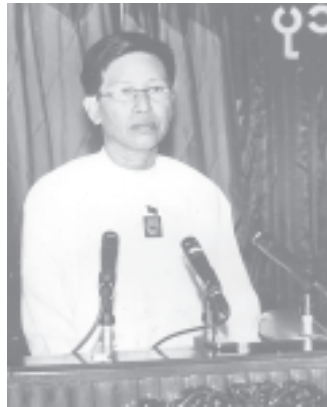
Ayeyawady Division USDA Executive U Kyi Win. MNA

USDA U Kyi Win said that the Government is fulfilling requirements of all sectors in all parts of the nation including remote areas for ensuring solidarity of the national brethren.