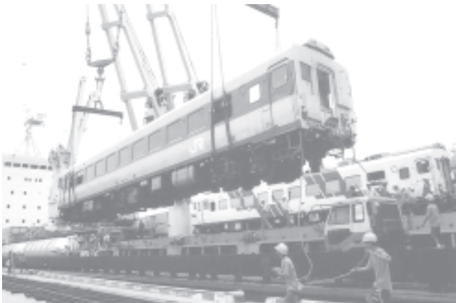
A locomotive of DT 22C Rail Bus being unloaded from MV Magway. RAILWAYS