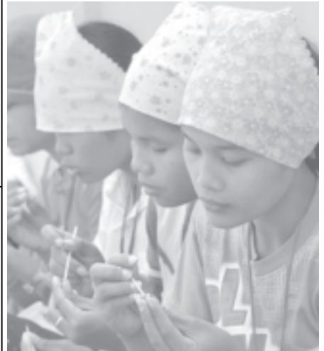
Cambodian garment factory workers take a break. Economic growth in East Asia will remain robust but will slow down to 6.8 percent in 2005 due to a less favourable external environment, the Asian Development Bank (ADB) has forecast.