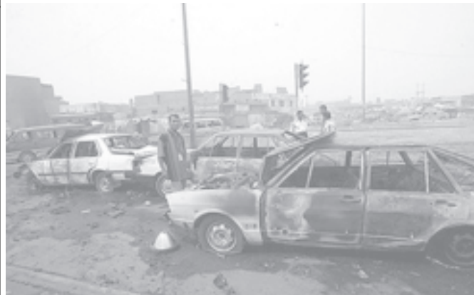
Damaged vehicles are seen following a suicide car bomb attack in central Baghdad recently.

Cerebral malaria in Bihar is said to have killed hundreds of tribal people in the past decade. The state government record puts the figure at less than 500.