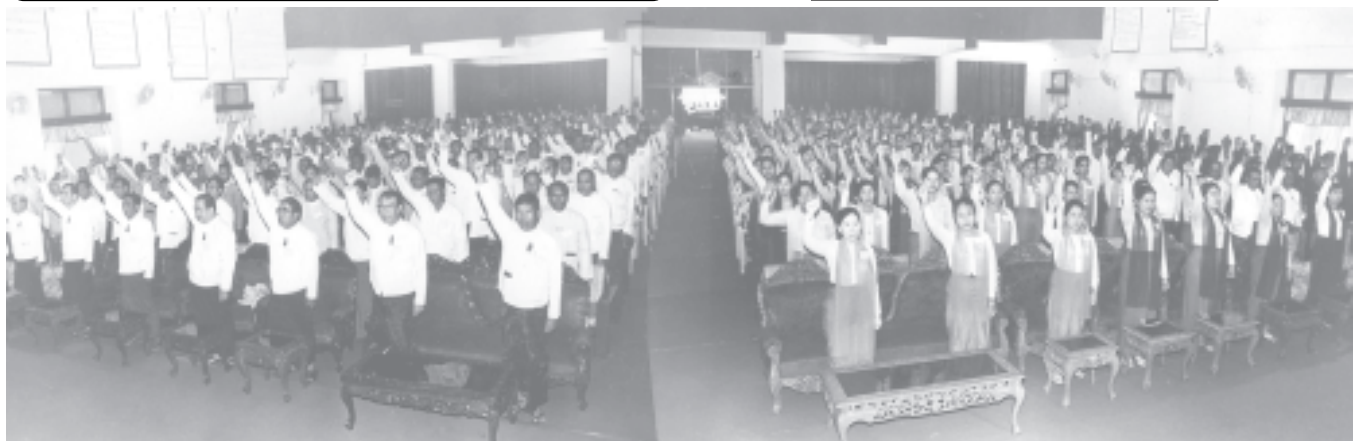
Those present chanting slogans at the mass meeting on guarding against the danger of internal and external destructionists through united strength of the people in Ayeyawady Division.

Emergence of the State Constitution is the duty of all citizens of Myanmar Naing-Ngan.