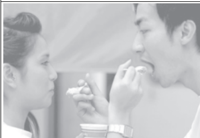
A couple feeds each other with ice cream during a promotion event of an ice cream brand in a Hong Kong street on 7 Aug, 2005.