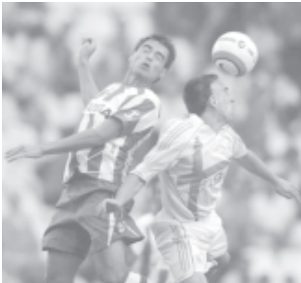
Deportivo Coruna's Aldo Duscher (L) and Olympique Marseille's Frank Ribery jump for the ball during their UEFA Intertoto Cup final first leg soccer match at Coruna's Riazor Stadium on 9 August, 2005.