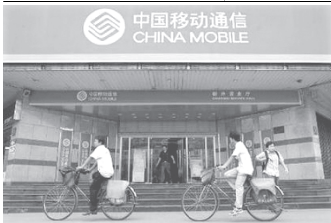
Chinese cyclists pedal past a China Mobile office in Beijing on 10 August, 2005. China Mobile, the world's top mobile carrier by subscribers, posted a 28 percent gain in first-half net profit on Wednesday, thanks to acquisitions and robust subscriber growth.