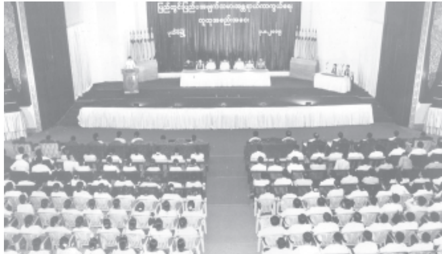
The mass meeting on guarding against the danger posed by internal and external destructionists through united strength of the people in progress in Patheingyi, Ayeyawady Division.

just for self-interest. The traitors announced the formation of Shan State provisional government, which is a grave danger to the nation. The traitors are also using the ILO as a podium to put pressures on the Tatmadaw government. The ILO has permitted terrorists and fugitives to attend its meeting. It is against its rules. The ILO is breaking its own rules and providing encouragement to the terrorists and fugitives, while encroaching on the nation's sovereignty. In reality, it is insulting the entire Myanmar people. All the nationalities of Myanmar totally oppose the perpetration of some