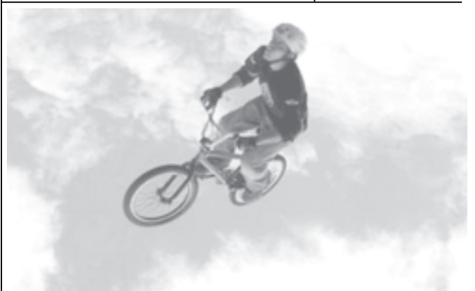
A Colombian jumps with his bike during the summer festival sport activities in Bogota, on 7 August, 2005. The summer festival runs until 15 August.