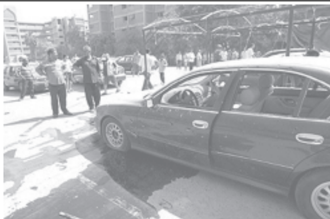
People look at a damaged vehicle after a mortar fell, close to a former government building in central Baghdad on 3 August, 2005.

moving towards China's southeastern coastal areas at a speed of 20 kilometres per hour. The first typhoon landing at China came about one month later this year than the previous years. The first typhoon Haitang landed at the island province of Taiwan on 18 July, in contrast with the normal typhoon season starting from mid-June and ending at mid-October.—MNA/Xinhua