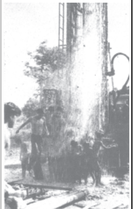
Villagers taking a bath with delight under water gushed out of a four-inch tube well in Nyaungbintha Village, Monywa.

(Translation: TMT) Myanma Alin, Kyemon 4-8-2005