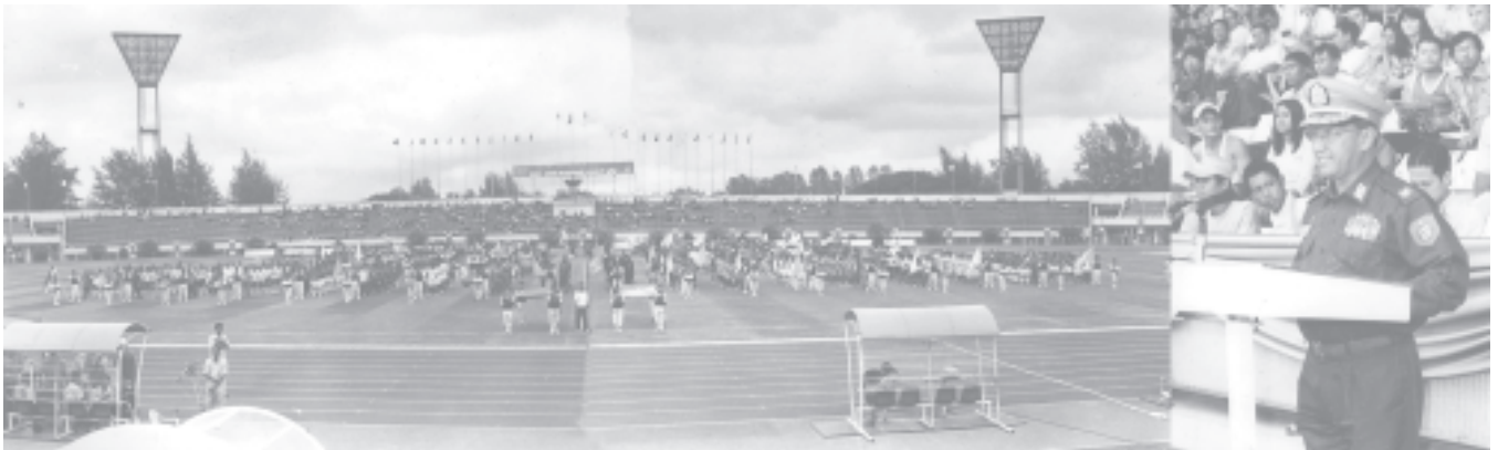
Minister for Sports Brig-Gen Thura Aye Myint addresses opening ceremony of Myanmar League for 2005-06 football season

YANGON, 4 Aug — Chairman of Myanmar Olympic Committee Minister for Sports Brig-Gen Thura Aye Myint delivered an address at the ceremony to commence the MOC Chairman's Cup Special Tune-up Match and Myanmar League for 2005-06 at Youth Training Centre (Thuwunna) this evening.