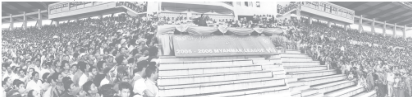
Soccer fans enjoy entertainment of vocalists to the accompaniment of Emperor Band before the ceremony to commence 2005-06 Myanmar League at Youth Training Centre in Thuwunna.

Mayor Brig-Gen Aung Thein Lin, the chairman of Central Work Committee for Myanmar Women's Affairs Federation and mem-