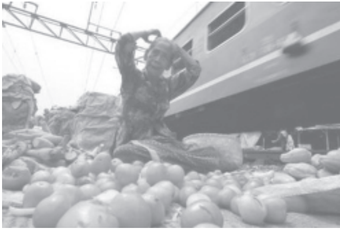
An Indonesian vegetables vendor sits next to the railway track as she waits for customers, in a slum area of the capital Jakarta on 3 August, 2005.