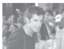
Real Madrid's Luis Figo of Portugal

The midfielder, viewed as Real's first Galactico signing, helped them to the league title in his first sea-