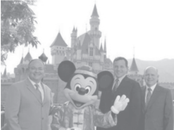
Disney executives join Mickey Mouse in front of Sleeping Beauty Castle at Hong Kong Disneyland Park in this 19 July, 2005 photo released on 4 August, 2005.