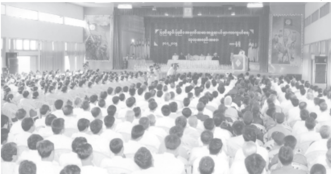
The mass meeting on guarding against the danger posed by internal and external destructionists through united strength in progress in Lashio.— MNA

Shan State (North) is home to Shan, Bamar, Palaung, Wa, Danu, Kokang and Kachin national races. Thanks to the endeavours of the Tatmadaw Government, danger of narcotic drugs in Shan State (North) faded out. At present, hill regions are witnessing opium-substitute crops, gardens and high yield paddy plantations.