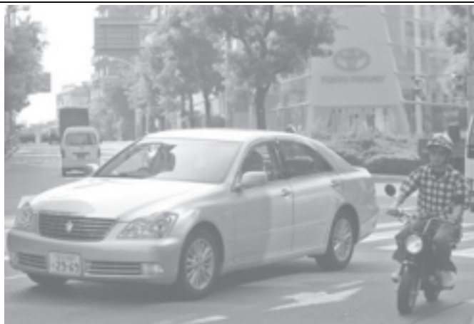
Toyota Motor Corp's luxury sedan Crown drives past a Toyota dealership in downtown Tokyo on 3 Aug, 2005.