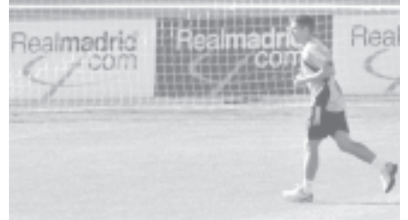
Real Madrid's English player Michael Owen runs alone during a training session in Madrid on 3 August, 2005.