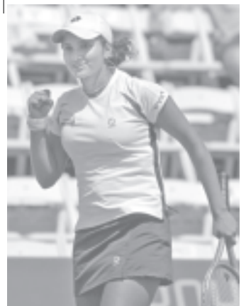
Sania Mirza of India pumps her fist after winning her second round match against Nadia Petrova of Russia at the Acura Classic held at the La Costa Resort and Spa in Carlsbad, Calif. on 3 August, 2005. Mirza won the match in straight sets 6-2, 6-1.

"A lot has happened since January," the 18-year-old added. "I started this season losing in the second round of qualifying of Tasmania. "I didn't expect so much to happen so soon, but I'm not complaining."