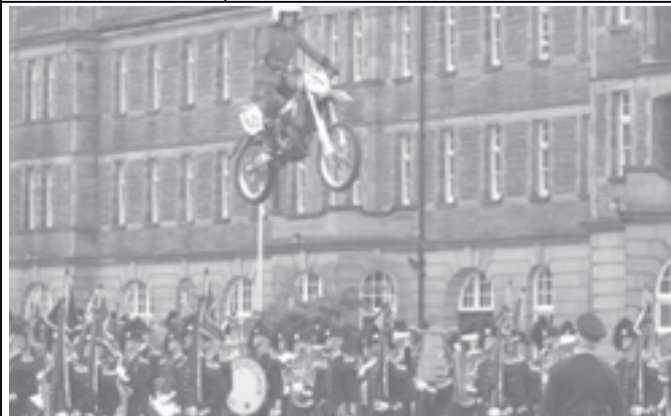
A member of the IMPS Motorcycle display team jumps over the Guard of His Majesty The King of Norway Band and Drill team during a rehearsal for the Edinburgh Military Tattoo at the Redford Barracks, Edinburgh, on 3 Aug, 2005. The IMPS is a non profit youth motorcycle display team, and is Britain's largest motorcycle display team.

Chinese Government took measures to crack down on the fake advertisements in recent years. More than 70,000 illegal medical treatment ads were investigated and punished by the State Administration for Industry and Commerce from 2001 to 2004.