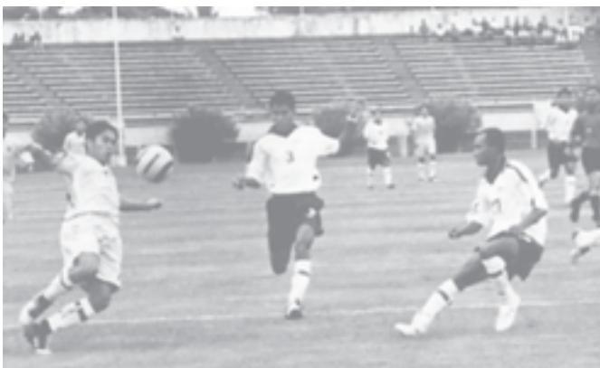
Commerce team playing against Finance & Revenue team in the special tune-up match.

Later, Minister Brig-Gen Thura Aye Myint awarded trophy and K 1 million to Finance and Revenue team.