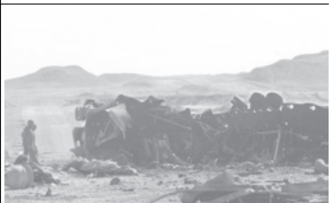
US Marines inspect the remains of a vehicle destroyed by a roadside bomb on Wednesday, killing 14 Marines and a civilian interpreter in Barwana, near Haditha, Iraq, on 4 Aug, 2005. This was the deadliest roadside bombing suffered by American forces in the Iraq war.