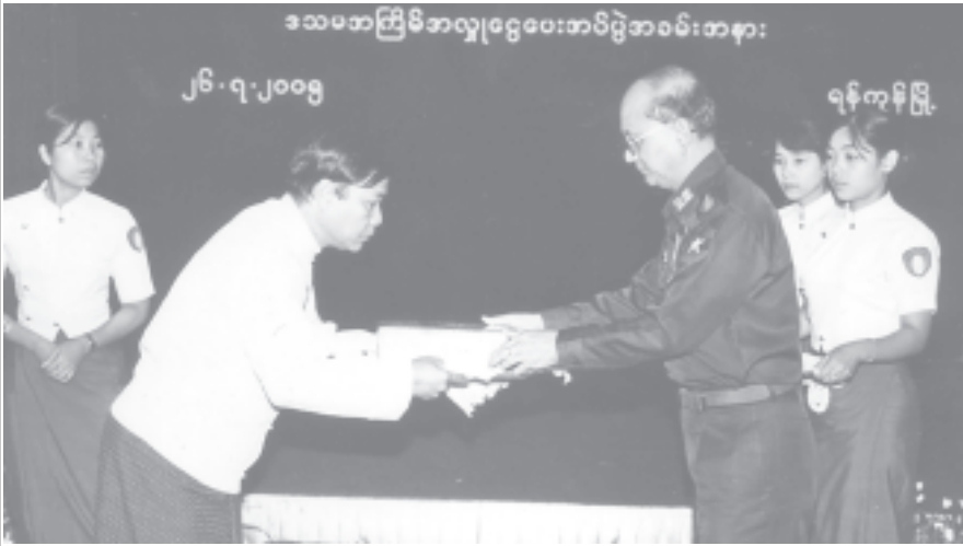
Secretary-1 Lt-Gen Thein Sein accepts cash K 250,000 donated by USDA Headquarters for supply of clean water in rural areas on 26 July 2005.

“See, the tube-well is producing water as usual again after the pipe has been cleaned. I can imagine the delight of the entire village as they were when the drilling of the tube-well started. You are so good at your work.”