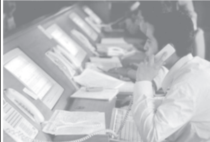
Indian brokers engage in trading at a brokerage firm in Mumbai on 3 August, 2005. Indian shares surged past the 7,800-mark for the first time on Wednesday.