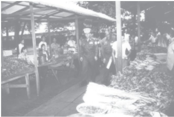
Yangon Commander Maj-Gen Myint Swe inspects producers' tax-free market in Kamayut Township.

The commander inspected the sales at shops of ministries, Yangon City Development Committee, Yangon Division Vegetables Cultivation and Livestock Breeding Special Zone, district and township PDCs, local registries and units, Union of Myanmar Economic Holdings Ltd, and companies in the tax-free markets in Mayangon, Yankin, Kamayut, Dagon