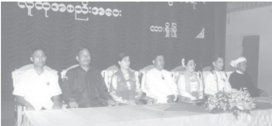
Members of the panel of chairmen seen at the mass meeting.