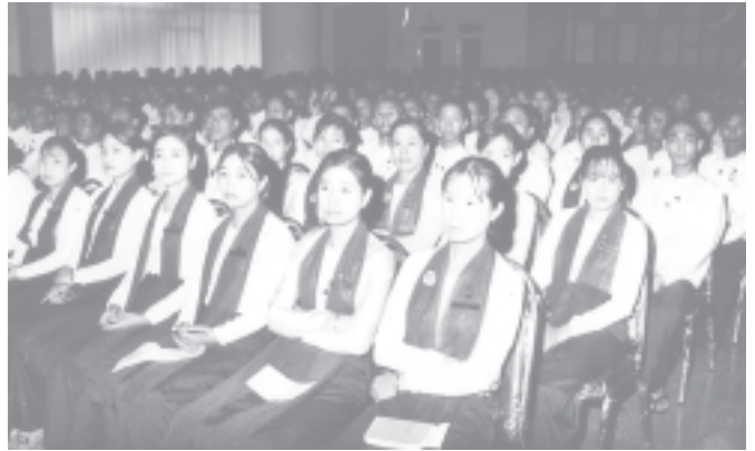
Representatives of the mass meeting.

ger posed by destructionists through unity of people. (The discussion is reported separately.)