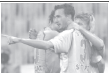
VfB Stuttgart's Martin Stranzl celebrates his goal with team mates during a German soccer League Cup semi-final against Bayern Munich in Munich on 26 July, 2005. Stuttgart won the match 2-1.