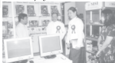
Vice-Chairman of e-National Task Force U Aung Myint views booth of Smart Computer Technology (MSI).