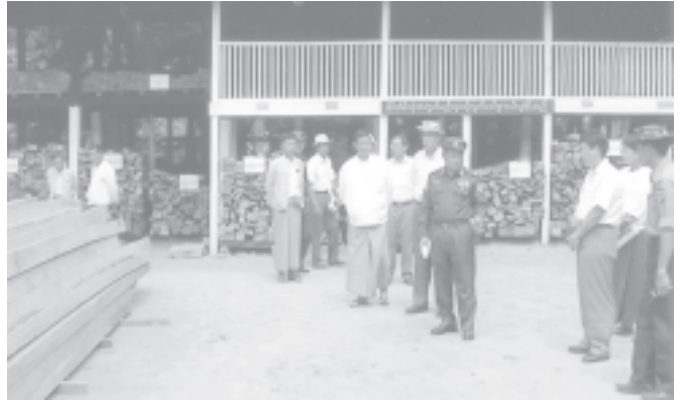
Minister Brig-Gen Thein Aung inspects sales of timber in Kyaukse Township.

In the afternoon, the minister and party arrived at the pencil factory of Myanmar Tokiwa Corporation Ltd, and Myanmar-Maykaung Wood-Based Factory in Mandalay Industrial Zone. At the factories, the minister viewed