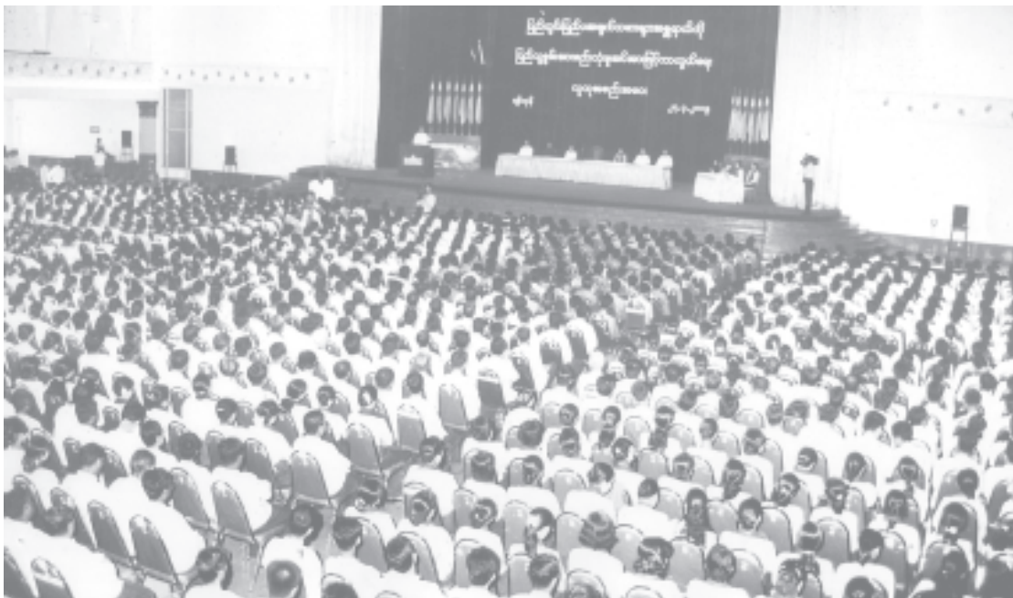
The mass meeting to guard against danger of internal and external destructionists through united strength at MCC in Mayangon Township.