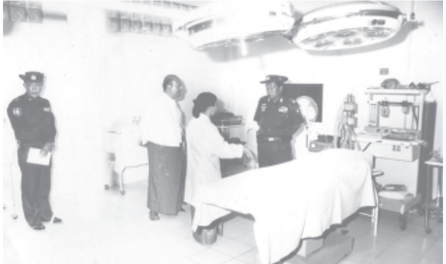
Lt-Gen Ye Myint inspects operation theatre at NyaungU District Hospital.

Later, they went to NyaungU District People's Hospital and inspected intensive care unit, operation