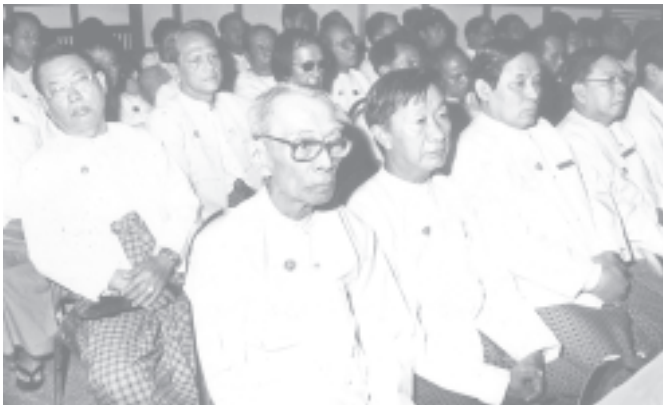
Participants of the mass meeting.—MNA

The mass meeting successfully ended at 10.20 am with chanting the slogans. —MNA