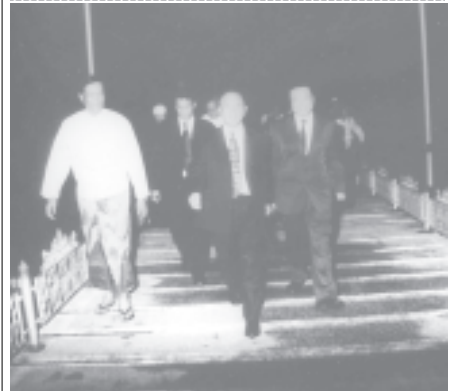
Chinese delegation being welcomed by officials at Yangon International Airport.

YANGON, 27 July — At the invitation of Minister for Foreign Affairs of the Union of Myanmar U Nyan Win, Foreign Minister of the People's Republic of China Mr Li Zhaoxing and delegation arrived at Yangon International Airport by special flight this evening on an official visit to the Union of Myanmar.