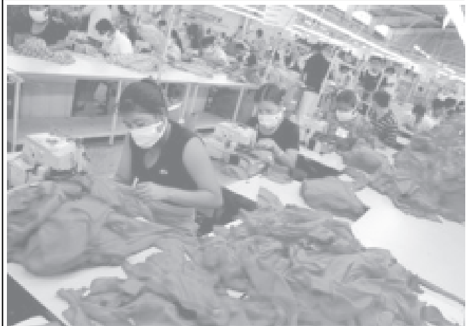
Women assemble T-shirts in an apparel factory in Guatemala City, on 25 July, 2005.