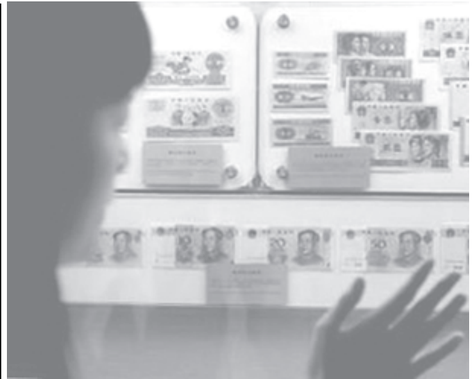
A Chinese museum guide explains different sets of yuan notes for visitors at the Shanghai Bank Museum on 22 July, 2005.

In some special areas in the zone like the non-tariff area, goods and services imported from foreign countries or exported to them are exempted from import-export taxes, value-added taxes and special consumption taxes. Investors just need to have 30 per cent of their project’s capital, and can borrow the rest from local banks.—MNA/Xinhua