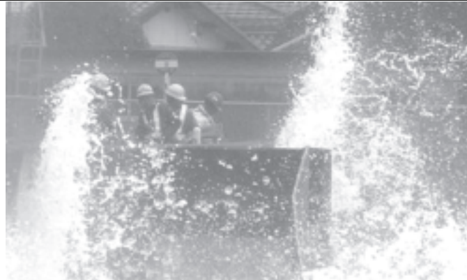
High waves batter a breakwater in Kushimoto, western Japan, as a powerful tropical storm approaches Japan on 26 July, 2005.