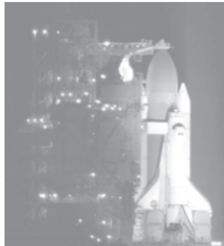
Space Shuttle Discovery is seen on Launch Pad B at Kennedy Space Center, Fla., early on 26 July, 2005. Discovery and a crew of seven were set to blast off for the international space station on Tuesday morning.