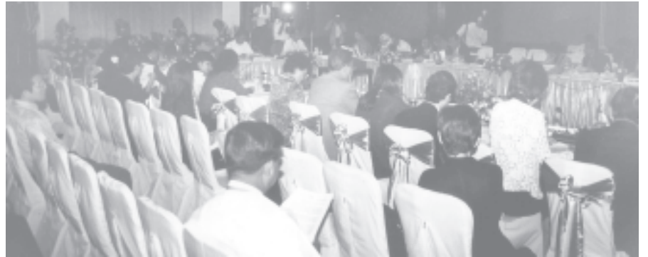
The 26th Special Senior Officials Meeting of ASEAN Ministers for Agriculture and Forestry in progress.

YANGON, 27 July— The 26th Special Senior Officials Meeting of ASEAN Ministers for Agriculture and Forestry hosted by Myanmar took place for the second day today at Sedona Hotel in Mandalay.