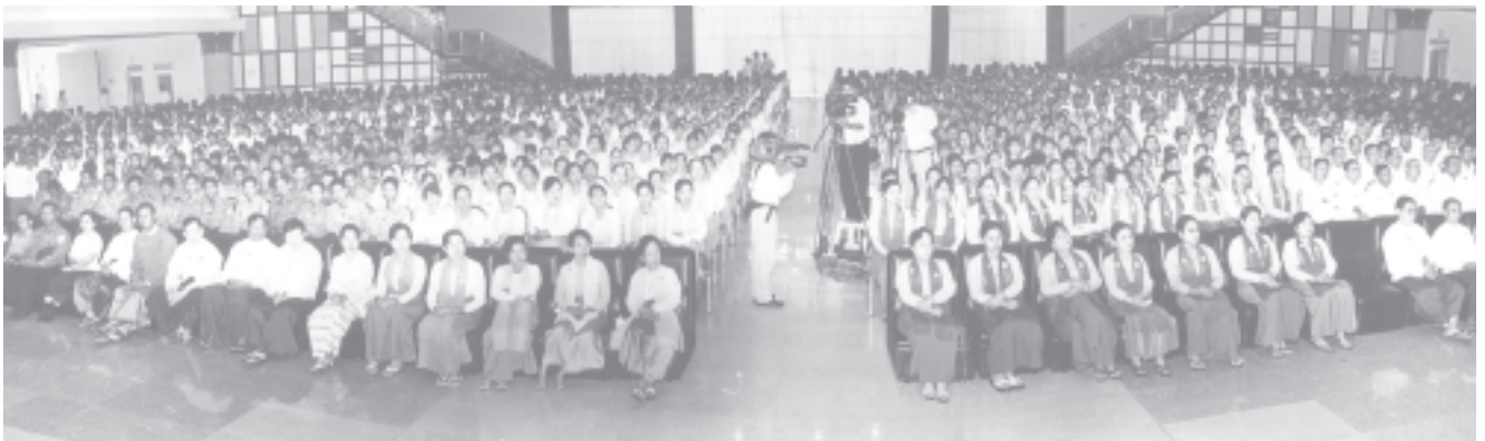
Representatives attending the mass meeting to guard against danger posed by internal and external destructionists through united strength of the people.—MNA