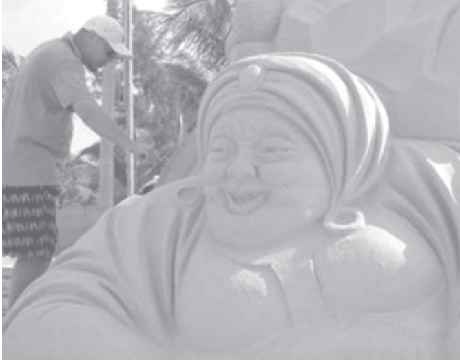
A Chinese sand sculptor works on a figure at a beach park in Beihai in south China's Guangxi Zhuang Autonomous Region on 26 July, 2005.