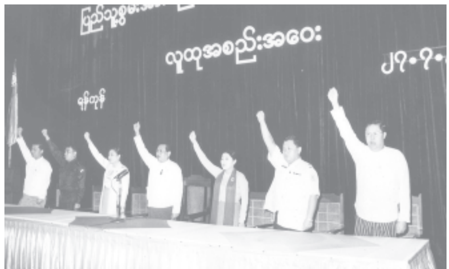
Members of the panel of chairmen and the participants chanting slogans at the conclusion of the mass meeting.

Present on the occasion were members of the Union Solidarity and Development Association, Myanmar Women’s Affairs Federation, Myanmar Maternal and Child Welfare Association, Myanmar War Veterans Organization, Myanmar Fire Brigade, Myanmar Red Cross Society, Myanmar Nurses Association, Myanmar Anti-narcotics Association, Myanmar Writers and Journalists Association, Myanmar Music Asiayon, Myanmar Motion Picture Asiayon, Myanmar Thabin Asiayon, Myanmar Traditional Artists (See page 16)