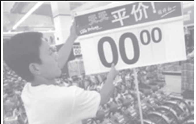
A worker prepares a to-be-fixed price board at pre-opening media day event at Wal-Mart store on Monday, in Shanghai, China. The world's largest retailer, Wal-Mart, will open its first store in Shanghai on 28 July.

Both delegations acknowledged deep historical, cultural and political relations between the two countries and hoped that the current momentum in translating excellent political relations into commercial and economic interaction would further cement the existing bilateral relations.