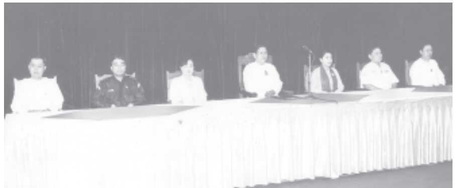
The meeting chairman seen together with members of the panel of chairmen at the mass meeting.