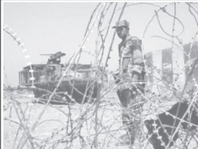
An Iraqi soldier stands behind razor wire at a checkpoint in Mosul, in northern Iraq on 25 July, 2005.

Recent media reports in India had said recruitment camps were held in Punjab to hire drivers purportedly for Iraq and the agency involved in the hiring said it had the full documents in place and the necessary emigration clearance from Cochin in Kerala. It was not clear if the company was hiring drivers to carry goods from Kuwait to Iraq.