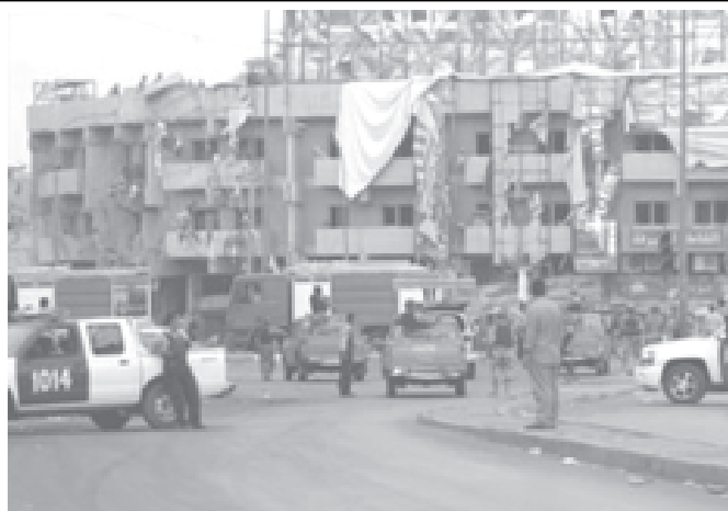
Iraqi police, soldiers and emergency rescue teams gather at the site of a suicide bombing attack on a checkpoint leading to a hotel, not seen in photo, in Baghdad, Iraq, on 25 July, 2005. — INTERNET

The AP count is four lower than the Defence Department's tally, last updated at 10 am EDT on Tuesday. The British military has reported 92 deaths; Italy, 25; Ukraine, 18; Poland, 17; Bulgaria, 13; Spain, 11; Slovakia, three; Estonia, Thailand and the Netherlands, two each; and Denmark, El Salvador, Hungary, Kazakhstan and Latvia one death each. —Internet