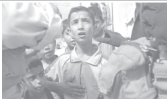
An Iraqi boy (C) asks US soldiers, of the army infantry from the Stryker brigade, about his missing cousin who according to the boy, was arrested by US troops in Mosul, in northern Iraq on 25 July, 2005.