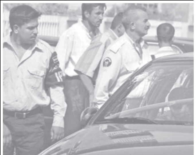
An Iraqi policeman looks at a body in a car after gunmen killed three men in Baghdad on 19 July, 2005.