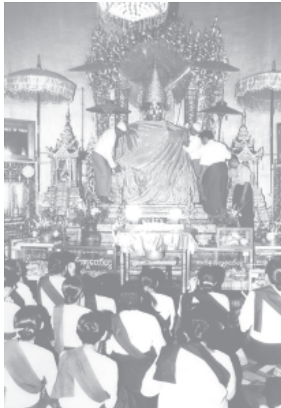
Members of the pagoda board of trustees offering