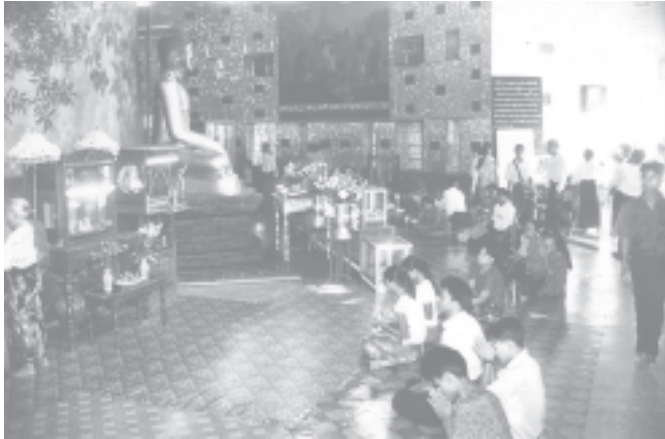
Pilgrims pay homage to Buddha Image at Thrimingalar Kaba Aye Pagoda on Fullmoon Day of Waso (Dhammaçakka Day) (20-7-2005).

Shwenaban, South Okkalapa MyoU Zedi, Dagon MyoU Zedi and other pagodas and stupas, monasteries and religious buildings, and devotees, pilgrims and wellwishers attended the ceremonies.