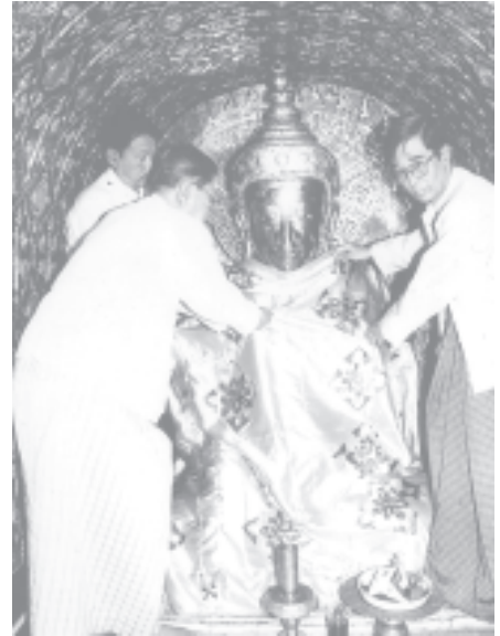
The Shwekyar Thingan offering ceremony in progress at a Buddha Image of Shwedagon Pagoda.— MNA

Later, wellwishers donated Waso robes and alms to the Sayadaws. — MNA