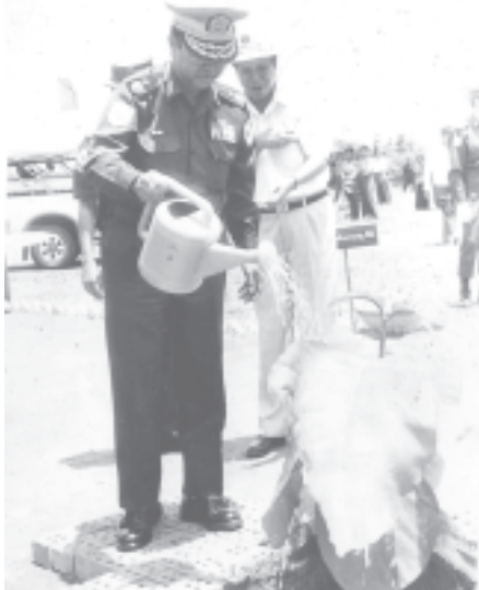
Commander Maj-Gen Myint Swe plants a sapling at the ceremony.

During the ceremony, Chairman of Yangon Division Peace and Development Council Commander of Yangon Command Maj-Gen Myint Swe planted a