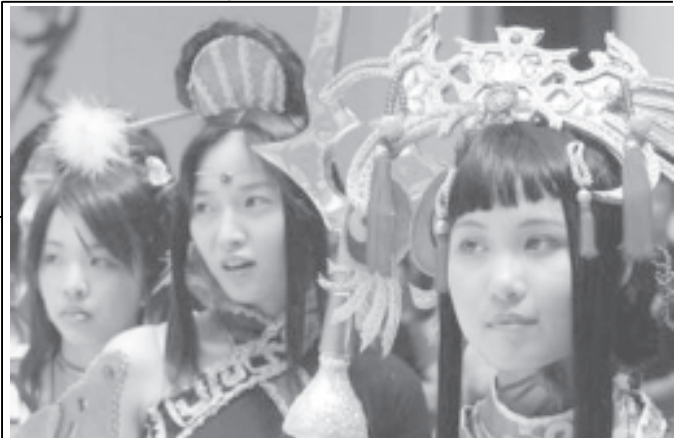
Cosplayers dressed as characters from the Japanese comic ‘The Twelve Kingdoms’ (R) and the Japanese online game ‘Shin Sangohumushou 4’ (C) pose during a cosplay contest at a shopping mall in Hong Kong on 19 July, 2005.

The air models, most of which are modeled on US and Japanese airplanes popular during World War II, will be locked in 86 fierce fights in the air 60 metres to 120 metres above ground, according to the paper. — MNA/Xinhua