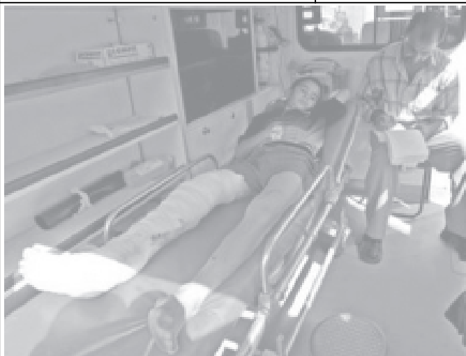
An injured boy rests in an ambulance after being turned away from Yarmouk Hospital after doctors went on strike over claimed abuses in Baghdad on 19 July, 2005.