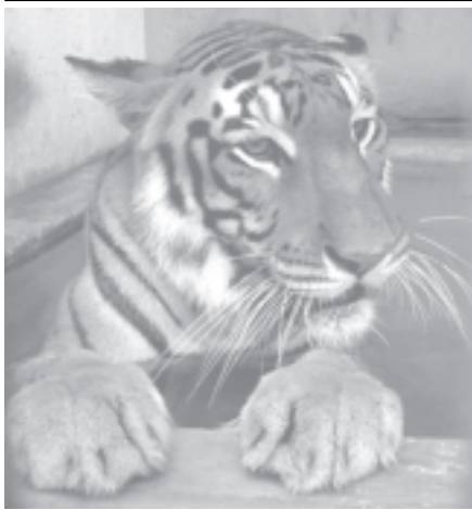
India's tiger and freshwater dolphin populations are rapidly dwindling as poachers kill the endangered species to feed a lucrative trade in traditional medicines, newspaper reports said.—INTERNET

They also include the incorporation of wine tourism into the African cultural experience and the continual creation of sustainable jobs in the wine industry. — MNA/Xinhua