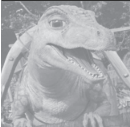
Lucky the Dinosaur is seen in Lake Buena Vista, Florida on 19 July, 2005. Lucky, the latest innovation in Disney Audio-Animatronics design will be transported to the Hong Kong Disneyland in China where he will be an opening day cast member when the theme park opens on 12 September, 2005.