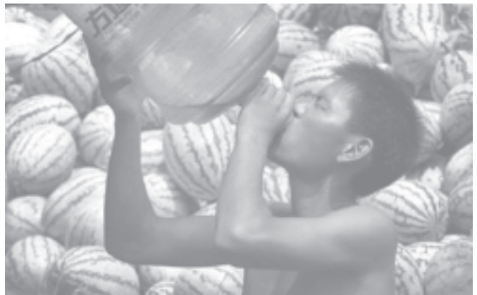
A study spanning 14 cities across Asia has found the highest incidence of colorectal cancer among ethnic Chinese, a trend which researchers in Hong Kong on Monday blamed on a more Westernized diet. A vendor seen drinking water at a wholesale market in Nanjing, east China's Jiangsu Province, in this 4 July, 2005 file photo.