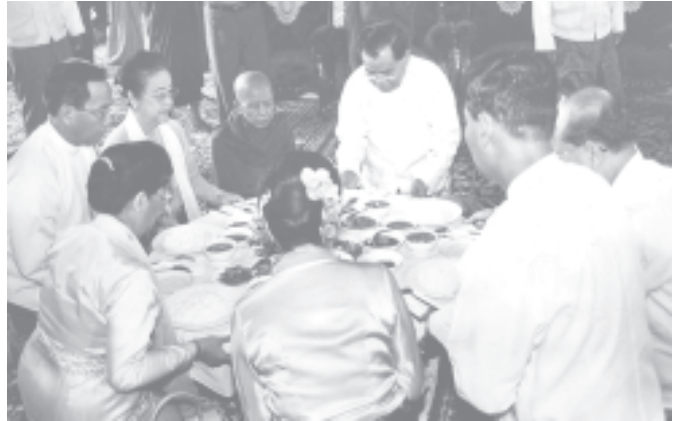
Senior General Than Shwe and wife Daw Kyaing Kyaing and party donate "soon" to members of the Sangha.