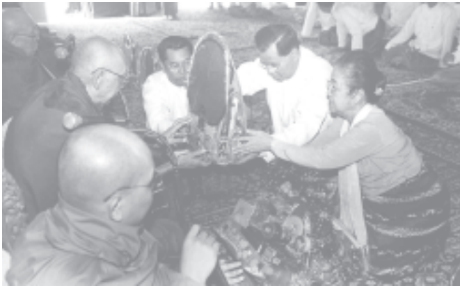
Senior General Than Shwe and wife Daw Kyaing Kyaing offer Waso robes to Chairman of State Sangha Maha Nayaka Committee the Magway Sayadaw.