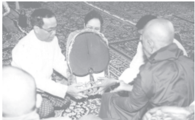
Prime Minister General Soe Win and wife Daw Than Than Nwe offer Waso robes to a Sayadaw.