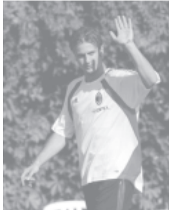
Newly signed forward Alberto Gilardino waves to fans prior to a training session at the AC Milan training facility in Carnago, near Milan, Italy, on Tuesday, 19 July, 2005. The Italian centre forward was transferred from Parma to AC Milan, the Milanese team announced on Monday.

an interest in Gilardino, who is widely expected to spearhead Italy's attack at the World Cup if they qualify for the 2006 finals in Germany.