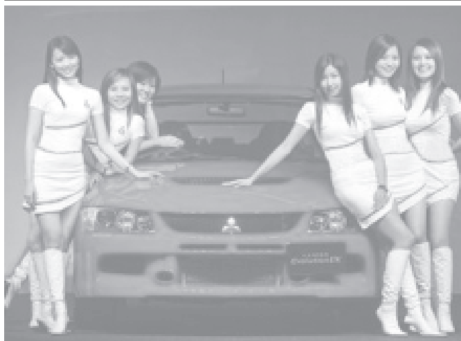
Models pose with a Mitsubishi Lancer Evolution IX during the official launch of Mitsubishi cars in Kuala Lumpur on 18 July, 2005.

It is Barroso's first visit to China as president of the EU Commission. Hong Kong is the last stop of his five-day official visit. He had visited Beijing, Shanghai and Macao before his arrival in Hong Kong.