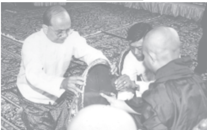
Secretary-1 Lt-Gen Thein Sein presenting Waso robes to a Sayadaw.