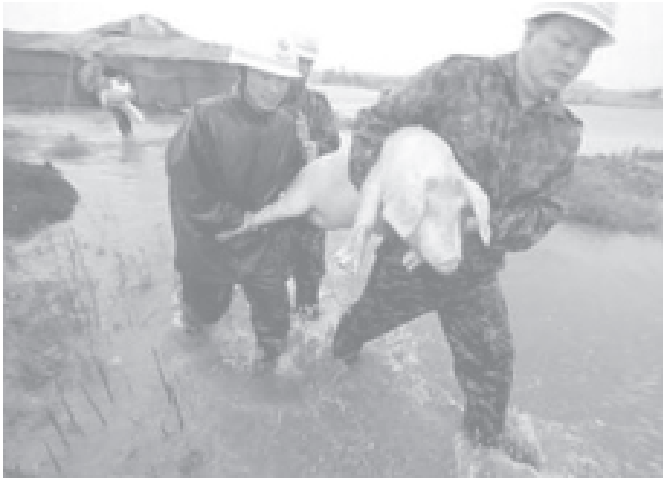
Chinese men rescue a pig trapped on his pig farm which was flooded by Typhoon Haitang in Cangnan County in east China's Zhejiang Province on 19 July, 2005.