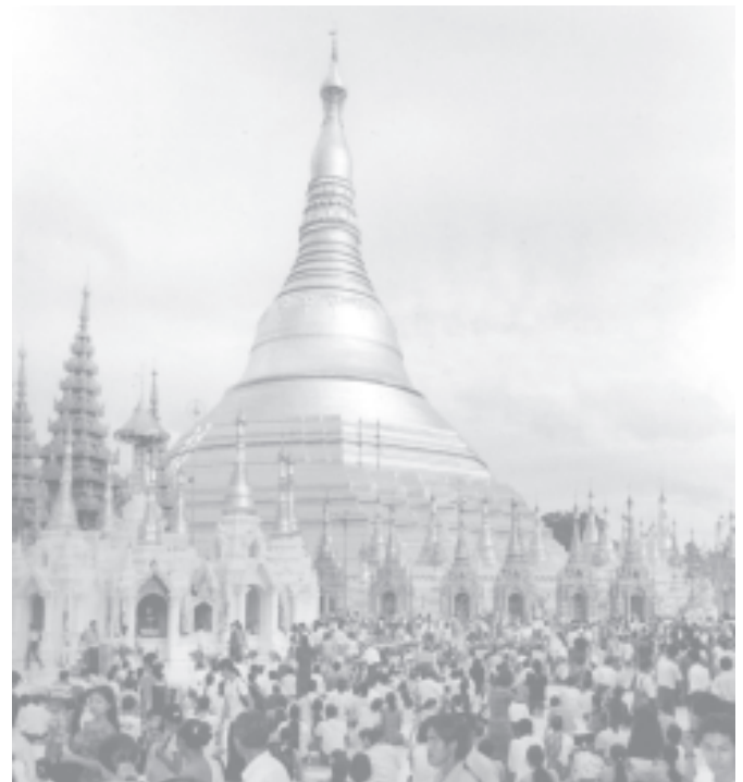
The precinct of Shwedagon Pagoda is teeming with pilgrims on Fullmoon Day of Waso (20-7-2005).