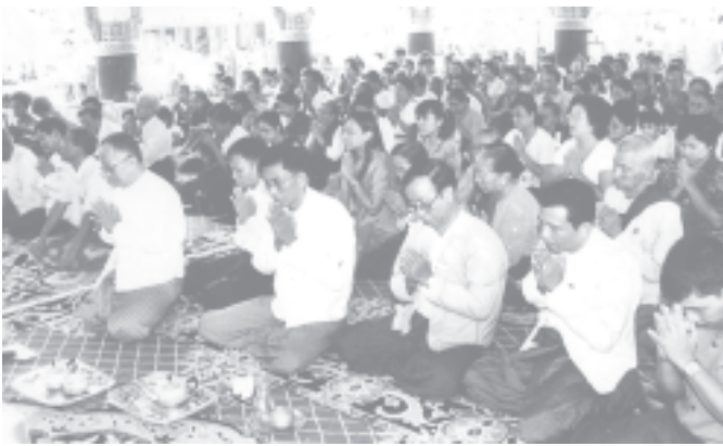
Those present receiving the Nine Precepts from the Sayadaw.

YANGON, 20 July — The 48th Waso robes offering ceremony organized by Shwephonepwin Pagoda Board of Trustees was held this afternoon at the pagoda in Pazundaung Township.