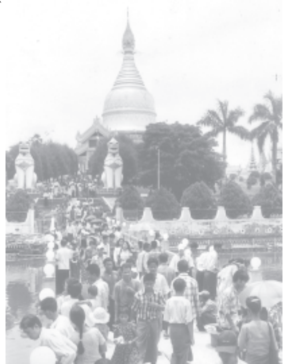
Pilgrims seen at Maha Wizaya Pagoda on Fullmoon Day of Waso (Dhammaçakka) (20-7-2005).