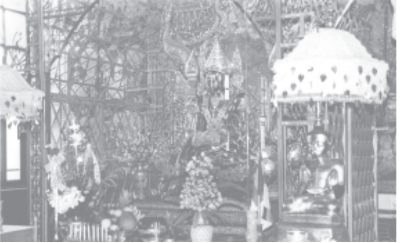
Senior General Than Shwe and wife Daw Kyaing Kyaing offer lights to the Buddha image kept in Pylonchantha Maha Ordination Hall.