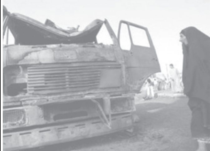
A woman looks at a destroyed truck after a suicide bomber killed at least 60 people in the small highway town of Musayyib, 60 kms (40 miles) south of Baghdad, on 17 July, 2005. — INTERNET

The festival will take place in Dalian from 28 July to 8 August. — MNA/Xinhua