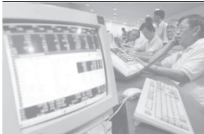
Filipino public investors monitor their shares inside the Philippine Stock Exchange in Manila's Makati financial district on 18 July, 2005.

Beijing has recorded a monthly double-digit growth in the number of visiting overseas tourists for six consecutive months, receiving approximately 280,000 visitors monthly.