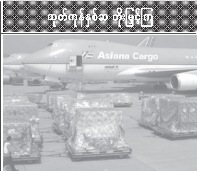
Asiana Airlines' cargo planes are parked at a cargo terminal in Incheon, west of Seoul, on 18 July, 2005.