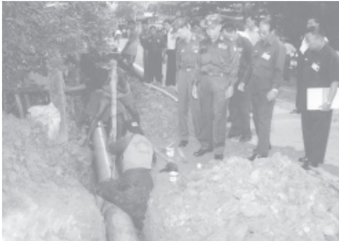
Mayor Brig-Gen Aung Thein Linn inspects pipe connection on Nantha Street in Thingangyun township.

YANGON, 18 July — Chairman of Yangon City Development Committee Mayor Brig-Gen Aung Thein Linn this morning inspected the water supply tasks being carried out by the YCDC in Thingangyun and Thaketa townships to supply water to the garbage power plants in Thaketa and Ahlon townships of Myanmar Electric Power Enterprise. Mayor Brig-Gen Aung Thein Linn and officials concerned inspected the laying of 12-inch pipes in Thingangyun and Thaketa townships being carried out by YCDC.