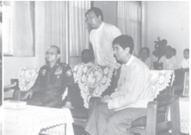
Chairman of National Health Committee Secretary-1 Lt-Gen Thein Sein observes renal transplant at the New General Hospital. —MNA

YANGON, 18 July — Chairman of National Health Committee Secretary-1 of the State Peace and Development Council Lt-Gen Thein Sein observed the 11th renal transplant at the New General Hospital here today.