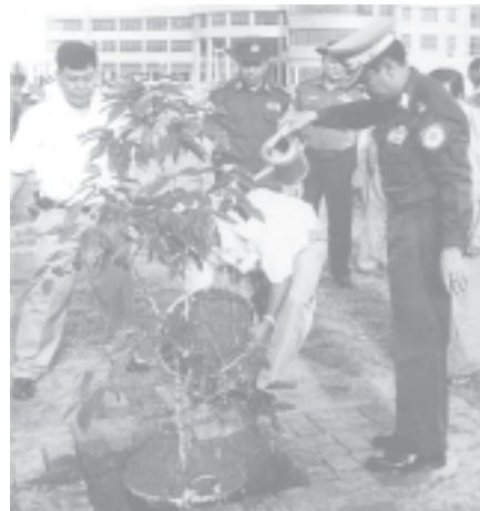
Commander Maj-Gen Myint Swe watering a plant at Yangon South District's tree planting ceremony for 2005 held in Thanlyin.