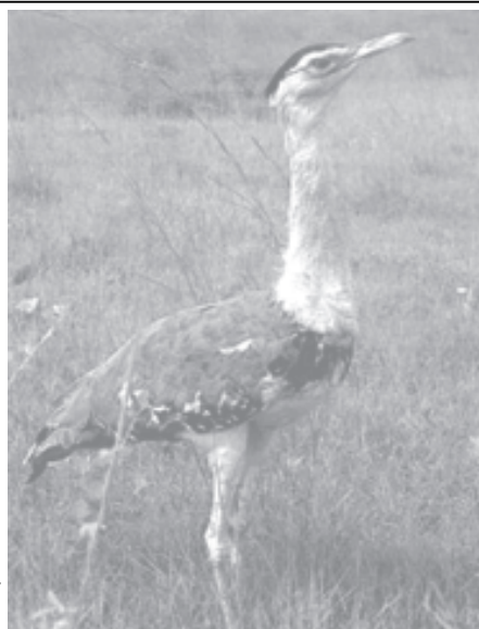
In this undated photo released by the Mumbai Natural History Society shows a Great Indian Bustard whose number is estimated by the International Union for Conservation of Nature at 500 in India — INTERNET

Diplomats from an EU troika of Britain, France and Germany have been seeking a compromise, asking that Iran surrender its fuel-making programme in return for economic incentives. They have until late July or early August to present Iran with a final set of proposals to resolve the deadlock. — MNA/Xinhua