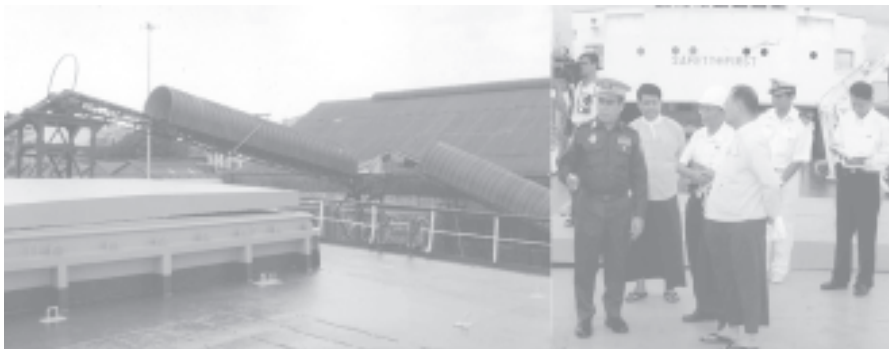
Transport Minister Maj-Gen Thein Swe inspects a belt conveyor which is loading cargo onto Shweli Vessel at No 1 Sule Wharf.

MPA General Manager U Cho Than Maung explained the functions of the conveyor with the help of charts.