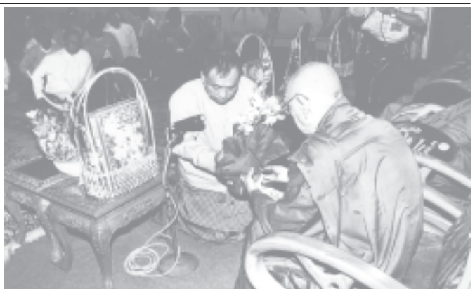
Minister for Culture Maj-Gen Kyi Aung presents Waso robes to a Sayadaw at the Ministry's Waso robes offering ceremony.