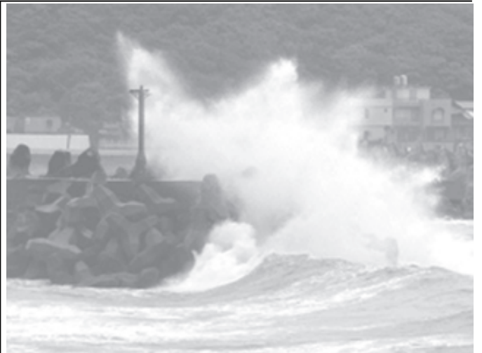
Water whipped up by Typhoon Haitang hits the shore of Taiwan's northern coast near Keelung on 18 July, 2005.

The BALCO scandal has badly damaged the reputations of top track and field stars such as Marion Jones and former 100-metre world record holder Tim Montgomery. More than a dozen elite stars have been suspended since the US Anti-Doping Agency in 2003 identified BALCO as the source of a previously undetectable steroid. — MNA/Xinhua