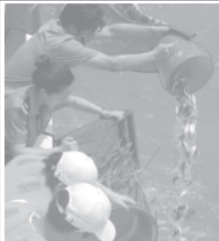
Chinese volunteers release fish fries into the East China Sea on a ship in Zhoushan, east China's Zhejiang Province, on 17 July, 2005. More than 200,000 fries, including yellow-fin tunas, Japanese prawns, jelly fishes and aculephs were released by 40 volunteers from Shanghai.