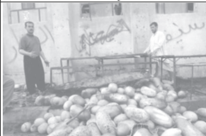
Vegetable vendors pick up their melons after a suicide bomber killed at least 60 people near a vegetable market in the small highway town of Musayyib, 60 kms (40 miles) south of Baghdad, on 17 July, 2005.