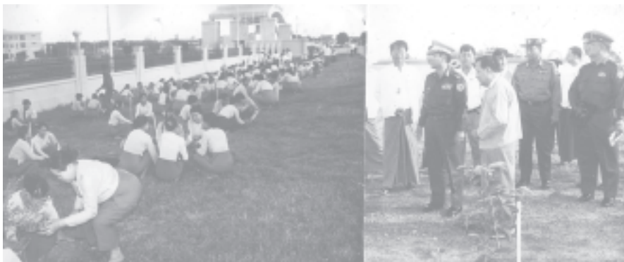
Maj-Gen Myint Swe and officials view the tree planting ceremony in Thanlyin, Yangon South District.

YANGON, 18 July — Tree planting ceremony for 2005 of Yangon South District was held this morning in Thanlyin Township.