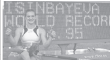
Russian pole vaulter Yelena Isinbayeva celebrates after setting a new women's pole vault world record at the IAAF Super Grand Prix athletics meet in Madrid, on 16 July, 2005. Isinbayeva cleared 4.95 metres to break her own previous record of 4.93 metres set in Lausanne, Switzerland, on 5 July, 2005.