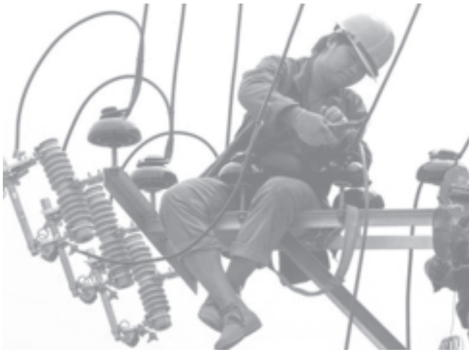
A Chinese power line worker perched on a electricity pole as he performs maintenance work in Beijing, China, on 18 July, 2005.