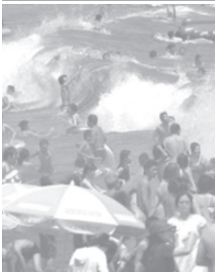
Bathers play with waves at the Katase Beach in Fujisawa, southwest of Tokyo, on 18 July, 2005, Marine Day national holiday, as the temperature soared to 33 degrees Celsius (91.4 degrees Fahrenheit) in Tokyo.

"What this visit would be doing is reaffirming at the highest level the transformation that is taking place in India-US relations," Indian Foreign Secretary Shyam Saran said. "What we are really looking at is a genuine partnership between India and the US."—MNA/Reuters