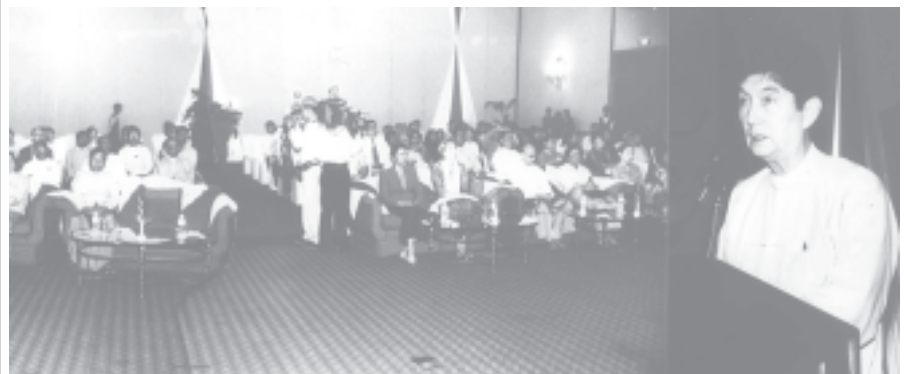
Minister Dr Kyaw Myint makes an address at the Third Intercountry Training of Trainers on HIV/AIDS Voluntary Counselling and Confidential Testing.

YANGON, 18 July—The Third Intercountry Training of Trainers on HIV/AIDS Voluntary Counselling and Confidential Testing was opened at a ceremony at Sedona Hotel on Kaba Aye Pagoda Road here this morning with an address by Minister for Health Dr Kyaw Myint.