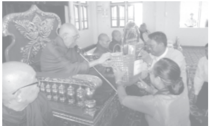
Minister for Industry-1 U Aung Thaung and wife offer Waso robes to a Sayadaw at the Ministry's Waso robes offering ceremony.

YANGON, 18 July — Families of the Ministry of Industry-1 offered Waso robes at Tipitaka Maha Gandawin Nikaya Monastery in Dagon Myothit (East) Township this afternoon.