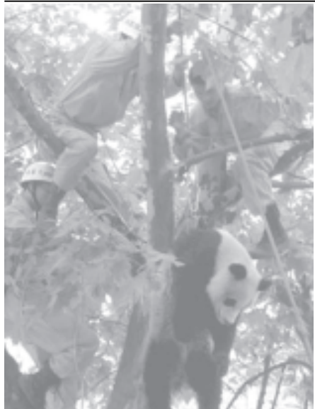
Chinese firemen secure a giant panda trapped in a tree with a rope in Duijiangyan City in southwestern China's Sichuan Province recently.