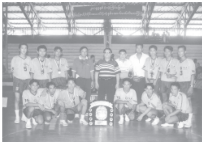
Shan State (South) volleyball team poses for a photo after winning the Championship in the 11th Inter State and Division Volleyball Tournament.