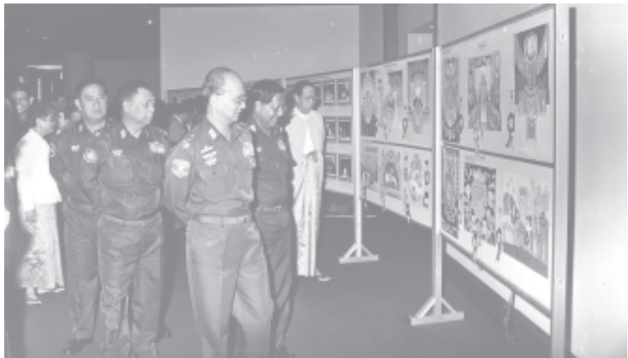
Secretary-1 Lt-Gen Thein Sein views documentary photos and prize winning works at World Population Day commemorative ceremony.

In addition to the Government's efforts, a nation-wide NGO, Myanmar Maternal and Child Welfare Association (MMCWA) is actively engaged in providing quality reproductive health counseling and services, giving advocacy talks and holding meetings and seminars on reproductive health, adolescent reproductive health, and sexually transmitted diseases such as AIDS.