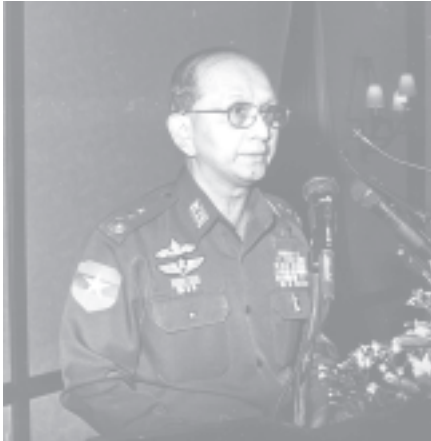
Secretary-1 Lt-Gen Thein Sein addresses the ceremony to commemorate World Population Day 2005.—MNA

YANGON, 15 July —The ceremony to mark the World Population Day took place at Sedona Hotel