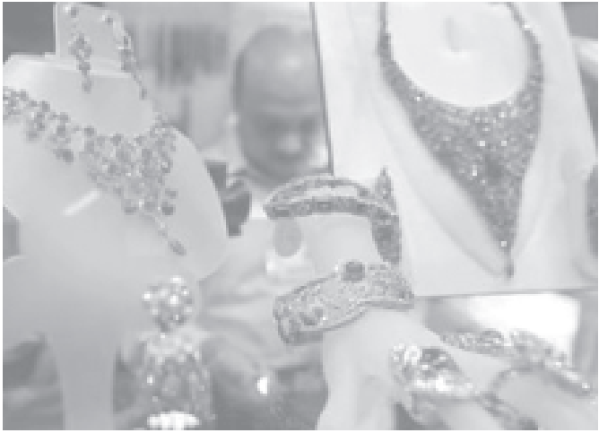
An Indian shopkeeper arranges diamond jewellery in his stall at the India International Jewellery Show, in Mumbai on 14 July, 2005. India is the world's top diamond cutting and polishing center, with 11 out of every 12 diamonds in jewellery worldwide are processed in the country.