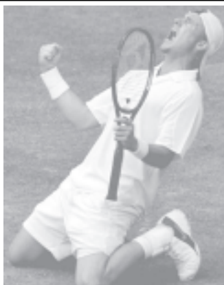
Australia's Davis Cup player Lleyton Hewitt celebrates winning his match against Argentina's Guillermo Coria during their Davis Cup quarter-final singles match in Sydney on 15 July, 2005.