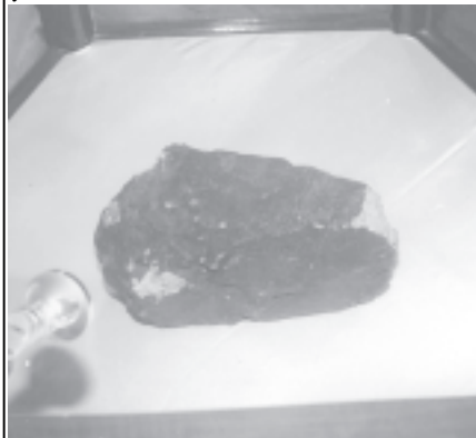
Meteorite displayed at the Natural History Museum.

Pieces of meteorites hit the earth's surface near Yondaw and Myinsu villages and Malonkham Yeyintkan Taik Tesu in the township on 21 June this year.