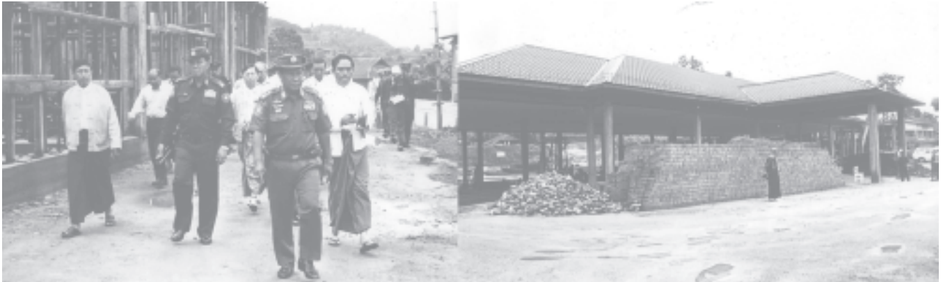
Lt-Gen Ye Myint inspects construction of 100-bed hospital in Mogok.

YANGON, 15 July — Member of the State Peace and Development Council Lt-Gen Ye Myint of the Ministry of Defence, accompanied by Chairman of Mandalay Division Peace and Development Council Commander of Central Command Maj-Gen Khin Zaw, Minister for Forestry Brig-Gen Thein Aung,