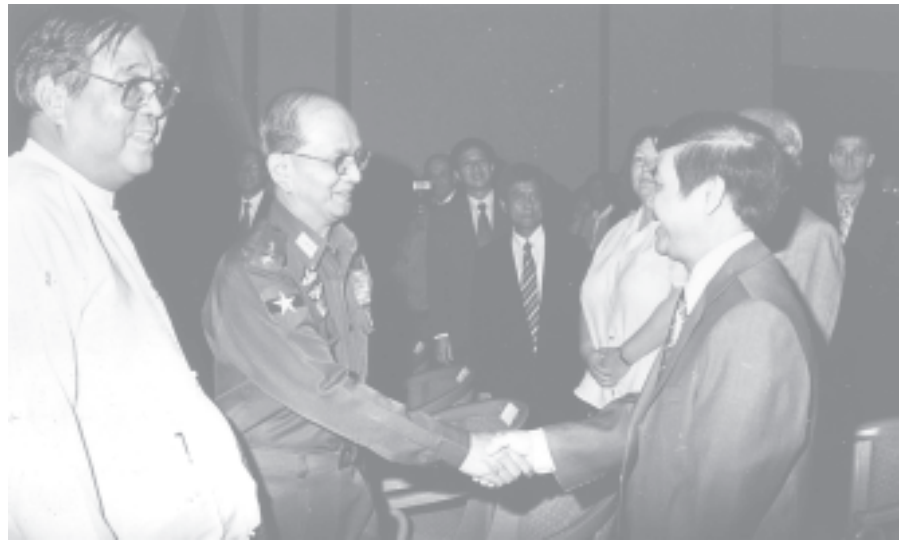
Secretary-1 Lt-Gen Thein Sein greets diplomats at the ceremony to mark World Population Day.— MNA