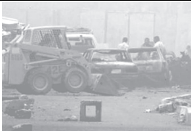
Workmen remove destroyed vehicles from the scene of a suicide bomb attack in Baghdad on 14 July, 2005.