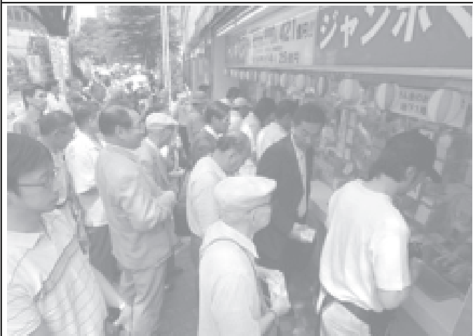
Hundreds of people line up at the most famous Sukiya-bashi Lottery Counter, downtown Tokyo on Friday morning, 15 July, 2005 as the top prize 200,000,000 yen (US $ 1.78 million) lottery ticket started to sell nationwide.