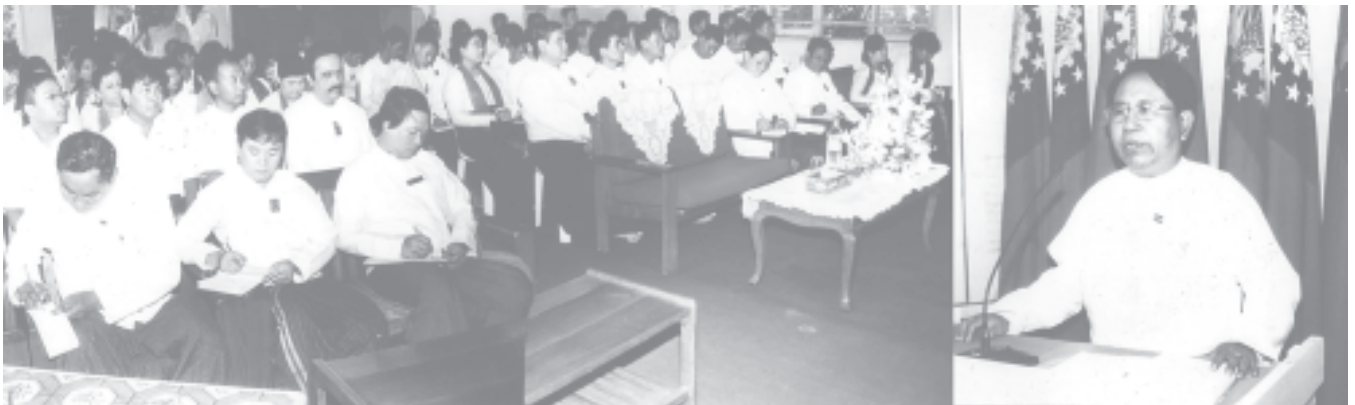
Secretariat Member Minister for Information Brig-Gen Kyaw Hsan speaking at the opening ceremony of Basic Organizational Course No 23 of Mingala Taungnyunt Township USDA.— MNA