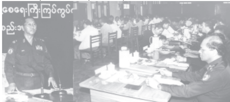
Commander Maj-Gen Myint Swe speaks at the meeting of Yangon Division Supervisory Committee for Ensuring Smooth and Secure Transport.