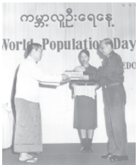
Secretary-1 Lt-Gen Thein Sein presents second prize to U Myint Thein (Physics) in poster contest.

A new phase for Myanmar women was ushered in with the formation of Myanmar Women's Affairs Federation (MWF) in December 2003. Groupings at different levels have been formed up to the grassroots level of wards and village-tracts.