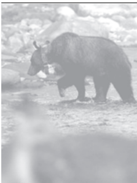
A brown bear walks across a river by a herd of deer in the Shiretoko Peninsula in the Japanese northernmost prefecture, or state recently. — INTERNET

The ministry had ordered a halt to the construction work on the interchange immediately after eight girders of the flyover collapsed and tumbled down on the New Klang Valley Expressway (NKVE) last Sunday, about 25 kilometres southwest of Kuala Lumpur, Nordin said. — MNA/Xinhua