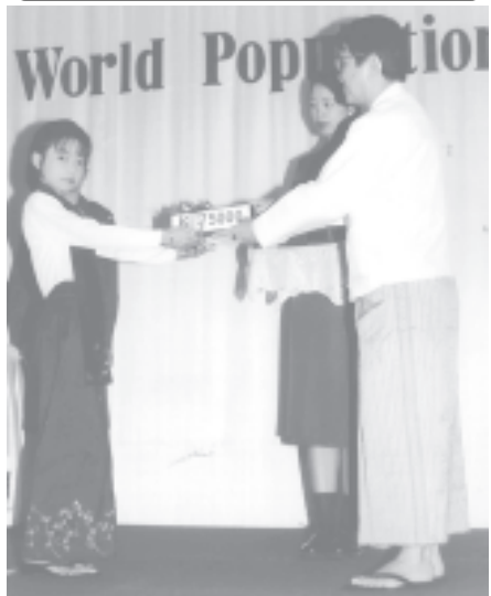
Deputy Minister U Maung Aung gives second prize to Ma Aye Myat Thu of Latha BEHS No 2 in poster contest.

Women are the backbones of families, caregivers of young and old, steward of natural resources and pillars of community life. They can and must play a powerful role in reducing poverty and fostering development. Inequality between women and men limits the potential of individuals, families, communities and nations. Inequality harms women's health and prevents many women from participating fully in the movement of human society.