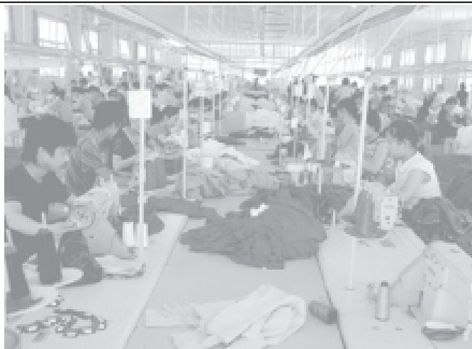
Workers at the Wuhu cotton thread factory, in Wuhu, central China's Anhui Province on 15 July, 2005.