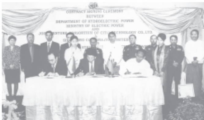
The contract signing ceremony for Yeywa Hydel Power Project in progress.

In addition, the plant will connect with Mandalay Sub-Power Station to supply power to Upper Myanmar through 230 kv power line. — MNA