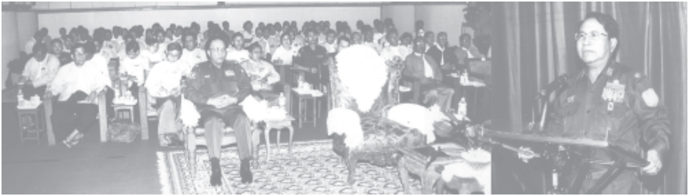
Minister for Information Brig-Gen Kyaw Hsan addresses concluding ceremony of film production and projection refresher course.

YANGON, 15 July — Myanma Motion Picture Enterprise of the Ministry of Information concluded its film production and projection refresher course No 1/2005 today at MMPE branch here.