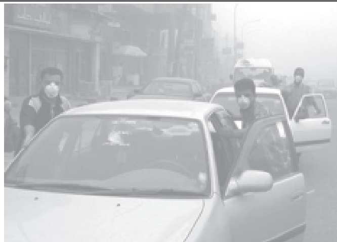
Iraqis push their cars in a line for gasoline while wearing masks to cover their faces in a sandstorm in downtown Baghdad, Iraq on 14 July, 2005.