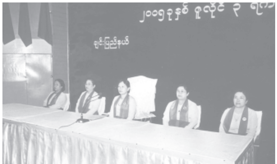
Members of Panel of Chairpersons seen at the ceremony to mark Myanmar Women’s Day in Haka.—MNA