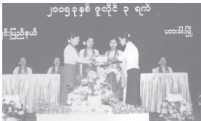
An outstanding woman being presented a gift.