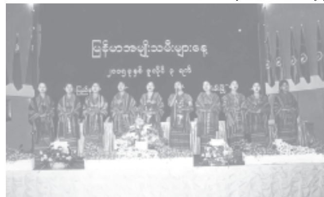
Chin national damsels singing in chorus the song entitled "Efficiency of Myanmar Women" to open the ceremony to mark Myanmar Women's Day.—MNA

Chin State Women's Affairs Organization, said that regarding the health