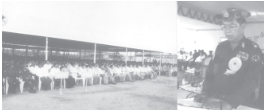
Commander Maj-Gen Tha Aye delivers an opening address at inauguration ceremony of Pauk Bridge (Yepya). — CONSTRUCTION

At the auspicious time, the commander, the minister and Col Phone Maw Shwe formally opened the bridge. Then they posed for a documentary photo together with those present. Later, the commander, the minister and party walked along the bridge and inspected it. — MNA