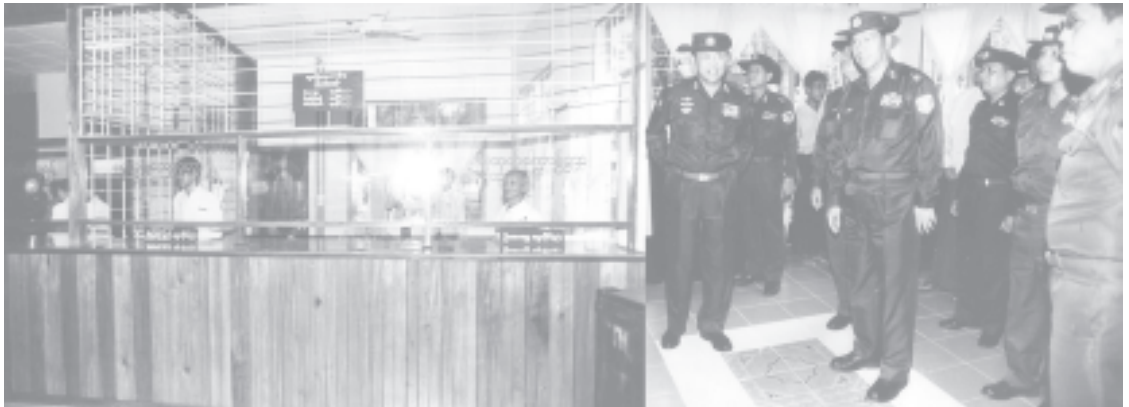
Lt-Gen Khin Maung Than and party inspect the new MEB branch building in Gwa. — MNA

Speaking on the occasion, Commander Maj-Gen Khin Maung Myint said that placing Our Three Main National Causes in the fore, the government has been implementing the 24-de-