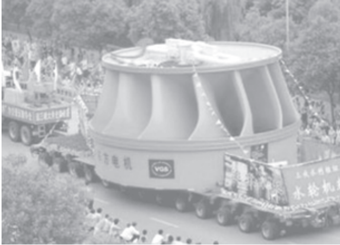
A giant turbine generator to be installed in the Three Gorges power plant is transported through the downtown street of Chengdu, southwest China's Sichuan Province on 10 July, 2005. The turbine produced by Dongfang Electrical Machinery Co Ltd weighs 416 tons. Picutre taken on 10 July, 2005.