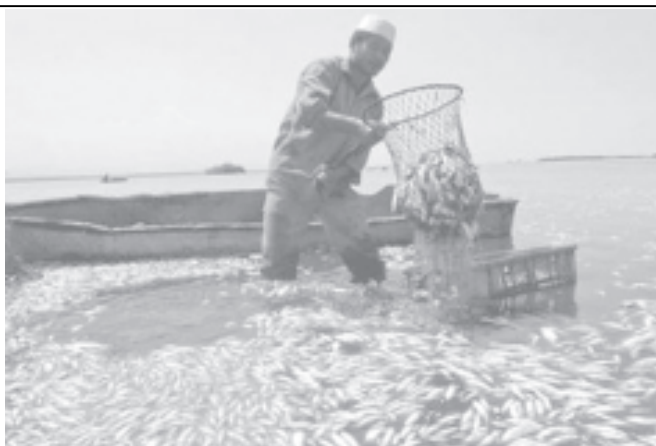
A Chinese worker collects dead fish in a reservoir in Urumchi, northwest China's Xinjiang Uygur Autonomous Region, on 10 July, 2005. Much water in this reservoir has been used for agricultural irrigation as local authorities fight against the severe drought.

The Chinese capital was awarded the right to host the 2008 Olympics in July 2001.