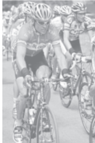
Jan Ullrich of Germany rides up the Bramont pass during the 9th stage of the Tour de France cycling race between Gerardmer and Mulhouse, eastern France, on Sunday, 10 July, 2005.

PARIS, 12 July— German cyclist Jan Ullrich said on Monday he was feeling no serious ill effects from his high speed crash in the ninth stage of Tour de France.