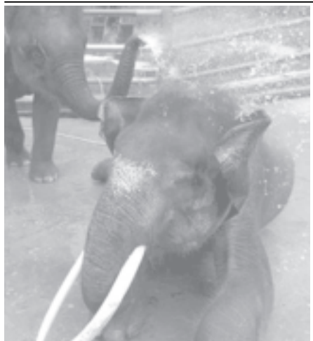
An elephant sprinkles water on its companion to cool it off at Xiangjiang Wildlife World in Guangzhou, capital of south China's Guangdong Province, on 10 July, 2005. Various measures have been taken to help animals here to combat heat wave plaguing the city during past days.

'There are no victims,' a ministry official said after having contacted hospitals in the city.