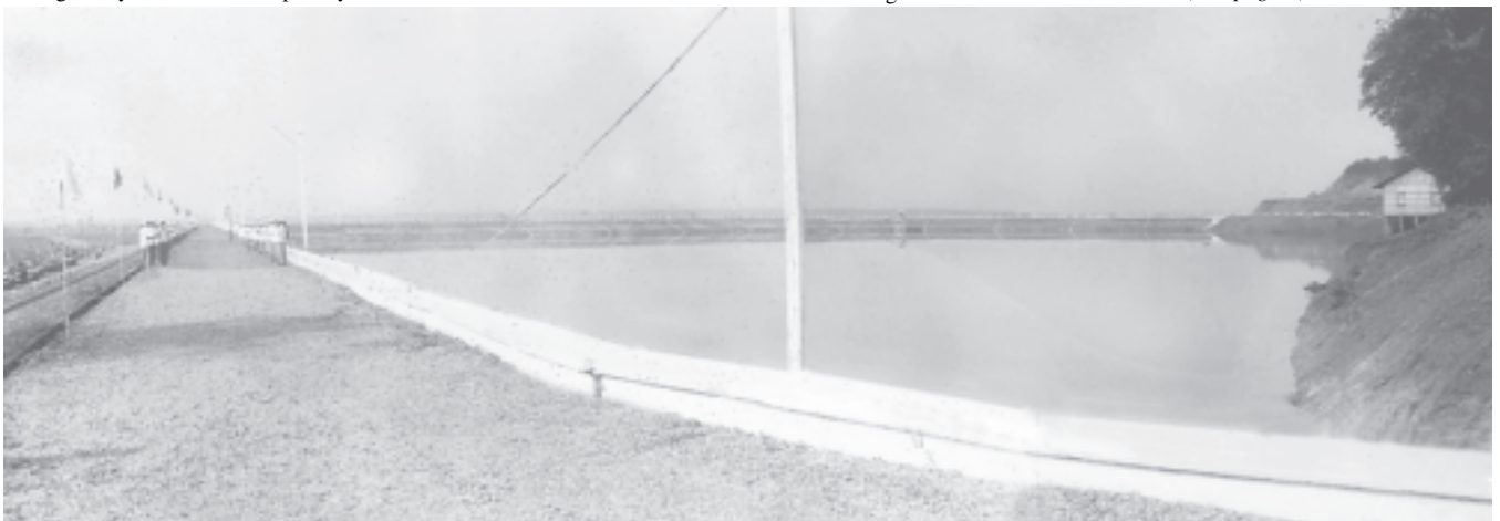
Newly inaugurated Pahtaw Dam at Pahtaw Village, Kyunsu Township, Myeik District, Taninthayi Division—MNA

Emergence of the State Constitution is the duty of all citizens of Myanmar Naing-Ngan.