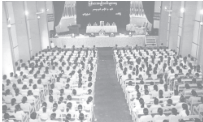
Chin State WAO marks Myanmar Women's Day in Haka.—MNA