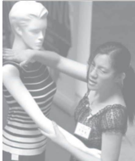
A woman sets up a mannequin at a fashion boutique in Beijing, China, on 12 July, 2005.