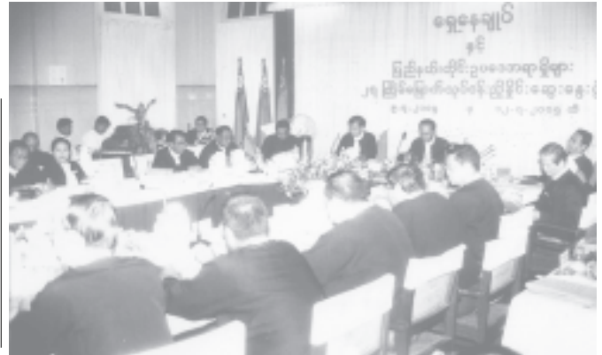
Attorney-General U Aye Maung addresses the second-day session.

sented their reports to the meeting. The meeting ended with concluding speech delivered by the attorney-general.—MNA