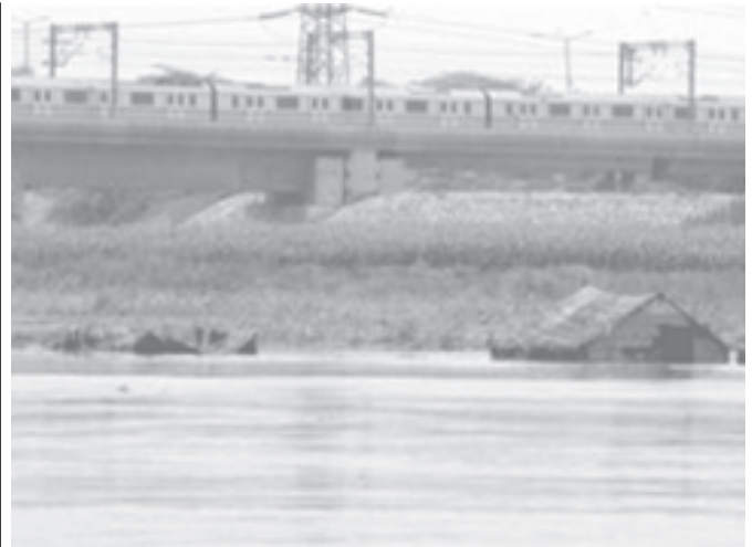
A Delhi Metro Rail train passes by as a hut is seen submerged in the River Yamuna in New Delhi, India, on 10 July, 2005.