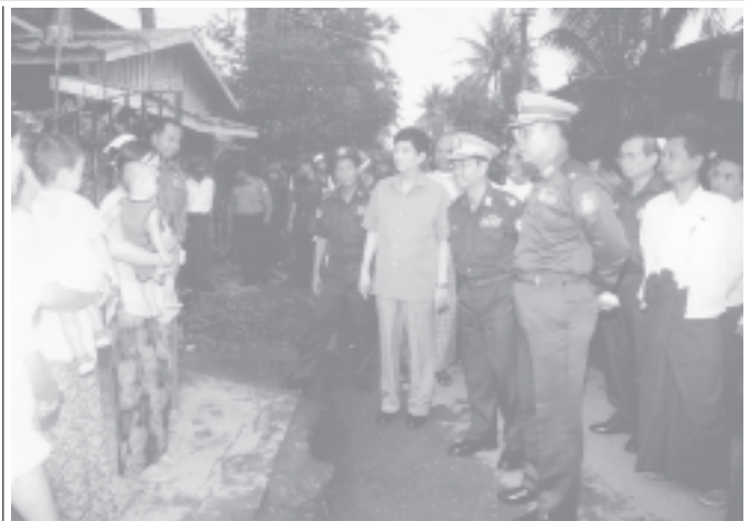
Commander Maj-Gen Myint Swe, Health Minister Dr Kyaw Myint and Mayor Brig-Gen Aung Thein Lin cordially converse with locals of Ward 10, South Okkalapa, where DHF control work is being launched Tuesday. — YCDC

The minister then inspected the materials used in river water pumping project at the maintenance and supply section of Water Resources Utilization Department in Ywathagy.—MNA