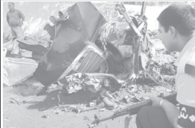
An Iraqi police inspects the site where a suicide bomber detonated his booby-trapped car outside Kirkuk's municipal offices, in northern Iraq, on 10 July, 2005.