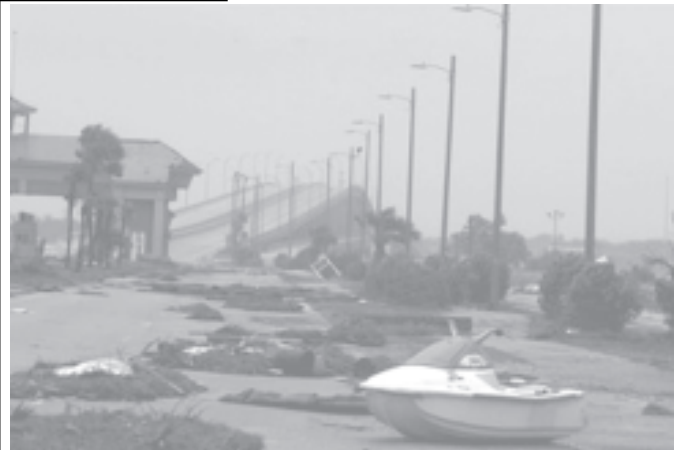
Debris washed ashore by Hurricane Dennis lines the Bob Sikes Bridge in Penscola Beach, Fla, on 10 July, 2005.