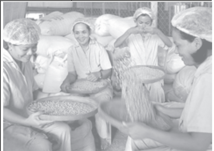
Cambodian workers clean soya beans at a soy milk factory in Phnom Penh recently.