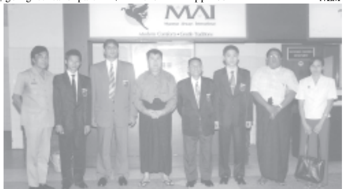
Myanmar swimming team at the airport before their departure for Canada.