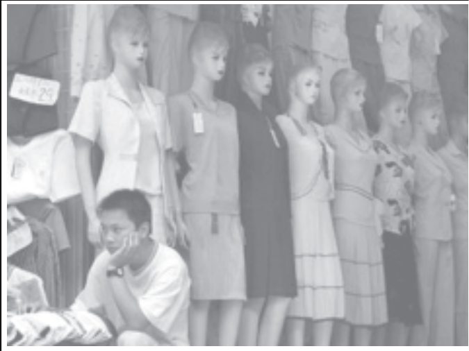
A Chinese shop assistant waits for customers at a clothing shop in Beijing on 12 July, 2005.