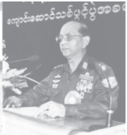
MEC Chairman Secretary-1 Lt-Gen Thein Sein addresses the ceremony to inaugurate the main building of Government Technological College (Bhamo).