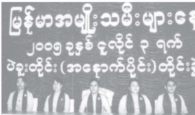
Members of Panel of Chairpersons seen at the Myanmar Women's Day commemorative ceremony in Pyay.— MNA

While the government and all the people are striving for sector-wise development of the country, some big countries has imposed economic sanctions on Myanmar applying various ways and means. Their pressures and sanctions caused Myanmar women workers lose jobs. Those countries discredit Myanmar through their accusations that there was