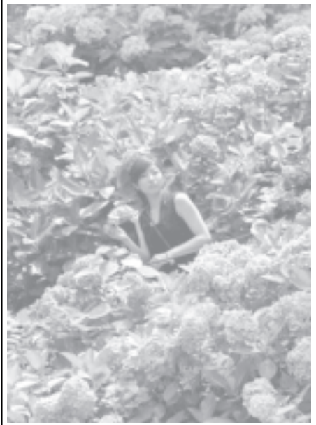
A visitor carrying a compact camera takes a stroll among colourful hydrangea flowers in the compound of Hase Temple in Kamakura, west of Tokyo, on 8 July, 2005. Some 2,300 stocks of hydrangea bloom as the symbol of the rainy season in Japan.