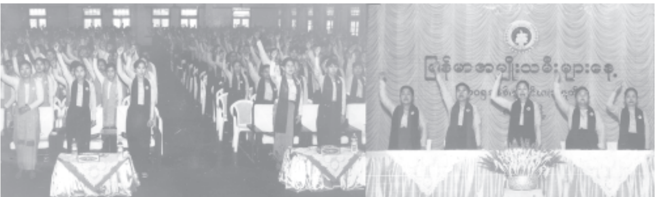
Participants chanting slogans at the end of Myanmar Women's Day commemorative ceremony in Sittway.