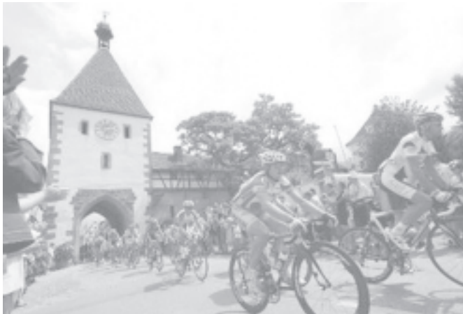
The pack of riders cycles through a village during the 231km (143 miles) eighth stage of the 92nd Tour de France cycling race between Pforzheim (Germany) and Gerardmer (France), on 9 July, 2005.