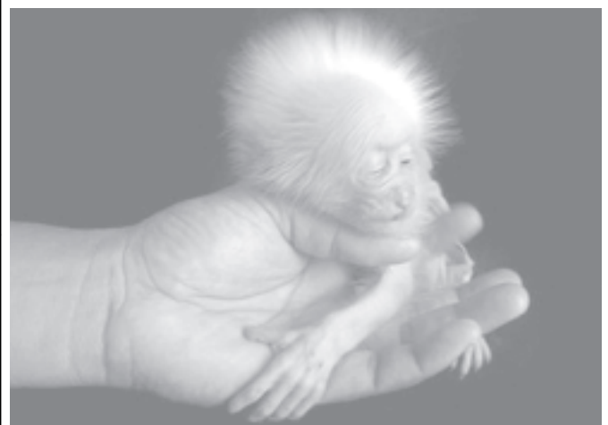
A zoo official holds a seven-day old Stump-Tailed macaque at the state zoological park in Gauhati, India, on 9 July, 2005. The macaque lost his mother two days ago. Stump-Tailed is one of the rare species of macaque in the world.