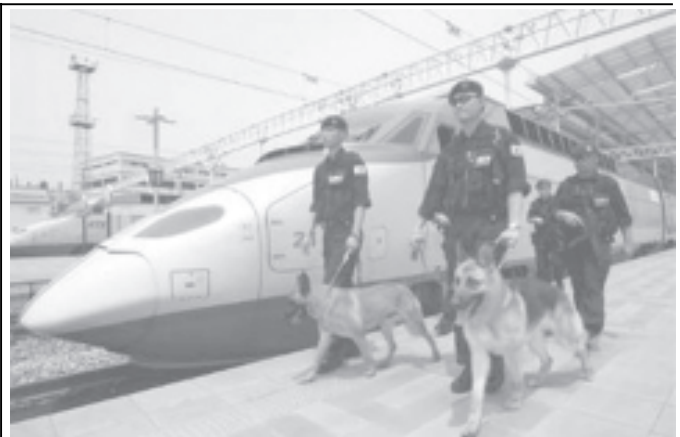
Members of the South Korean SWAT team patrol near a bullet train at the railway station in Seoul, on 8 July, 2005. South Korea has enhanced its security at airports and other major facilities after a series of deadly explosions in London, local media reported on Friday.