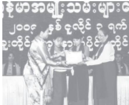
An official presents prize to an outstanding woman.