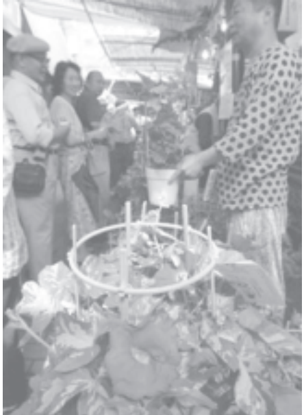
A vendor, right, shows a pot of morning glories to visitors to the annual Morning Glory Fair in Tokyo on 7 July, 2005. —INTERNET