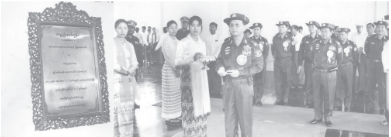
MEC Chairman Secretary-1 Lt-Gen Thein Sein unveils bronze plaque of the main building of Government Technological College (Bhamo).— MNA