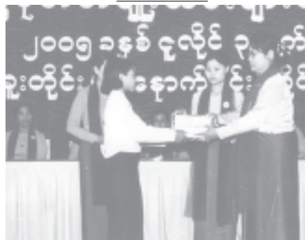
An official presents prize to an outstanding student.