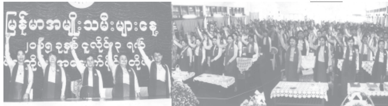
Participants chanting the slogans in concluding of the Myanmar Women's Day ceremony in Pyay.— MNA