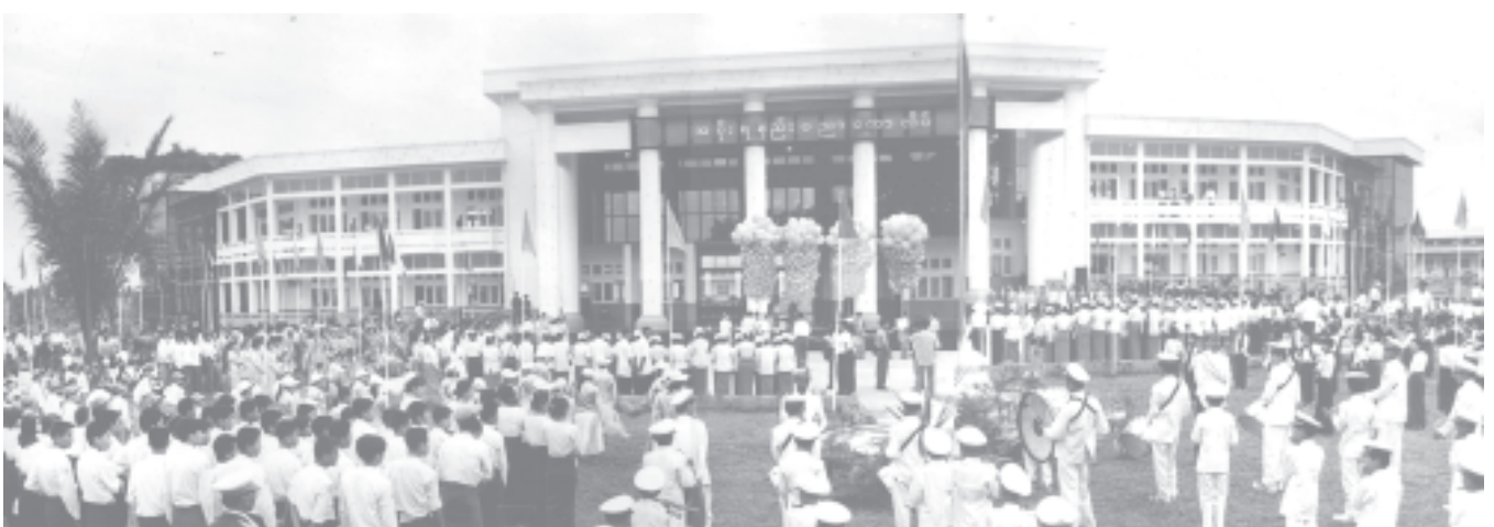
The opening ceremony of the main building of GTC (Bhamo) in progress.

Emergence of the State Constitution is the duty of all citizens of Myanmar Naing-Ngan.