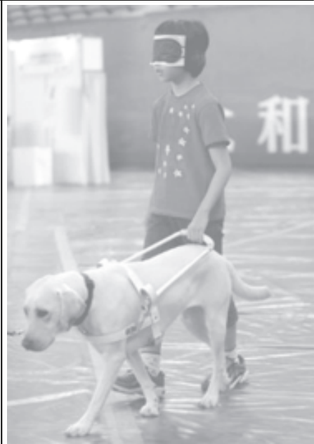
A girl wearing a blind fold walks with assistance from a seeing eye dog during a dog festival in Tokyo on 9 July, 2005.