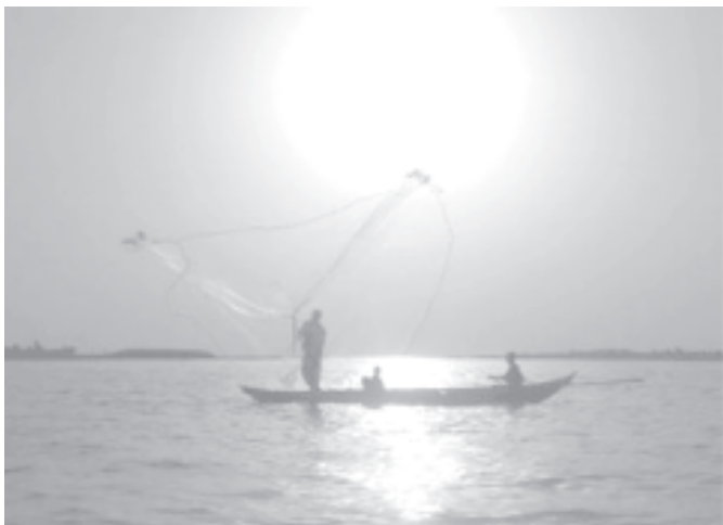
An Iraqi fisherman casts his net into the Shat al-Arab waters near the southern city of Basra on 9 July, 2005.

Such acts perpetrated by a few will not deter the commitment and resolve of the United Nations and the international community to help the Iraqi people in their transition towards a peaceful, democratic and prosperous Iraq, Annan stressed.