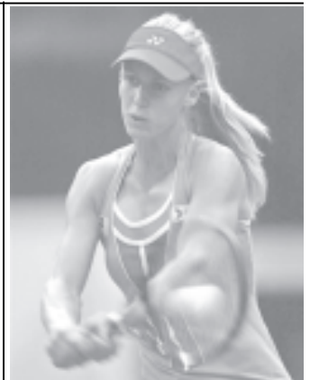
Elena Dementieva, of Russia, returns a shot during her semifinal match against Mashona Washington, of the US, at the Fed Cup tennis tournament in Moscow's Olympic Indoor Stadium, on 9 July, 2005.