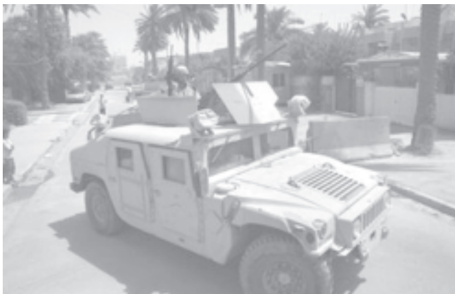
US military arrive outside the Egyptian Embassy in Baghdad, Iraq, during security checks on 8 July, 2005 — INTERNET

The capital's water supply has also come under mounting attack. On Thursday, insurgents bombed a key main, leaving half the city without water at the height of summer in the third such attack in as many weeks. — Internet