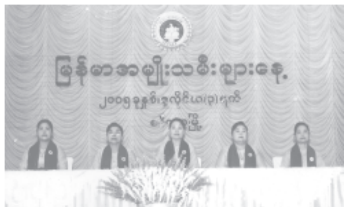
Members of Panel of Chairpersons seen at the ceremony to mark Myanmar Women's Day in Sittway.

However, she said, some countries, expatriates and lackeys of colonialists are trying to designate the Myanmar Women's Day in honour of the birthday of a woman who is a puppet of some western nations. She said that woman is resorting to various ways to put the nation under subjugation, to break up the Tatmadaw and to cause economic difficulties for all people of the country. This means she is trying to harm the interests of the entire womenfolk. She said it is the best way to designate the third July as Myanmar Women's Day, and Rakhine national women are to fully support the already-designated day. The mass of