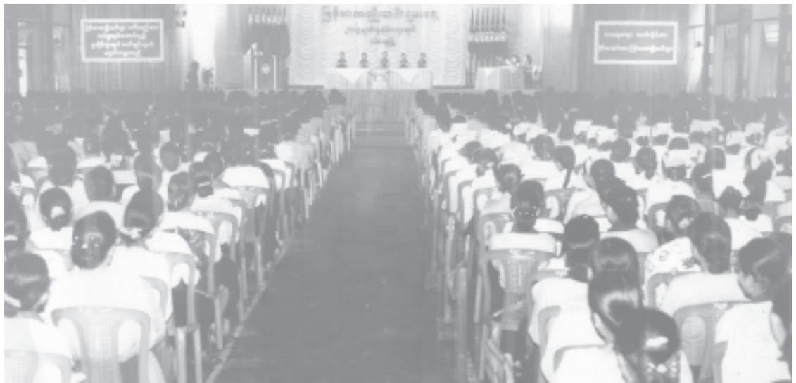
The Myanmar Women's Day being observed in Sittway.

However, without understanding the traditions of Myanmar nationals, the ILO is taking action against Myanmar by accusing the country of practising forced labour. In addition, Myanmar had to close down about 160 textile factories due to economic sanctions of the US government. More than 80,000 workers including women became out of job. Unable to assess the genuine af-