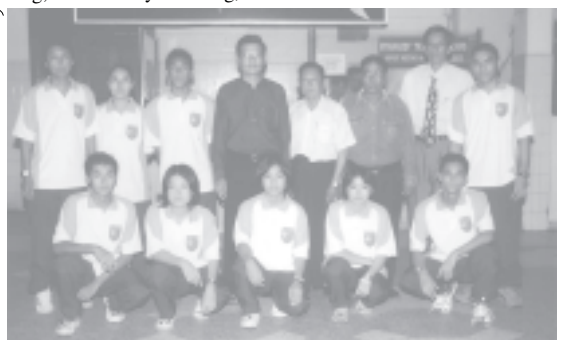
Myanmar Badminton Team seen at the airport before departure for Indonesia.