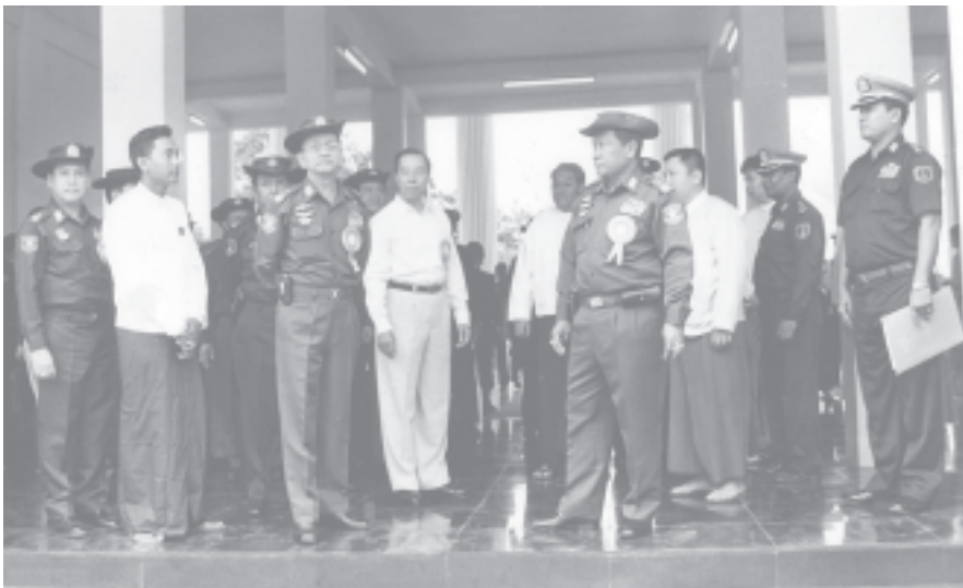
MEC Chairman Secretary-1 Lt-Gen Thein Sein inspects the main building of GTC (Bhamo).

YANGON, 11 July — On the occasion of the anniversary of the National Day of Mongolia, which falls on 11 July 2005, Senior General Than Shwe, Chairman of the State Peace and Development Council of the Union of Myanmar, has sent a message of felicitations to His Excellency Mr Nambar Enkhbayar, President of Mongolia.—MNA