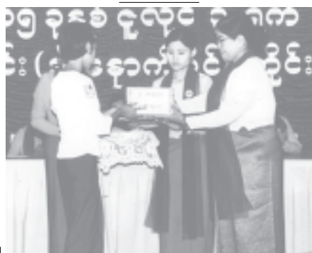
An official presents prize to an outstanding student.