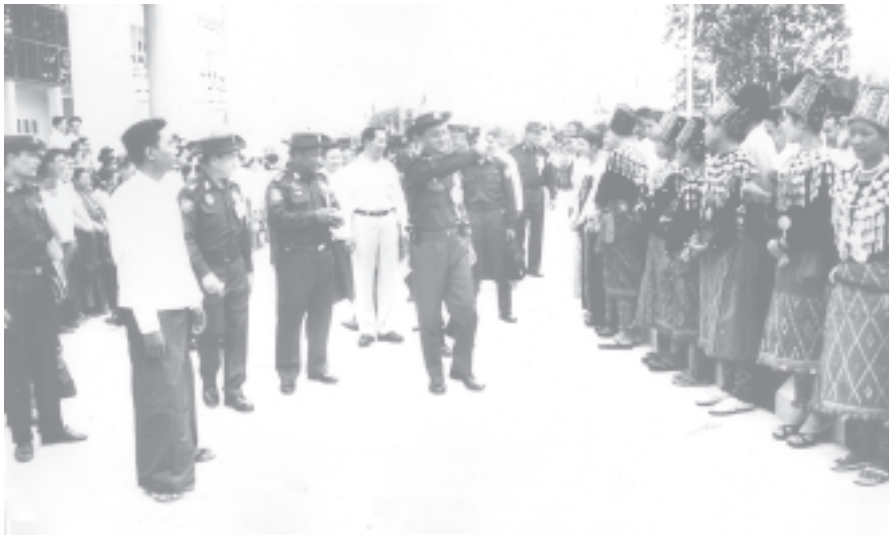
MEC Chairman Secretary-1 Lt-Gen Thein Sein cordially greets local people and students at the opening ceremony of the main building of Government Technological College (Bhamo). — MNA

available in every major region - not Yangon and Mandalay only. Nine degree colleges and techni-