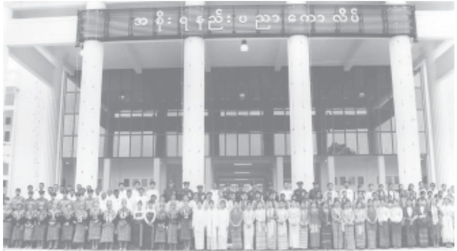
MEC Chairman Secretary-1 Lt-Gen Thein Sein and party pose for documentary photo together with local people and students in front of GTC (Bhamo).

In accord with the guidance of the Head of State, the Tatmadaw government is making endeavours for producing human resources and for fulfilling social needs such as to be able to work in peace and healthy living, creating economic opportunities and ensuring