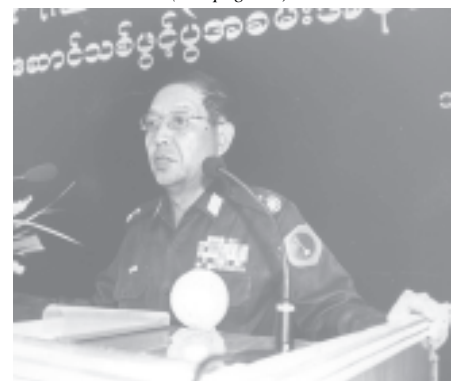
Commander Maj-Gen Maung Maung Swe speaking at the opening ceremony of the main building of GTC (Bhamo).

It is obvious that Kachin State is on the right path to development. Similarly, other states and divisions have developed. In accord with the slogan— Strength of the nation lies within such achievements have been made due to the harmonious efforts of the State, the people and the Tatmadaw. Despite the political pressure, economic sanction and accusations, the government has been making efforts for the development of the State with patriotic spirit and the nation enjoys the fruitful results.