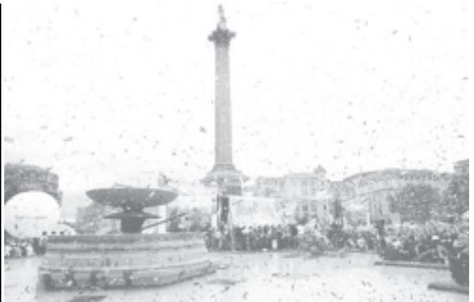
Crowds in London's Trafalgar Square celebrate as the announcement is made that London will host the 2012 Olympics, London, on 6 July, 2005.