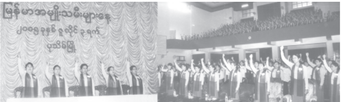
The ceremony to mark Myanmar Women's Day in Patheingyi concludes with chanting of slogans.