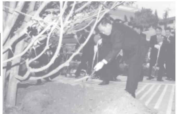
Prime Minister General Soe Win plants a tree to mark Myanmar-China friendship at World Horti Expo Garden.