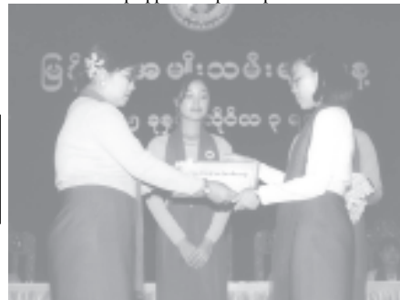
An official of Shan State (East) WAO presents the prize to an outstanding girl.