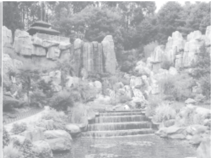
Prime Minister General Soe Win and party visit Stone Hall of World Horti Expo Garden in Kunming, Yunnan Province. —MNA

Emergence of the State Constitution is the duty of all citizens of Myanmar Naing-Ngan.