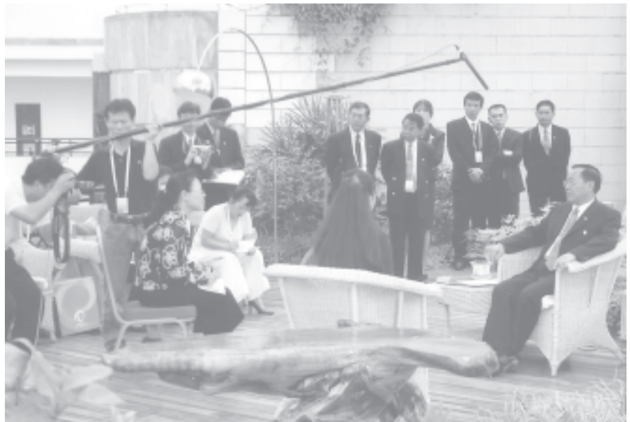
Yunnan TV of the People's Republic of China interviews Prime Minister General Soe Win.—MNA