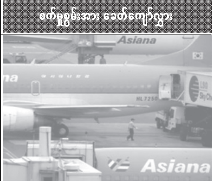
Planes of Asiana Airline, South Korea's second-largest airline, park on the tarmac at Gimpo airport in Seoul, on 5 July, 2005.

Sharan warned that the developing countries cannot be penalized for the greenhouse gas emission which is due to the lopsided development policy being pursued for decades by the industrialized countries. — MNA/PTI