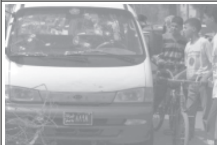
Iraqis look at the bullet holes in the wind screen of a mini bus in Baghdad, Iraq, on 5 July, 2005.