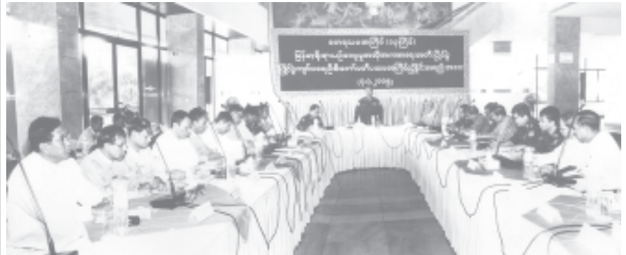
Commander Maj-Gen Myint Swe delivers an address at the first coordination meeting of Leading Committee for Organizing the 13th Myanmar Traditional Cultural Performing Arts Competitions.—MNA

The meeting ended with the concluding remarks by the commander. — MNA