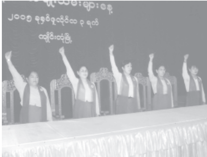
Participants at the ceremony to mark Myanmar Women's Day chanting slogans in Kengtung, Shan State (East). — MNA

participate in implementation of seven-point Road Map. Concerning the hu-