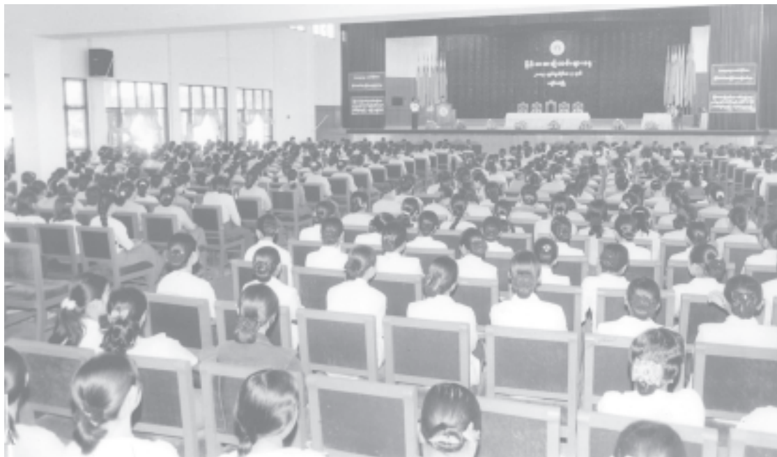
A ceremony to commemorate Myanmar Women's Day in progress in Kengtung, Shan State (East).

man rights and women's rights, two outlawed organizations SHRF and SWAN accused Myanmar Army of raping Shan women. They declared that there were 175 rape cases in Shan State (East) and Shan State (North).