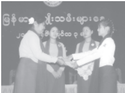
An official of Shan State (East) WAO presents the prize to an outstanding girl.