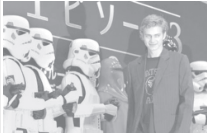
Canadian actor Hayden Christensen arrives for a news conference for 'Star Wars: Episode III - Revenge of the Sith' in Tokyo on 6 July, 2005. The final installment of the sci-fi series opens in Japan on 9 July.