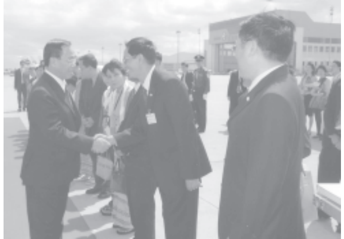
Prime Minister General Soe Win being seen off at Kunming International Airport by staff of Myanmar Consul-General.

YANGON, 7 July — Prime Minister of the Union of Myanmar General Soe Win arrived back here on 5 July afternoon after attending the 2nd Greater Mekong Subregion Summit held in Kunming, Yunnan Province, the People's Republic of China.