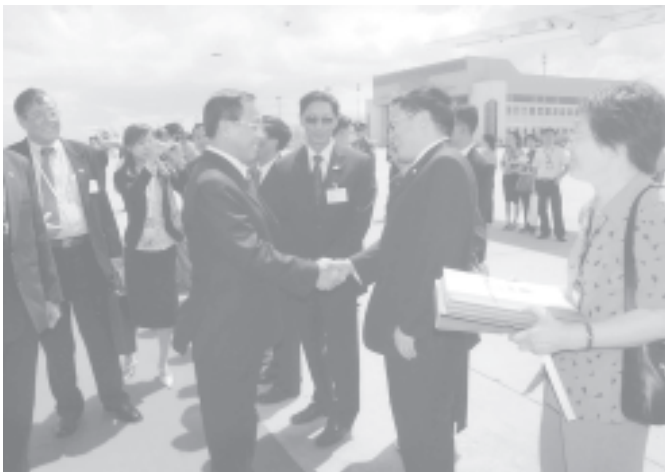
Prime Minister General Soe Win being seen off at Kunming International Airport by Vice-Governor of Yunnan Province Mr Lu Bin.