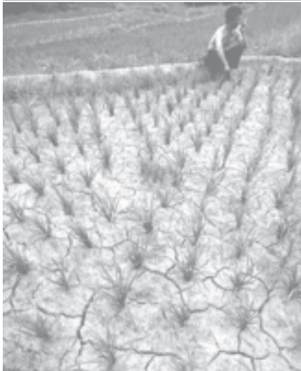
A Chinese farmer smokes on a piece of dry rice field in Hangzhou, in eastern China's Zhejiang Province, on 5 July, 2005.

The virus of the disease in Indonesia is reported to similar with those found in Yemen and Saudi Arabia.