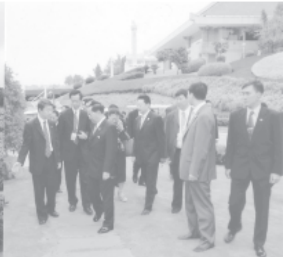
Prime Minister General Soe Win and party view round World Horti Expo Garden in Kunming, Yunnan of China.