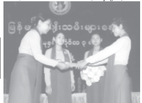
An official of Shan State (East) WAO presents the prize to an outstanding girl.