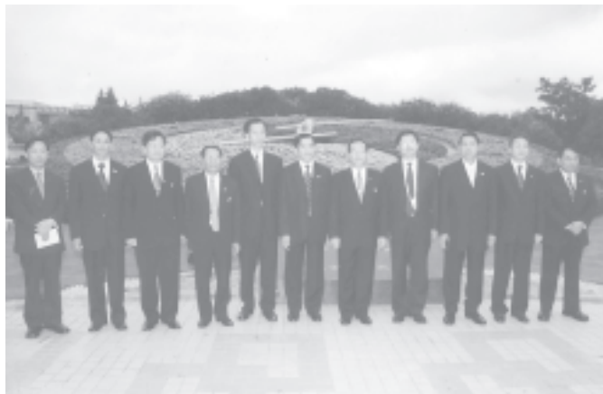
Prime Minister General Soe Win and party together with officials of Yunnan Expo Group Co Ltd pose for photo at World Horti Expo Garden.

countries. Only when the linkage is good and efficient can there be unimpeded flow of goods