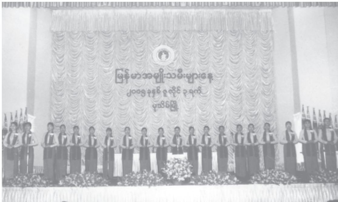
Myanmar girls open ceremony to mark Myanmar Women's Day by signing the song at city hall in Patheingyi.

Due to misconduct of Pyithit Nyunt Wai (a) Maung Maung concerning the decision of ILO, 160 garment factories were closed down in 2003 and over 80,000 workers lost their jobs including over 70,000 women workers, and they together with the family members numbering over 400,000 are facing financial hardships. Entrepreneurs had to give a compensation of over K 1.2 billion and over 80,000 FECs to the workers who lost their jobs. So, investment of the entrepreneurs decreased in the country.