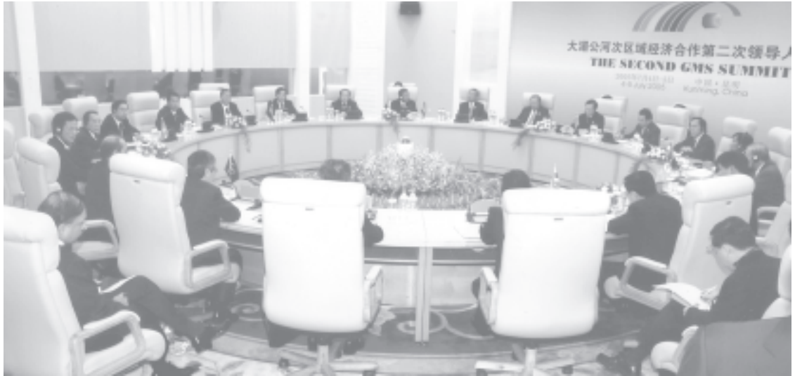
The second GMS summit in progress at International Convention and Exhibition Centre-ICEC in Kunming.

The First GMS Summit endorsed a strategic framework that focused on strengthening infrastructure linkages, facilitating cross-border trade and investment, enhancing private sector participation, developing human resources and protecting the environment. In view of this, reinforcing infrastructure development, improving trade and investment environment, strengthening social and environmental infrastructure, mobilizing resources and deepening partnership are priority areas under the strategic framework.