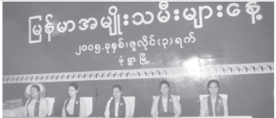
Members of the Panel of Chairpersons seen at the ceremony to mark Myanmar Women's Day in Monywa.

mission to look into the matter. In this regard, Myanmar issued an order prohibiting forced labour, if it really exists in the country, in the whole