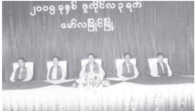
Members of the Panel of Chairpersons seen at Myanmar Women's Day commemorative ceremony in Mawlamyine.

In the present period, they are doing enthusiastic performances in nation-building tasks pragmatically after forming MWAF, MMCWA, Myanmar Women's Sports Federation, Women's Chapter of the Myanmar Medical Association, and Myanmar