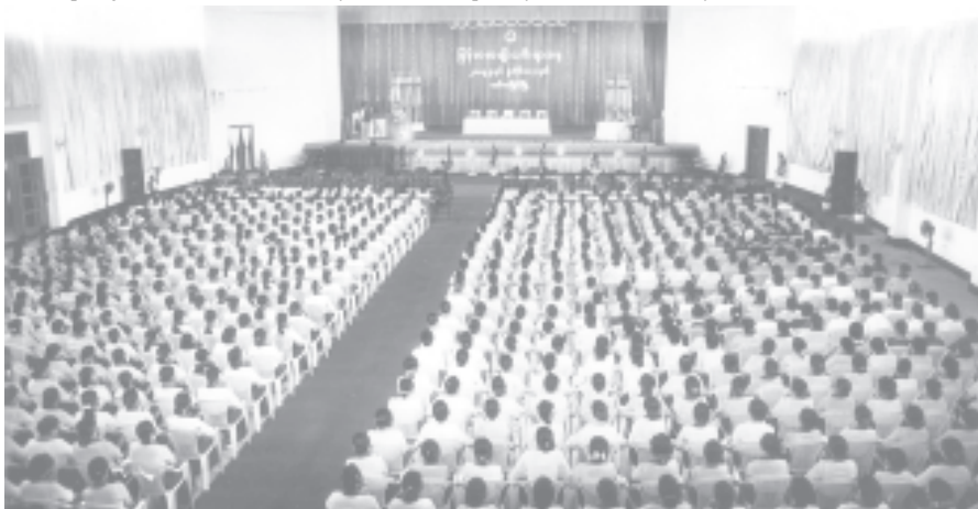
The ceremony to mark Myanmar Women's Day in progress in Mawlamyine.