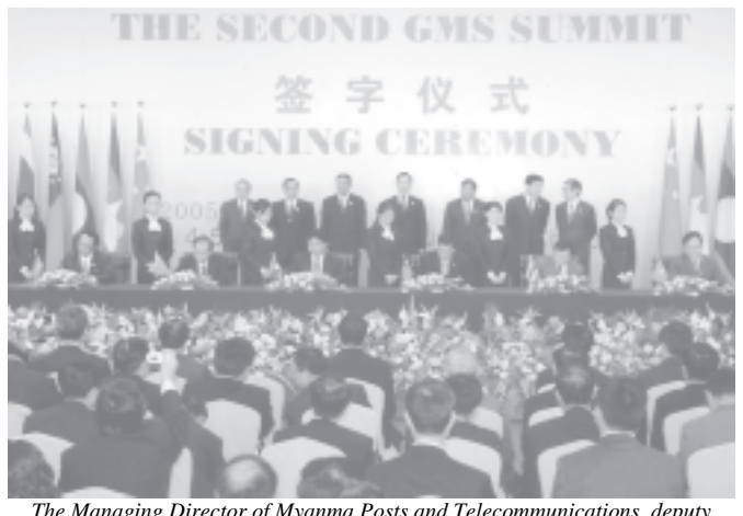
The Managing Director of Myanmar Posts and Telecommunications, deputy ministers and officials of GMS countries ink MoU at the signing ceremony of the Second GMS Summit.