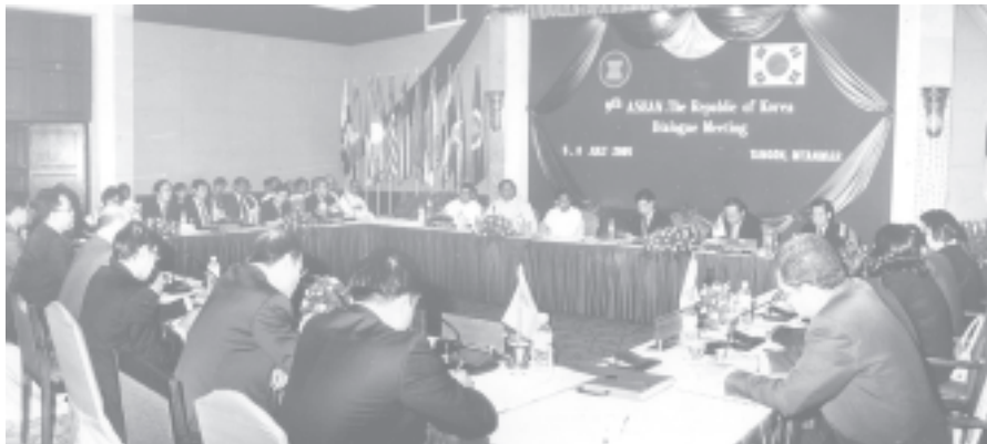
The 9th Asean-Korea meeting in progress at Grand Plaza ParkRoyal Hotel.