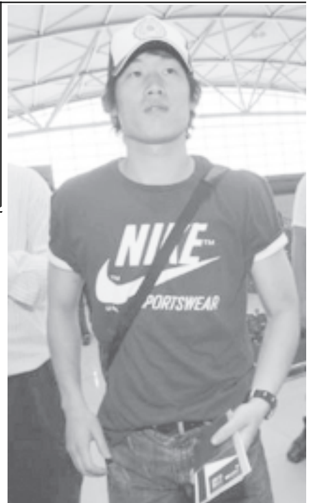
South Korean soccer player Park Ji-sung boards a plane to join his team Manchester United, at an airport in Incheon, west of Seoul, on 6 July, 2005. Park, who helped PSV Eindhoven win the Dutch title and reach the Champions League semi-finals last season, became the first South Korean to play in the English Premier League.