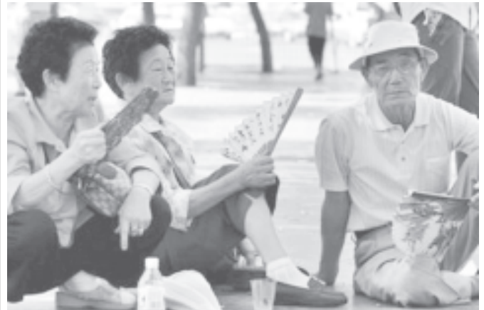
Tourists try keep cool in the shade as a heat wave sweeps across Beijing, in Tiananmen square on Wednesday, 6 July, 2005. Sustained high temperatures in north China over the past several days have affected people's daily life leading to a hike of power and water consumption.