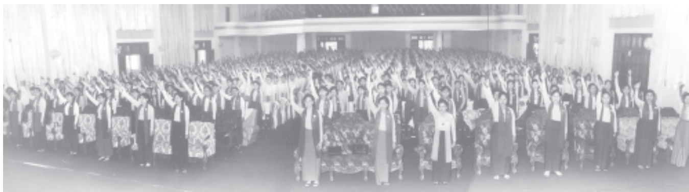
Participants at ceremony to mark Myanmar Women's Day chanting slogans in Mawlamyine.