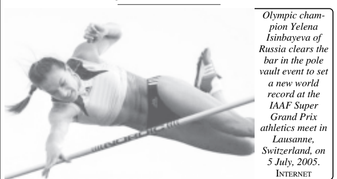
Olympic champion Yelena Isinbayeva of Russia clears the bar in the pole vault event to set a new world record at the IAAF Super Grand Prix athletics meet in Lausanne, Switzerland, on 5 July, 2005. INTERNET

Chinese Olympic champion Liu Xiang was forced to share victory in the 110 metres hurdles after tying with America's Terrence Trammell in 13.05 seconds. —MNA/Xinhua