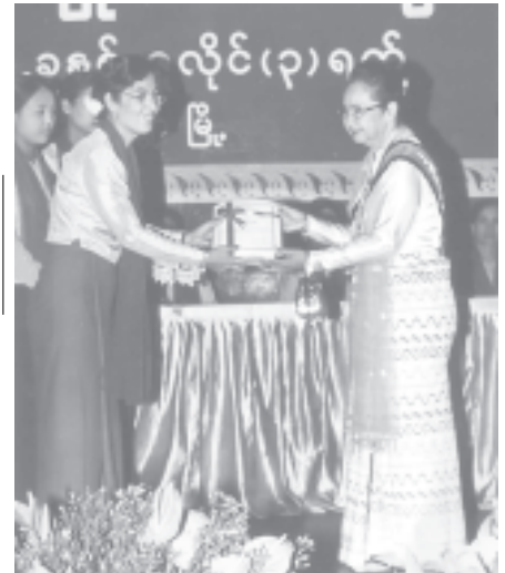
An official gives prize to an outstanding woman.

resolution 2000, direct investments to Myanmar stopped and many job opportunities were lost in the country. The entrepreneurs had to give a compensation of over K 1.2 billion and over 80,000