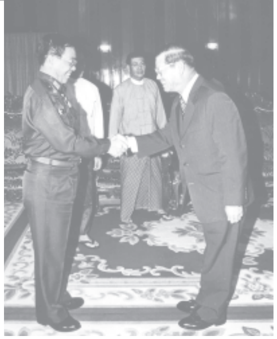
Prime Minister General Soe Win receives Mr Somsavat Lengsavad, Deputy Prime Minister and Minister of Foreign Affairs of Laos. —MNA

Prime Minister General Soe Win greets Mr Somsavat Lengsavad Deputy Prime Minister and Minister of Foreign Affairs of Laos. MNA