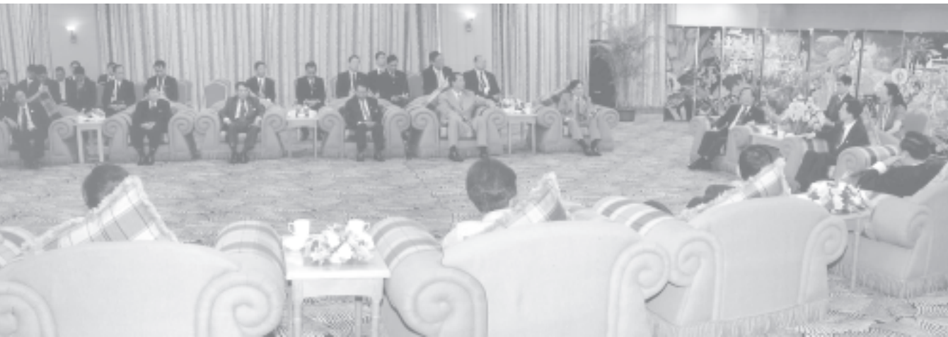
Yunnan Province Governor Mr Xu Rongkai calls on Prime Minister General Soe Win at Expo Garden Hotel in Kunming, Yunnan Province, PRC.

YANGON, 6 July — Prime Minister General Soe Win held talks with Governor of Yunnan Province Mr Xu Rongkai in Kunming on 3 July.