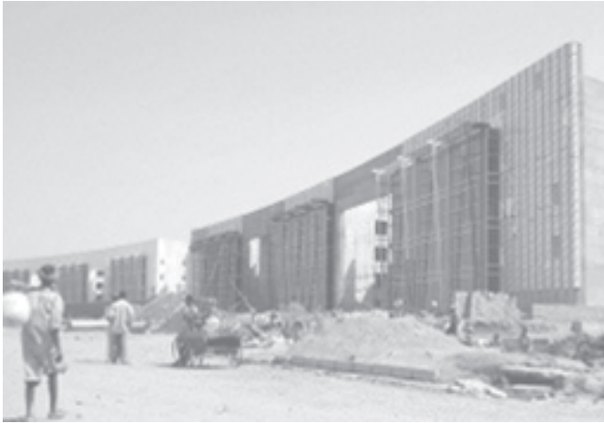
An Information Technology Park is under construction in India. The Asia Pacific's information technology services market is projected to grow at an annual compound rate of 8.9 percent from 2004 to 2009, outpacing the global expansion of 6.1 percent. — INTERNET