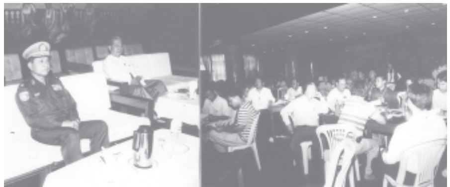
Minister for Mines Brig-Gen Ohn Myint attends Jade and Gems special sales for 2005.