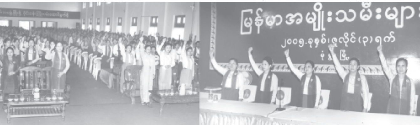
Members of Panel of Chairpersons and those present chanting slogan at the ceremony to mark the Myanmar Women's Day held in Monywa. — MNA