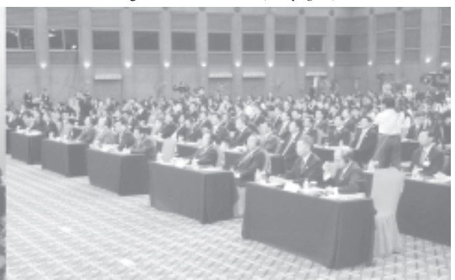
Prime Minister General Soe Win attends the Second GMS Summit at International Convention and Exhibition Centre (ICEC) in Kunming, the People's Republic of China.

Emergence of the State Constitution is the duty of all citizens of Myanmar Naing-Ngan.