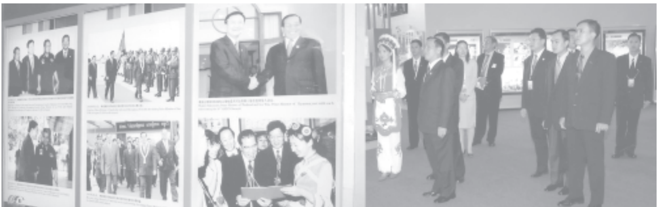
Prime Minister General Soe Win visits Achievements Exhibition.