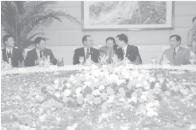
Prime Minister General Soe Win and ministers seen at a dinner hosted by Yunnan Province Governor Mr Xu Rongkai at Expo Garden Hotel in Kunming, Yunnan Province, PRC. — MNA

cial progress. According to the contract signed in 1997, both countries have agreed to upgrade the border trade into normal trade. China has planned to increase its trade with South Asian nations. The time is ripe for both nations to upgrade the border trade into normal trade. The Muse-Shweli border trade should be developed to become formal trade to increase the bilateral trade volume. Myanmar and Chinese traders have already agreed to export US $ 155 million dollars worth of aqua and agricultural goods to China. Myanmar companies will form joint ven-