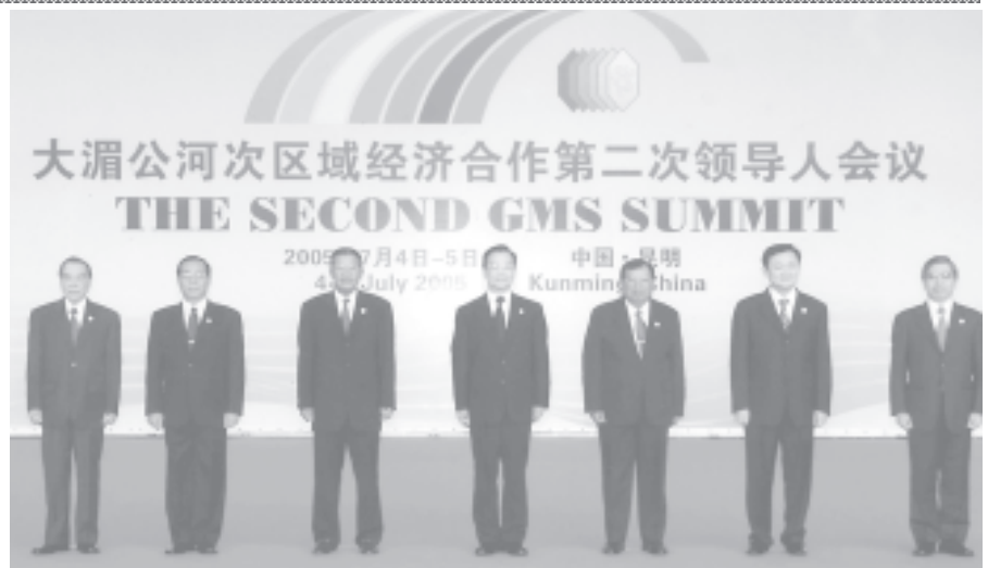
Prime Minister General Soe Win and Premier Mr Wen Jiabao and prime ministers of Cambodia, Laos, Thailand and Vietnam and the ADB President pose for documentary photo.

I consider it a privilege and honour to attend this second GMS Summit together with my distinguished colleagues, the Honourable Prime Ministers