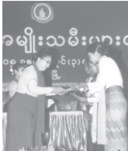
An official presents prize to an outstanding woman.