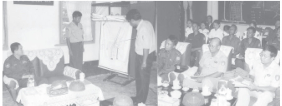
Minister Col Thein Nyunt hears a report on development tasks in Kyaunggon Township. — PBANRDA

YANGON, 6 July — Minister for Progress of Border Areas and National Races and Development Affairs Col Thein Nyunt, accompanied by Deputy Director-General of Department of Development Affairs U Ohn Nyunt, inspected development work in Kyaunggon Township, Ayeyewady Division, on 2 July.