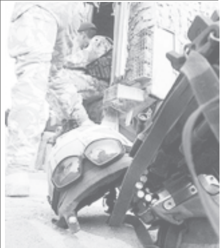
British soldiers stand near their gear at the start of a patrol in the southern city of Basra. Britain's Defence Ministry has drafted plans for a significant troop withdrawal from Iraq over the next 18 months and a big deployment to Afghanistan.