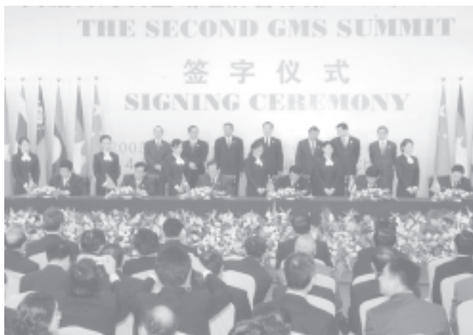
Minister U Soe Tha and ministers of GMS countries sign agreements and MoUs at the signing ceremony of the Second GMS Summit.