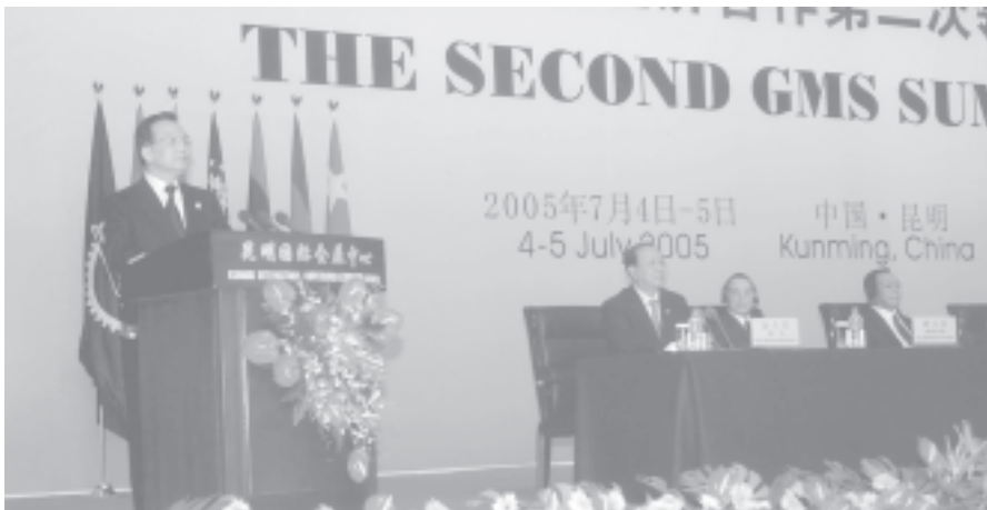
Prime Minister Mr Wen Jiabao delivers opening address at GMS Summit.

of the GMS countries in this beautiful city of Kunming in the People's Republic of China. We have been accorded a most warm reception since our arrival.