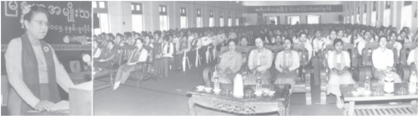
Chairperson Daw San Myint speaks at a ceremony to commemorate Myanmar Women's Day.