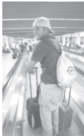
Brazil's striker Robinho

Robinho threatened, in case the negotiation fails, to remain in the Brazilian club until the end of his contract in 2008,