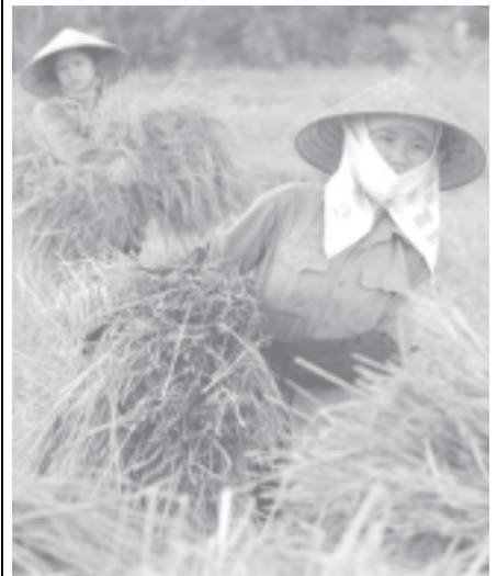
Vietnamese farmers carry rice on a rice field outside Hanoi, Vietnam, on 1 July, 2005.