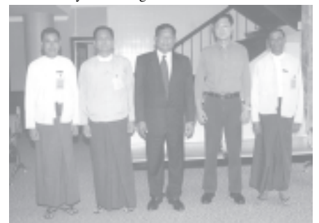
UMFCCI President seen at the airport before departure for China.