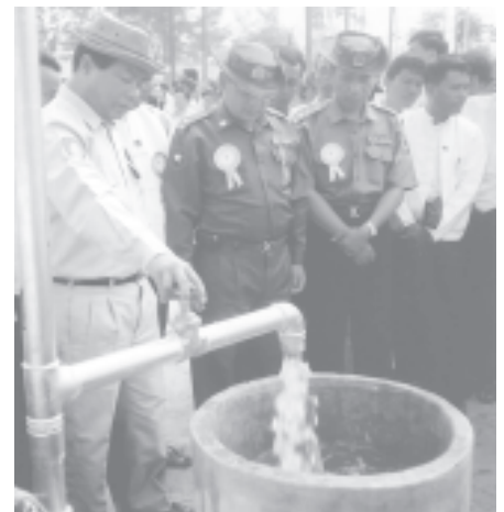
Ceremony to put tube-well into service in progress in NyaungU District. —DAD

The tube-well was funded by Myanmar Women's Affairs Federation and NyaungU Township DAC. The 4 inches