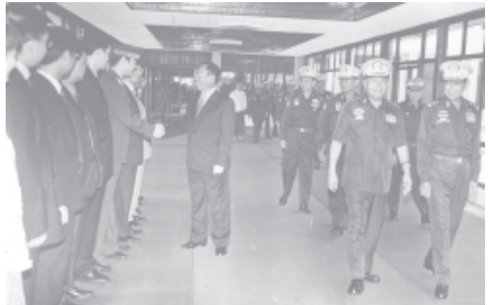
Diplomats of foreign missions in Yangon see off Prime Minister General Soe Win at Yangon International Airport before his departure for People's Republic of China.