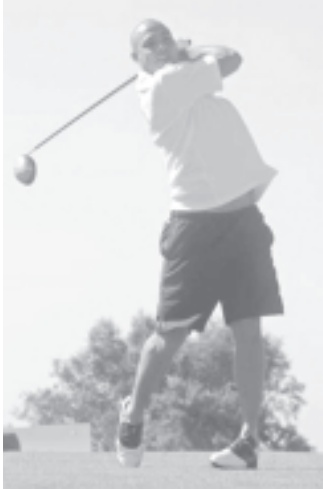
Brazilian soccer star Ronaldo watches his driver shot at the Millenium Golf Course during the All Stars event in Vilamoura, southern province of Algarve, on 2 July, 2005. Portugal's soccer player Luis Figo is promoting a meeting of sport personalities on Saturday in Algarve, Southern Portugal.