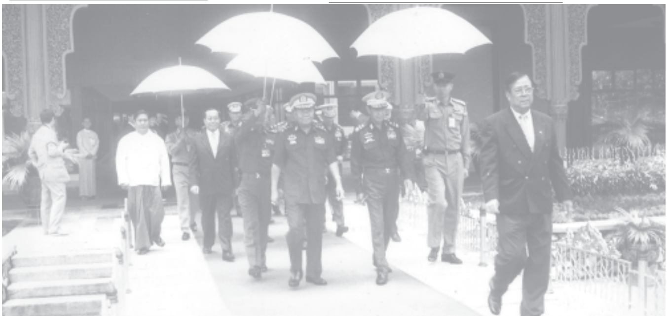
Senior General Than Shwe sees off Prime Minister General Soe Win at Yangon International Airport. — MNA

Emergence of the State Constitution is the duty of all citizens of Myanmar Naing-Ngan.