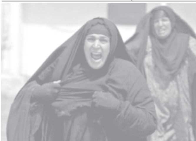
Women run towards Yarmouk Hospital after learning their sons were killed in a Baghdad suicide attack on 2 July, 2005.