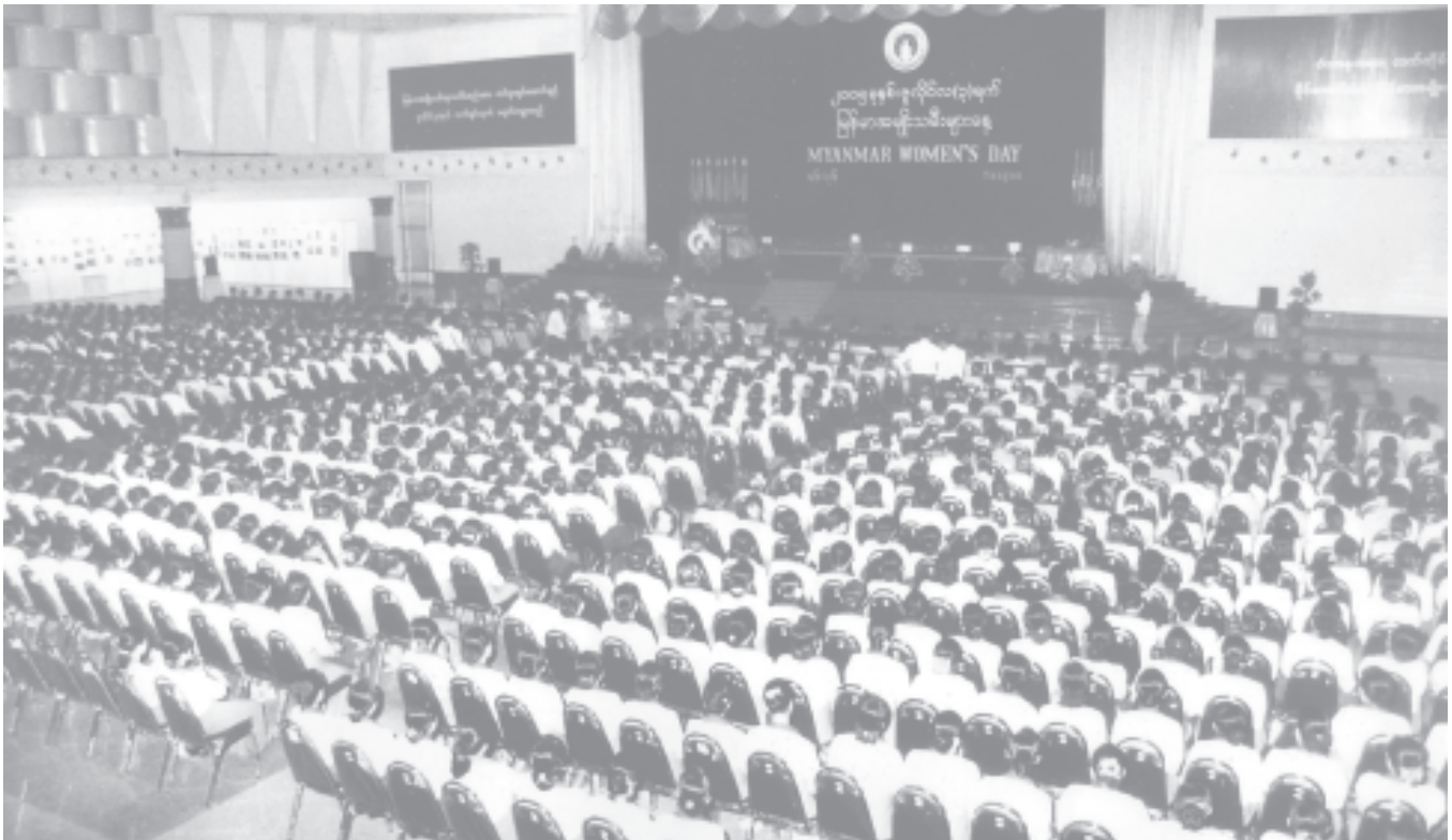
The Myanmar Women's Day commemorative ceremony in progress at Myanmar Convention Centre.