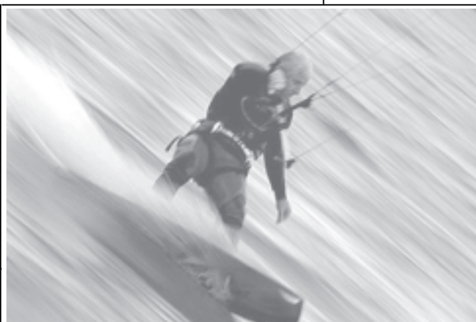
A man flies across the water as he kitesurfs on Botany Bay near Sydney recently.