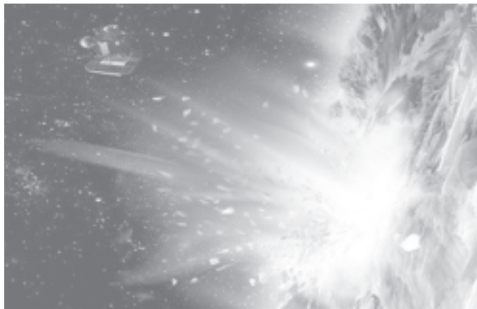
NASA handout of an artist's impression of the Deep Impact flyby spacecraft (upper left) that will record photos and data after the Impactor crashes onto the surface of Comet Tempel 1 on 4 July. —INTERNET