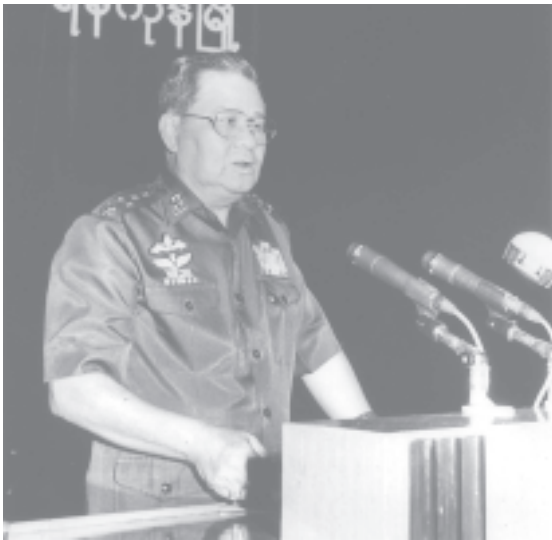
Senior-General Than Shwe gives guidance at fourth-day session of MWVO Conference.

The MWVO is to enhance its prestige and dignity to be able to catch up with war veterans organizations around the world. To be able to ensure a strong organization, (See page 8)