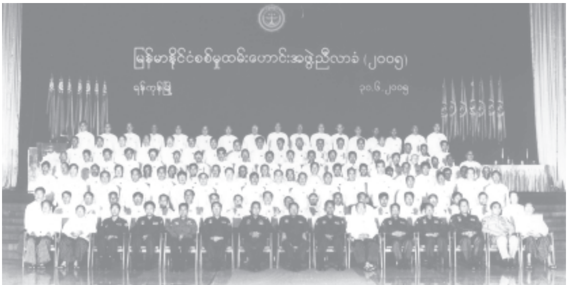
Senior General Than Shwe, members of the panel of patrons and COC members of MWVO pose for documentary photo.

The government has to make efforts to strengthen political, economic and defence sectors of the State, while striving for ensuring community