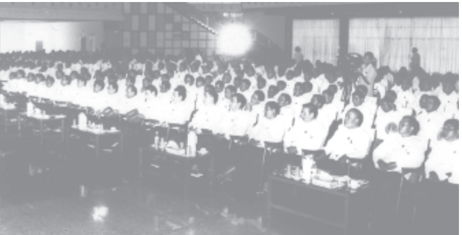
Secretary-1 Lt-Gen Thein Sein delivers concluding remarks at the MWVO Conference (2005).