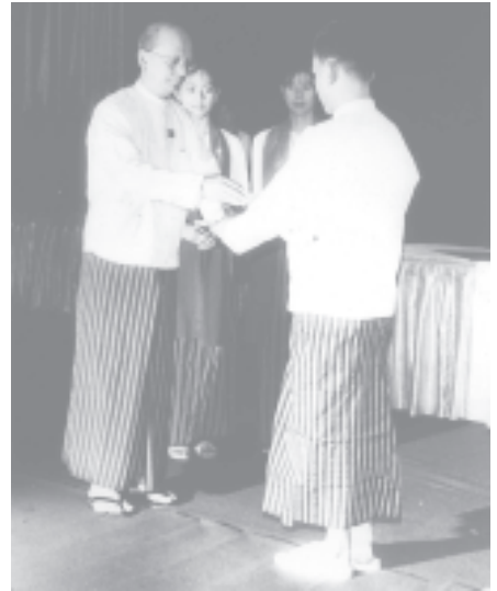
Secretary-1 Lt-Gen Thein Sein presents cash assistance to a disabled war veteran.