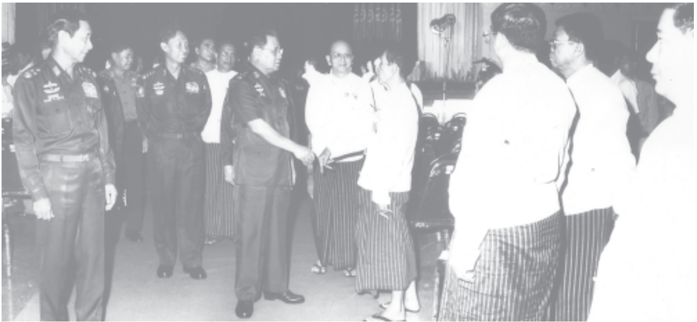
Senior General Than Shwe cordially greets delegates from States and Divisions who attended MWVO Conference 2005.