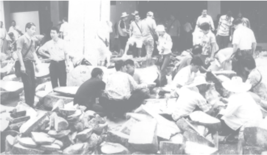
Gem merchants at home and abroad check jade displayed at the special sales.

YANGON, 30 June — A total of 761 gem merchants of 285 companies from seven countries and 616 merchants of 253 local companies, totalling 1,377 arrived at Jade and Gems Special Sales 2005 being held at Myanma Gems Mart on Kaba Aye Pagoda Road, here, today.