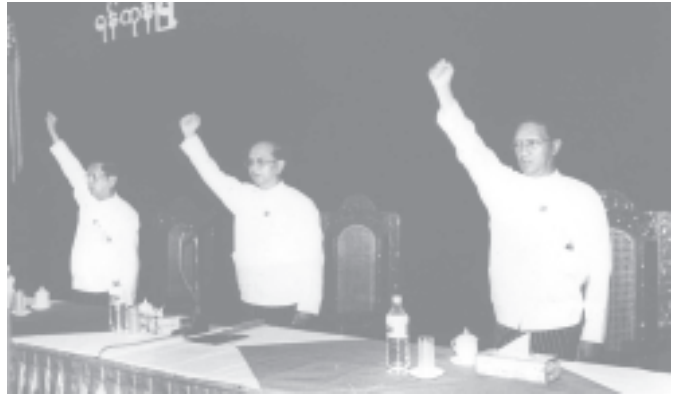
Secretary-1 Lt-Gen Thein Sein and members of panel of chairmen chanting slogans at the MWVO Conference (2005).

The Tatmadaw understands that it has the duty to ensure peace and stability, develop the na-