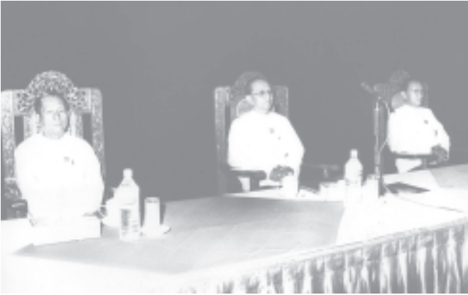
Secretary-1 Lt-Gen Thein Sein and members of panel chairmen preside over the Myanmar War Veterans Organization Conference (2005).