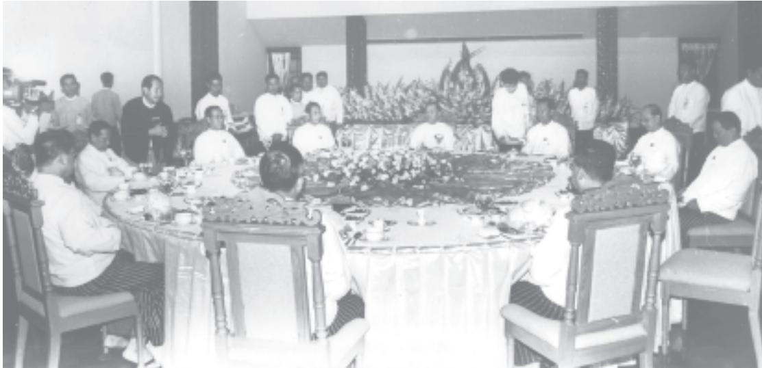
Senior General Than Shwe attends the dinner hosted to the delegates to MWVO Conference 2005.

Before the dinner, Myanma Athan modern music troupe entertained those present. During the dinner, artistes of Fine Arts Department presented variety songs to the audience. After the dinner, artistes of Fine Arts Department presented dances to the delegates at Thabin Hall.—MNA