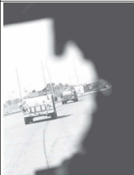
A US convoy of armoured vehicles patrols the heavily fortified Green Zone in central Baghdad on 28 June, 2005.