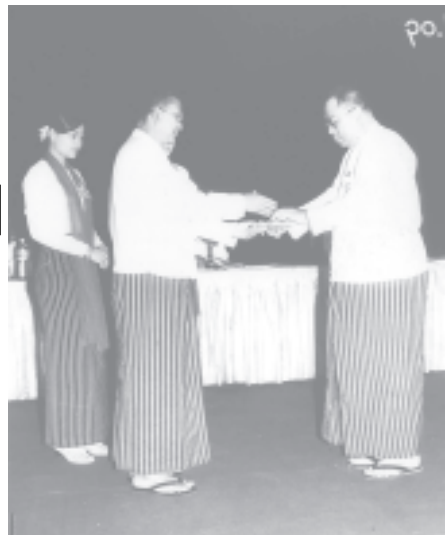
Vice-Admiral Kyi Min (Retd) presents cash assistance to a state/division WVO representative.

In 1974, the constitution based on single party system was ratified. But the agro-based economy of the system failed to fulfill the needs of the growing population. During the time, some