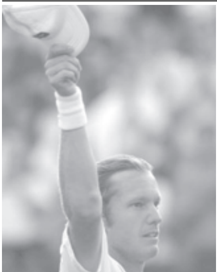
Sweden's Thomas Johansson waves to the crowd after defeating Argentina's David Nalbandian during their men's singles quarter-final match at the Wimbledon tennis championships in London, on 29 June, 2005. Johansson won the game 7-6 6-2 6-2.

Real is not the only European club who are seeking for Robinho. England's Arsenal and Italy's Juventus are also interested. — MNA/Xinhua