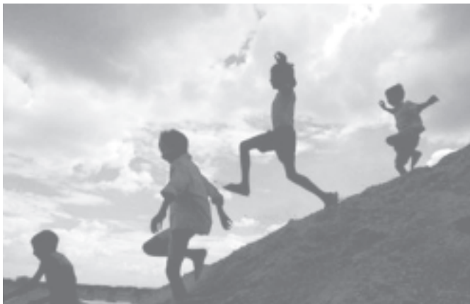
Children play as monsoon clouds hover in the sky, at Peepal village, in the northern Indian state of Uttar Pradesh, on 29 June, 2005. India's monsoon season begins in June and continues through September.