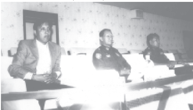
Minister Brig-Gen Thura Aye Myint watches Myanmar-Canada women's friendly football match.

The second friendly match is to be played on 2 July afternoon. MNA