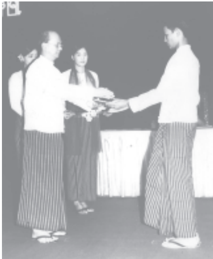
Secretary-1 Lt-Gen Thein Sein presents gift to an outstanding child student of a MWVO member.

In 1974, the constitution based on single party system was ratified. But the agro-based economy of the system failed to fulfill the needs of the growing population. During the time, some neighboring nations were able to set up the industrial economic system and gained rapid progress. Myanmar lagged behind in every aspect and in the end an unrest occurred in the nation. Hence, the Tatmadaw had to take over the State duties in 1988. It was not its wish to grab power, but just to discharge the historic duty.