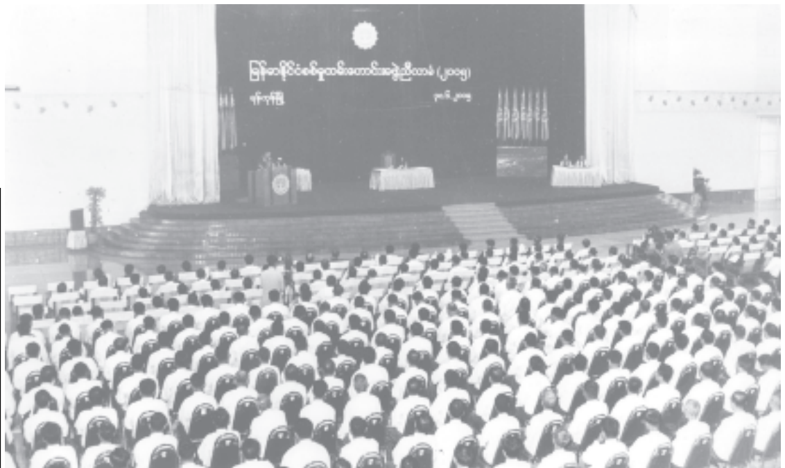
The fourth-day session of Myanmar War Veterans Organization Conference 2005 in progress at Myanmar Convention Centre.

MWVOCOC, departmental heads, presidents and representatives of USDA, MWAF, MWJA, MRCS, Myanmar Auxiliary Fire Brigade and UMFCCI and delegates from the States and Divisions. (See page 5)