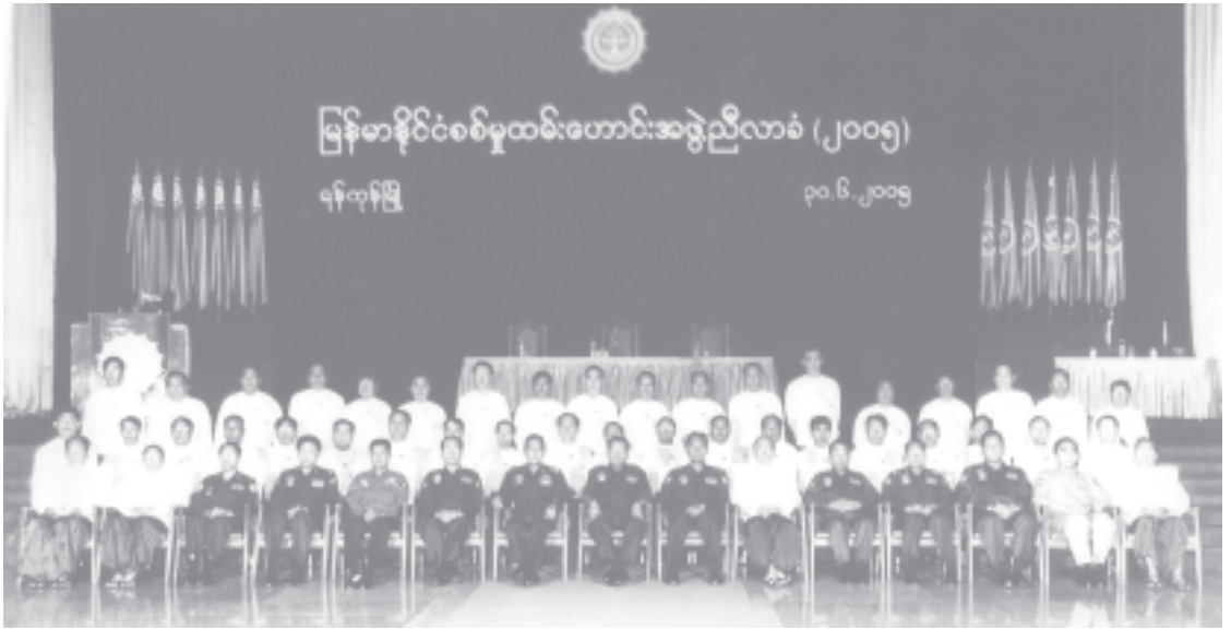
Senior General Than Shwe, members of the panel of patrons and COC members of MWVO pose for documentary photo.

Looking back on the nation's history, it has faced several times the situations in which the nation was on the verge of collapse due to lack of