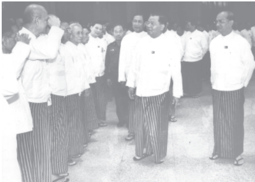
Senior General Than Shwe cordially greets representatives from states and divisions.

The Organization has possessed organizational capability, correct conviction and conceptions, and