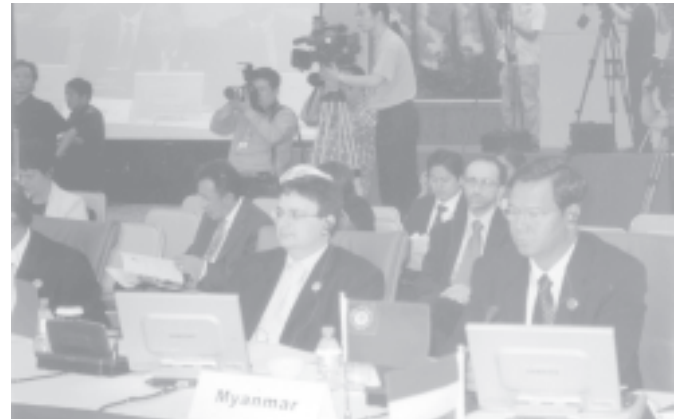
Minister for Finance and Revenue Maj-Gen Hla Tun attending 6th Asia-Europe Financial Ministerial Meeting.