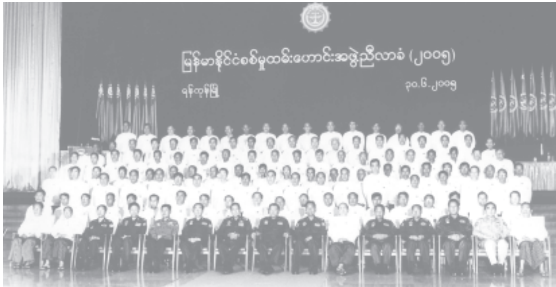
Senior General Than Shwe, members of the panel of patrons and COC members of MWVO pose for documentary photo together with delegates from States and Divisions.

It is also conducting vocational training courses and local and oversea job opportunities for the children of both the members and disabled members for enabling them to repay gratitude to their parents. It reflects that the (See page 9)