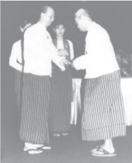
Secretary-1 Lt-Gen Thein Sein presents cash assistance to a war veteran aged above 75.

Patrons of the MWVO Senior General Than Shwe and leaders of