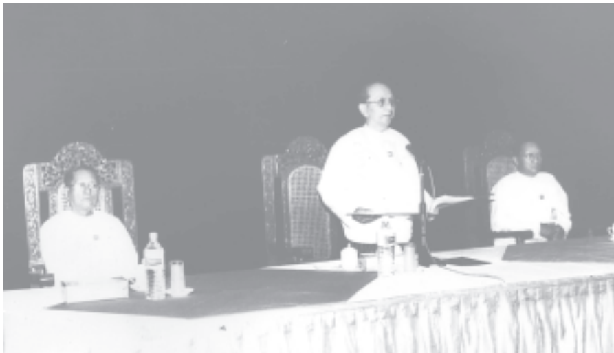
Central Organizing Committee Chairman Secretary-1 Lt-Gen Thein Sein announces approval of resolutions to be passed by the MWVO Conference (2005).