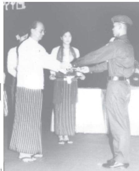
Secretary-1 Lt-Gen Thein Sein presents cash assistance to a child of a war veteran.