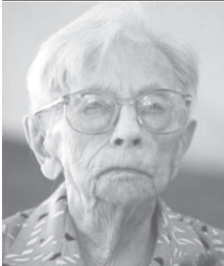
Henny van Andel-Schipper is seen on her 115th birthday in Hoogeveen, the Netherlands, on 29 June, 2005. Van Andel-Schipper has been the oldest person alive in the world since 29 May, 2004.