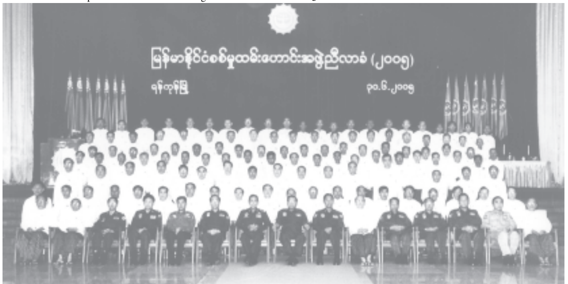
Senior General Than Shwe, members of the panel of patrons and COC members of MWVO pose for documentary photo together with delegates from States and Divisions.

Tatmadaw due to various reasons, but are longing for previous livelihood