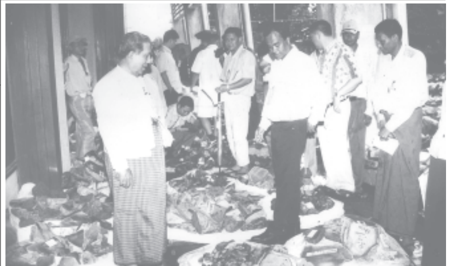
Deputy Minister for Mines U Myint Thein cordially converses with local and foreign gem merchants at Jade and Gems Special Sales 2005. (News reported)

ကျေးရွာတိုင်းကိုယ်အားကိုယ်ကိုးစာကြည့်တိုက်များ ထူထောင်ဖို့၊ ဝိုင်းဝန်းကူညီဆောင်ရွက်ဖို့။ ၂၀၀၅-ခုနှစ်၊ ဇွန်လ (၂၈)ရက်နေ့ထိ နိုင်ငံအဝန်းတွင် ကျေးရွာ ကိုယ်အားကိုယ်ကိုးစာကြည့်တိုက် (၂၀၀၉၃)တိုက် ဖွင့်လှစ်ပြီး ဖြစ်ပါသည်။ ကျေးရွာကိုယ်အားကိုယ်ကိုး စာကြည့်တိုက်များအတွက် သူတစ်ပါး/ရသစာအုပ်များကို ပြန်ကြားရေးနှင့် ပြည်သူ့ဆက်ဆံရေး ဦးစီးဌာန ခရိုင်/ မြို့နယ်ရုံးများသို့၊ လှူဒါန်းနိုင်ပါသည်။ ပြန်ကြားရေးဝန်ကြီးဌာန ပြန်ကြားရေးနှင့် ပြည်သူ့ဆက်ဆံရေးဦးစီးဌာန