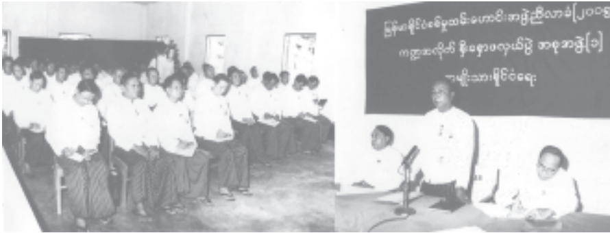
Maj-Gen Khin Aung Myint delivers a speech at seminar on national political sector of the group-1.