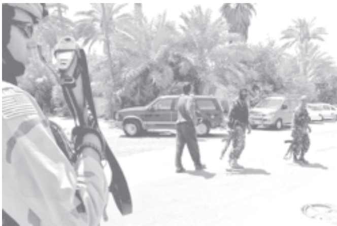
A US soldier secures the area as he looks at Iraqi policemen who were shooting at a suspected car, during a patrol in central Baghdad, on 25 June, 2005.

Kohl paid a visit to China as guest of the China Institute for International Strategic Studies to attend an international symposium on non-traditional security. The two-day symposium, attended by 60 officials, experts and scholars from 17 countries of Asia, Europe, North America and Oceania, concluded here on Thursday.