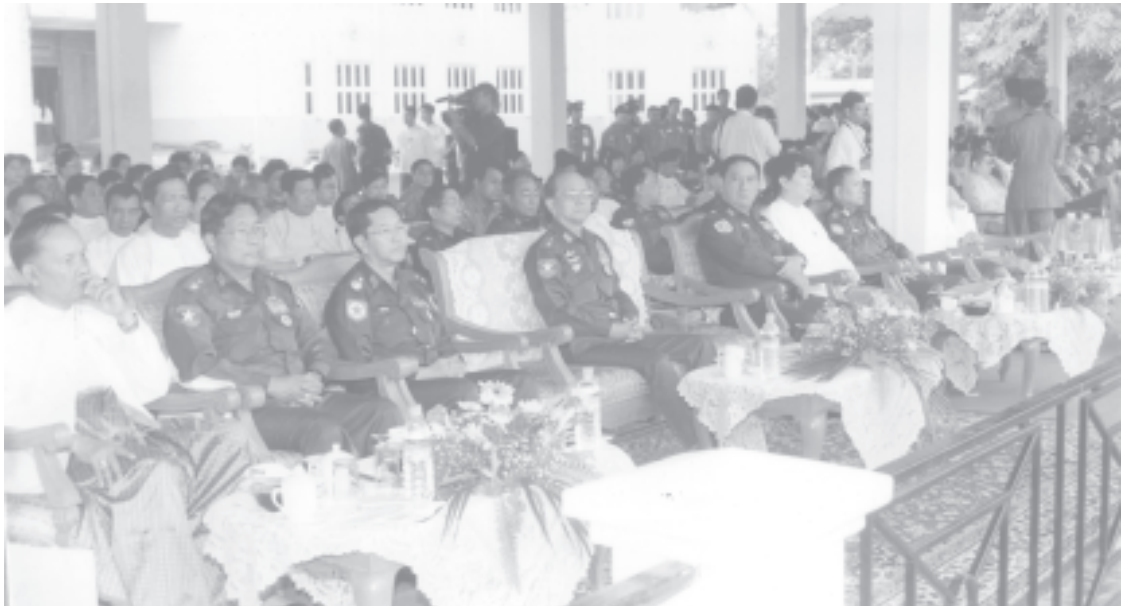
Secretary-1 Lt-Gen Thein Sein attends 19th destruction of seized narcotic drugs.— NLM

The target activities for the first 5-year phase had been successfully achieved and the success can be attributed to the serious commitment of the Government, close monitoring and supervision. Furthermore, the active participation of the regional authorities, local leaders of the national races and the local