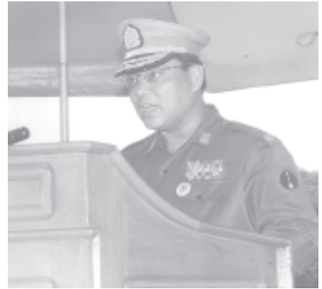
MPF Director-General Brig-Gen Khin Yi.

With a view to enhancing cooperation with neighbouring countries and also with inter-