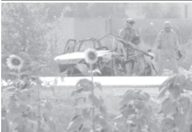
US troops check the scene of a car bomb near a field of sunflowers in Baghdad, Iraq, on 25 June, 2005.