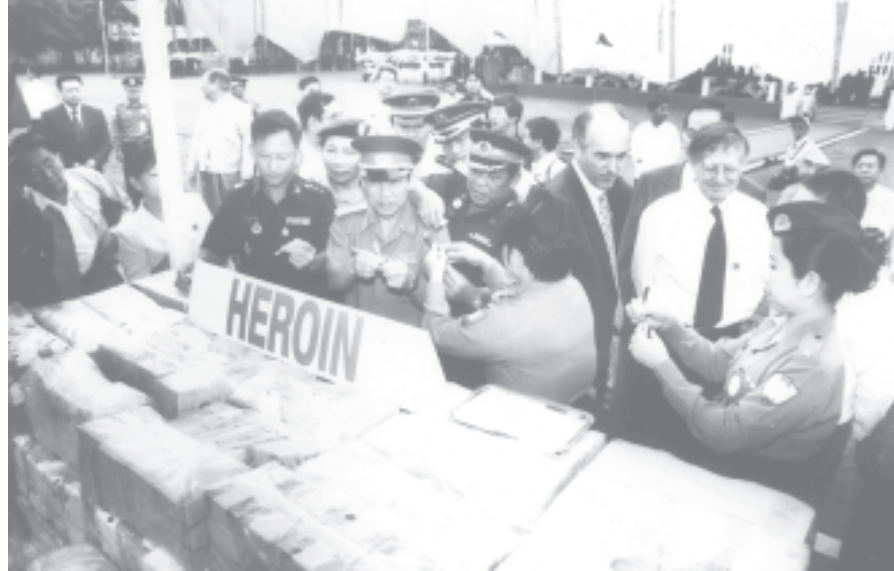
Ambassadors, military attaches, resident representatives and officials of UN agencies test seized drugs to be torched. (News on page 1) — MNA

INSIDE The directly-benefitted tasks include social, religious and cultural undertakings, greening tasks, urban and rural beautifying tasks, sanitation tasks, and health and educative tasks. (Page 5) AYE MYO KYI