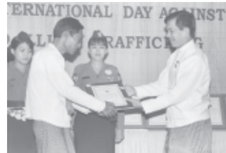
Minister U Nyan Win presents a certificate of honour to a first prize winner.