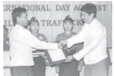
Minister Dr Kyaw Myint presents a certificate of honour to a first prize winner.