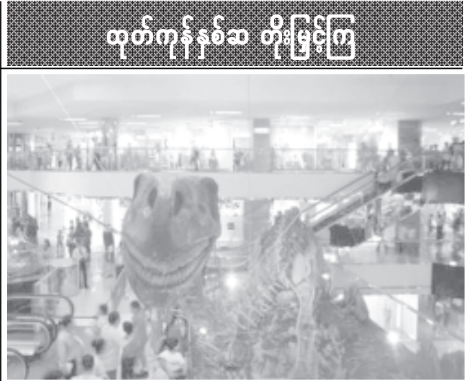
Fossils of a Mamenchisaurus Constructus , measuring 13 metres (43 feet) long and seven metres (23 feet) high, which lived around the late-Jurassic period, is lid up and displayed at the Cityplaza shopping mall in Hong Kong on 24 June, 2005.