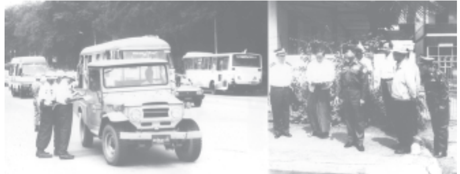
Chairman of Dry Day Supervisory Committee Minister for Mines Brig-Gen Ohn Myint and members supervise dry day inspection teams.

YANGON, 26 June — Chairman of Dry Day Supervisory Committee Minister for Mines Brig-Gen Ohn Myint together with Committee Members Deputy Minister for Construction U Tint Swe, military officers and departmental heads, supervised the dry day inspections at the main points of the city this morning.