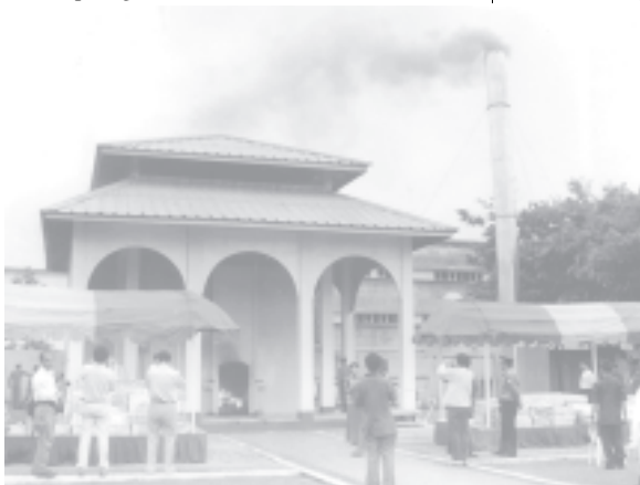
Minister Maj-Gen Maung Oo and Chinese Ambassador Mr Li Jinjun press a button to incinerate the seized drugs.