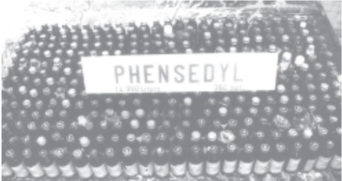
Phensedyl syrup bottles seen before the incineration ceremony.