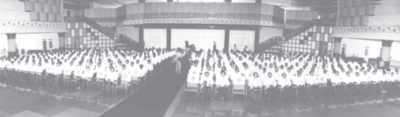
Vice-Admiral Kyi Min (Retd) makes an address at the coordination meeting for holding MWVO Conference-2005 at Myanmar Convention Centre in Mayangon Township.

* 'Ice', was first seized in 2001. * 'Ice' seizures were made by 2005 for a total of 1,315 kilos. * Another form of stimulant 'Ecstasy', which is popularly known as 'head-shaking pills', was also seized since 2001. * Altogether 4 seizures were made by 2005 amounting to a total of 355 tablets.