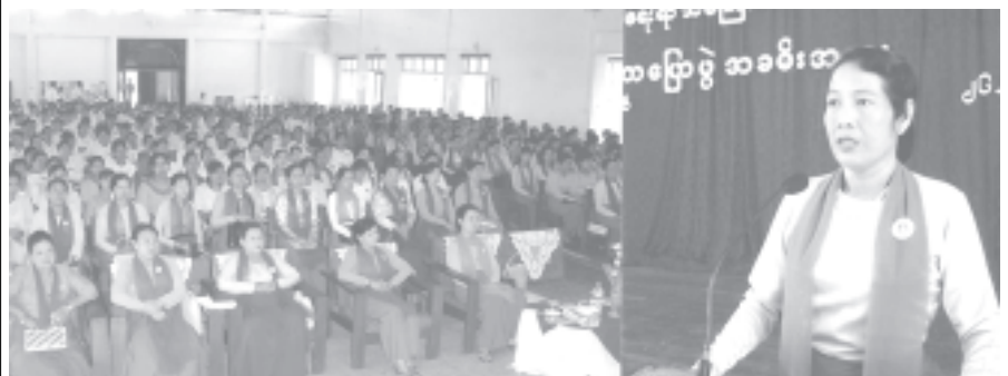
Talks on Myanmar Women's Day in progress at Dagon Myothit (North) Township. — WOMEN'S AFFAIRS

STRIVE TOGETHER FOR THE ADVANCEMENT OF WOMEN