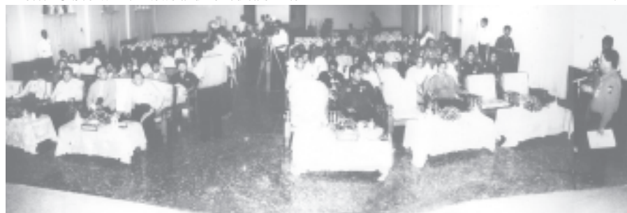
Police Col Kham Aung clarifies on drug elimination endeavours of CCDAC at the press conference.