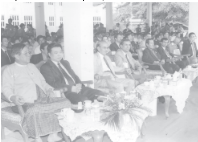
Diplomats of foreign missions in Yangon attending 19th destruction ceremony of seized narcotic drugs.

The Opium Yield Survey conducted annually in collaboration with the US has also shown a potential production of 292 tons in 2004, a drastic decline of 88% if compared to 1996 levels. Cultivation also declined 81 % for the same period.