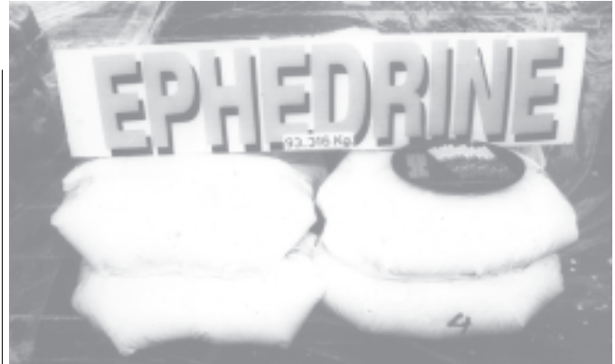
Packets of Ephedrine seen at the destruction ceremony of seized narcotic drugs.

zure of ATS occurred in 1996 in Myanmar and an increasing trend in the seizure amount is noticed. To cite some figures, 2001 was a record setting year for seizure of