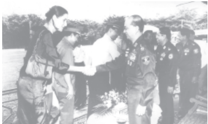
Secretary-1 Lt-Gen Thein Sein cordially greets diplomats at 19th destruction ceremony of seized narcotic drugs.

people was also a crucial contributing factor.