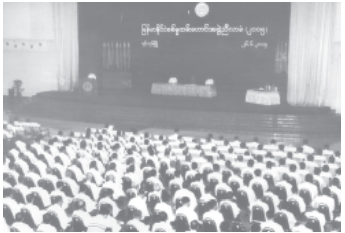
The coordination meeting for MWVO Conference 2005 in progress at Myanmar Convention Centre.— MNA

After that, the MWVO Conference 2001 was held from 1 to 5 June 2001 successfully and the conference adopted seven future tasks. WVOs at dif-