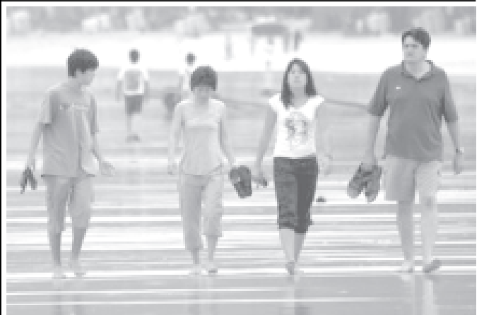
Tourists walk along Patong Beach on 25 June, 2005, in Patong, Thailand.