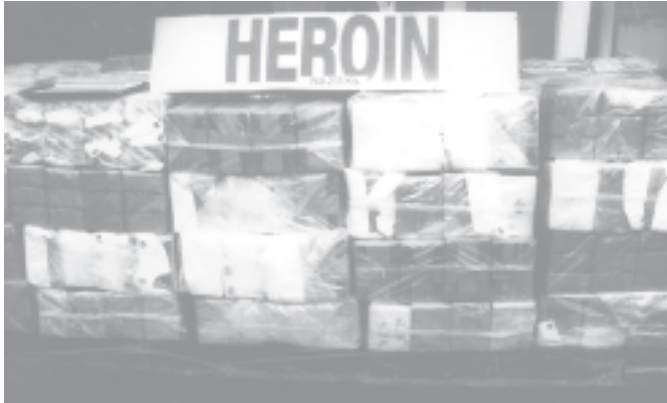
Packets of heroin seen at 19th destruction ceremony of seized narcotic drugs.