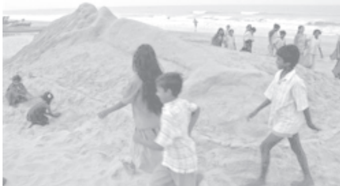
Children and residents of Akkaraipettai look at a sand sculpture of a mermaid, made on Friday by young students from a nearby town, on the seashore at Nagappattinam, India, on 25 June, 2005.

They compared the benefits of producing hydrogen by steam reforming of natural gas, wind-electrolysis and coal gasification, and found most of HFCVs' benefits arose from eliminating current vehicle exhaust. An all-HFCV fleet would hardly affect tropospheric water vapour concentrations, the researchers said. Conversion to coal HFCVs may improve health but would damage climate more than fossil/electric hybrids. — MNA/Xinhua