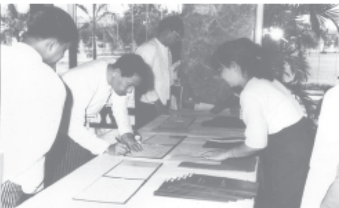
Delegates to MWVO Conference sign in the register book.

Government, is making all-out efforts for emergence of a peaceful, modern, developed and discipline-flourishing democratic nation. In doing so, the Government has laid down Our Three Main National Causes as national policy — non-disintegration of the Union, non-disintegration of national solidarity and perpetuation of sovereignty — and has adopted and is implementing 12 objectives all-round development in political, economic and social sectors of the State.