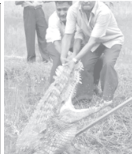
Zoo workers pull a crocodile for release into the water at Mirpur zoo in Dhaka, Bangladesh, on 25 June, 2005. Five rare fresh water crocodiles from India, destined for a breeding programme, arrived on Saturday, a zoo official said.