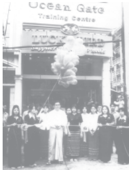
MD U Htin Aung Khine formally opens Ocean Gate computer showroom and service centre.