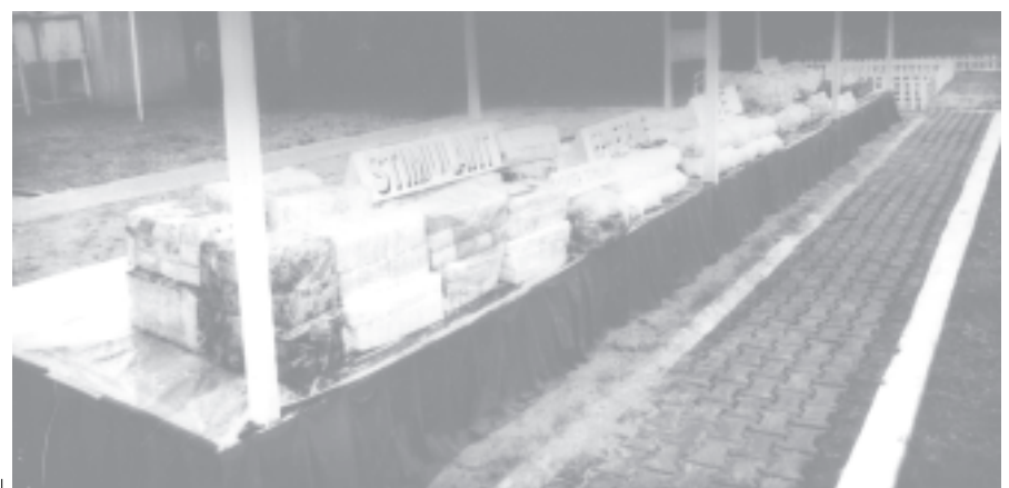
Packets of stimulant, Ephedrine and narcotic drugs.

We are aware that the neighbouring countries are also seriously taking preventive measures to control and stop