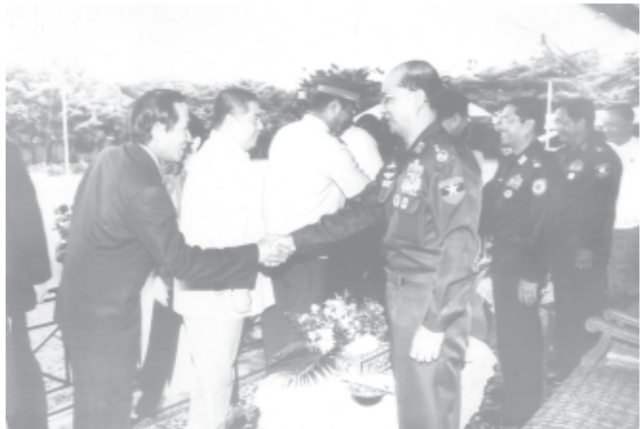
Secretary-1 Lt-Gen Thein Sein greets a diplomat at the Ceremony of the Destruction of Seized Drugs.

Today, the 26th of June, is the International Day against Drug Abuse and Illicit Trafficking. Ceremonies to mark this day are being held in countries all over the world and also in Myanmar. Every year on this day, Myanmar holds a ceremony to commemorate this day by burning and destroying drugs seized as a result of the efforts to eliminate drugs in the country. Myanmar has conducted ceremonies of burning drugs in this manner and has now reached the 19th year. These ceremonies are being conducted not only in Yangon but also in border areas of Myanmar and other townships, and the total number of burning seized drugs has now reached 34 times.