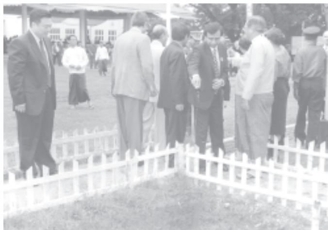
Diplomats of foreign missions in Yangon pour down Phensedyl syrup at 19th destruction ceremony of seized narcotic drugs.