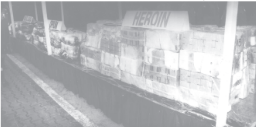
Packets of heroin seen on the dais for incineration.

ATS; in that year more than 32 million of ATS tablets were seized. In terms of the proportion of townships where ATS seizures were recorded, ATS seizures were made in 100 townships out of the 383 townships in the whole of Myanmar representing over 26.1 % of the townships in Myanmar.