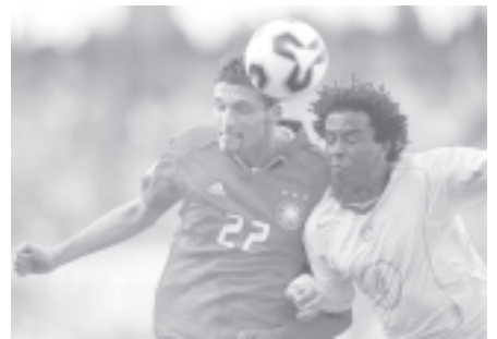
Germany's Kevin Kuranyi, left, and Brazil's Roque Junior battle for the ball during the Confederations Cup semi final between Germany and Brazil in Nuremberg, Germany, on 25 June, 2005. Brazil won the match 3-2.

The hosts fought back immediately as Podolski header home a Fabian Ernst's cross to level the score. The goals brought the game to life and the Brazilian team took the initiative. They created several chances, forcing Lehmann to put up superb saves.