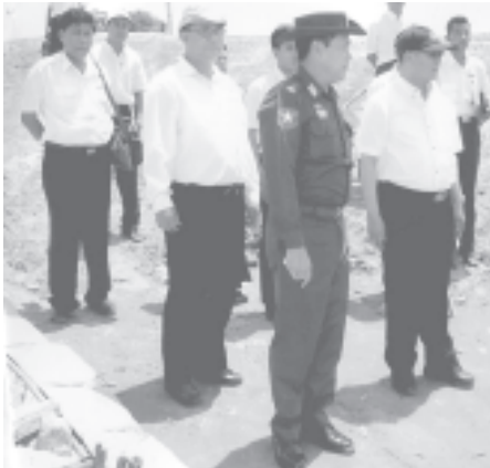
Minister Maj-Gen Thein Swe looks into tasks to maintain the natural gas pipeline crossing Ayeyawady River between Kwayma and Seiktha banks. — TRANSPORT

Emergence of the State Constitution is the duty of all citizens of Myanmar Naing-Ngan.