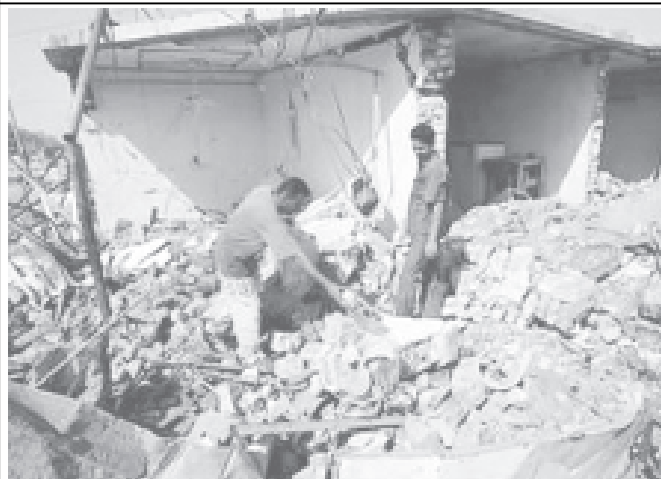
Iraqis salvage items from a shop wrecked in an attack by guerillas in the southwestern Al-Bayaa District of Baghdad on 20 June, 2005. — INTERNET

The AP count is two higher than the Defence Department's tally, last updated at 10 am EDT Tuesday. The British military has reported 89 deaths; Italy, 25; Ukraine, 18; Poland, 17; Spain, 11; Bulgaria, 12; Slovakia, three; Estonia, Thailand and the Netherlands, two each; and Denmark, El Salvador, Hungary, Kazakhstan and Latvia one death each. Since 1 May, 2003, when President Bush declared that major combat operations in Iraq had ended, 1,585 US military members have died, according to AP's count. That includes at least 1,210 deaths resulting from hostile action, according to the military's numbers. Since the start of US military operations in Iraq, 13,074 US servicemembers have been wounded, according to a Defence Department tally released Tuesday.— Internet