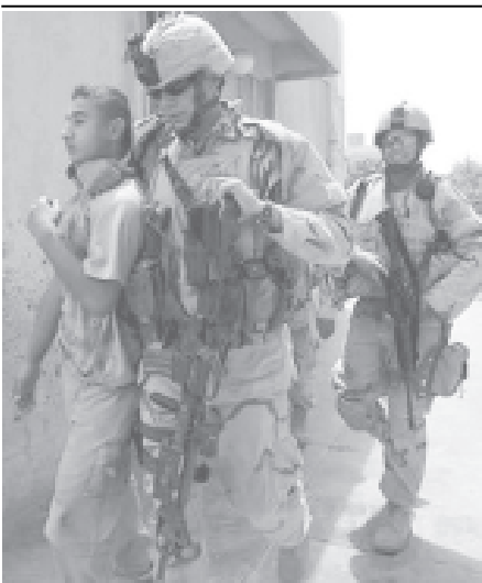
US soldiers from the 3rd Infantry Division arrest an Iraqi youth during a patrol in Baghdad on 21 June, 2005.