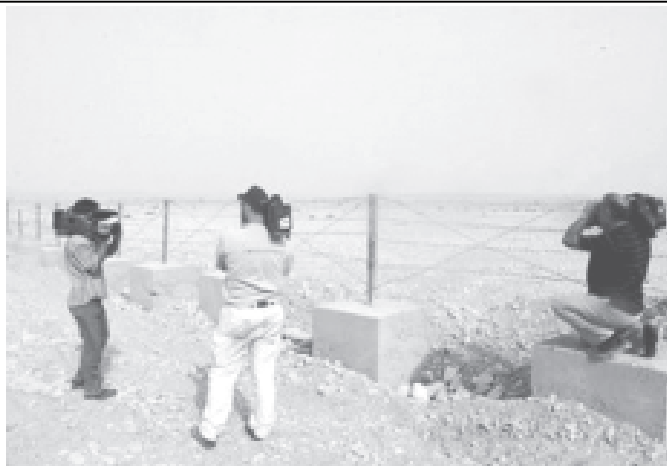
Syrian journalists on 20 June, 2005, make TV images of the fence built by Syrian border soldiers near Badiyah on the border between Syria and Iraq to prevent militants from infiltrating from Syria into Iraq to fight the US-led coalition forces.