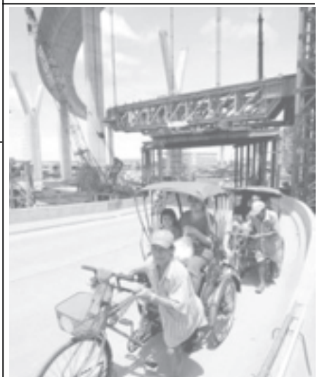
Two pedicab drivers pull their vehicles loaded with passengers past an under construction site of a new bridge in Samut Prakarn Province, central Thailand, on 21 June, 2005.