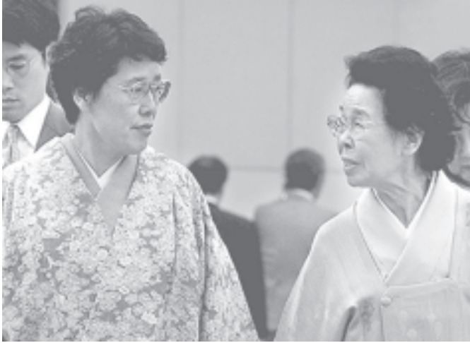
Elderly Japanese women in Tokyo. Japan's aging population and declining birthrate have been blamed for a new casualty: a university has filed for bankruptcy protection because it can no longer find enough students.