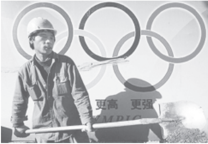
Chinese construction worker near an Olympic sign in Beijing, on 21 June 2005. China's plans for the opening and closing ceremonies of the 2008 Olympics will begin to take shape later this year while tickets for the world's largest sporting event will start going on sale in 2006, state media said.