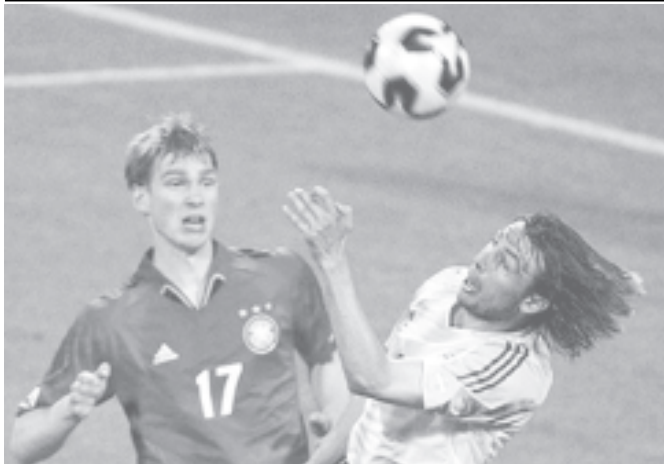
Germany midfielder Lucas Bernardi(L) vies with Argentina's Juan Pablo Sorin during their 2005 FIFA Confederations Cup clash in Nuremberg.