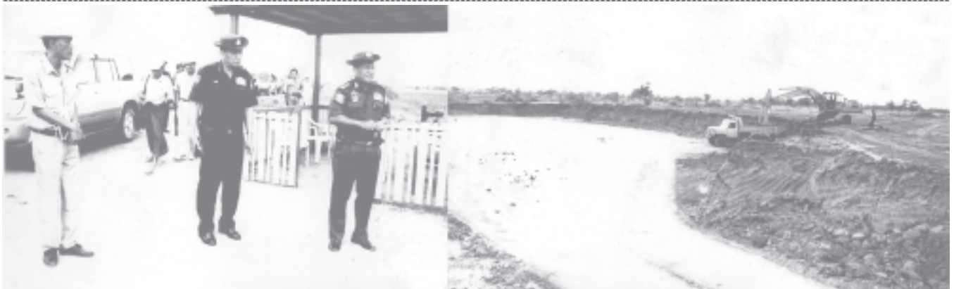
Lt-Gen Ye Myint checks digging of main canal of river water pumping project in Meiktila plain near Wundwin, Meiktila District. — MNA

YANGON, 22 June — Member of the State Peace and Development Council Lt-Gen Ye Myint of the Ministry of Defence discussed with officials in Meiktila on 20 June the greening of Meiktila plain.