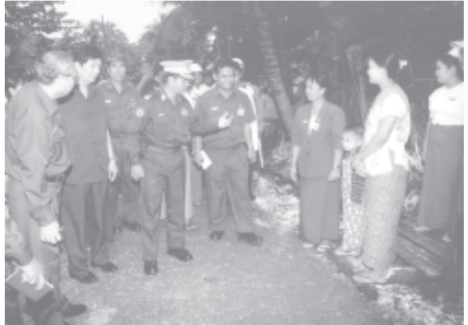
Commander Maj-Gen Myint Swe and Health Minister Dr Kyaw Myint view mass campaign on DHF prevention, encourage town dwellers in Thakayta Township.

YANGON, 22 June—Mass campaign on prevention and control of Dengue Haemorrhagic Fever-DHF co-organized by the Ministry of Health and Yangon City Development Committee was launched today in Thakayta Township in Yangon East District.