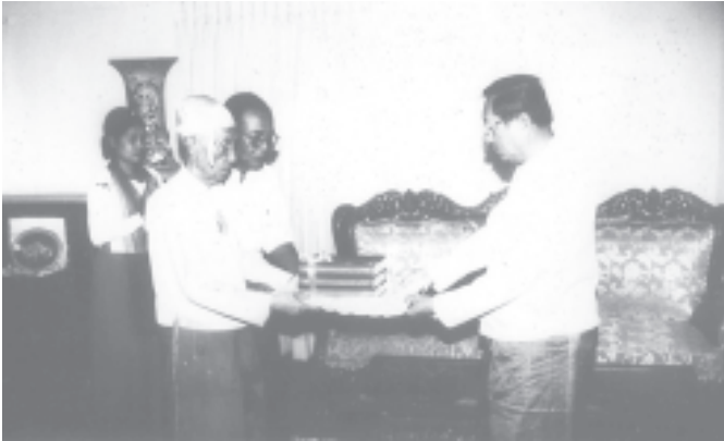
Minister Brig-Gen Thura Myint Maung receives copies of religious treatises donated by wellwishers.