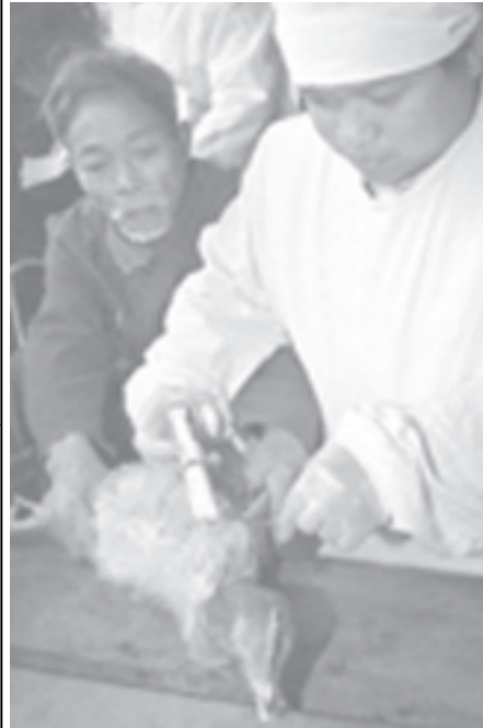
A Chinese farmer watches as his chicken is tested for the bird flu virus in January, 2004. China denied it encouraged farmers to use a drug meant for humans to stop the spread of bird flu in poultry which could render the medicine useless, but said it would investigate.