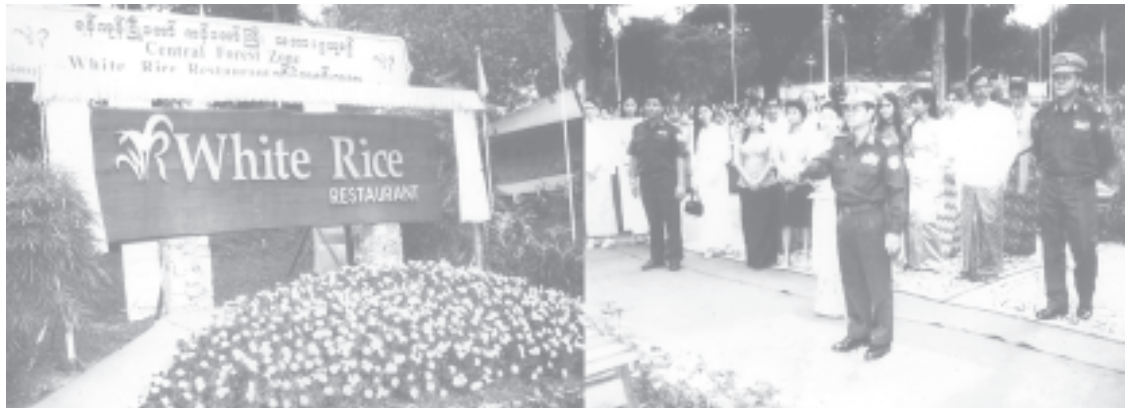
Commander Maj-Gen Myint Swe unveils signboard of Rice Restaurant at Yangon City Kandawgyi Gardens.

Present were Chairman of the Upgrading Work Committee for Construction of the Gardens Chairman of Yangon Division Peace and Development Council Commander of Yangon Command Maj-Gen Myint Swe, Minister for Hotels and Tourism Brig-Gen Thein Zaw, Deputy Minister for Hotels and Tourism Brig-Gen Aye Myint Kyu, Secretary of the Work Committee Commander of No 4 Military