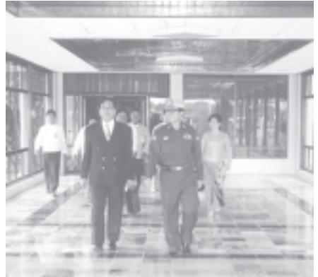
Minister for Rail Transportation Maj-Gen Aung Min sees off Deputy Minister for Rail Transportation Thura U Thuang Lwin at the airport. — RAILWAYS

The deputy minister was seen off at Yangon International Airport by Minister for Rail Transportation Maj-Gen Aung Min, directors-general, managing directors and officials of the departments and enterprises. — MNA