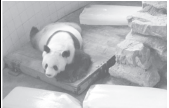
A giant panda lies beside ice blocks to cool itself down at the Hongshan Zoo in Nanjing, capital of east China's Jiangsu Province, on 20 June, 2005.

The highest temperature stood at 35 degrees Celsius (95 F) in Nanjing on Monday.