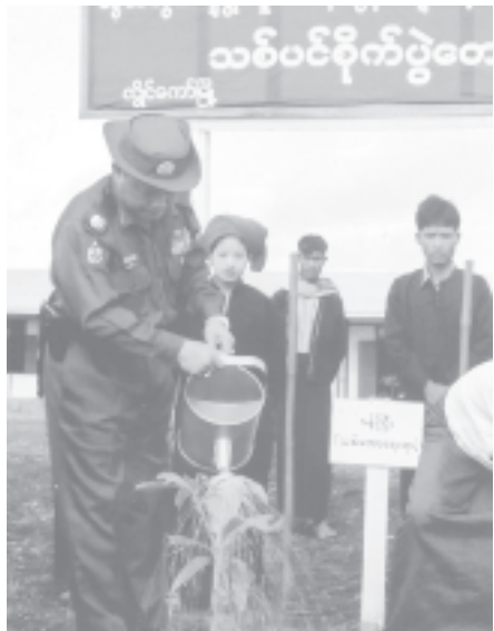
CEC member Brig-Gen Thein Aung plants a tree at Lwehtwe Village BEPS in Loikaw Township.

The CEC member inspected the monastery under construction and explained about the government's rural development tasks to the villagers. The minister and party attended a ceremony to