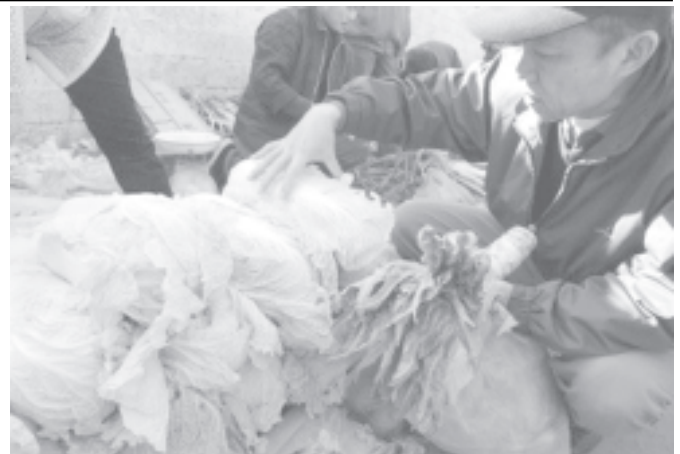
A man shops for cabbage in Beijing, China, on 21 June, 2005. South Korean baseball authorities have banned players from using frozen cabbage leaves under their caps to cool down in the summer heat. — INTERNET