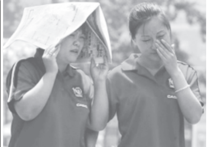
Chinese women react to the heat on the streets of Beijing, China, on Tuesday, 21 June, 2005. Temperatures in the Chinese capital is expected to hit 38-39 degrees Celsius (100-102 F) as the city experiences its longest day of the year.