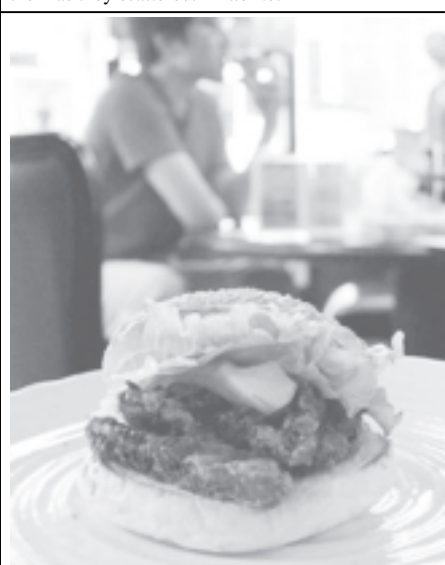
Whale meat hamburger is unveiled during a sampling of the new menu at local hamburger chain Lucky Pierrot in the northern Japanese city of Hakodate, one of ex-whaling port cities in Hokkaido, on Monday, 20 June, 2005.