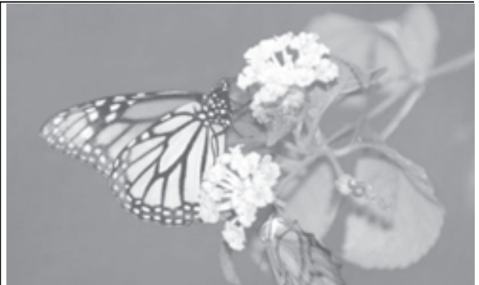
A monarch butterfly ( Danaus plexippus ) is seen on a flower at the butterfly garden of the Metropolitan Zoo and Botanical Garden in Budapest, Friday, on 17 June, 2005. There are about 500 specimens of 56 species in the garden that are seen during the summer time. —INTERNET