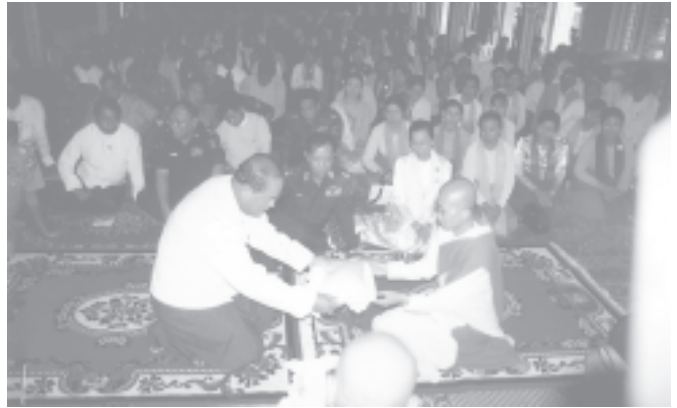
Minister Brig-Gen Thein Zaw offers provisions to the nunnery.

The commander and the minister made speeches and presented cash for the construction of the school building to