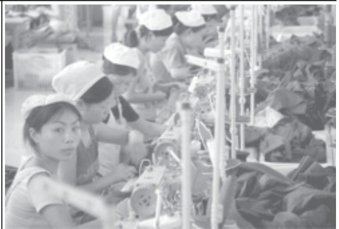
Chinese workers sew dresses that will be exported to Europe at a garment company in Huaibei in eastern China’s Anhui province on 20 June, 2005.