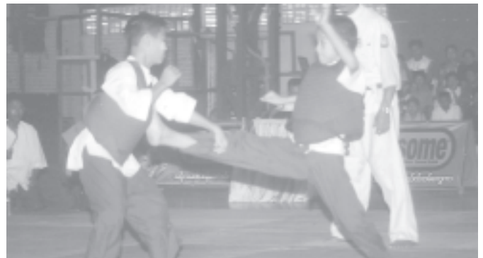
Participants compete in the martial arts contest hailing 2005 Olympic Day at the Gymnasium of Dagon Myothit (North) on 21 June.