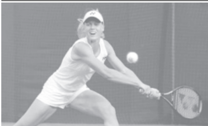
Russia's Elena Dementieva returns the ball to Iveta Benesova of the Czech Republic in their first round women's singles match at the Wimbledon tennis championships in London, June 20, 2005.

Apart from a new skiing ground, Changchun has built the biggest speed skating rink in the country, and refurbished seven stadiums to be appraised by the Olympic Council of Asia by the end of the year, said the vice mayor.—MNA/Xinhua