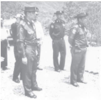
Lt-Gen Ye Myint inspecting the diversion tunnel linking Taungye Dam and Kyatmauktaung Dam. — MNA

Nyaunggon Dam will supply 10,000 acre ft of surplus water from Chaungkauk Dam in Pyawbwe Township and 9,000 acre ft from Lunnin and Latkokpin dams to Meiktila Lake. Lt-Gen Ye Myint and party left Nyaunggon Dam and arrived at Meiktila in the evening. — MNA