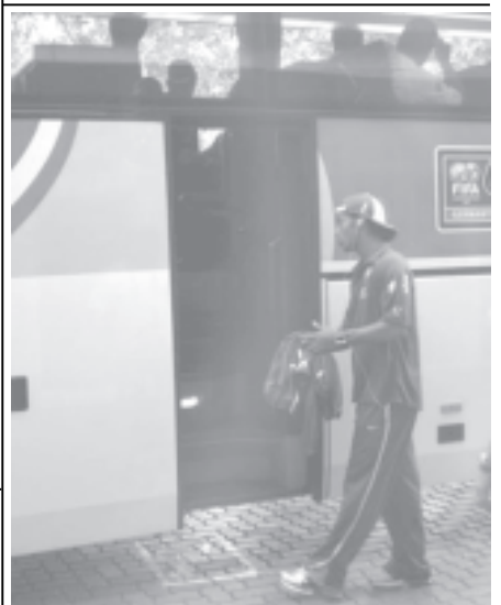
Brazilian striker Ronaldinho walks to the team bus before departing from Hanover, Germany, June 20, 2005. Brazil lost to Mexico 1-0 Sunday and have to win their next match against Japan to advance to the semifinals of the Confederations Cup.