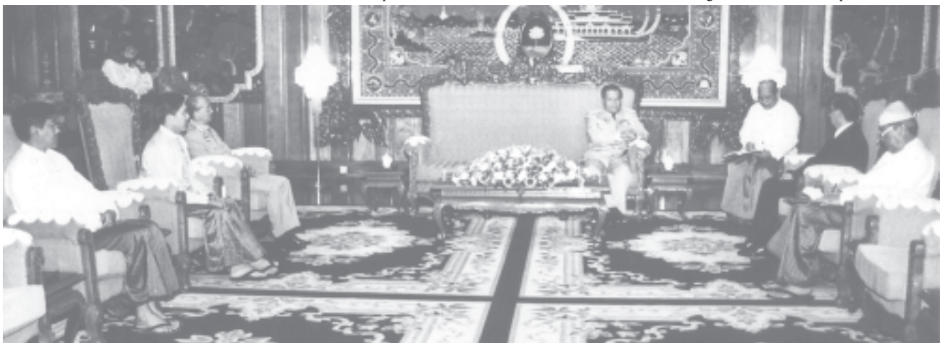
Senior General Than Shwe receives Syrian Ambassador Mr Fahd Salim. — MNA

Development Council Secretary-1 Lt-Gen Thein Sein, Minister for Foreign Affairs U Nyan Win, Deputy Minister for Foreign Affairs U Kyaw Thu and Director-General Thura U Aung Htet of the Protocol Department. — MNA