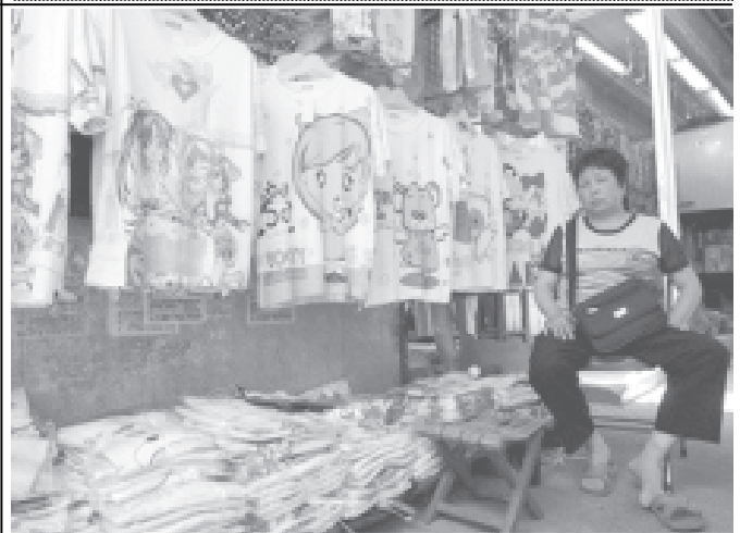
A vendor sits beside T-shirts for sale at a clothing wholesale market in Shanghai on 20 June. — INTERNET