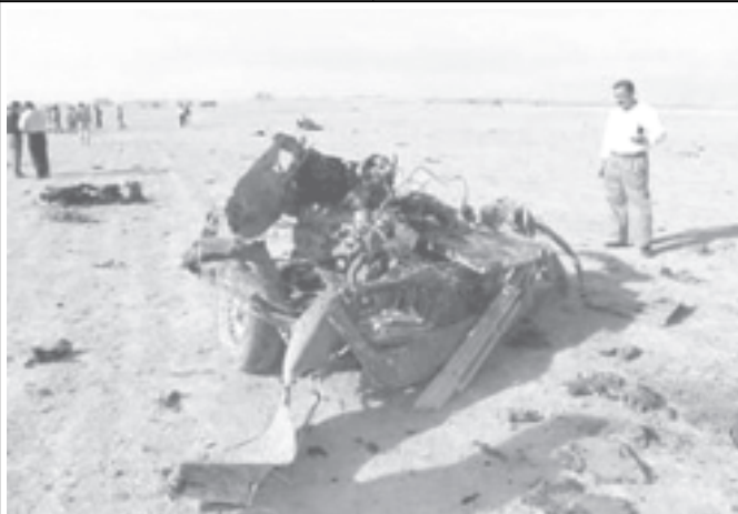
An Iraqi investigator looks at the remnants of a suicide car bomb which was driven into a crowd of traffic police recruits in the northern Iraqi city of Arbil, on 20 June, 2005. — INTERNET

It said 198.06-kilometre border was fenced in the phase I while that for 201 kilometres sanctioned in the second phase. — MNA/PTI