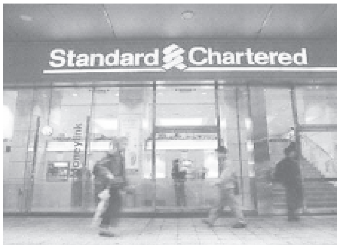
People walk past a Standard Chartered Bank branch in Hong Kong. The British-based emerging markets bank has acquired a stake in Asia Commercial Bank.