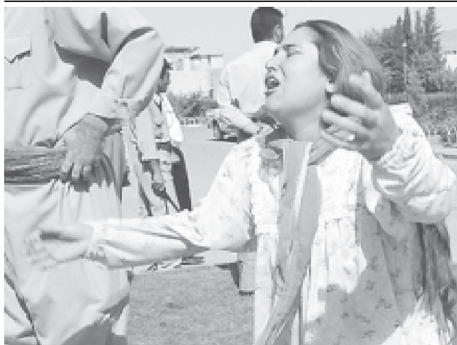
A Kurdish woman cries outside at a local hospital in the Kurdish city of Arbil in northern Iraq, on 20 June. — INTERNET

Recently, Vietnam's Preventive Medicine Department confirmed 55 infection cases, including 18 fatality ones, between mid-December 2004 and early June 2005. Since then, 9 more local people have been detected to have contracted the disease. — MNA/Xinhua