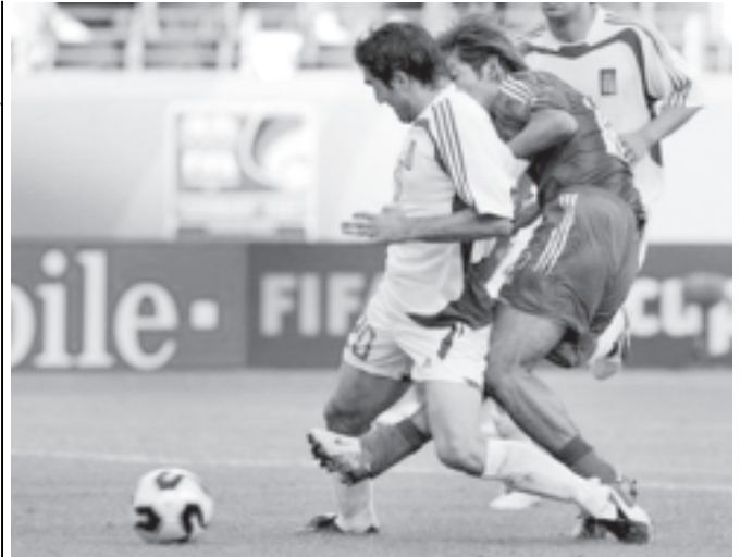
Japan's Masashi Oguro, right, gets his foot between the legs of Georgios Karagounis of Greece to score the opening goal during the Confederations Cup Group B soccer match between Greece and Japan in Frankfurt, Germany, on 19 June, 2005. Japan won the match 1-0.

Togo now leads Group One with 17 points from eight games, followed by Zambia with 16 points from eight games.—MNA/Xinhua