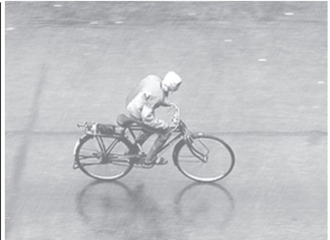
A cyclist rides during an early morning pre-monsoon shower in Mumbai recently.