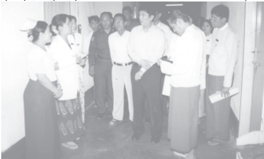
Minister for Health Dr Kyaw Myint at Mawlamyinegyun Township People's Hospital in Ayeyawady Division. — HEALTH

Emergence of the State Constitution is the duty of all citizens of Myanmar Naing-Ngan.