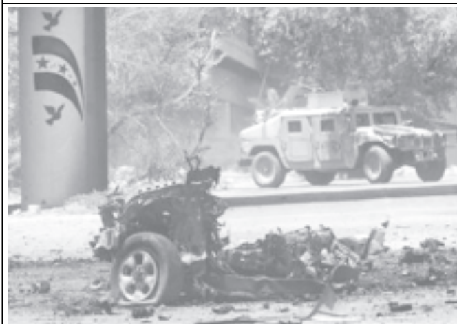
A US humvee drives past the remains of a vehicle after a suicide car bomb attack in Baghdad, Iraq on 18 June, 2005. — INTERNET

The British military has reported 89 deaths; Italy, 25; Ukraine, 18; Poland, 17; Spain, 11; Bulgaria, 12; Slovakia, three; Estonia, Thailand and the Netherlands, two each; and Denmark, El Salvador, Hungary, Kazakhstan and Latvia one death each. Since 1 May, 2003, when President Bush declared that major combat operations in Iraq had ended, 1,581 US military members have died, according to AP's count. That includes at least 1,214 deaths resulting from hostile action, according to the military's numbers.—Internet