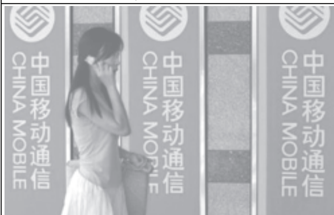
A Chinese woman talks on her mobile as she walks past China Mobile posters in Beijing, on 20 June, 2005. — INTERNET

She called on the people not to panic when aftershocks often jolted the city. “It is feared traffic accidents will happen if they panic,” Eridawaty added. — MNA/Xinhua