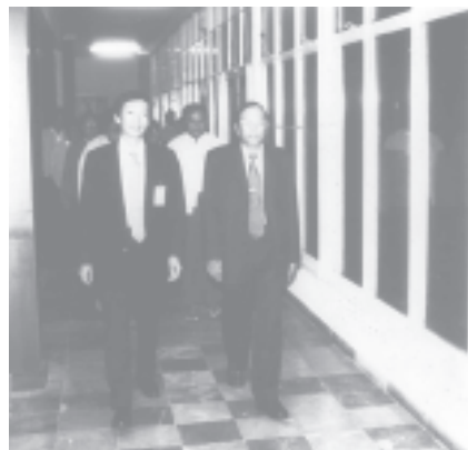
Deputy Minister Dr Mya Oo being seen off at the airport.

YANGON, 20 June — Deputy Minister for Health Dr Mya Oo left here by air yesterday evening to attend United Nations Millennium Development Goals Seminar for the countries of Asia-Pacific region which will be held in Tokyo, Japan on 21-22 June. The Deputy Minister was accompanied by