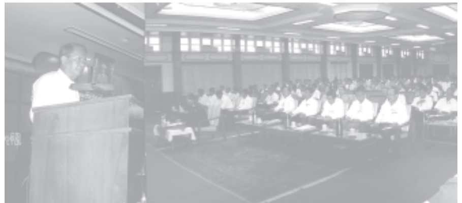
Minister U Aung Thuang delivers an address at English proficiency course 1/2005 and basic electrical course 1/2005.—MNA

YANGON, 20 June — Ministry of Industry-1 opened English proficiency course 1/2005 and basic electrical course 1/2005 at its training hall this morning.