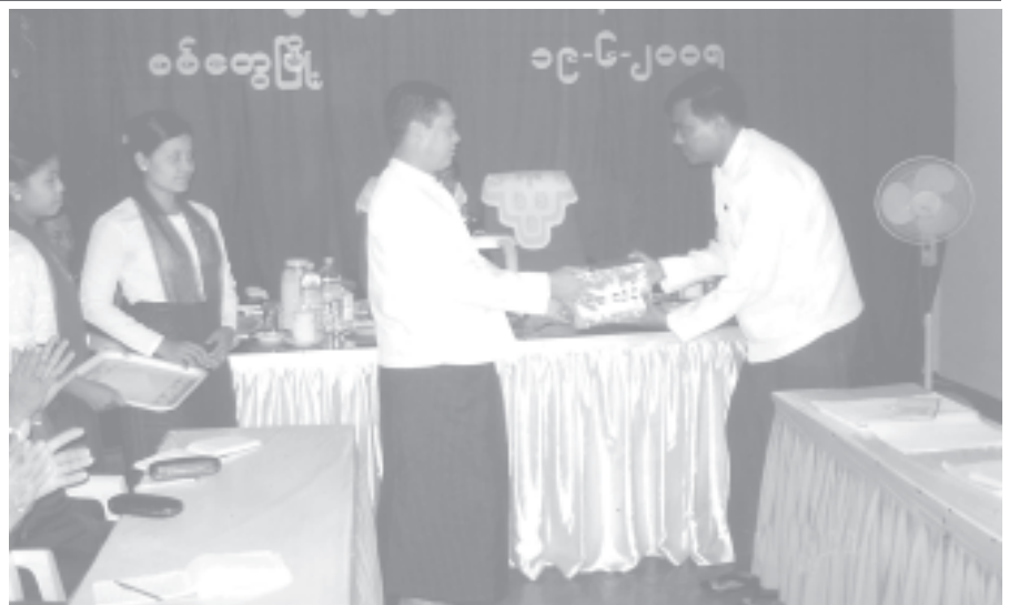
Minister Maj-Gen Thein Swe presents K 1 million to Rakhine State USDA. — TRANSPORT

Next, CEC member Maj-Gen Thein Swe delivered a speech, stressing the need for active cooperation of the association in the successful implementation of the five-year short-term plan, five (See page 8)