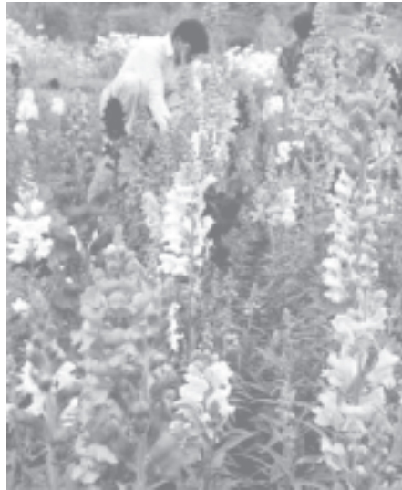
A Kashmiri gardener works on a Pansies mixed flower bed in Srinagar on 17 June, 2005. — INTERNET