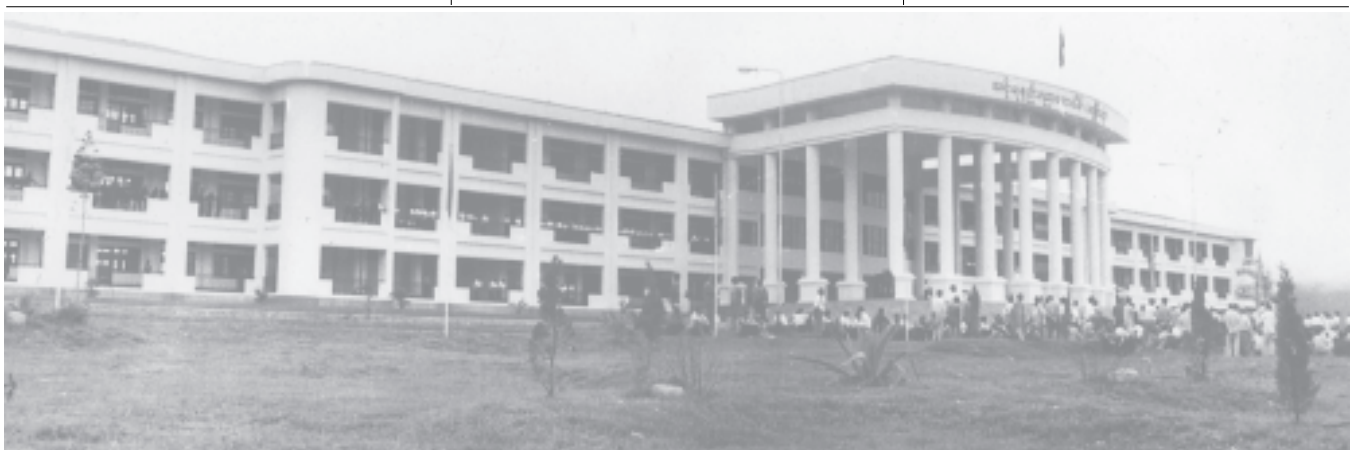
Main building of Government Technological College (Kengtung) —MNA

It was also attended by officials concerned of the Ministry of Sports. The Minister and Ambassador exchanged views on sports between the two countries.—MNA