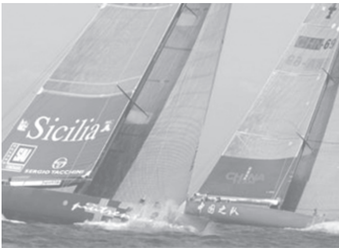
Challenger Team +39 from Italy on ITA 59, left, fights China Team on CHN 69 during the first match race on the third day of the Louis Vuitton Act 4, which is counting for the 32nd America's Cup in Valencia, Spain, on 18 June, 2005.