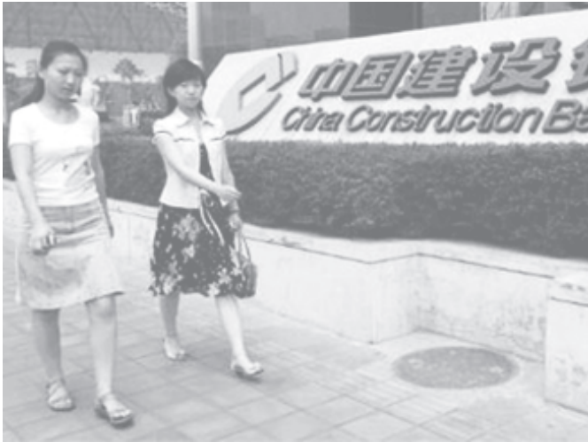
Chinese women walk past the headquarters of China Construction Bank in Beijing, China on 17 June, 2005.