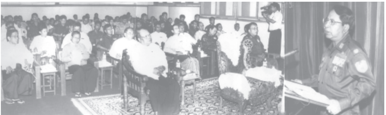
Information Minister Brig-Gen Kyaw Hsan delivers an address at the refresher course No 1 2005 on film production and projecting.

conducted with the objectives of promoting the trainees' work proficiency, uplifting mental qualifications of the trainees, carrying out the functions of Myanmar Motion Picture Enterprise and operating the equipment with skill. He highlighted that the trainees are to (See page 9)