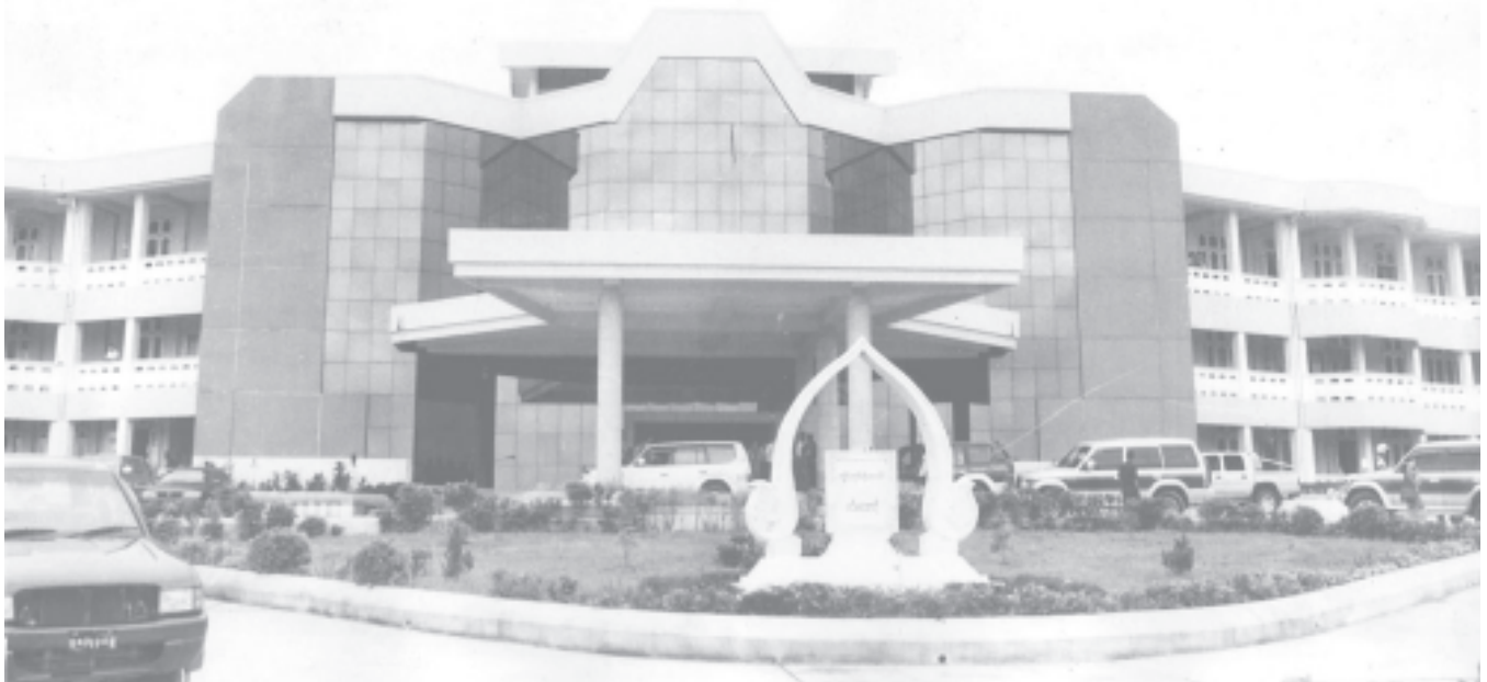
Newly-opened main building of Kengtung Degree College.— MNA

Kaunda also called on mine unions to participate more effectively since they were part and parcel of the mining industry. — MNA/Xinhua