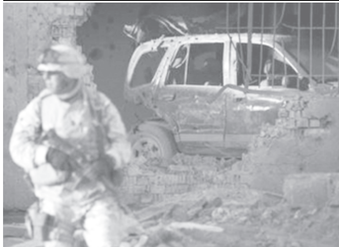
A US Marine walks past the site of a suspected car bomb factory in Karabilah, 320 kilometres (200 miles) west of Baghdad, Iraq, on 18 June, 2005.