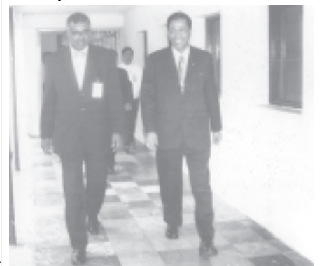
Deputy Minister for Foreign Affairs U Maung Myint being seen off at the airport.