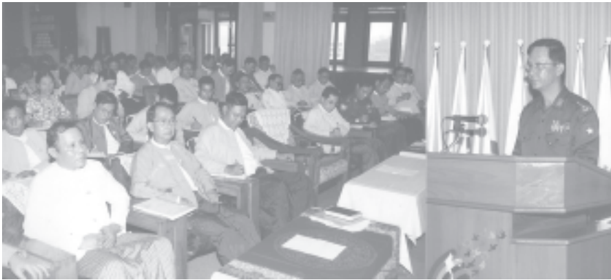
Minister Col Zaw Min made a speech at seminar on cooperatives export and import promotion.—MNA

YANGON, 20 June — Seminar on cooperatives export and import promotion began here today with the aim of earning more hard currency for the nation. Speaking at the meeting, Minister for Cooperatives Col Zaw Min said that the seminar is held for the members of cooperative societies to be skilled in their work. Cooperative syndicates should join hands with exporters and importers of the sector to extend connections with foreign organizations for exports, to find markets and to collect market information and data, he noted. The minister urged the cooperatives to export their agricultural and industrial products more to boost