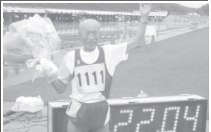
Kozo Haraguchi, a 95-year-old Japanese, waves with a bouquet of flowers after setting a world record in 100 meters track for men aged 95-99 at an athletic event in Miyazaki, southern Japan, on 19 June, 2005. Haraguchi ran in time of 22.04 seconds to break the previous world record of 24.01.