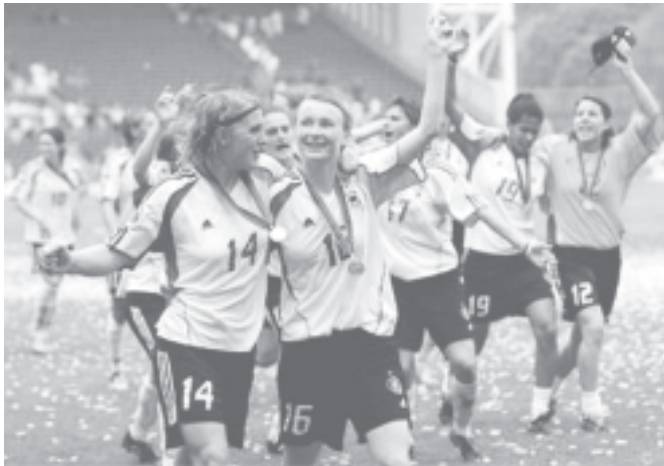
Germany's Conny Pohlers (R) and Britta Carlson (L) celebrate after defeating Norway in the Women's European Championships soccer match at Ewood Park, northern England, on 19 June, 2005. Germany won the match 3-1.