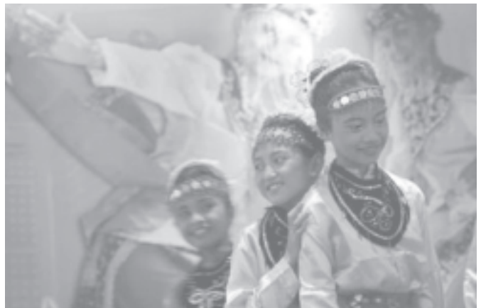
Indonesian girls prepare to perform a traditional Betawi dance as part of Jakarta's 478th anniversary celebrations at the Jakarta Fairground in Kemayoran on 19 June, 2005.